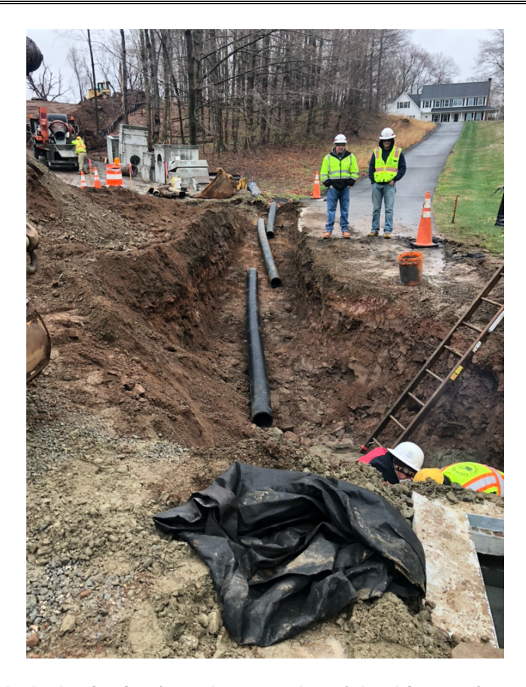
Picture 1: 8" corrugated black plastic pipe from the east edge of the driveway for 214 Talcott Ridge Drive into the catch basin located at Station 14+40 on the south side of the shared access road. Placement of 8" View to the southeast. Middletown, CT.