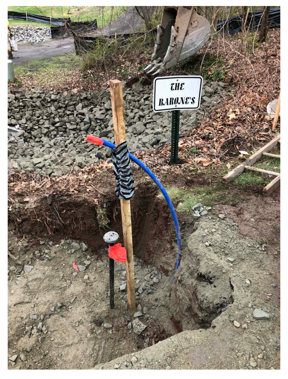
Picture 7: Valve stem associated with the curb stop installed for 224 Talcott Ridge Drive. View to the southeast. Middletown, CT.