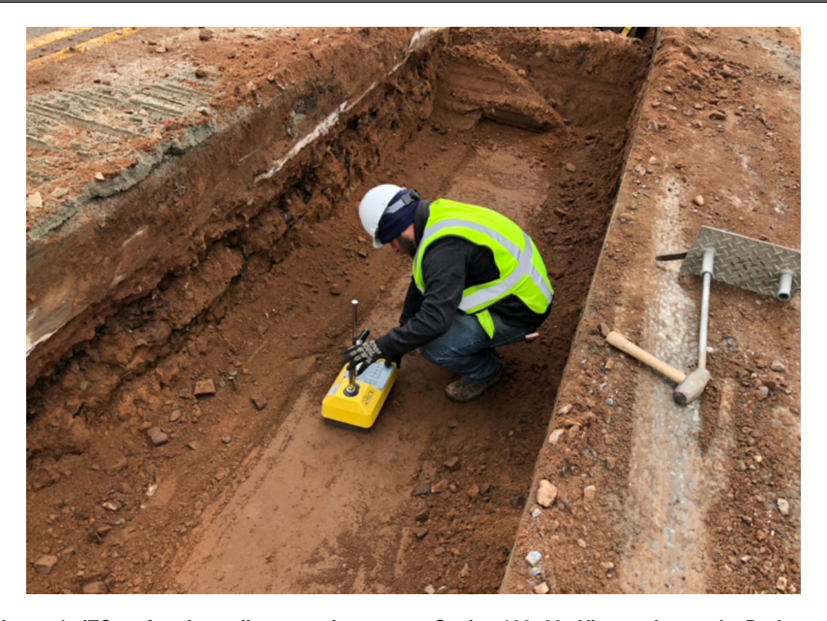
Picture 4: JTC performing soil compaction test at ~Station 168+00. View to the south. Durham, CT.