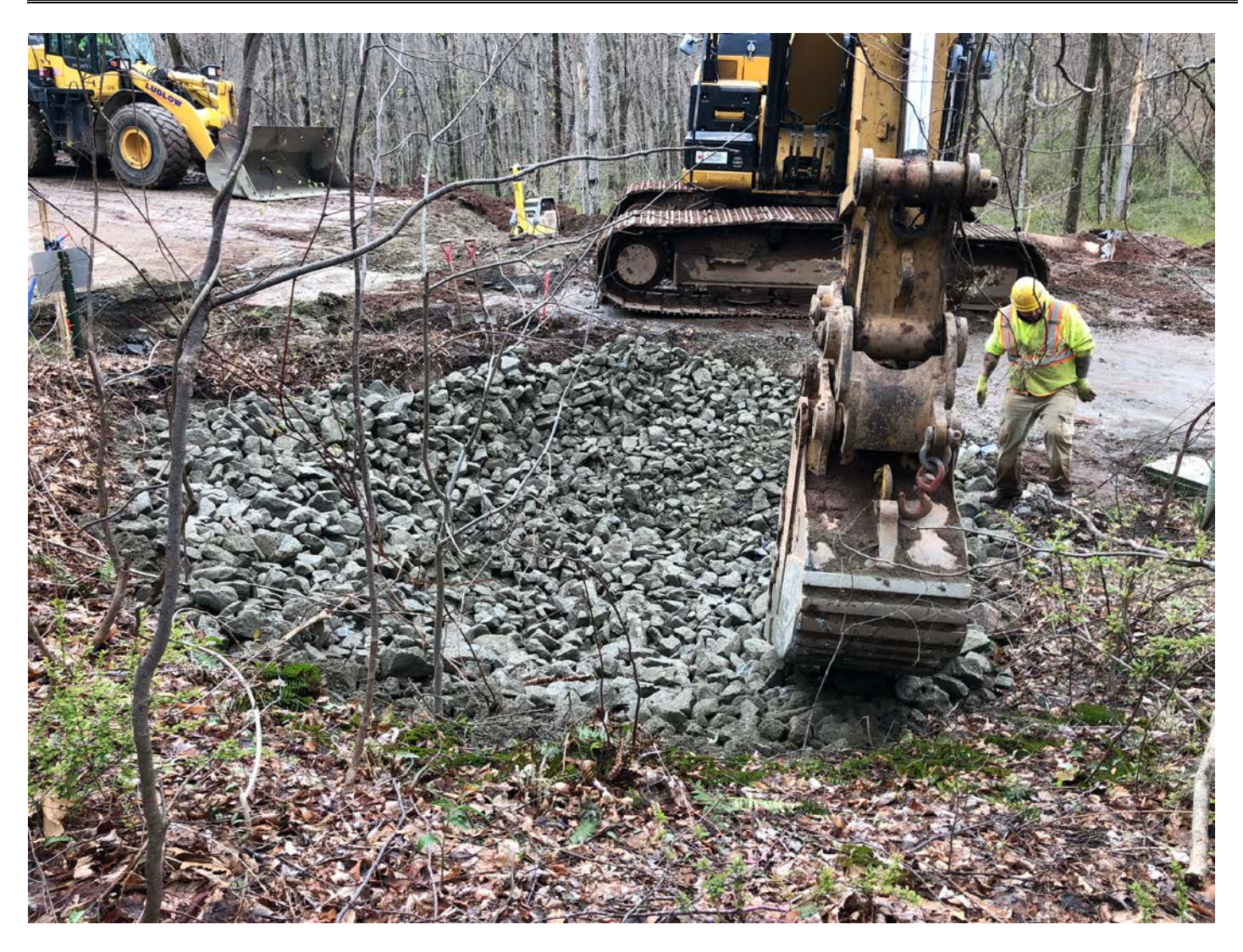
Picture 8: Ludlow placing riprap in the plunge bowl located between the driveways for 224 and 216 Talcott Ridge Drive. View to the north. Middletown, CT.