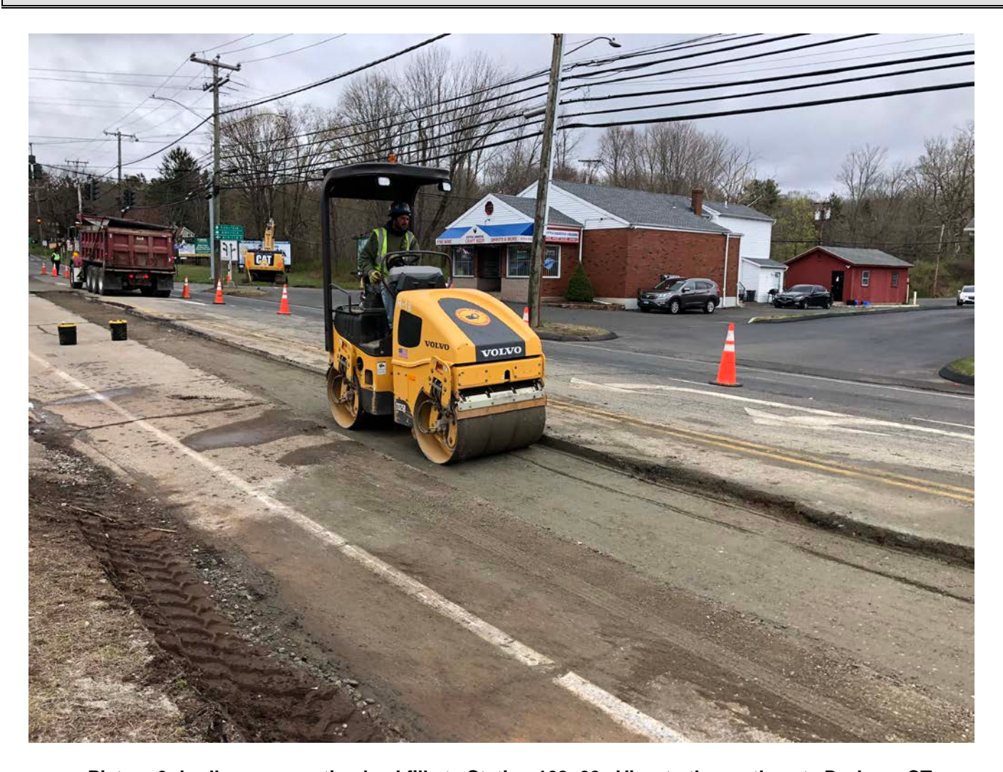
Picture 9: Ludlow compacting backfill at ~Station 168+00. View to the northeast. Durham, CT.