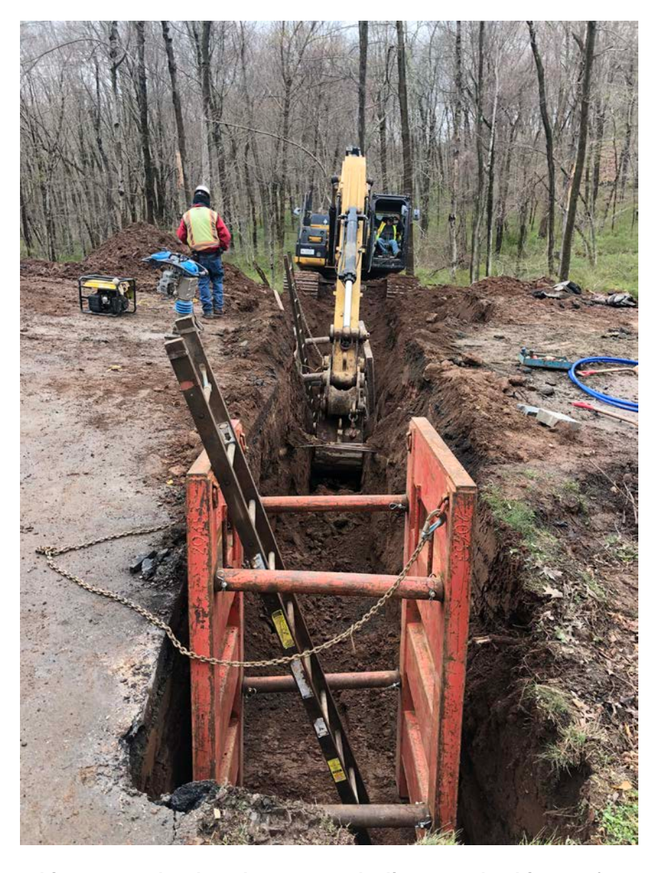
Picture 6: Ludlow trenching across the shared access road adjacent to the driveway for 224 Talcott Ridge Drive in order to tap the 20" water line to add a corporation stop. View to the north. Middletown, CT.