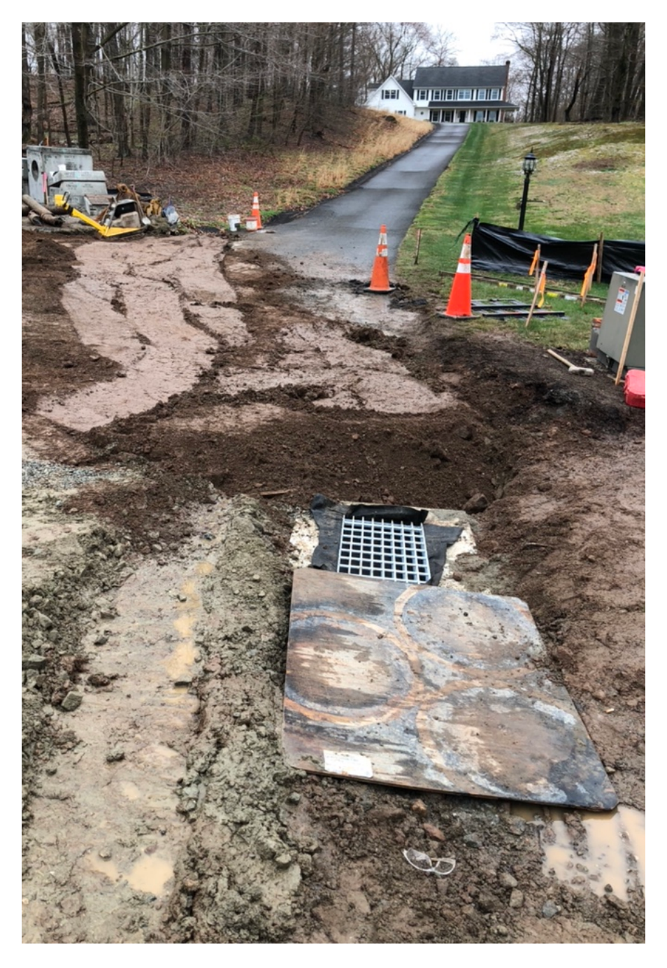
Picture 3: Trench closed up after installation of 8" corrugated black plastic pipe from the east edge of the driveway for 214 Talcott Ridge Drive into the catch basin located at Station 14+40. View to the southeast. Middletown, CT.