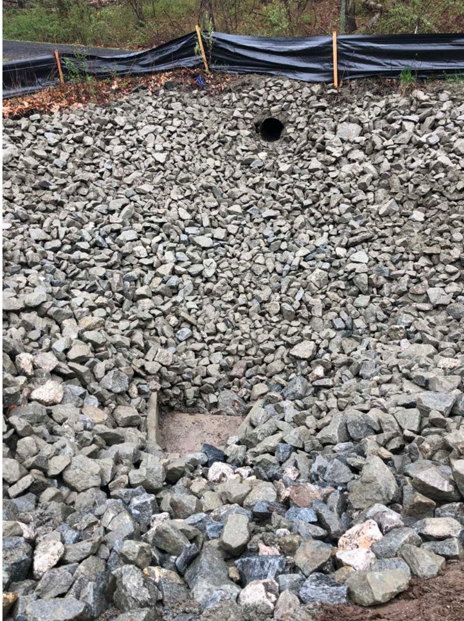
Picture 7: Inlet to the plunge bowl located on the south side of the shared access road, between the driveways for 214 and 216 Talcott Ridge Drive. View to the south. Middletown, CT.