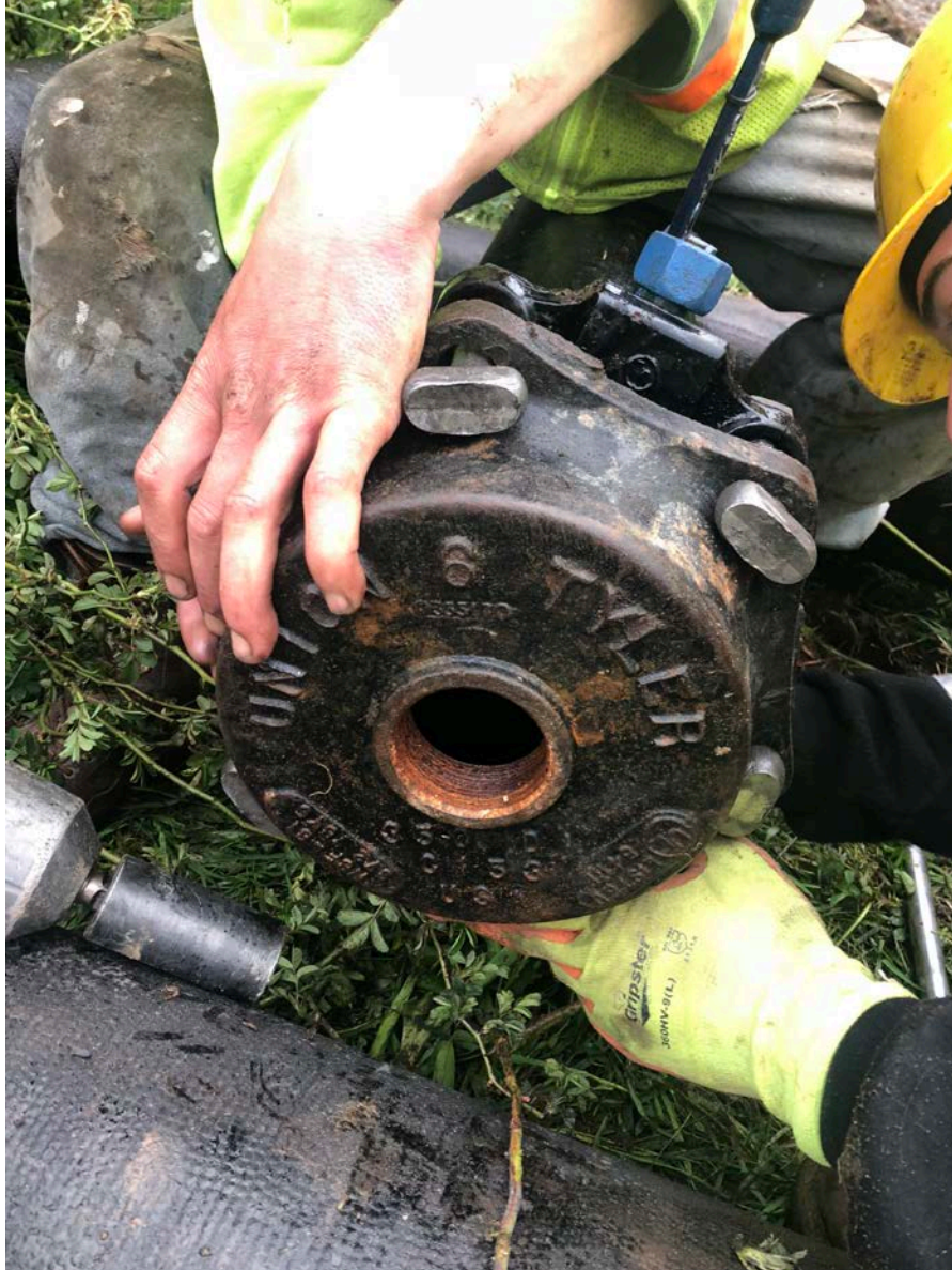
Picture 5: Cap placed on end of 6" DIP with port for connection to 1" copper service line (which was subsequently attached and installed). Durham, CT.