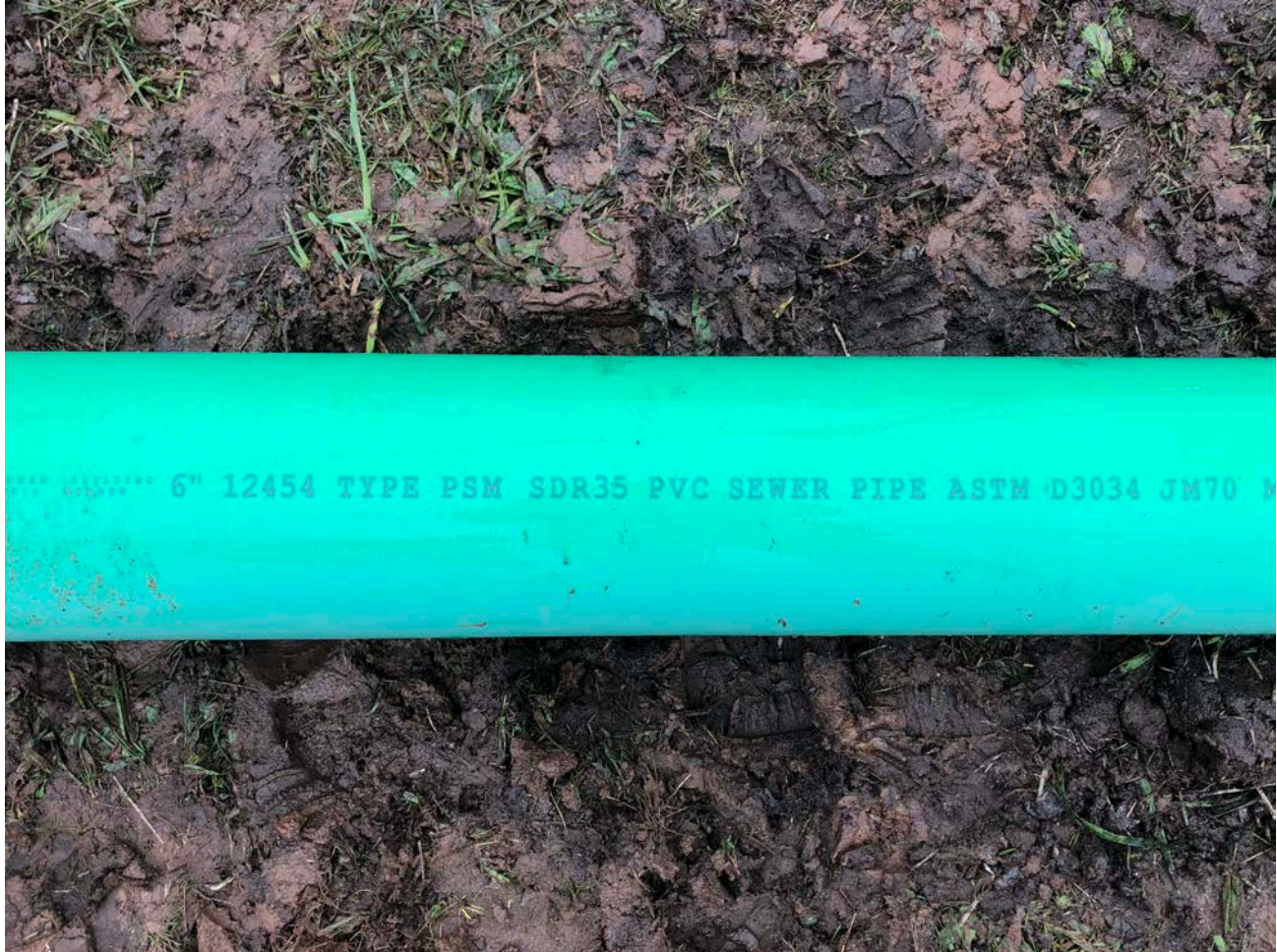
Picture 9: PVC used to repair break in clay pipe at ~Station 159+30. Durham, CT.