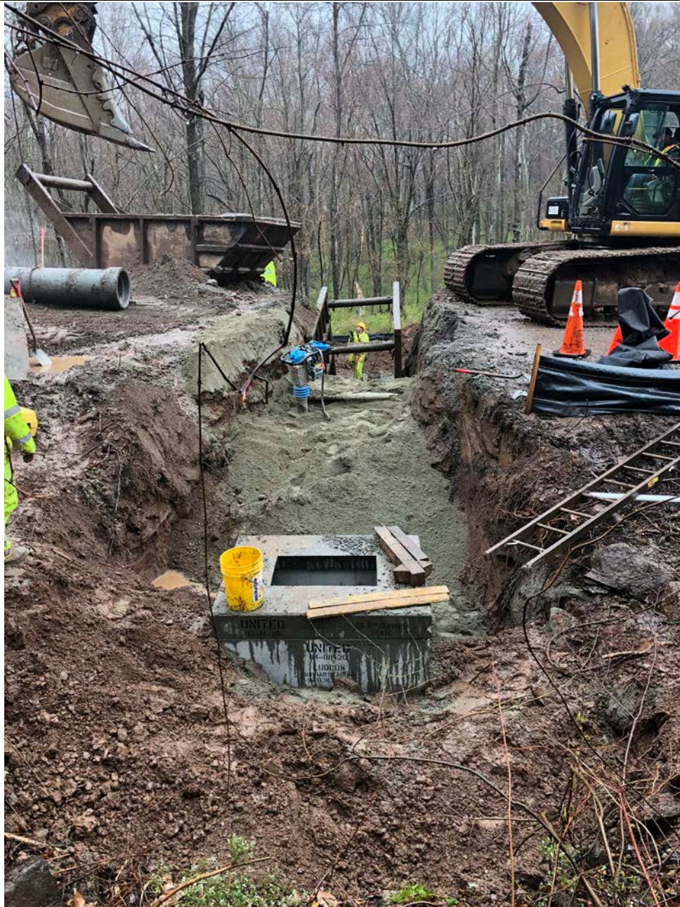
Picture 13: Ludlow covering placed 15" RCP with sand. Partially installed Type CL catch basin in the foreground. View to the north. Middletown, CT.