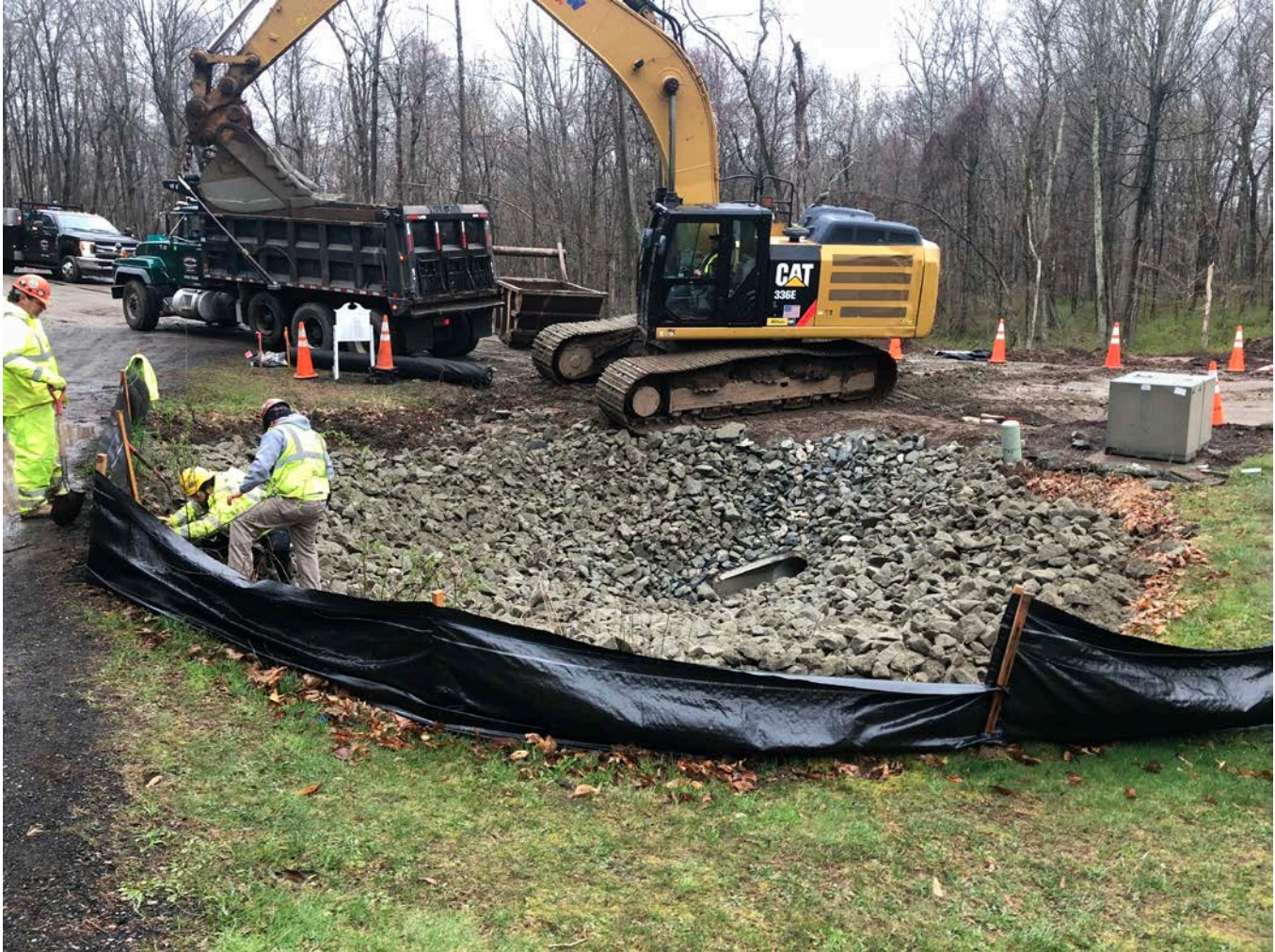
Picture 2: Ludlow just about finished placing riprap in the plunge bowl located at ~Station 14+40 (between the driveways of 214 and 216 Talcott Ridge Drive). View to the north. Middletown, CT.