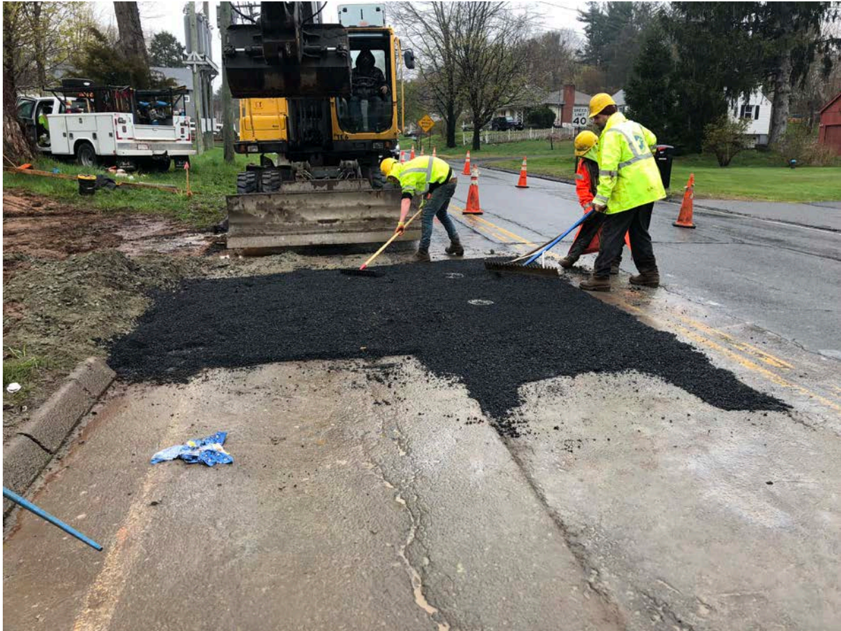
Picture 12: Hot patch being placed at Station 159+25. View to the north. Durham, CT.