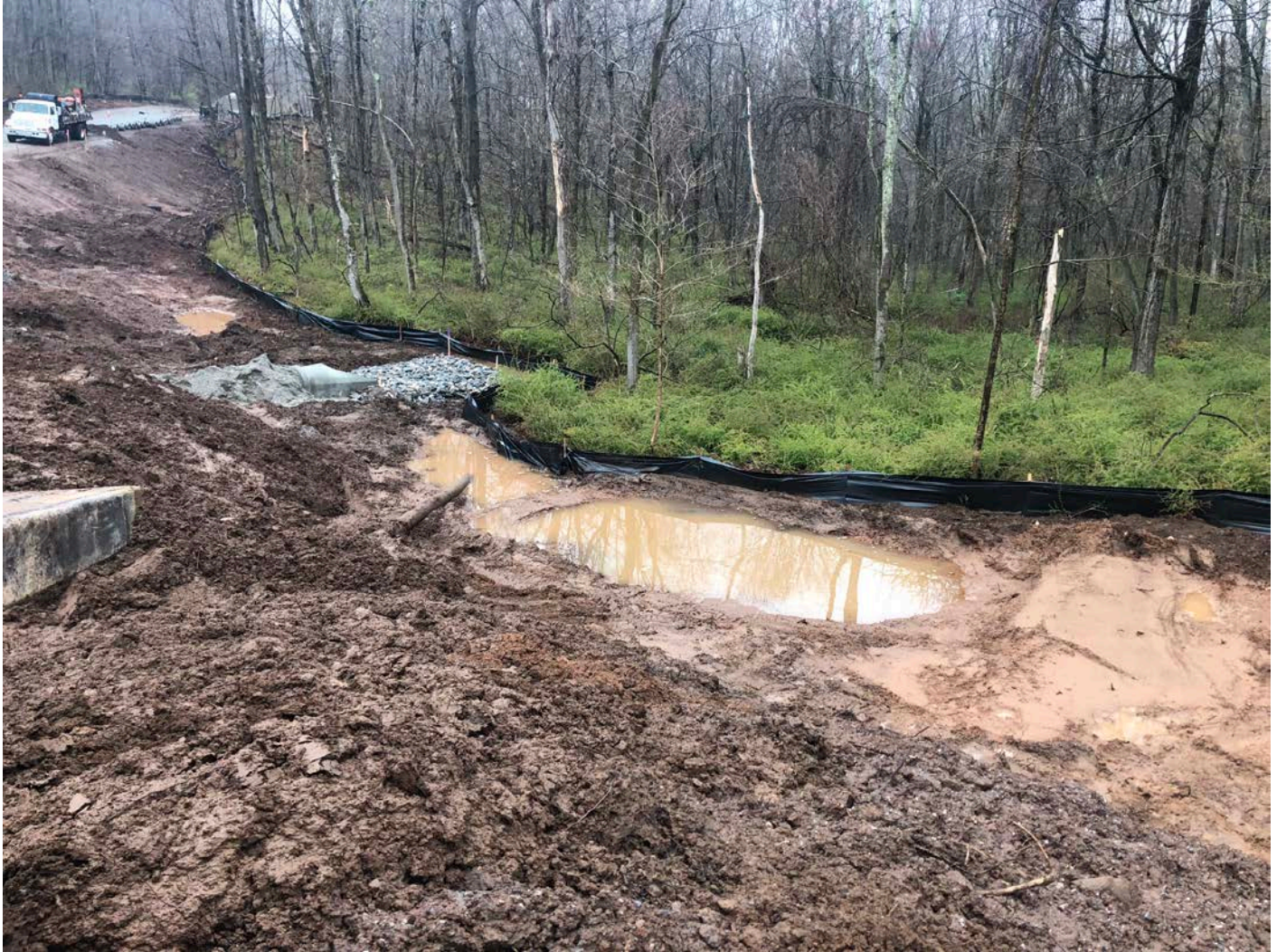
Picture 3: Water accumulated due north of the culvert located north of the Type C catch basin located at Station 14+40. View to the northwest. Middletown, CT.