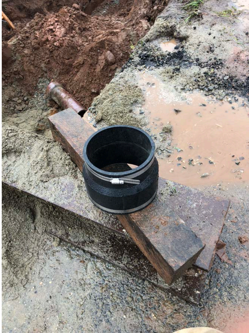
Picture 8: One of two Fernco boots used to repair break in clay pipe at ~Station 159+30. Durham, CT.