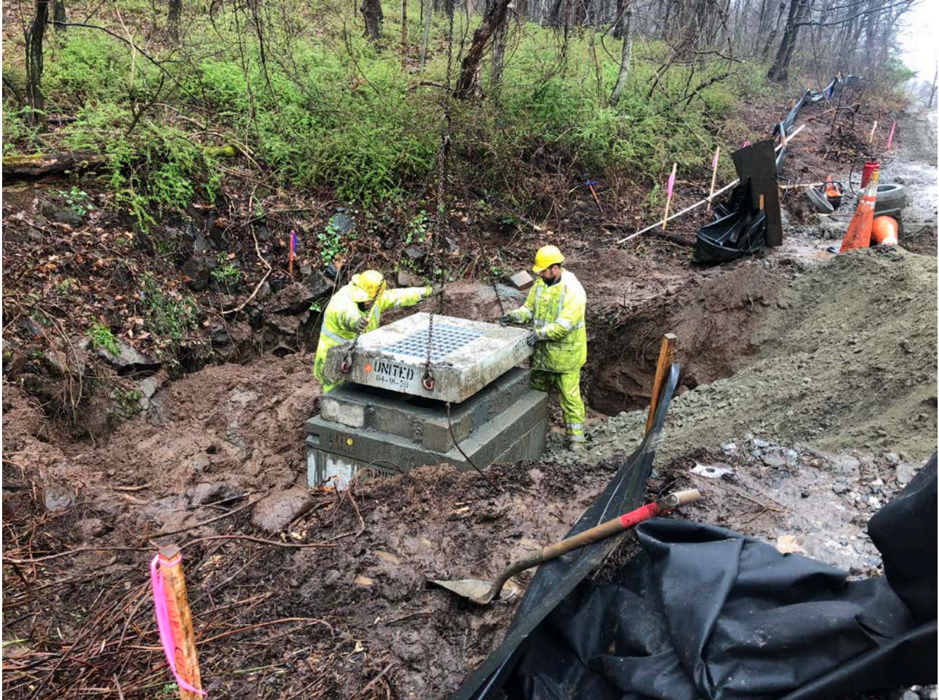
Picture 14: Ludlow finishing installation of Type CL catch basin at ~Station 15+90. View to the southwest. Middletown, CT.