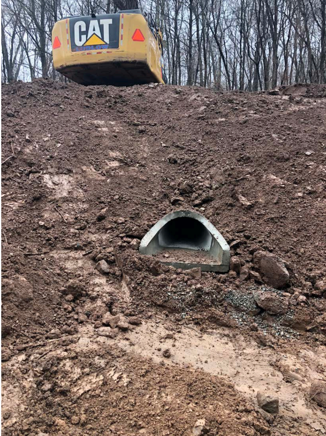
Picture 15: Flared end of newly installed 15" RCP at Station 15+90. View to the south. Middletown, CT.