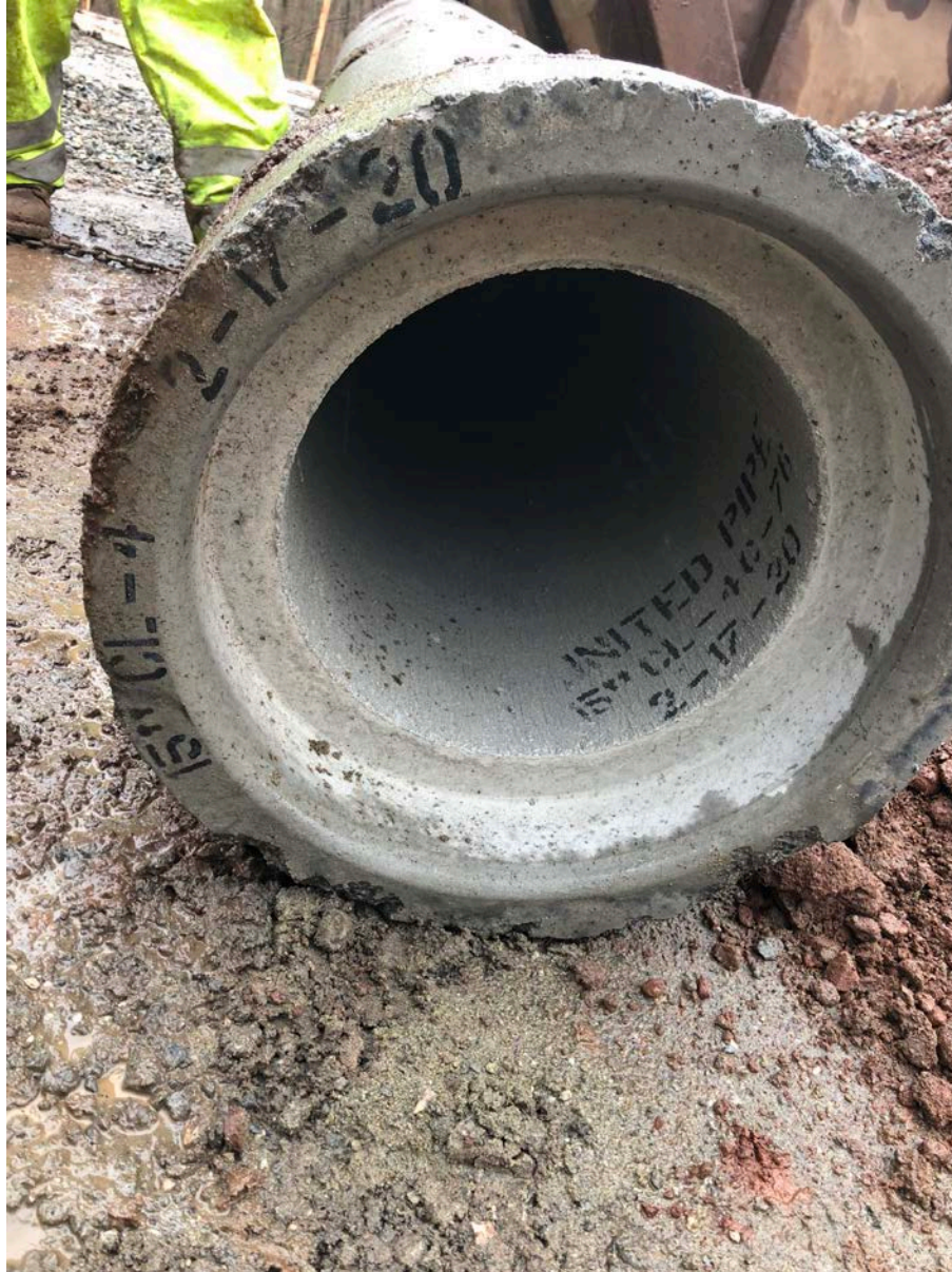
Picture 11: 15" RCP that was placed across the shared access road at ~Station 15+90 (just west of the Type CL catch basin Ludlow installed earlier today). Middletown, CT.