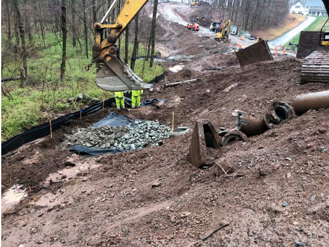
Picture 16: Ludlow placing riprap to the north of 15" RCP installed today. View to the east. Middletown, CT.