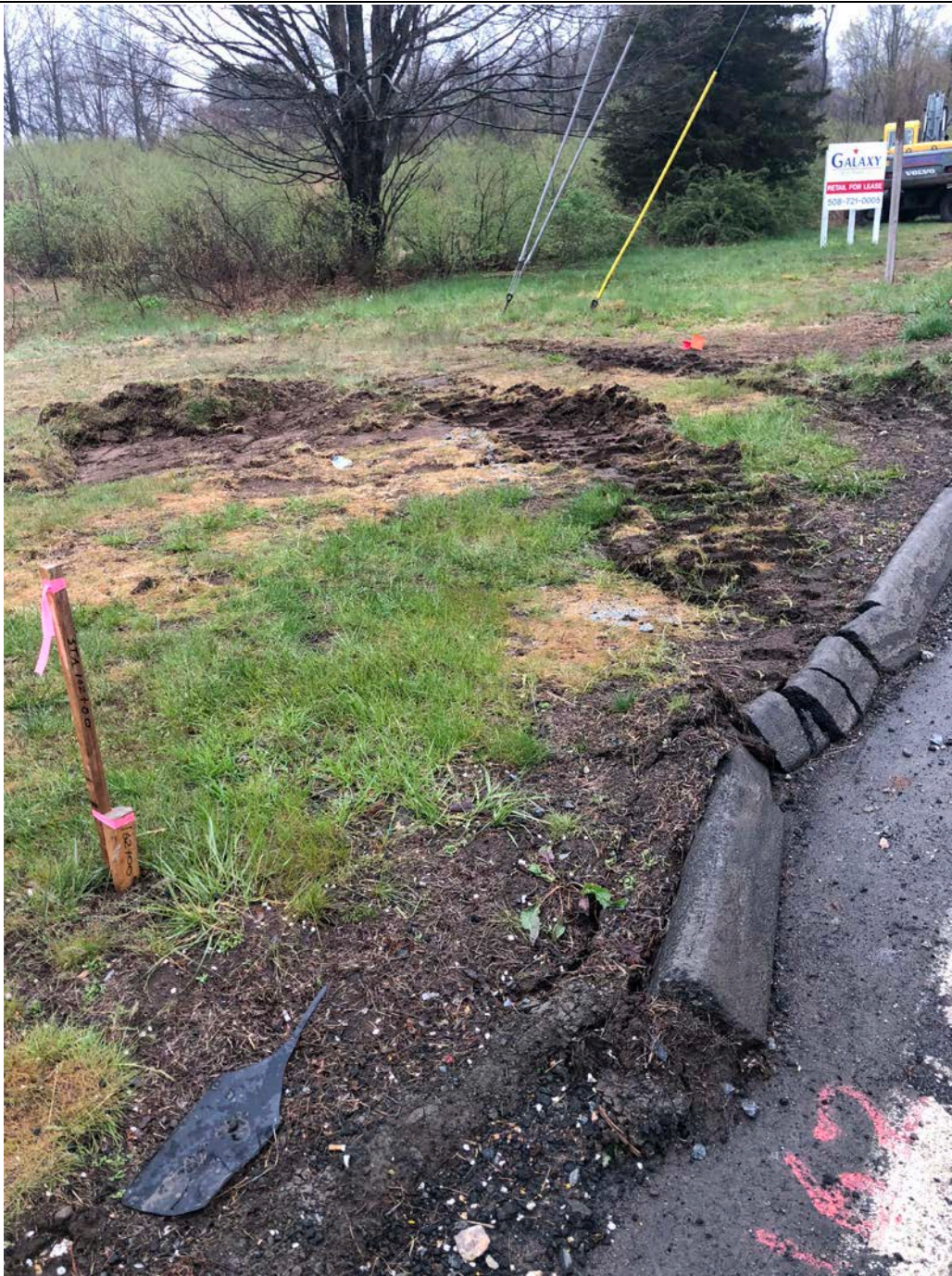
Picture 1: Damage to curbing on the west side of Main Street, just south of Station 159+30. View to the northwest. Durham, CT.