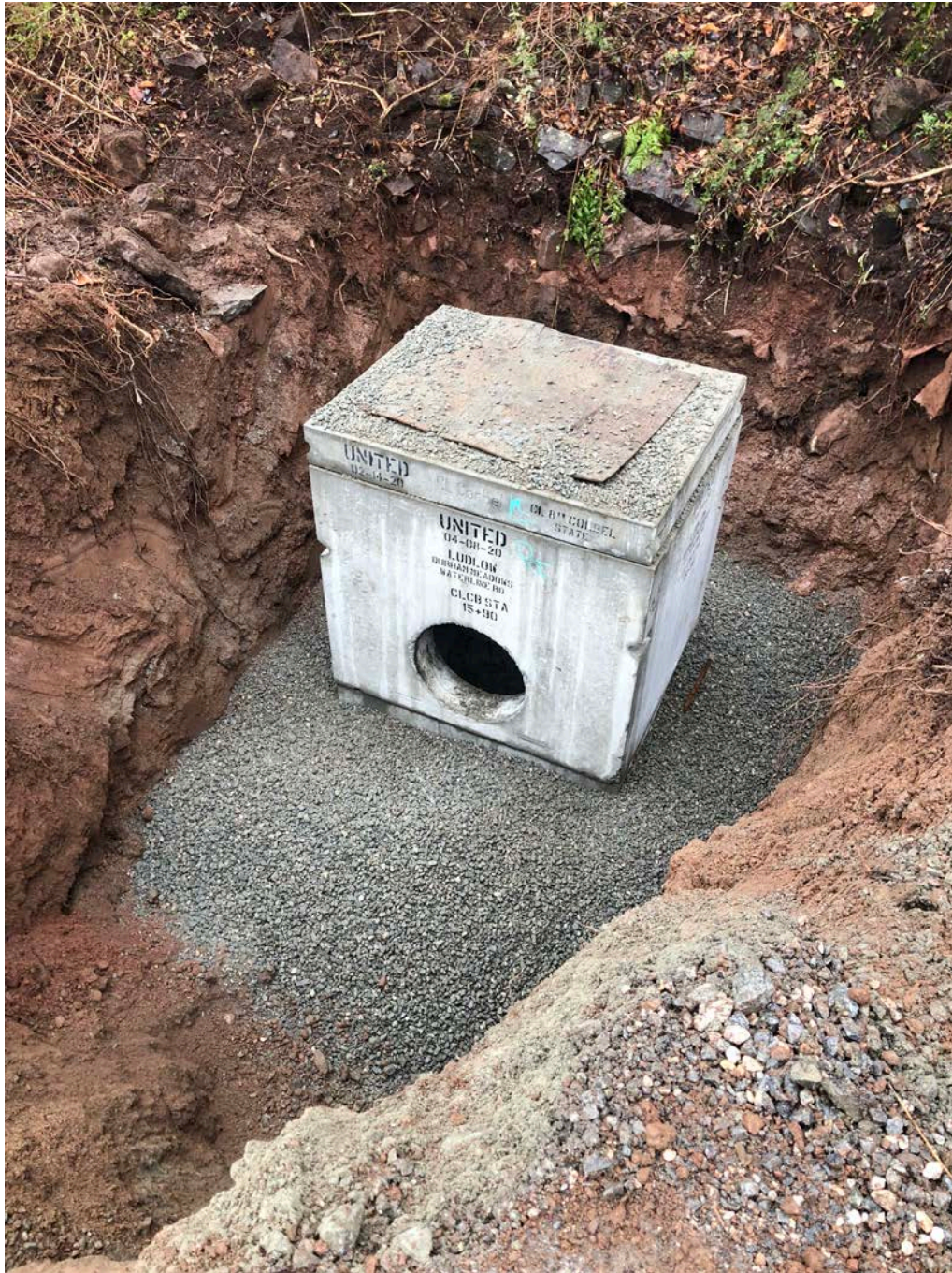
Picture 6: Type CL catch basin placed on the south side of the shared access road. \frac{3}{4} " gravel has been placed around the catch basin. View to the southeast. Middletown, CT.