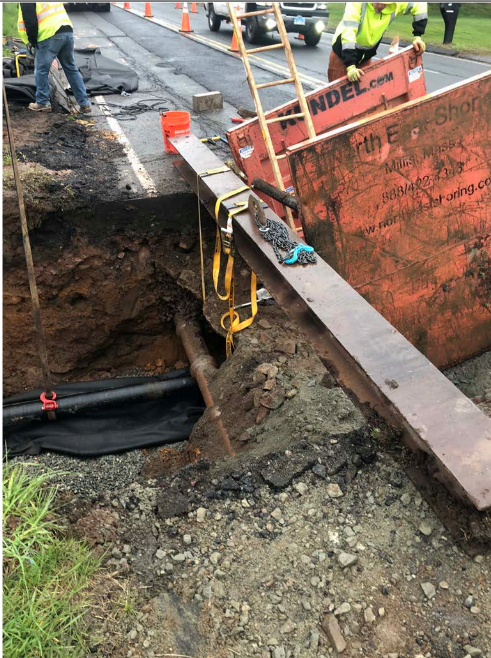
Picture 4: 6" DIP being placed at Station 159+25 beneath an existing 6" clay drain pipe. Note the concrete that overlies the clay pipe being supported with web strapping attached to an I-beam. View to the northeast. Durham, CT.