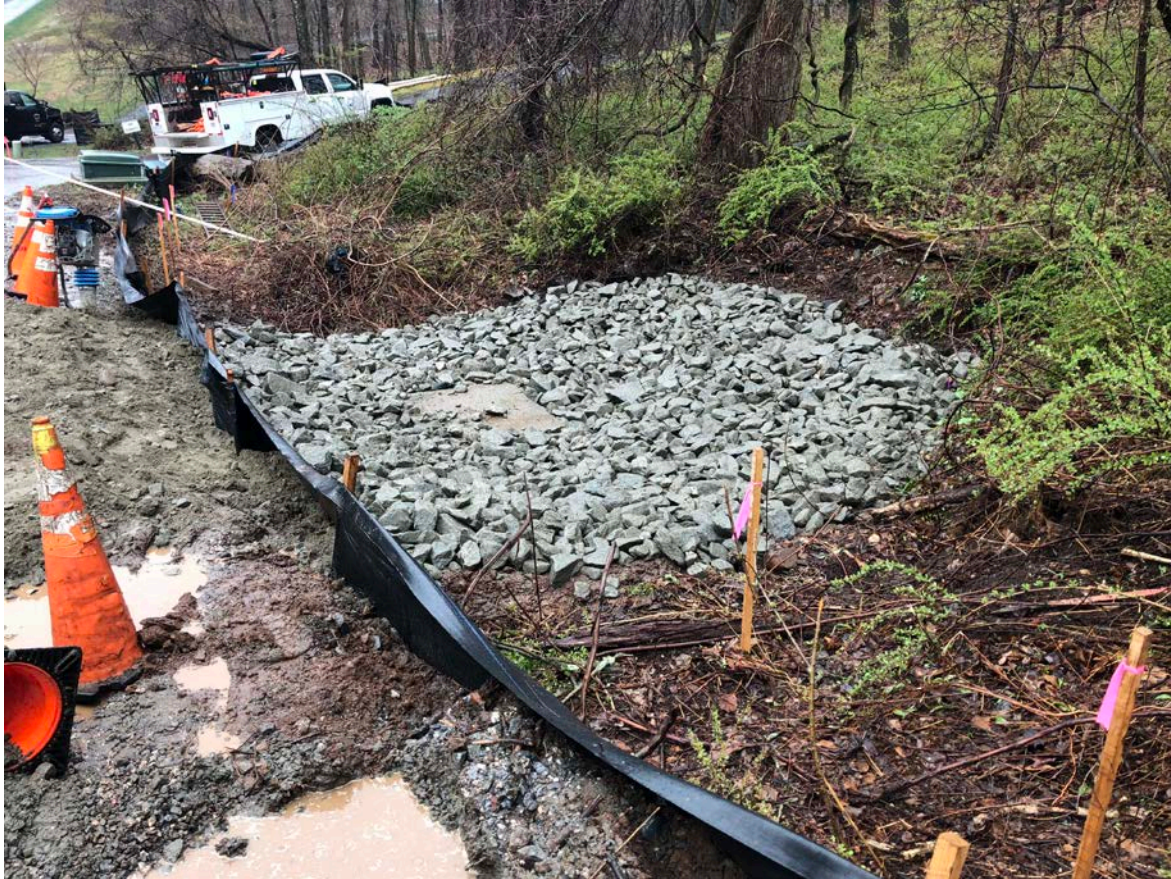
Picture 17: Riprap placed around Type CL catch basin that was installed today. View to the east. Middletown, CT.