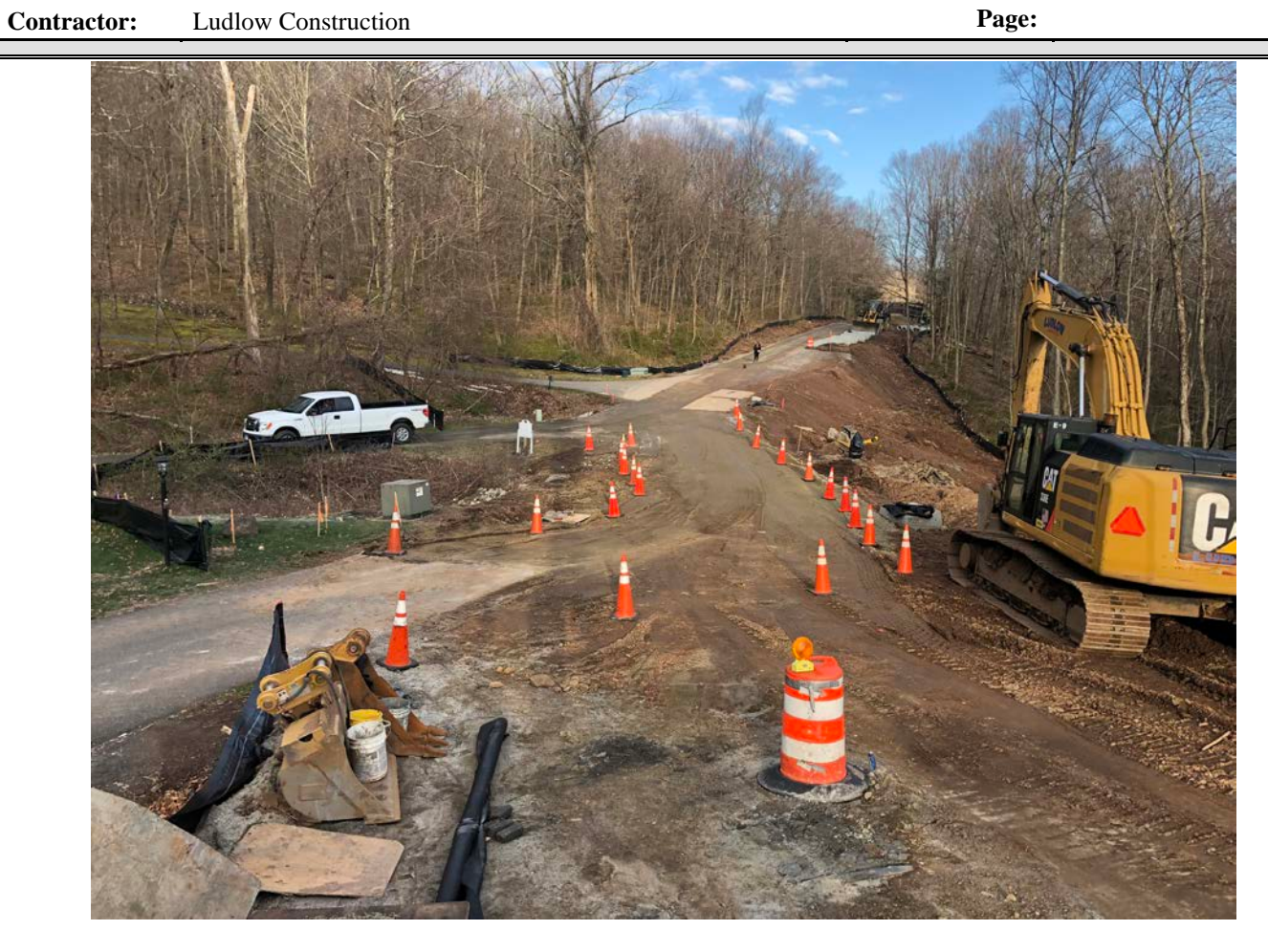
Picture 1: Overview of Station 14+40 work area after yesterday's construction activities. View to the west.