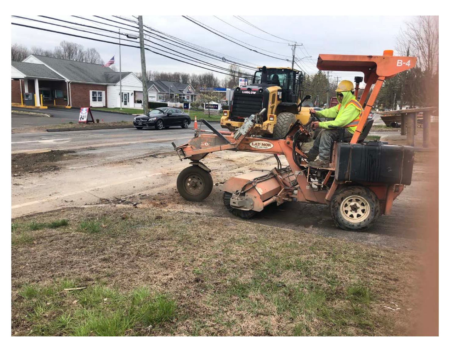
Picture 7: Ludlow sweeping up after construction activities has finished. View to the southeast.