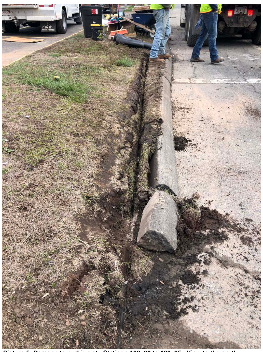
Picture 5: Damage to curbing at ~Stations 166+20 to 166+35. View to the north.

Project #:AECOM: 6061487Report No:64Contractor:Ludlow ConstructionPage:8 of 11