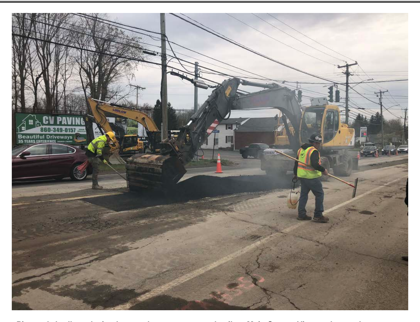
Picture 8: Ludlow placing hot patch over compacted soil on Main Street. View to the southeast.