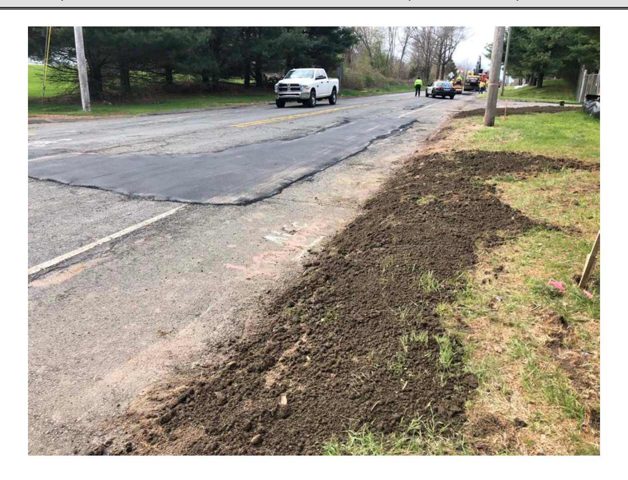
Picture 4: Newly placed loan and shim coating of asphalt on South Main Street, just south of the intersection with Talcott Ridge Drive. View to the south.

Project #:AECOM: 6061487Report No:64Contractor:Ludlow ConstructionPage:7 of 11