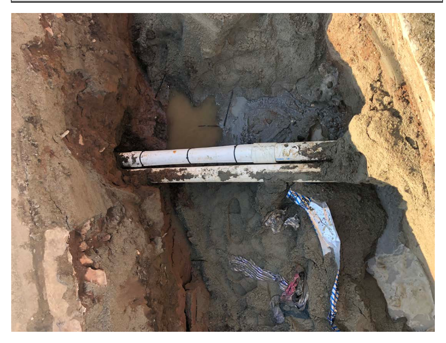
Picture 2: Communications cable conduit repaired by Ludlow at Station 165+78.