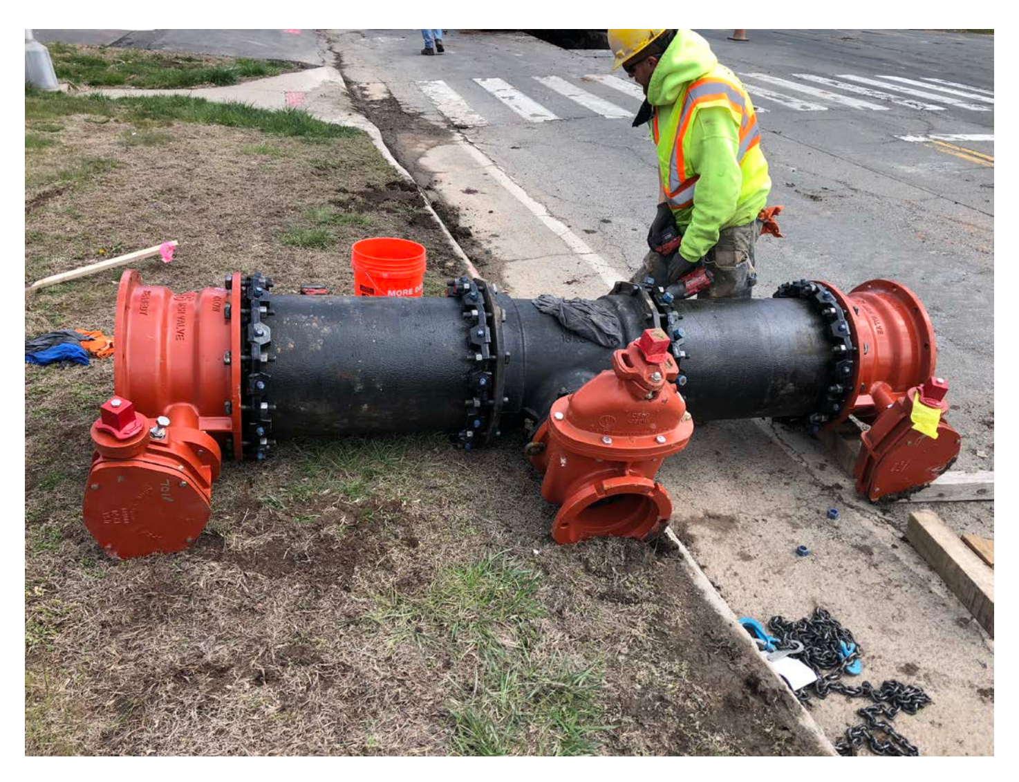
Picture 6: 16"x16"x8" M.J. C.L.D.I. Tee with two 16" butterfly valves and one 8" gate valve and a valve box that was placed at Station 166+32 (Haddam Quarter Road intersection).

Res. Representative: J. Meunier Date: 4/23/20