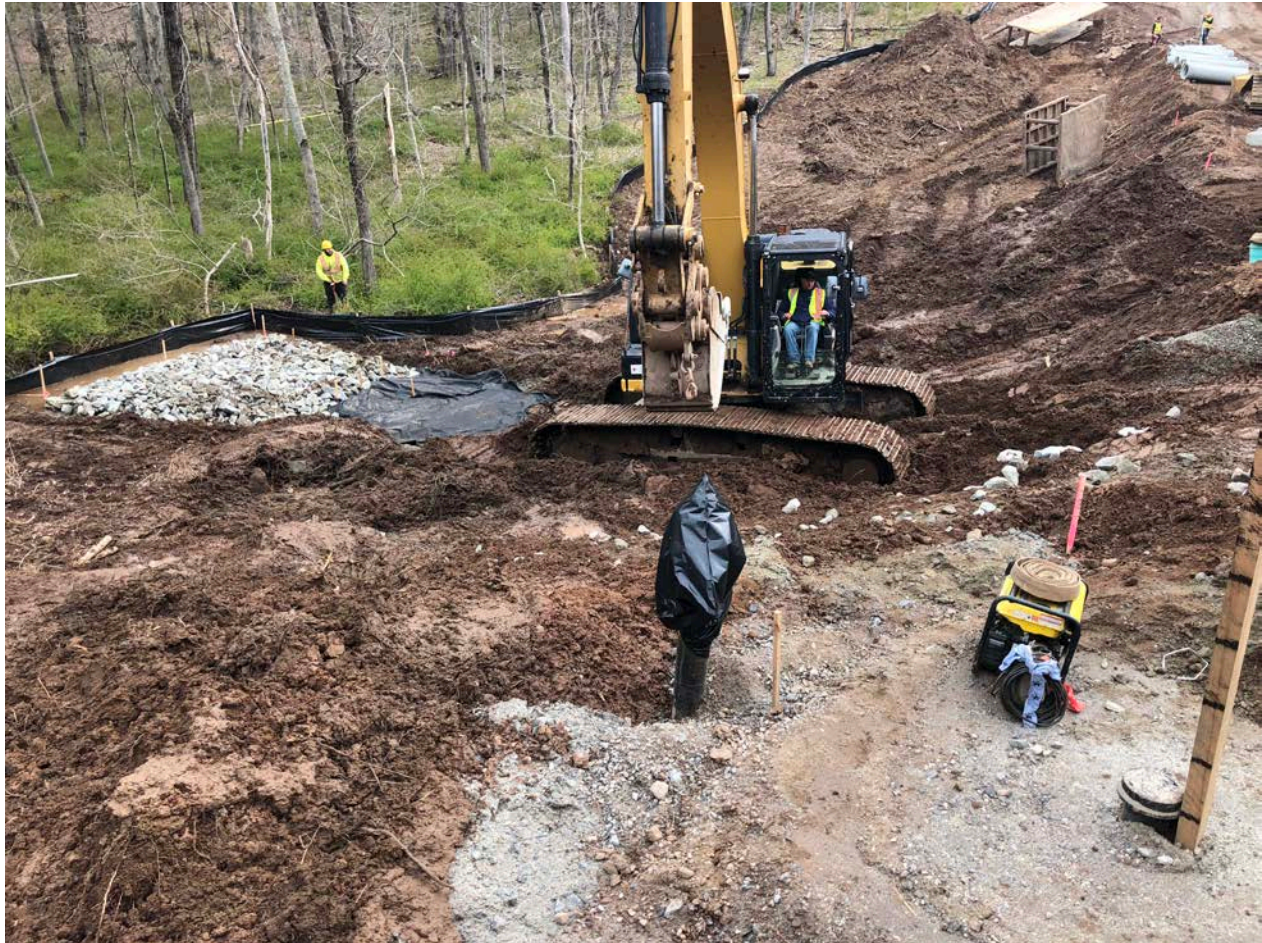
Picture 4: Ludlow preparing the outflow area to the storm drain culvert associated with the catch basin that will be installed at Station 14+40. View to the east.