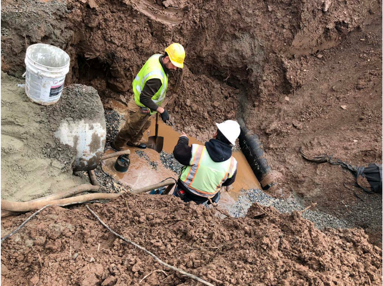
Picture 9: Ludlow working at excavation area that will receive the Type C catch basin that will be installed at Station 14+40. Two pumps are moving water out of excavation and discharging it to the east at the newly installed culvert outfall.