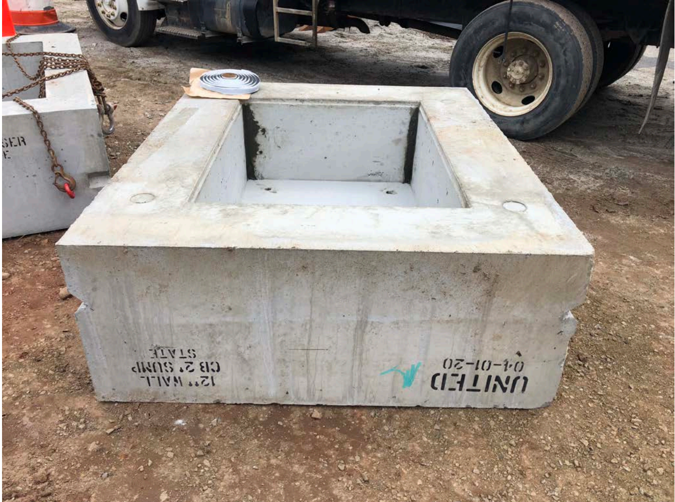
Picture 10: Sump of the Type C catch basin that will be installed at Station 14+40.