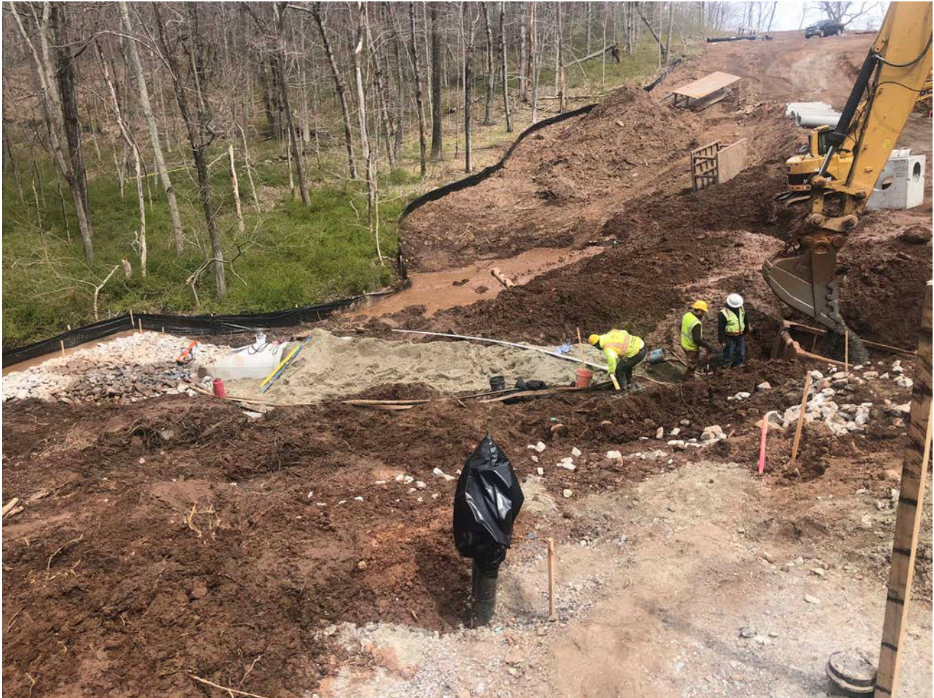
Picture 13: Overview of culvert and Type C catch basin installation at Station 14+40. View to the east.