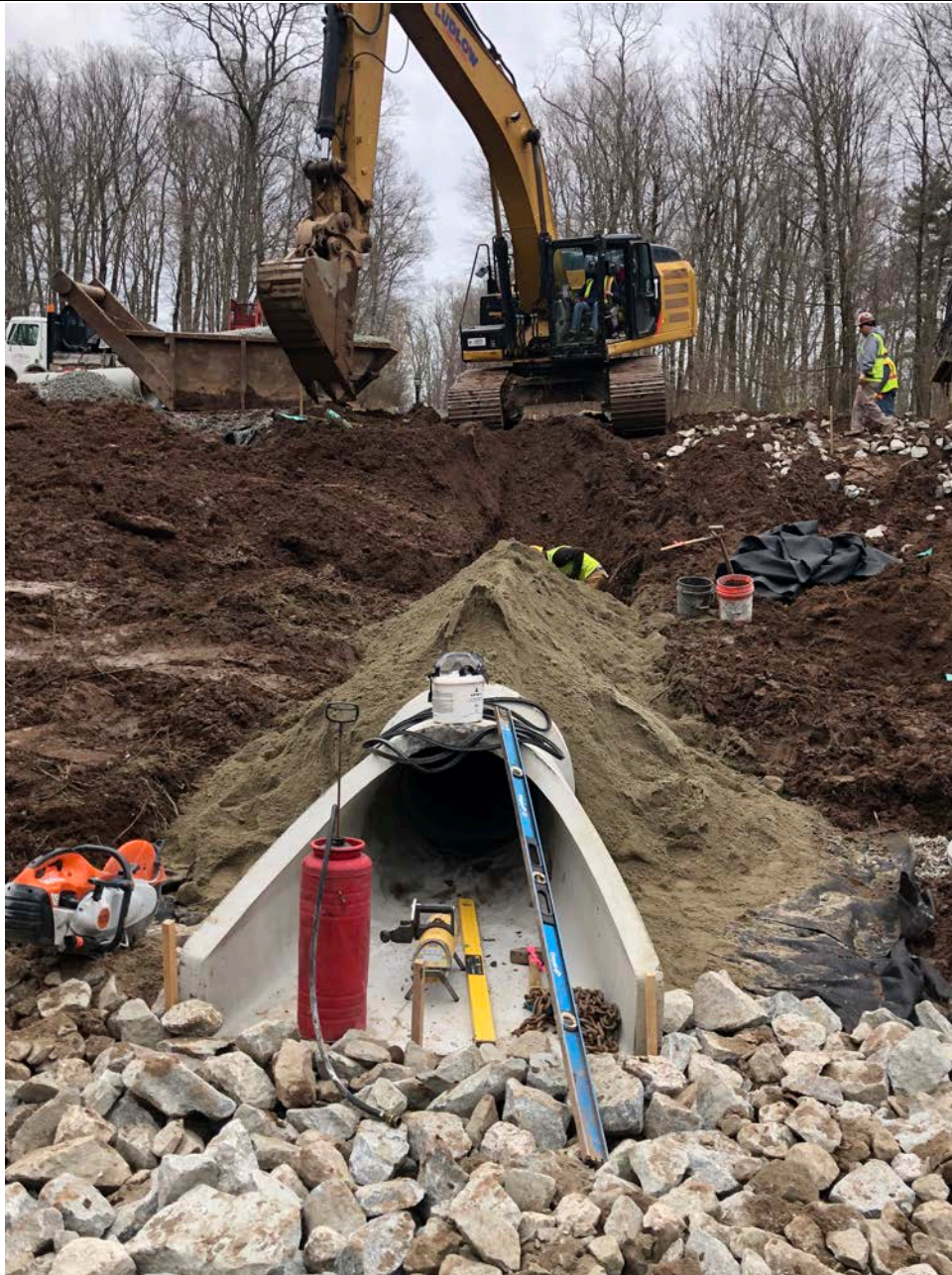
Picture 8: Culvert placed just east of Station 14+40. View to the south.