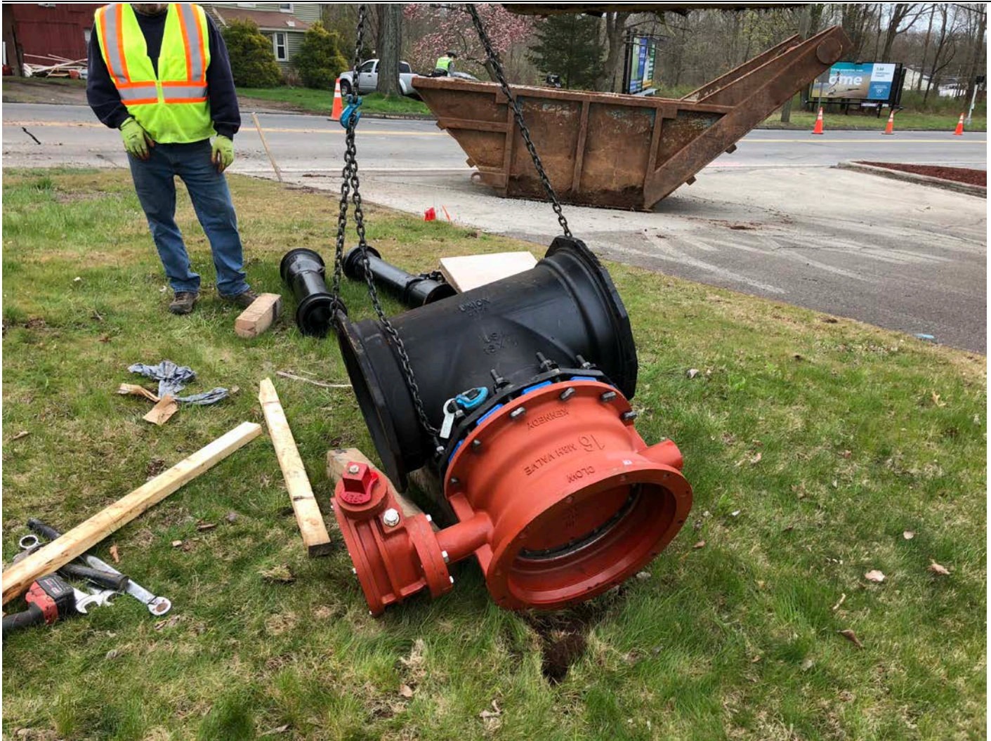
Picture 1: 16"x16"x16" Tee and butterfly assembly that was placed at Station 161+60.