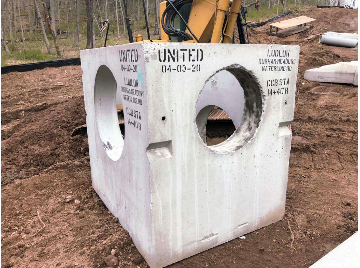
Picture 12: Type C catch basin that will be installed at Station 14+40.