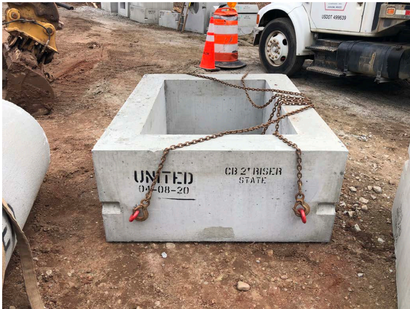
Picture 11: Riser of the Type C catch basin that will be installed at Station 14+40.