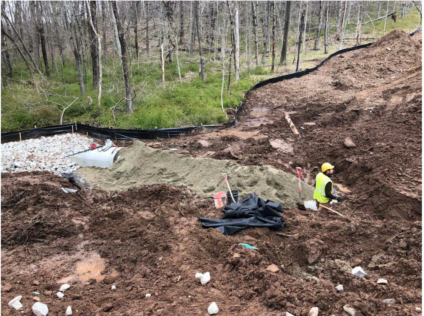
Picture 7: Ludlow continues to work at the outflow area to the storm drain culvert associated with the catch basin that will be installed at Station 14+40. View to the northeast.