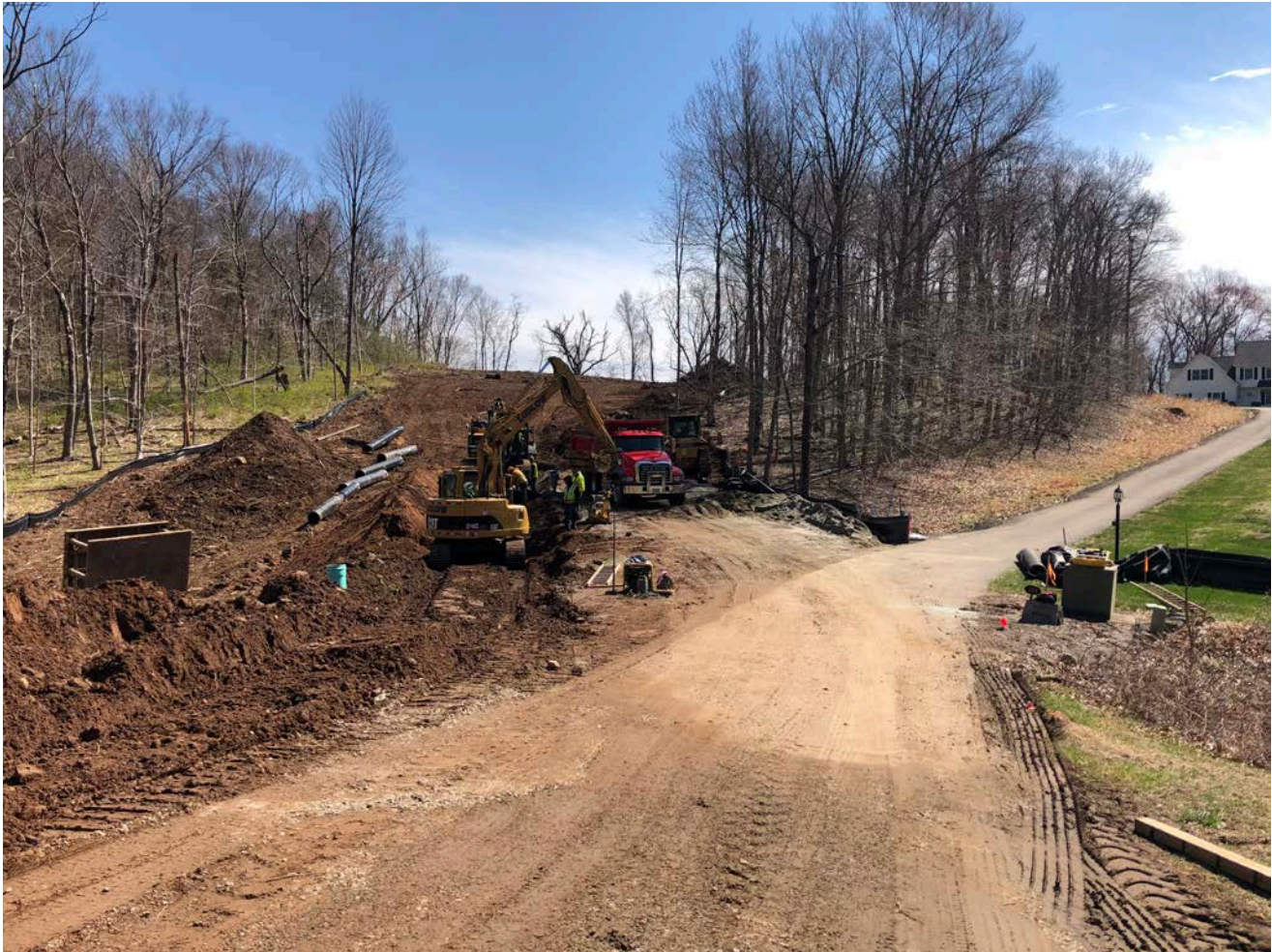
Picture 3: Ludlow placing 20" DIP at the tank access road. View to the east.