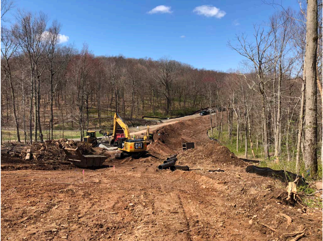
Picture 4: Ludlow placing 20" DIP at the tank access road. View to the northwest.