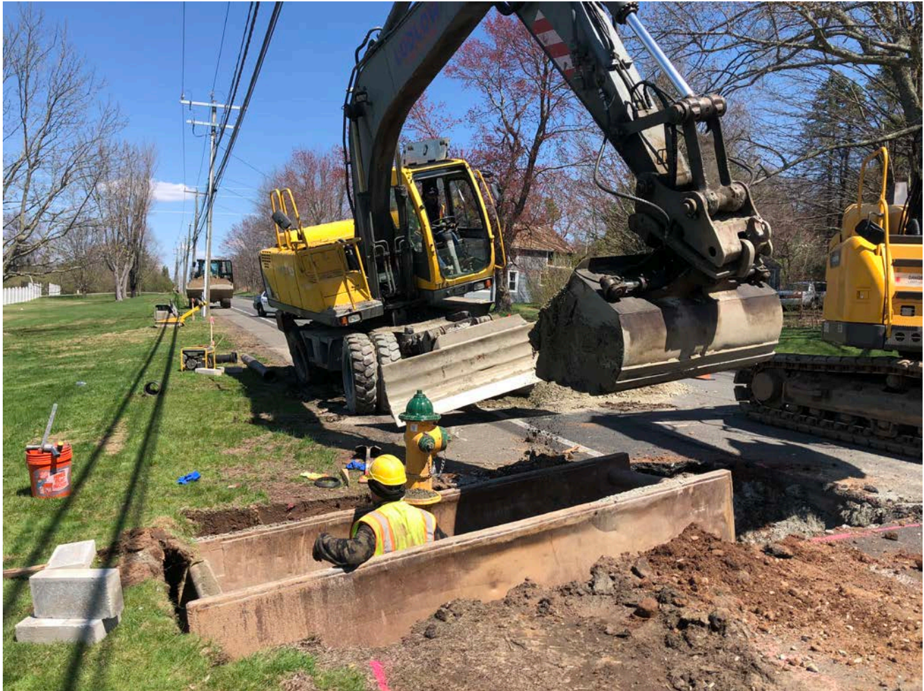
Picture 7: Hydrant assembly being placed at Station 118+98. View to the north.