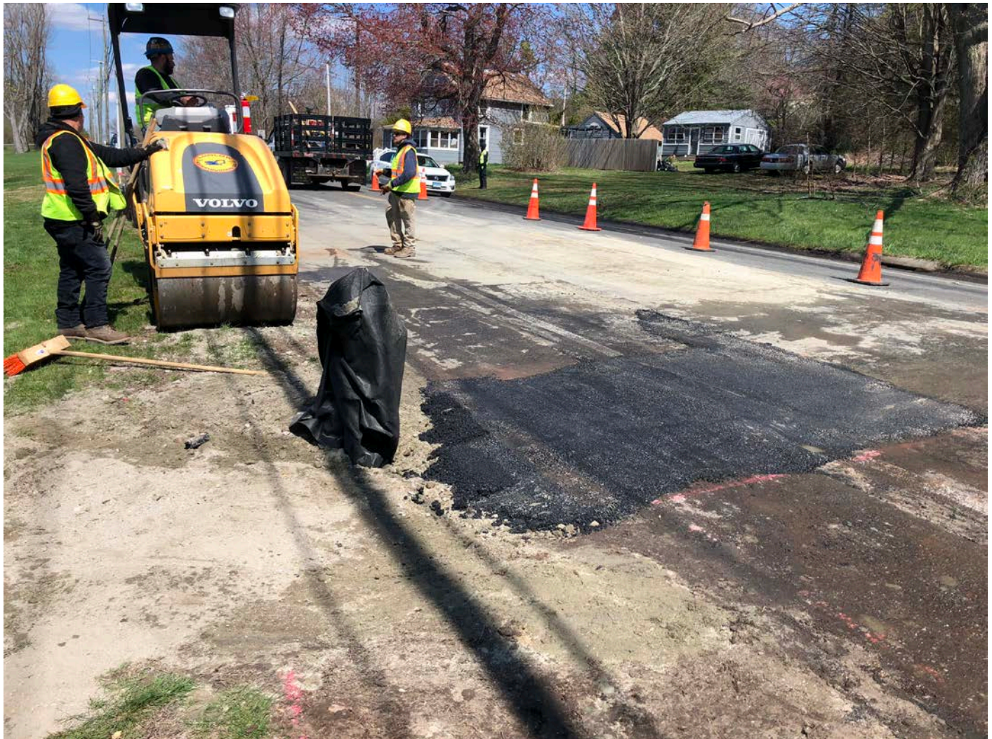
Picture 8: Ludlow placing hot patch at Station 118+98. View to the northeast.