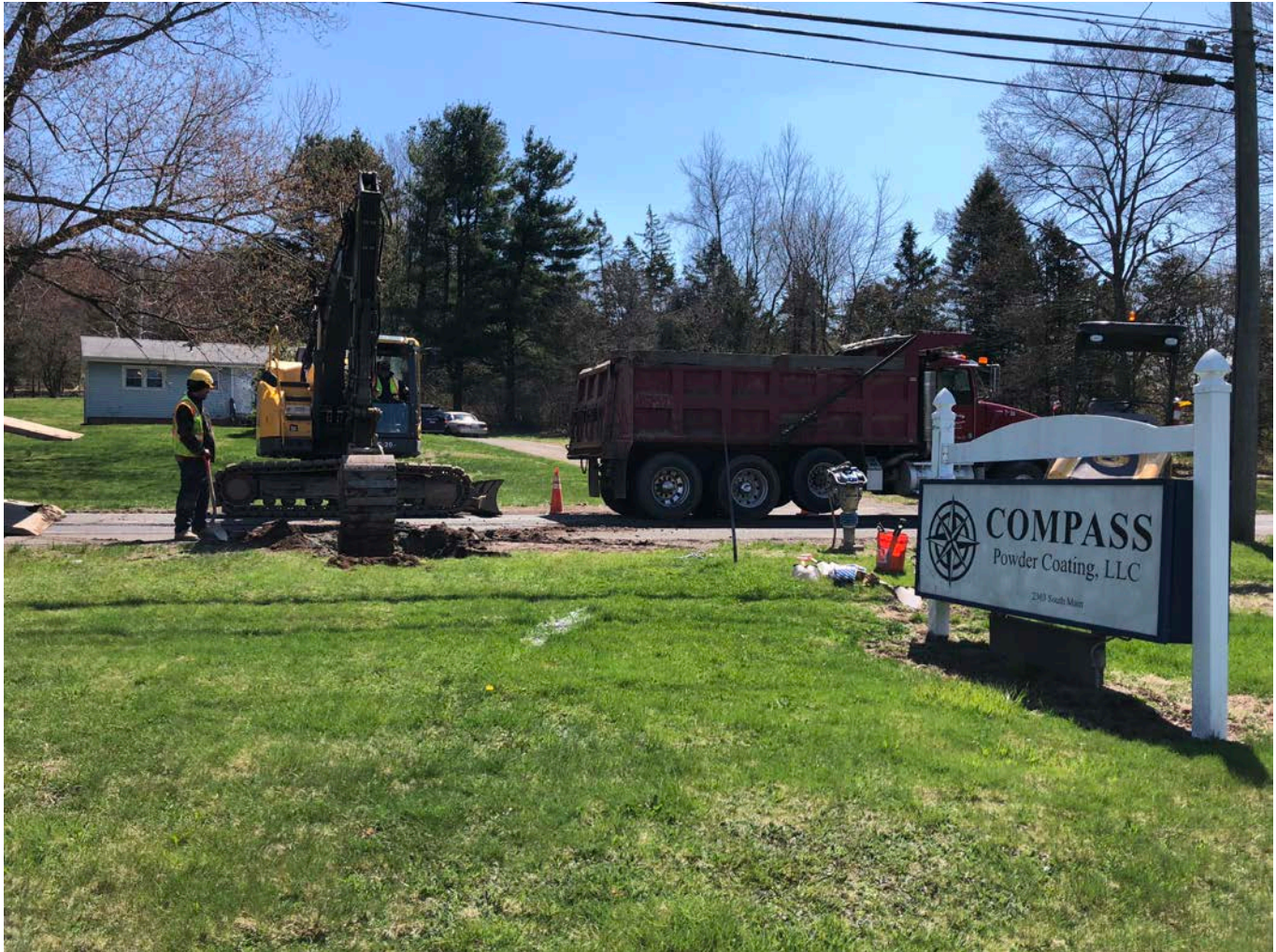
Picture 6: Ludlow excavating at Station 118+98 in preparation to install hydrant assembly.