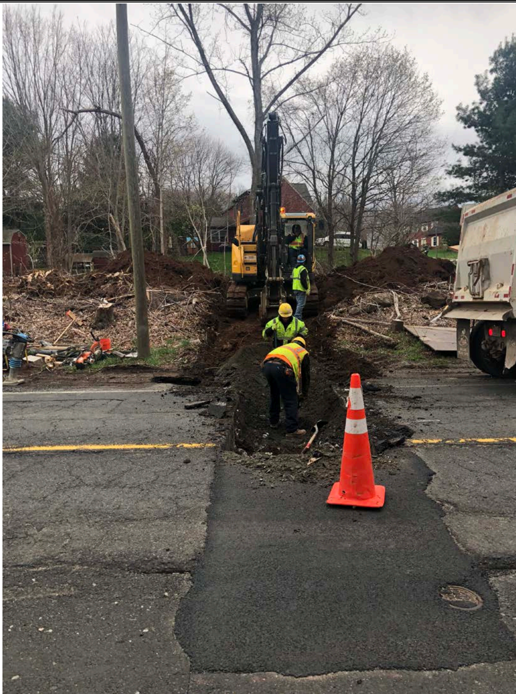
Picture 1: Ludlow beginning to excavate at Station 124+71. View to the east.