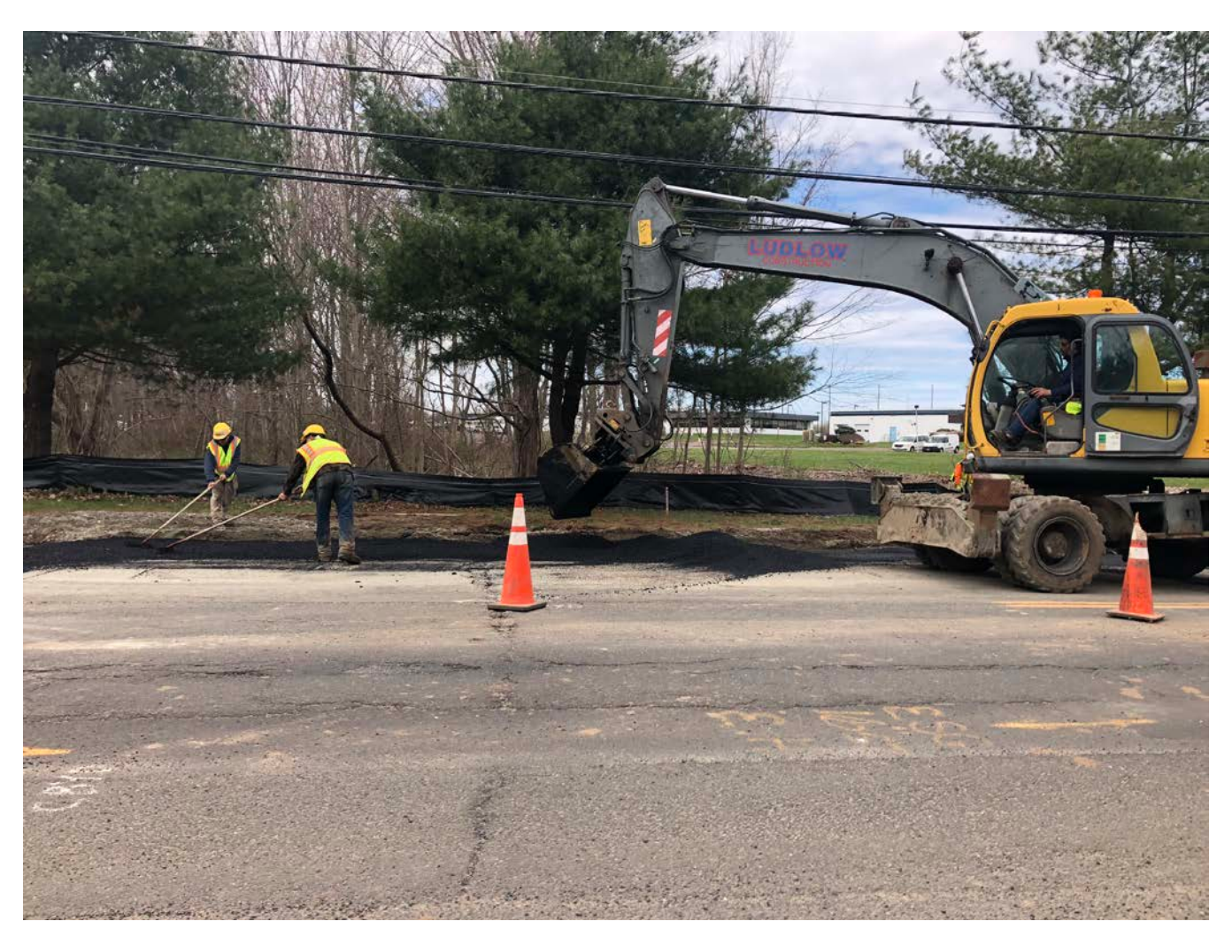
Picture 11: Ludlow hot patch between from Station 751+55 to Station 750+59. View to the west.

Project #:AECOM: 6061487Report No:57Contractor:Ludlow ConstructionPage:13 of 13