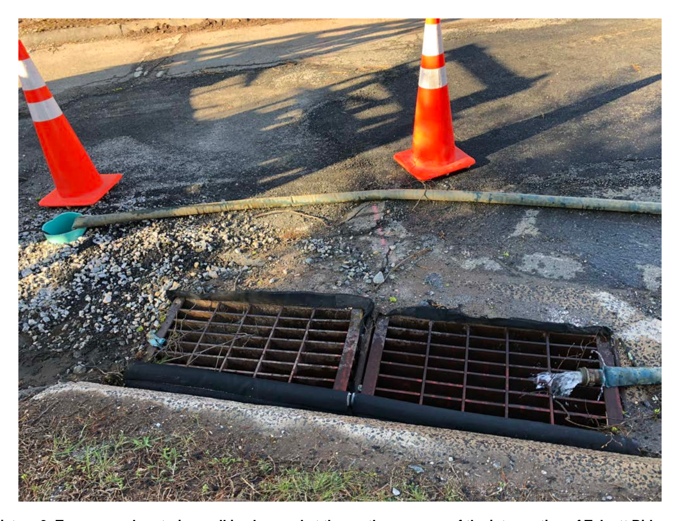
Picture 3: Temporary dewatering well is observed at the northern corner of the intersection of Talcott Ridge Drive and Main Street.