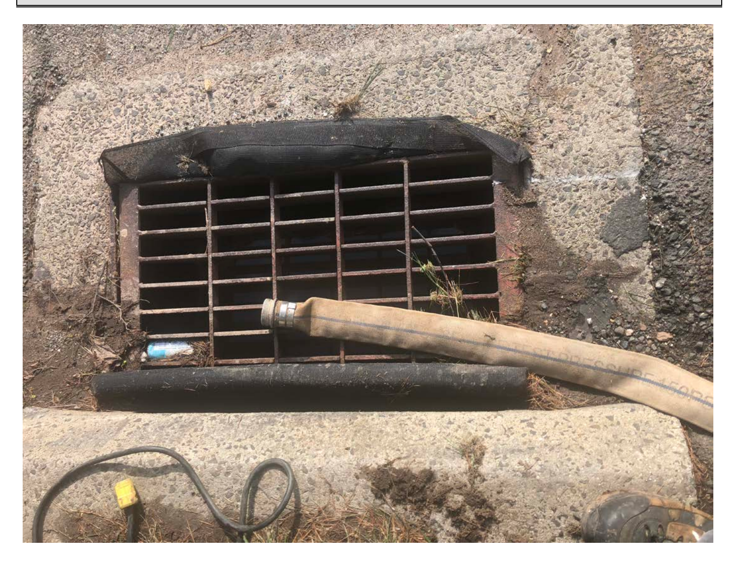
Picture 4: Catch basin with silt sock located south of excavation activities being performed at Station 751+55.