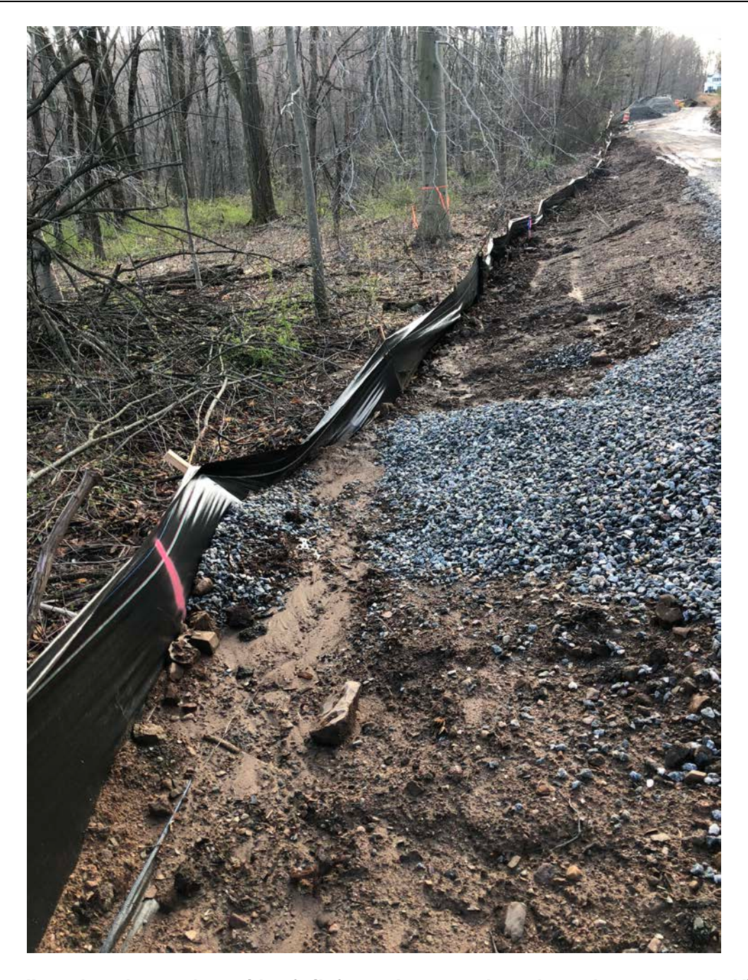
Picture 2: Silt collected on the up-slope side of silt fence that runs along the tank access road. View to the south/southeast.