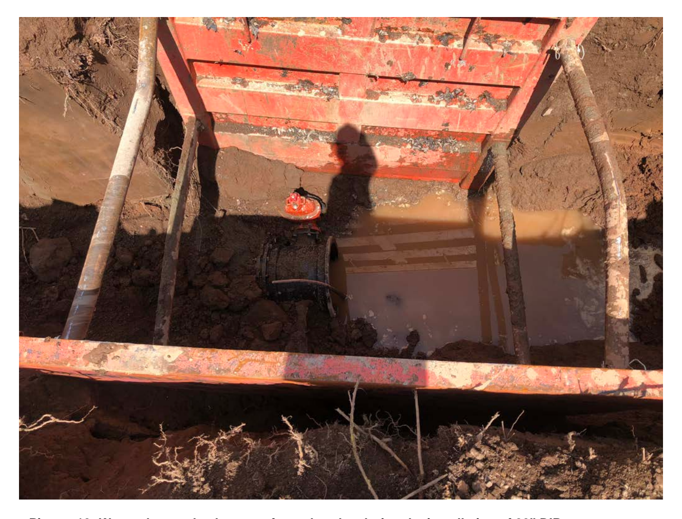
Picture 10: Water observed at bottom of trench today during the installation of 20" DIP.