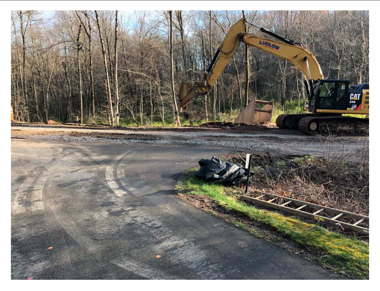
Picture 1: Ludlow begins excavation activities at approximately Station 15+15. View to the northwest.