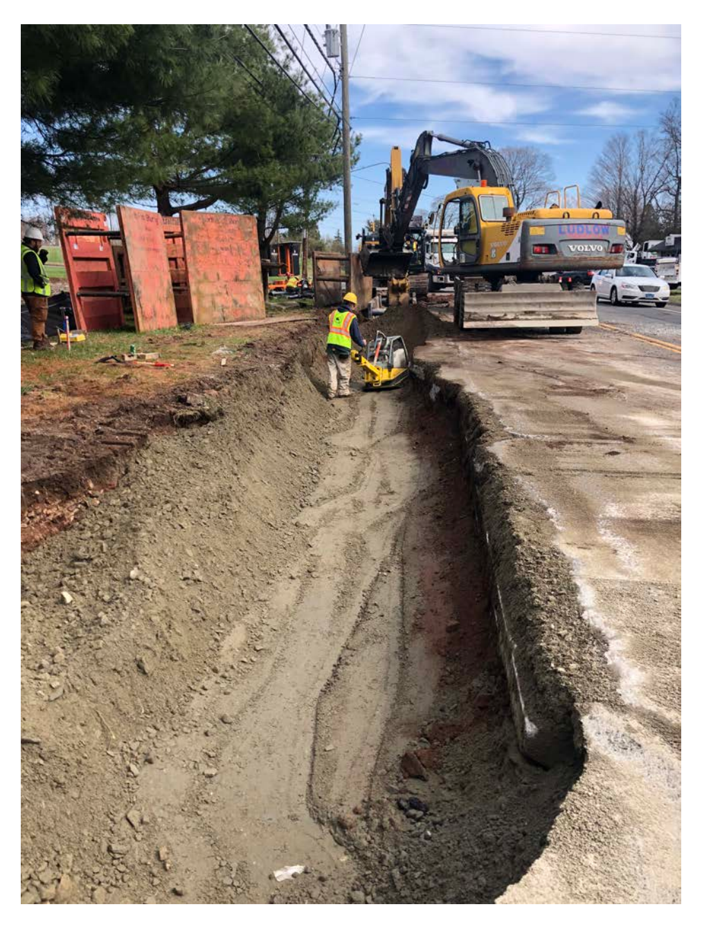
Picture 7: Ludlow compacting fill between Station 751+55 and Station 750+59. View to the north.