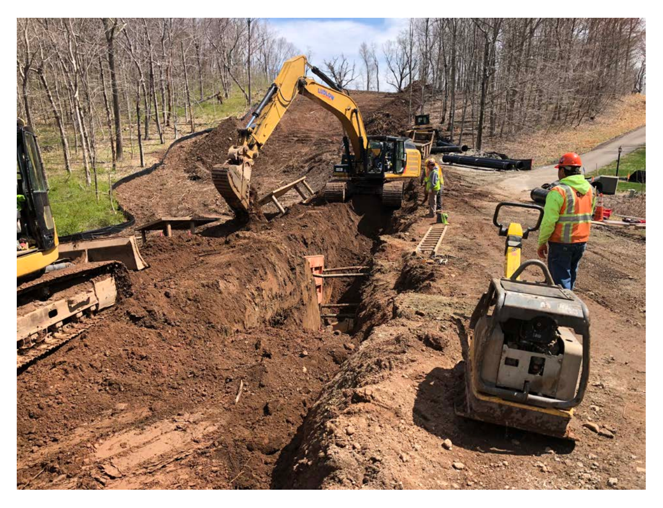
Picture 9: Overview of 20" DIP installation on the tank access road. View to the south.