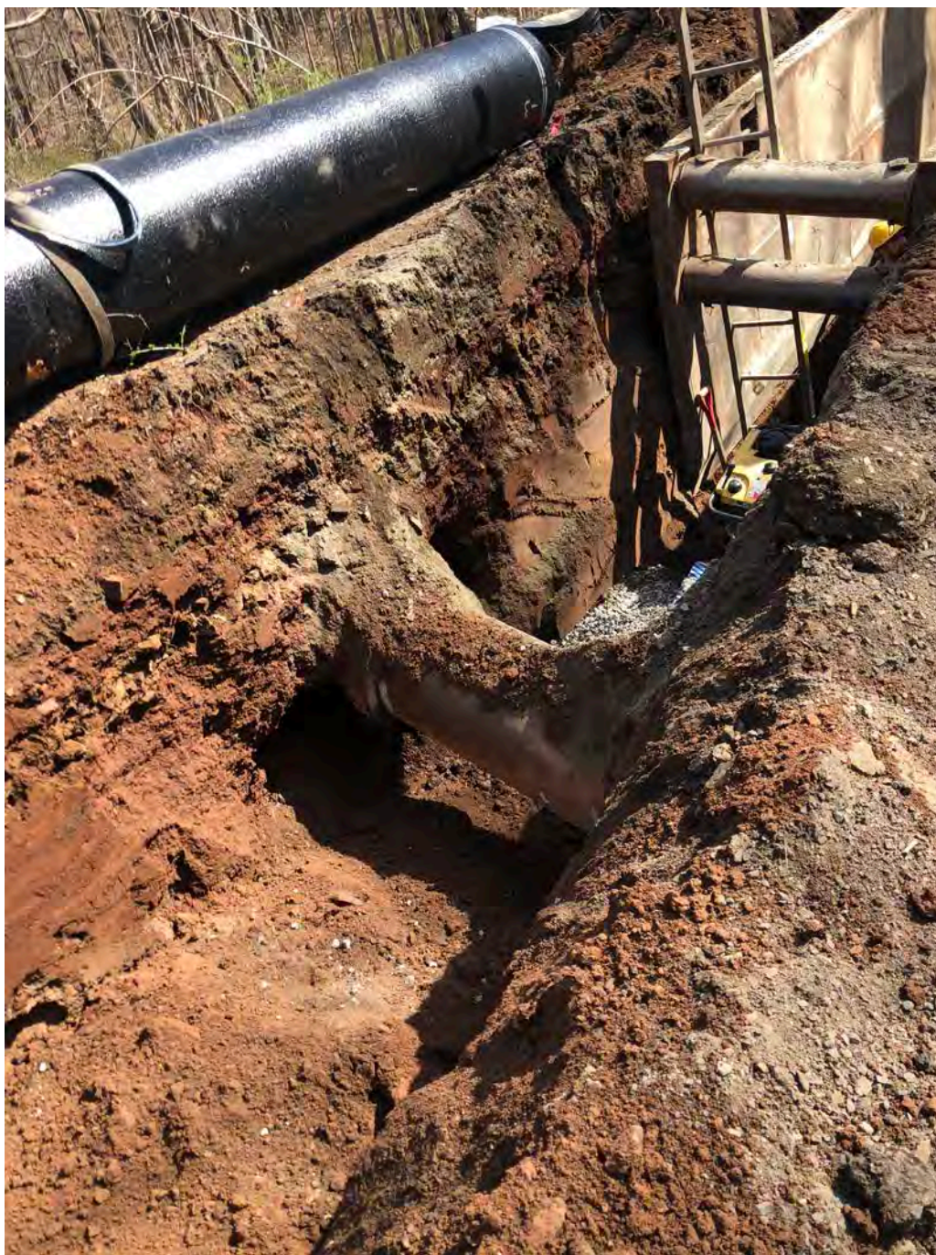
Picture 6: Storm water culvert that crosses the tank access road. View to the east.