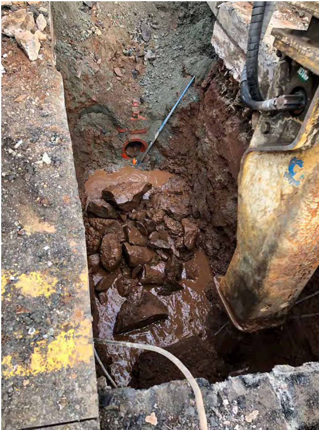
Picture 3: Water and rock encountered while excavating at Station 108+50 South Main St.