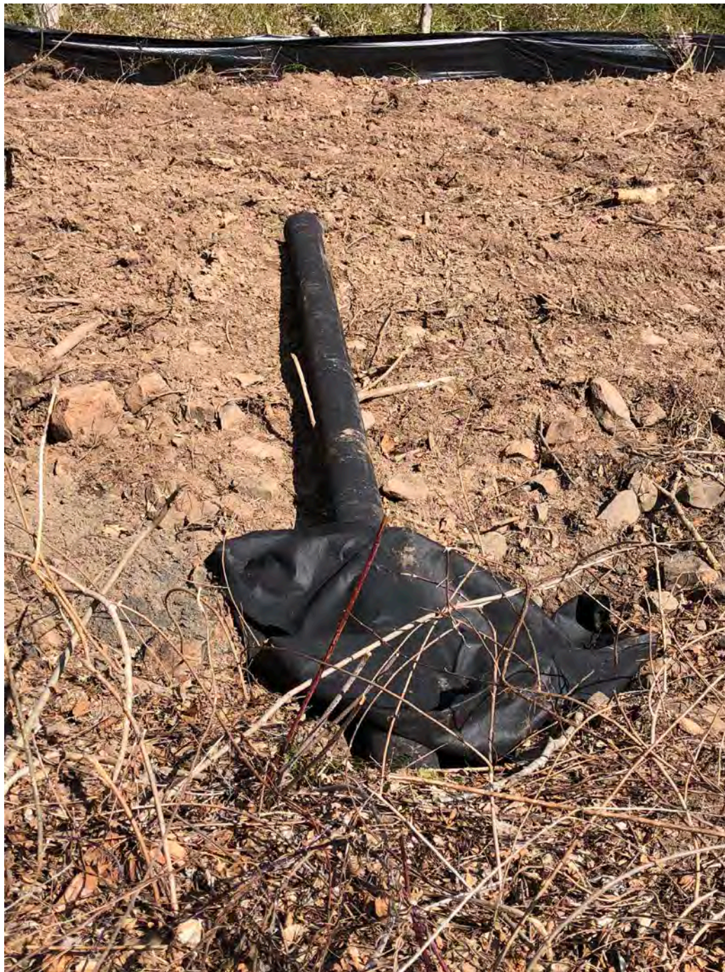
Picture 9: The second of three storm water culverts extended by Ludlow; located on the east side of the tank access road. View to the east.