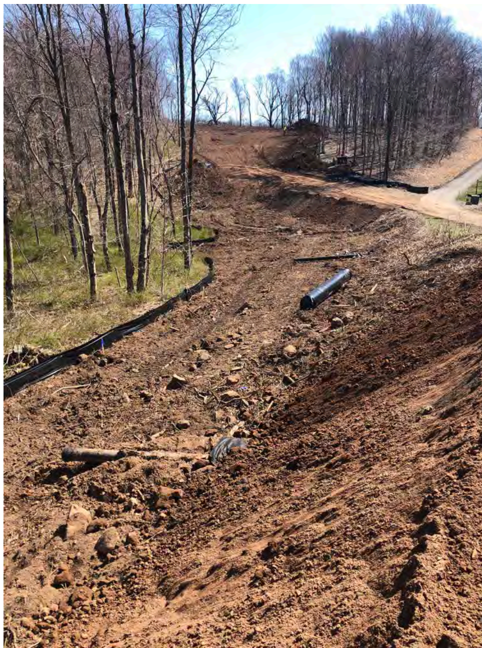
Picture 7: Overview of clearing and grading activities at the tank access road. One of the three storm water culverts extended by Ludlow is visible in the foreground of the photograph. View to the south.