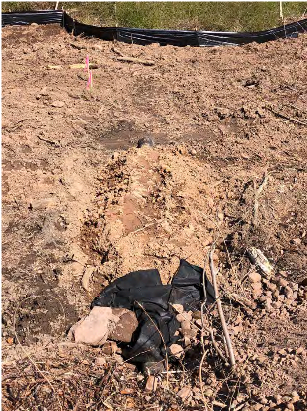
Picture 10: The third of three storm water culverts extended by Ludlow; located on the east side of the tank access road. View to the east.