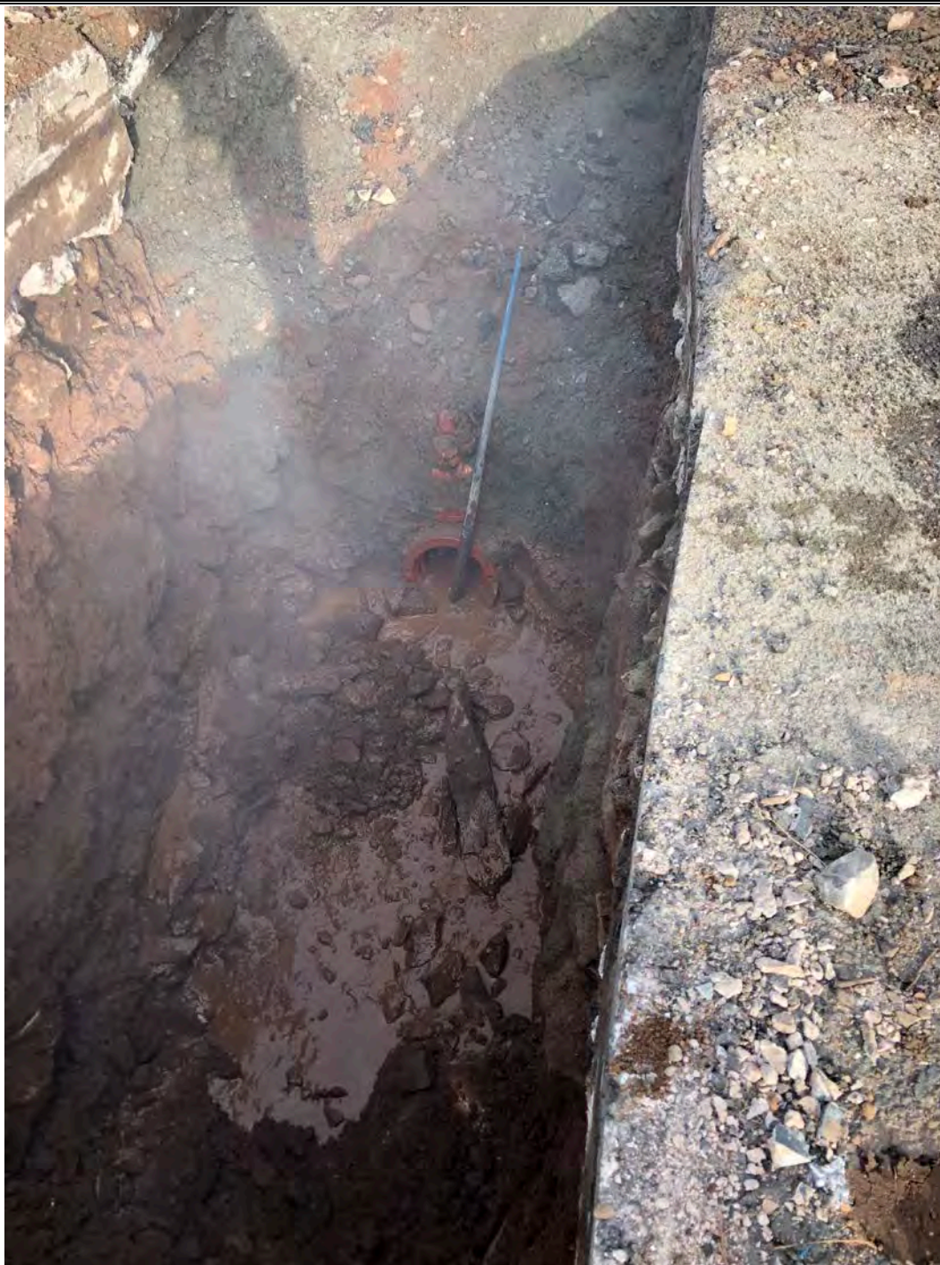
Picture 1: Water observed in excavation at Station 108+50 South Main Street. The valve assembly that turned out to be the source of the water can be seen at the top of the photograph. View to the west.