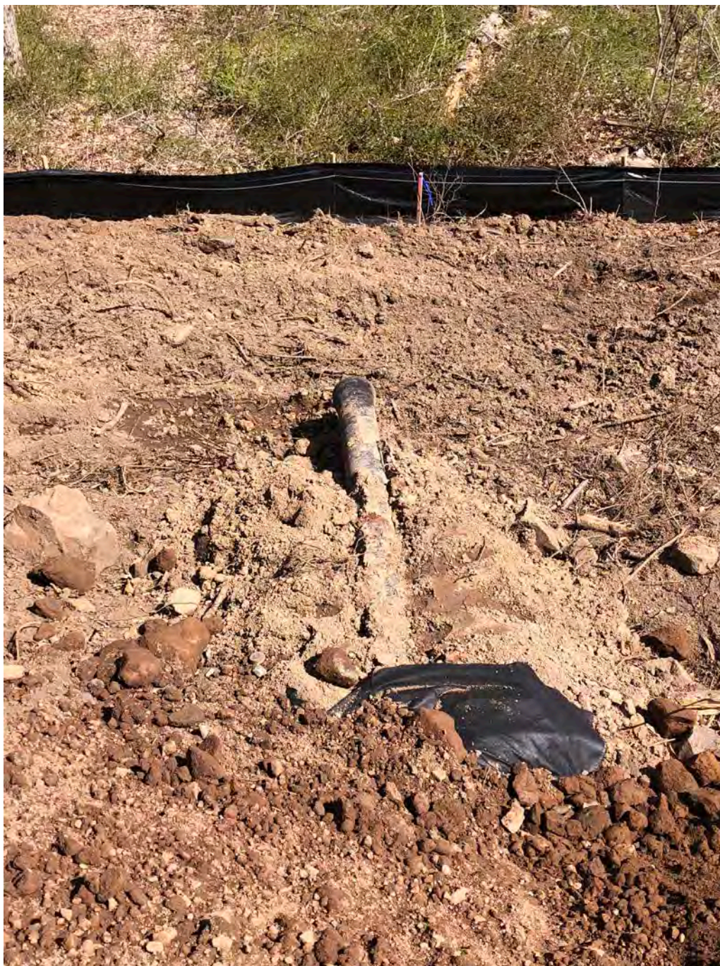
Picture 8: One of three storm water culverts extended by Ludlow; located on the east side of the tank access road. View to the east.