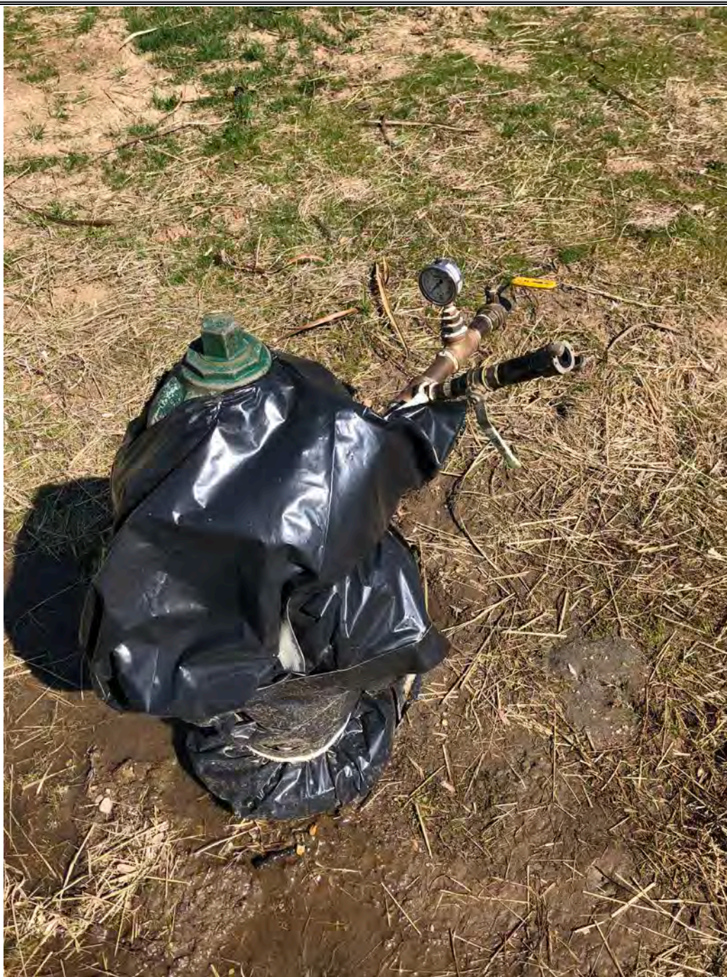
Picture 5: Hydrant with pressure gauge attached to it for pressure testing water line on South Main Street in Middletown.