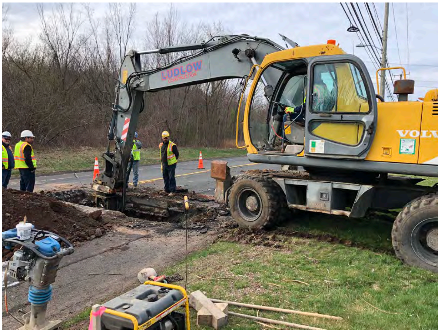
Picture 2: Ludlow using hammer to break up rock that was encountered while excavating. View to the southeast.