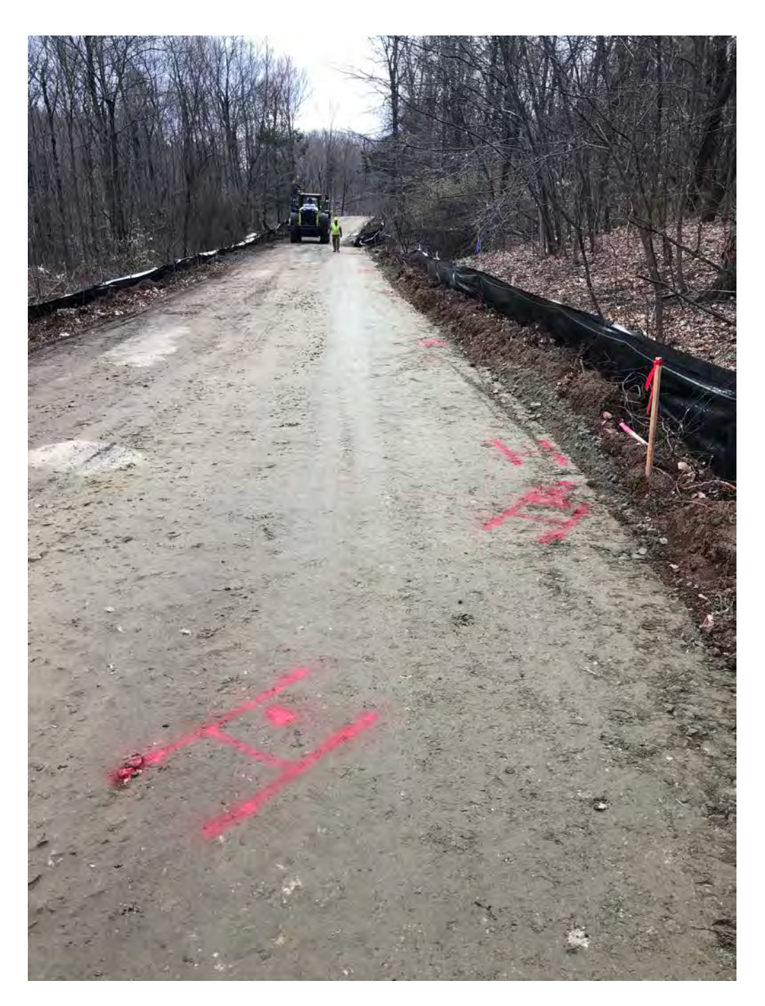
Picture 3: Call-before-you-dig mark out of utilities on the water tank access road. View to the southeast.