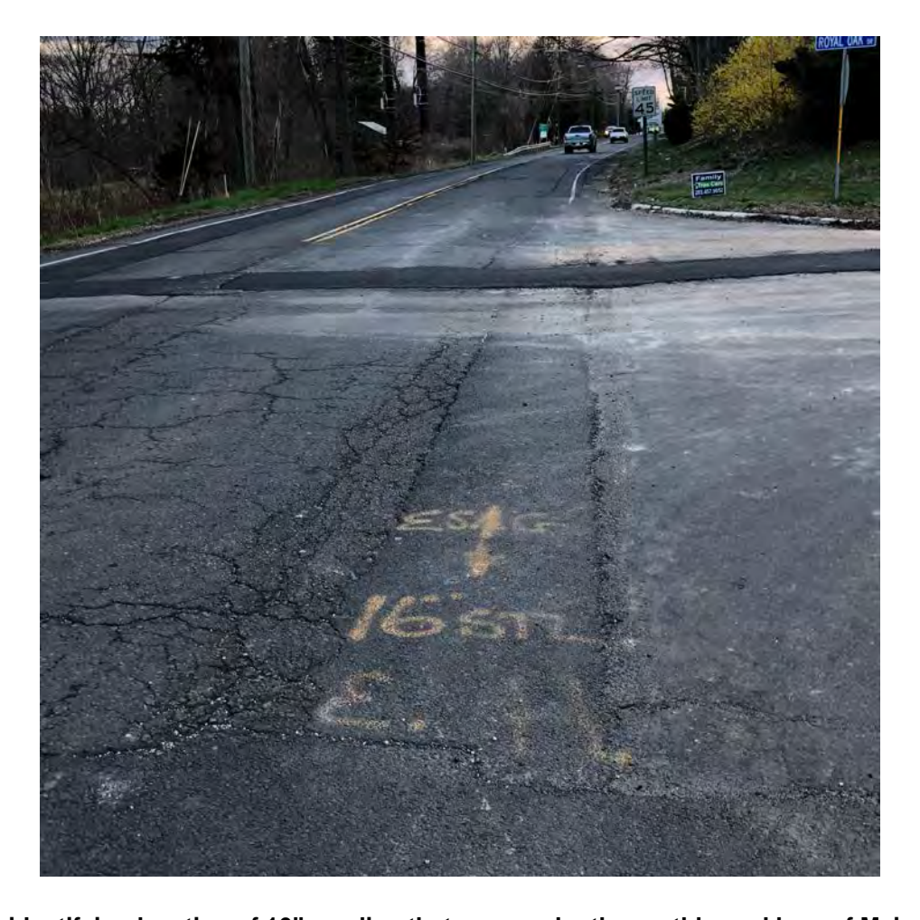
Picture 2: Paint identifying location of 16" gas line that runs under the northbound lane of Main Street (at the intersection of Main and Royal Oak Drive).