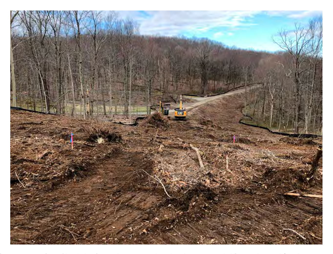
Picture 6: Overview of land clearing at the water tank pad and access road. View to the north/northwest.