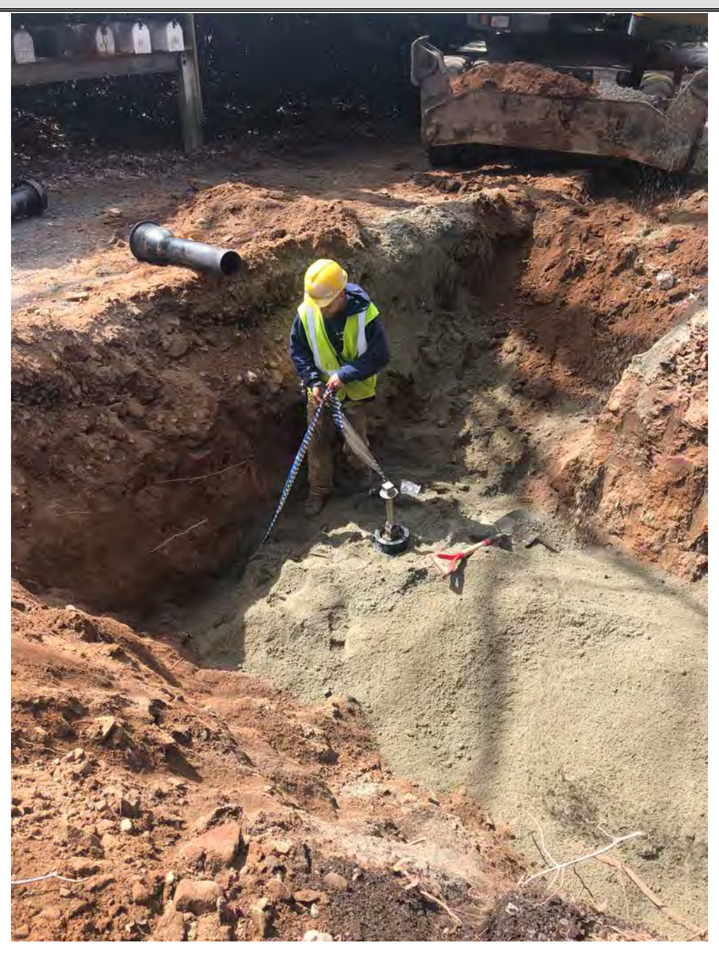
Picture 9: Caution tape placed over installed pipe. Valve box about to be installed over valve stem.