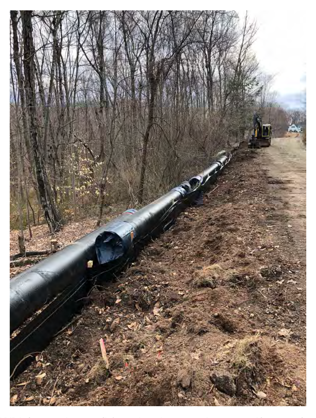
Picture 4: 20" DIP being staged next to silt fence along the water tank access road in preparation for upcoming installation.