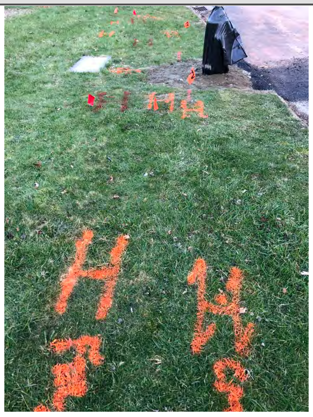
Picture 1: Call-before-you-dig markings, made after Comcast lines were severed during the installation of a fire hydrant assembly on Royal Oak Drive.