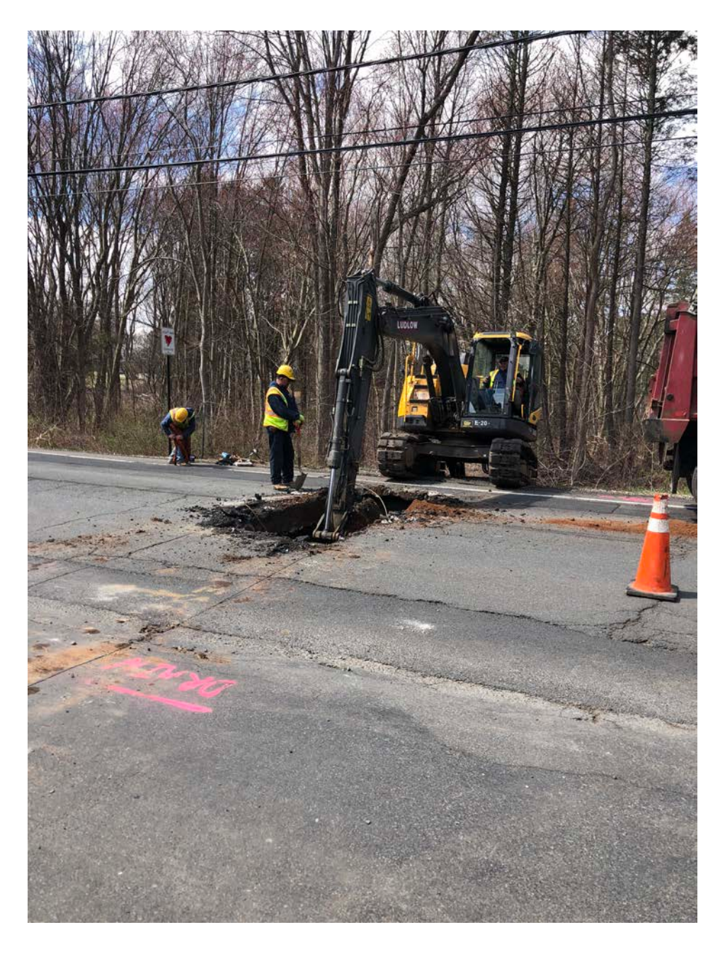
Picture 16: Excavating just north of Station 137+00. View to the southwest.