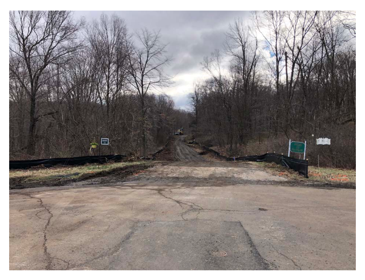
Picture 6: View of access road to future water tank from the Talcott Ridge cul-de-sac depicting erosion control View to the southeast.