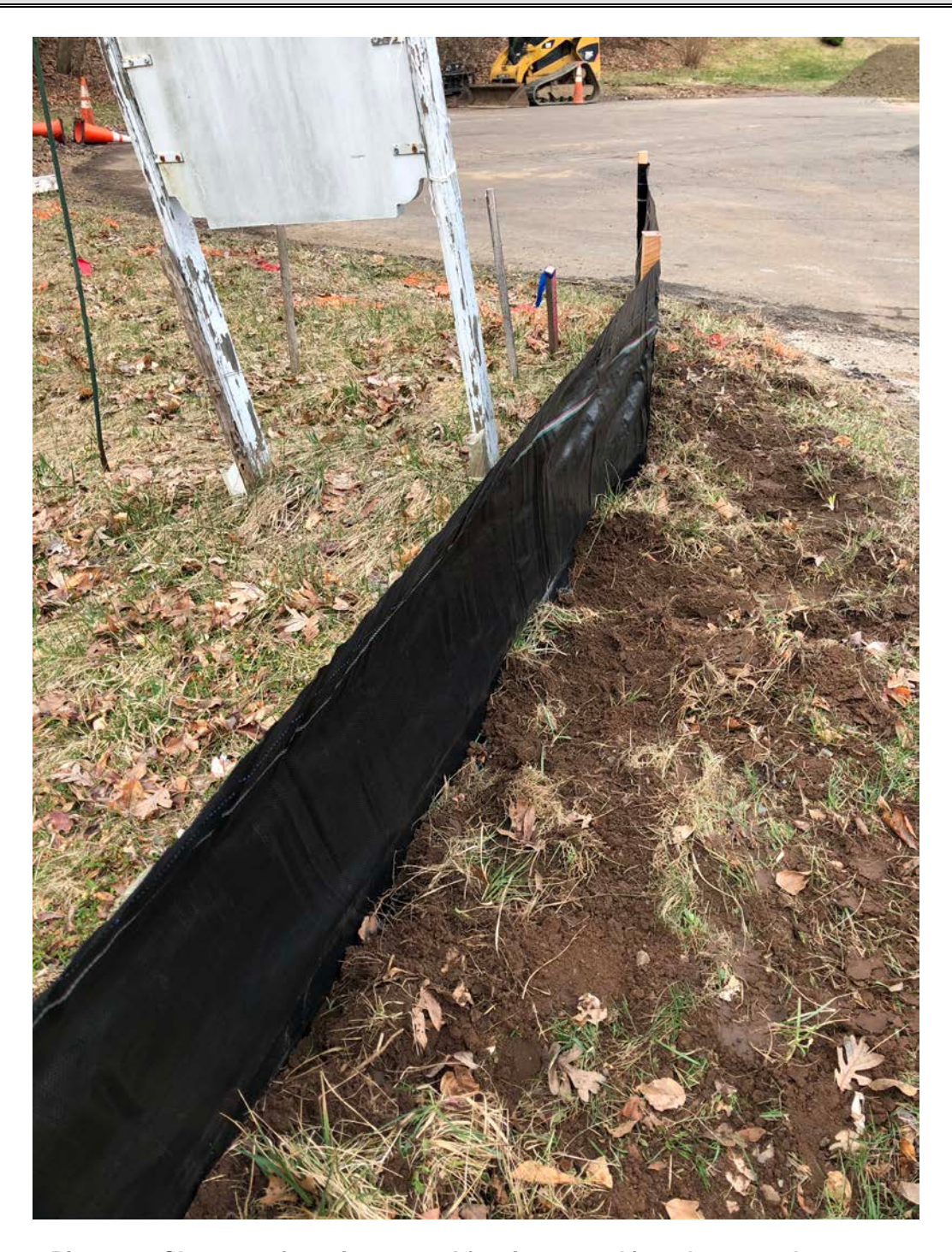
Picture 7: Close-up of erosion control fencing seated into the ground.