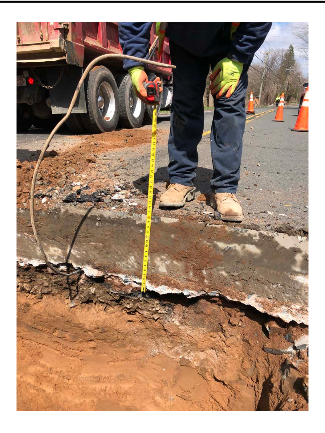
Picture 17: Thickness of asphalt and concrete on Main Street just north of Station 137+00.