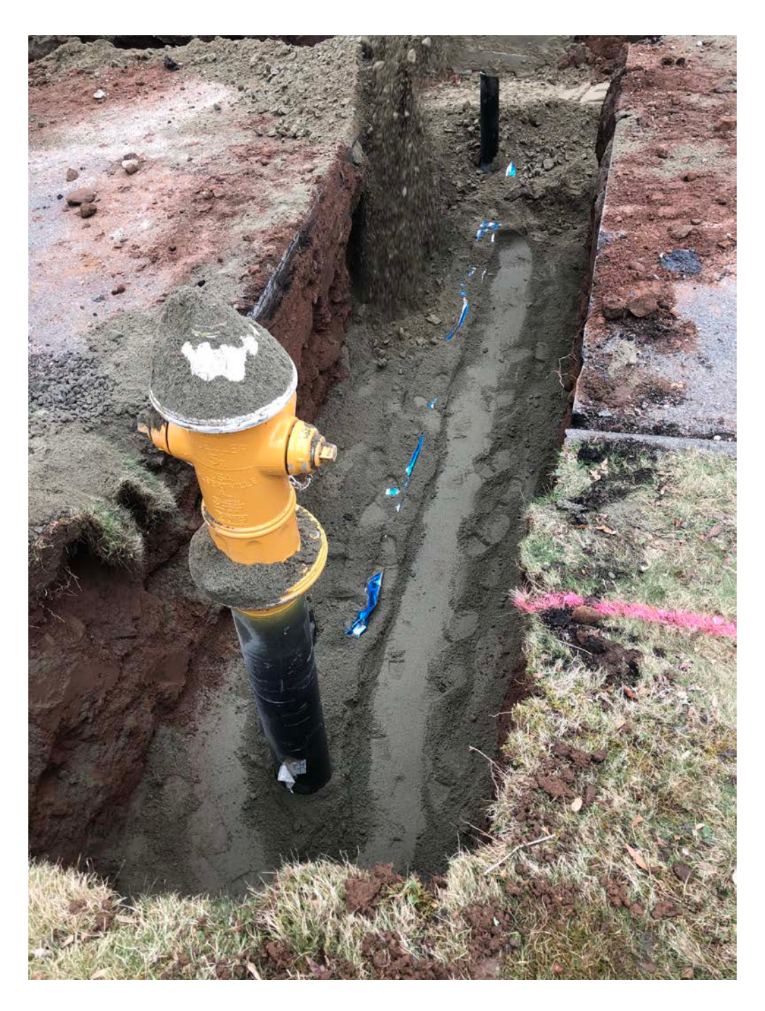
Picture 13: Caution tape placed over 6: DIP on Oak Terrace. View to the north.