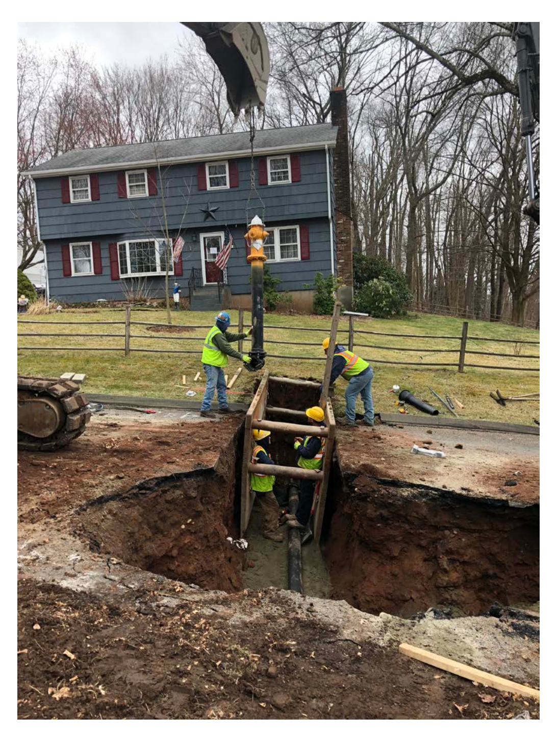
Picture 12: Installation of hydrant assembly on Oak Terrace. View to the south.