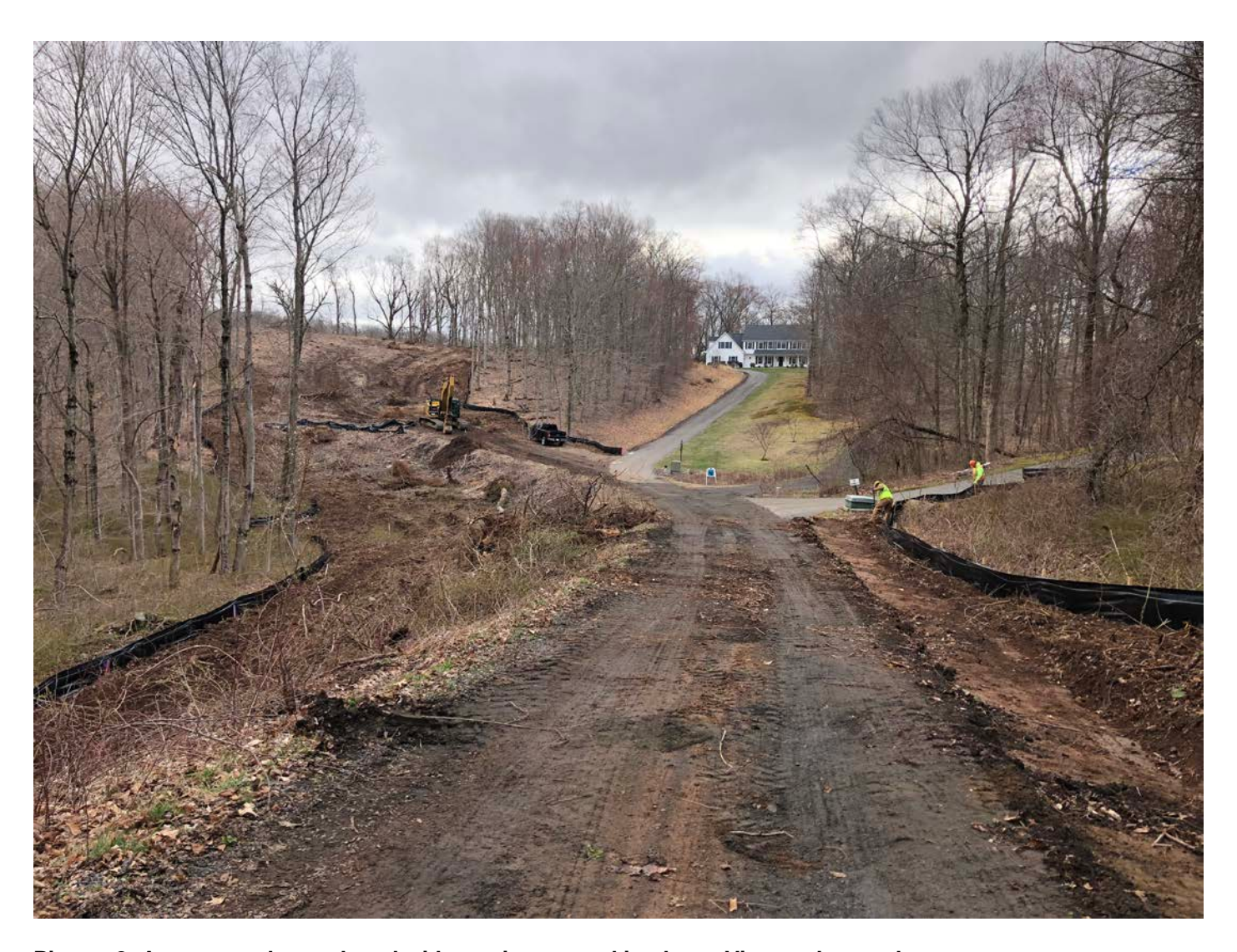
Picture 8: Access road to tank pad with erosion control in place. View to the southeast.