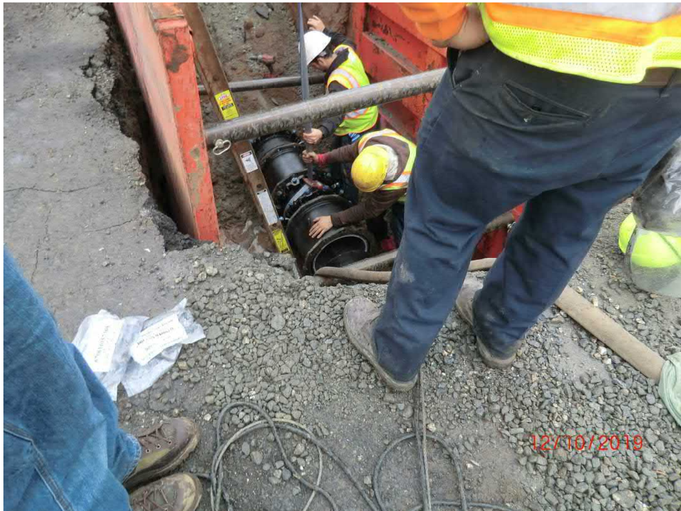
Figure 15 – Lowering replacement section of pipe into hole.