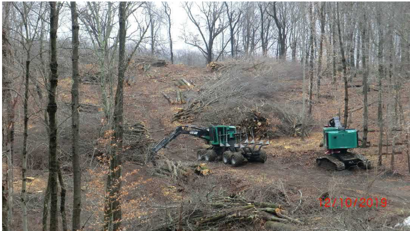
Figure 7 – View eastwardly up access to tank location. Driveways to neighboring houses to the bottom right corner of picture.