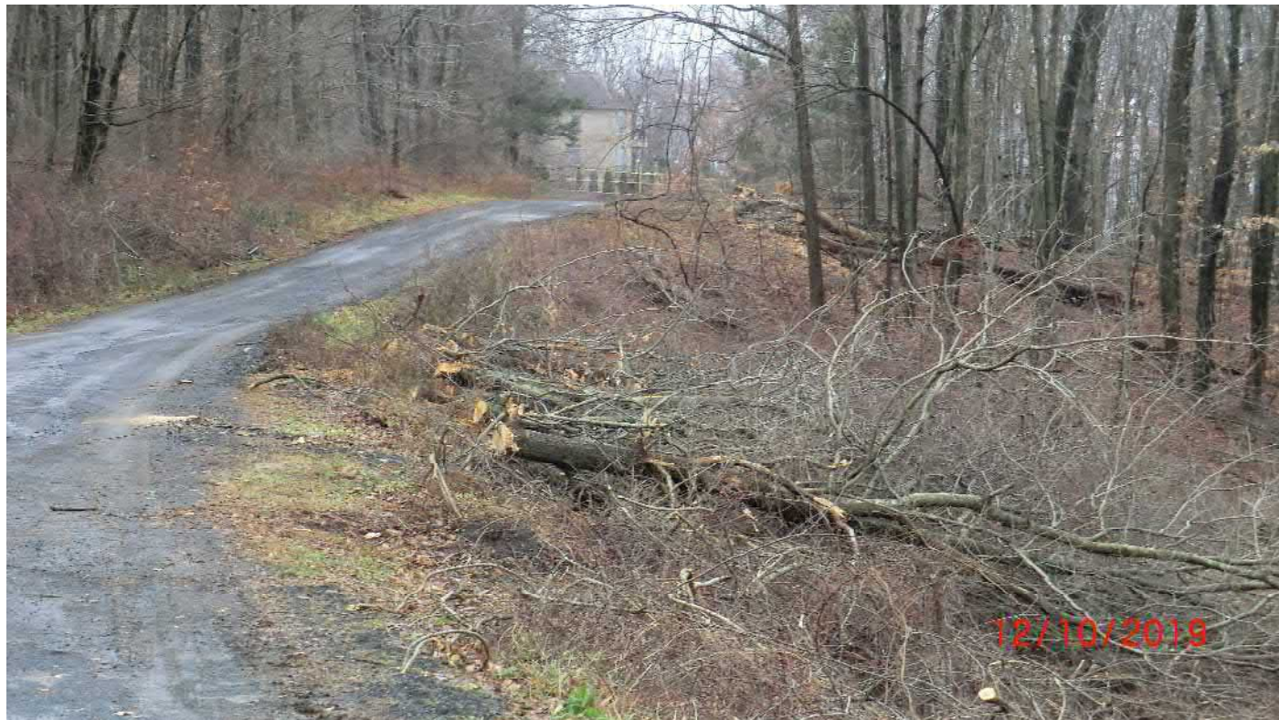
Figure 6 – West northwest view from private drive up to the cul-de-sac (Talcott). Tree clearing awaiting chipping.