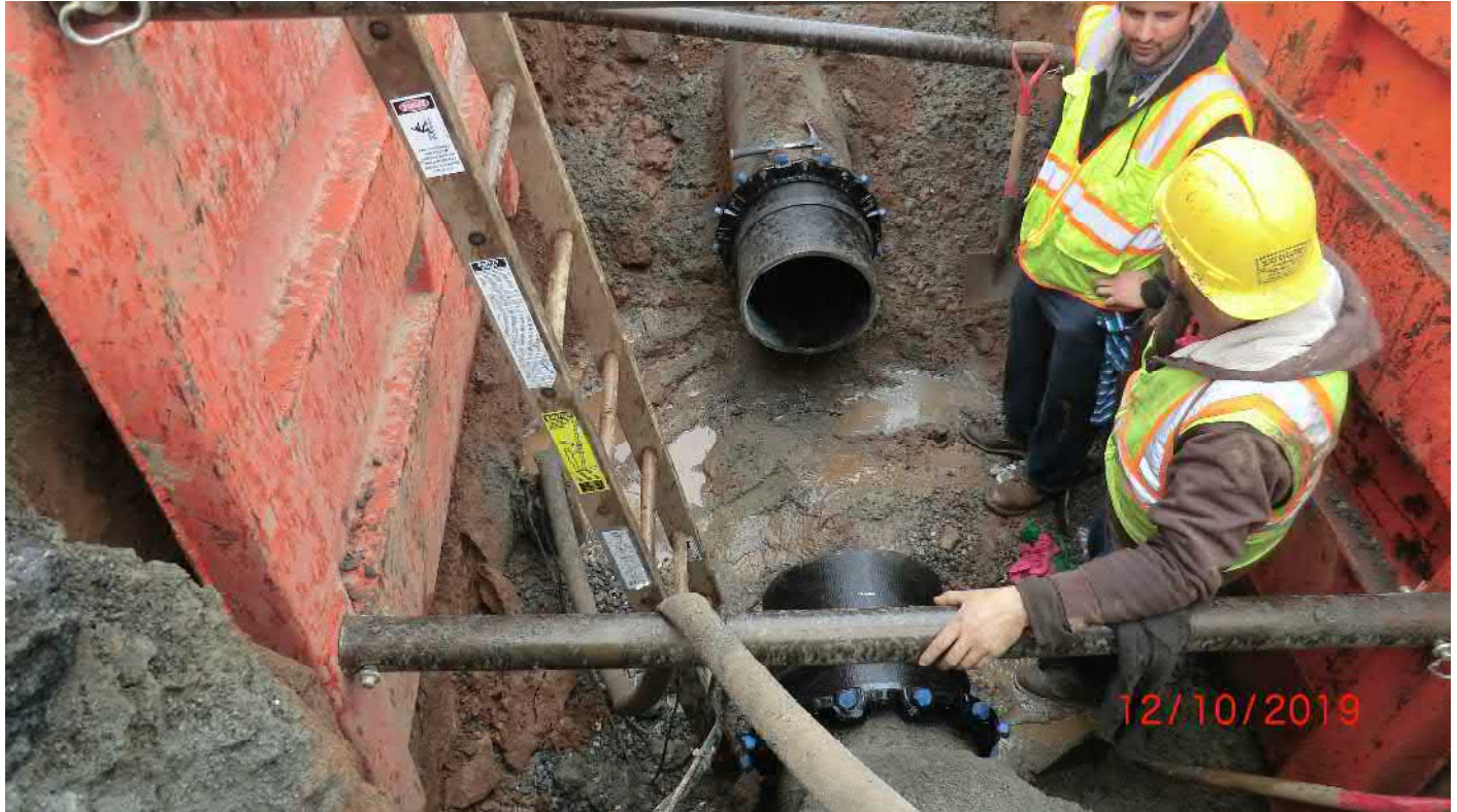
Figure 13 – Roughly 4 foot section cut from pipe line. Notice Megalug restrained glands on either side for connecting to replacement section.