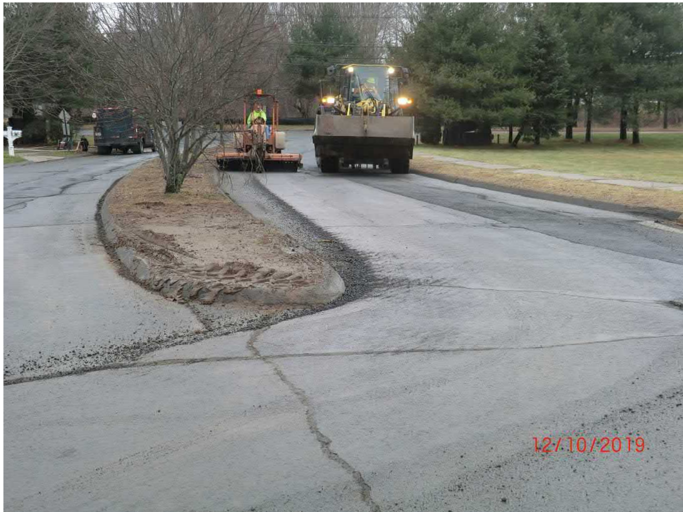
Figure 19 – Facing west, street sweeping activities. Cleaning up loose asphalt and gravel from Talcott Ridge. S. Main Street is seen in the distance.