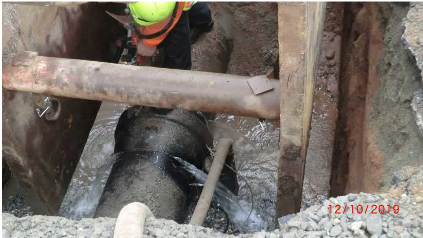
Figure 2 – Cutting drain slits and sump hole in pipe. Leak was detected at the bell connection.