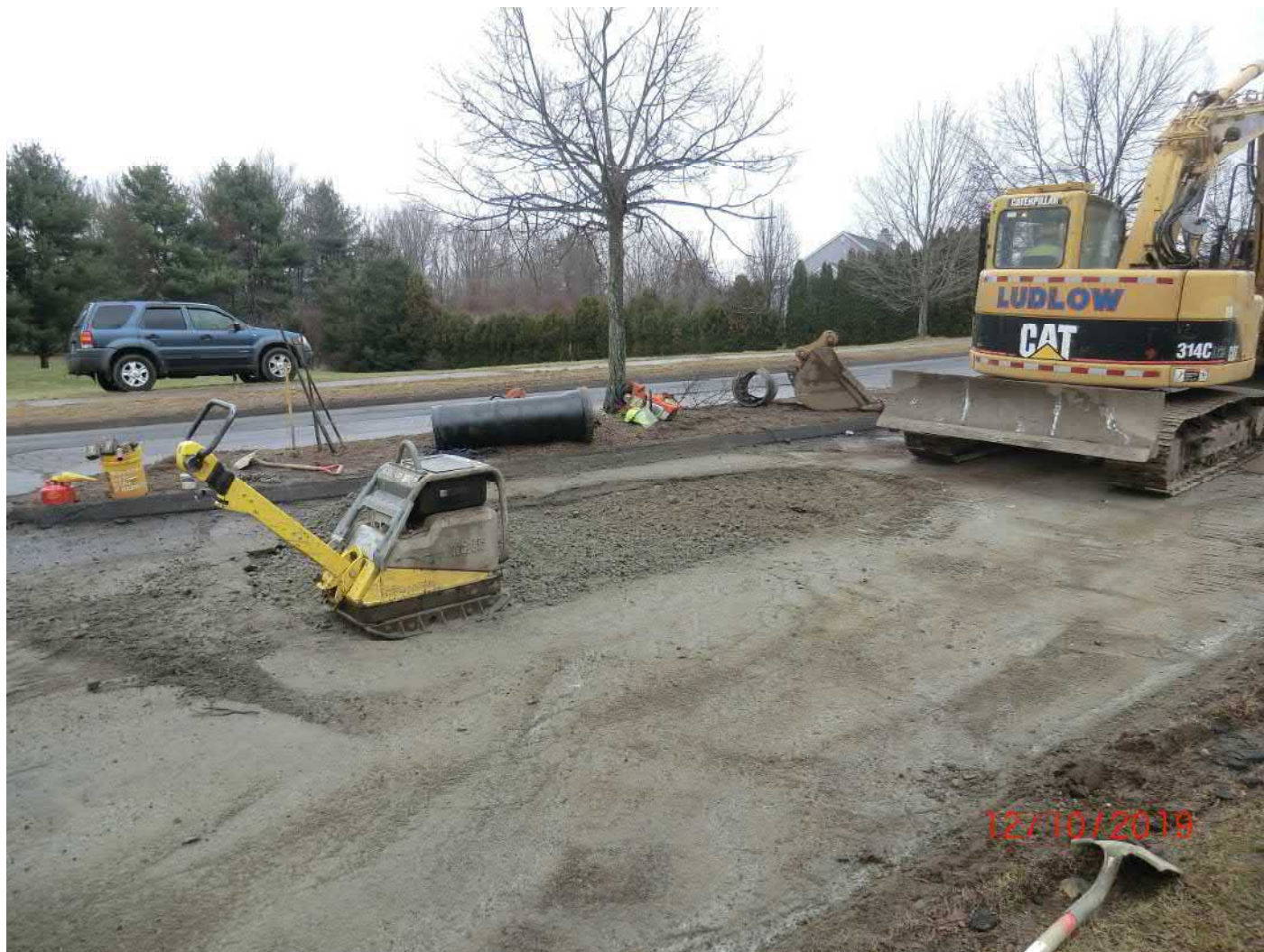
Figure 22 – Facing northeast. Preparing to plate compact final lift of fill.

Date: December 10, 2019 Day of Week: Tuesday Report No: 44 Page: 24 of 25