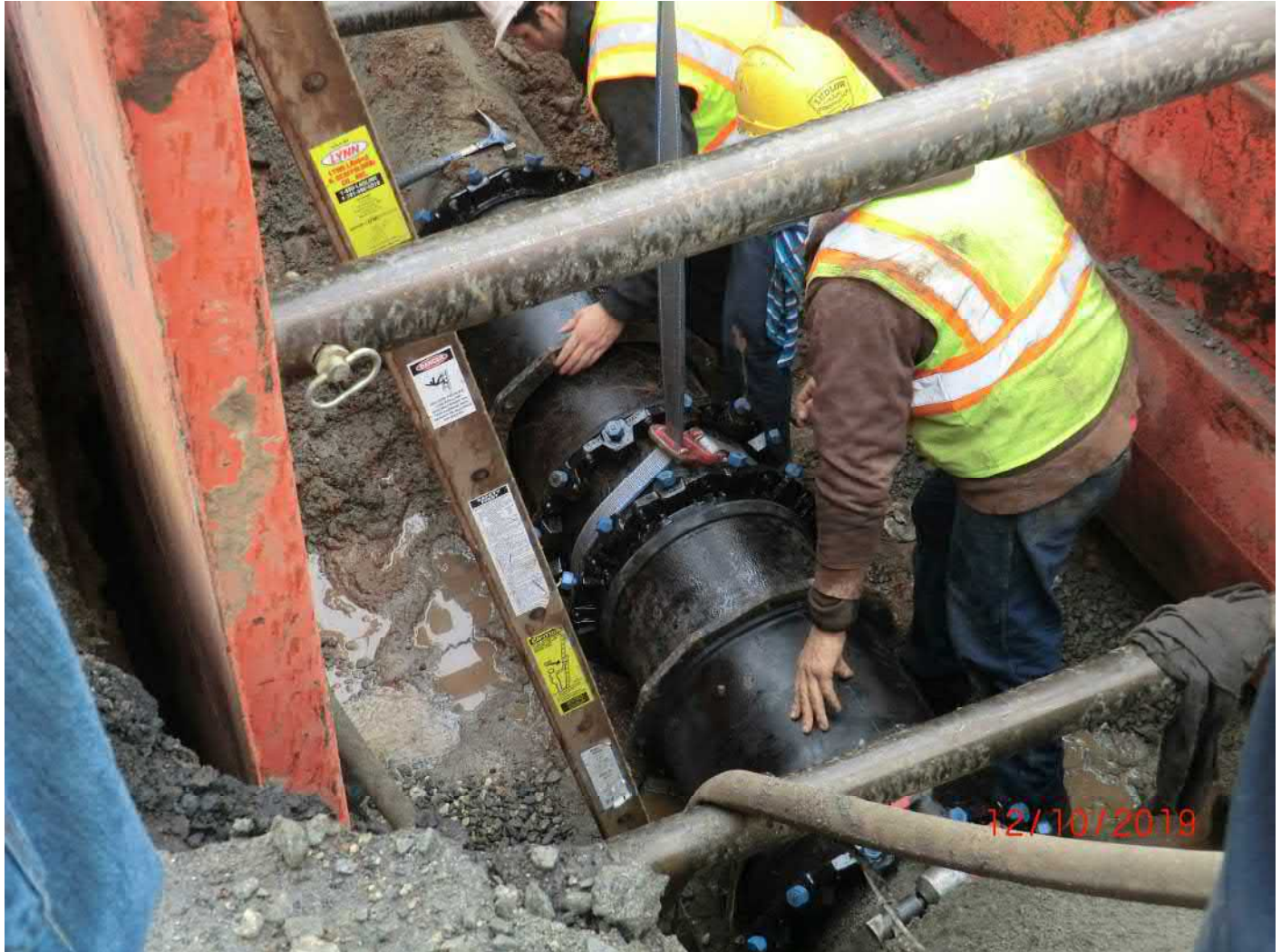
Figure 16 – Sliding/extending solid sleeves into place. 16” sleeves centered over cuts but using marks on the pipe.