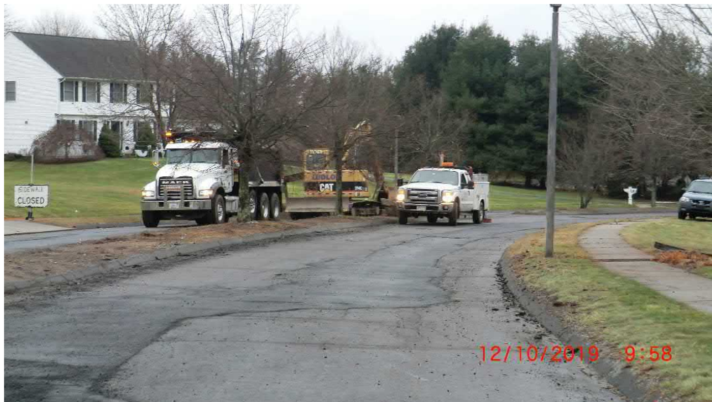
Figure 1 –Looking east southeast to location of today’s work at Station 49+30 ±. S. Main Street is behind evergreens.