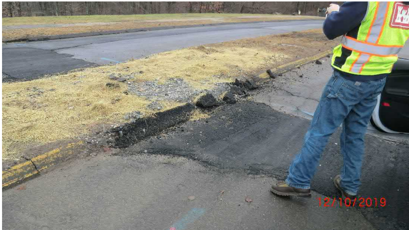
Figure 5 – View southeast, Talcott Ridge cul-de-sac to the right of picture. Curb repair failure at location that was breached to run 6" DIP across Talcott for new hydrant on other side of road. Unclear if damage was due to plowing (snow) or equipment.