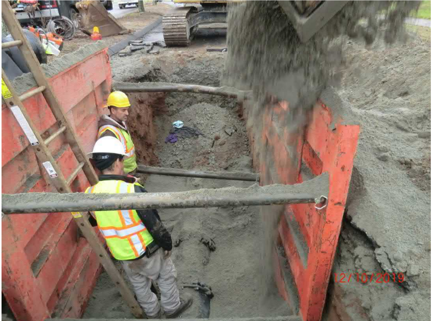
Figure 18 – Facing east, backfilling the repair.

Date: December 10, 2019 Day of Week: Tuesday Report No: 44 Page: 20 of 25