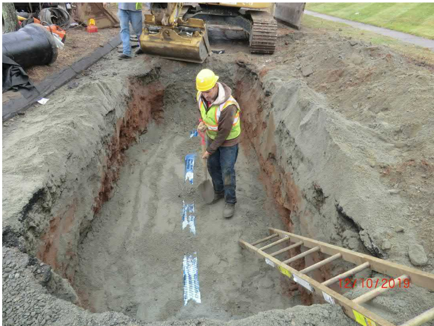
Figure 20 – Facing east, pipe bedding in and compacted by jumping jack. Warning tape set down on top.