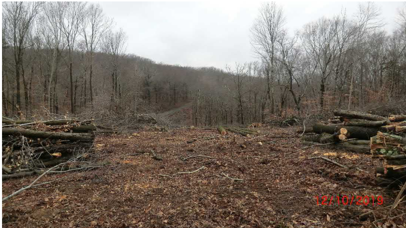
Figure 11 – Westerly view from water tank area to access road. Note that the private drive in to the access road can be seen in the distance.