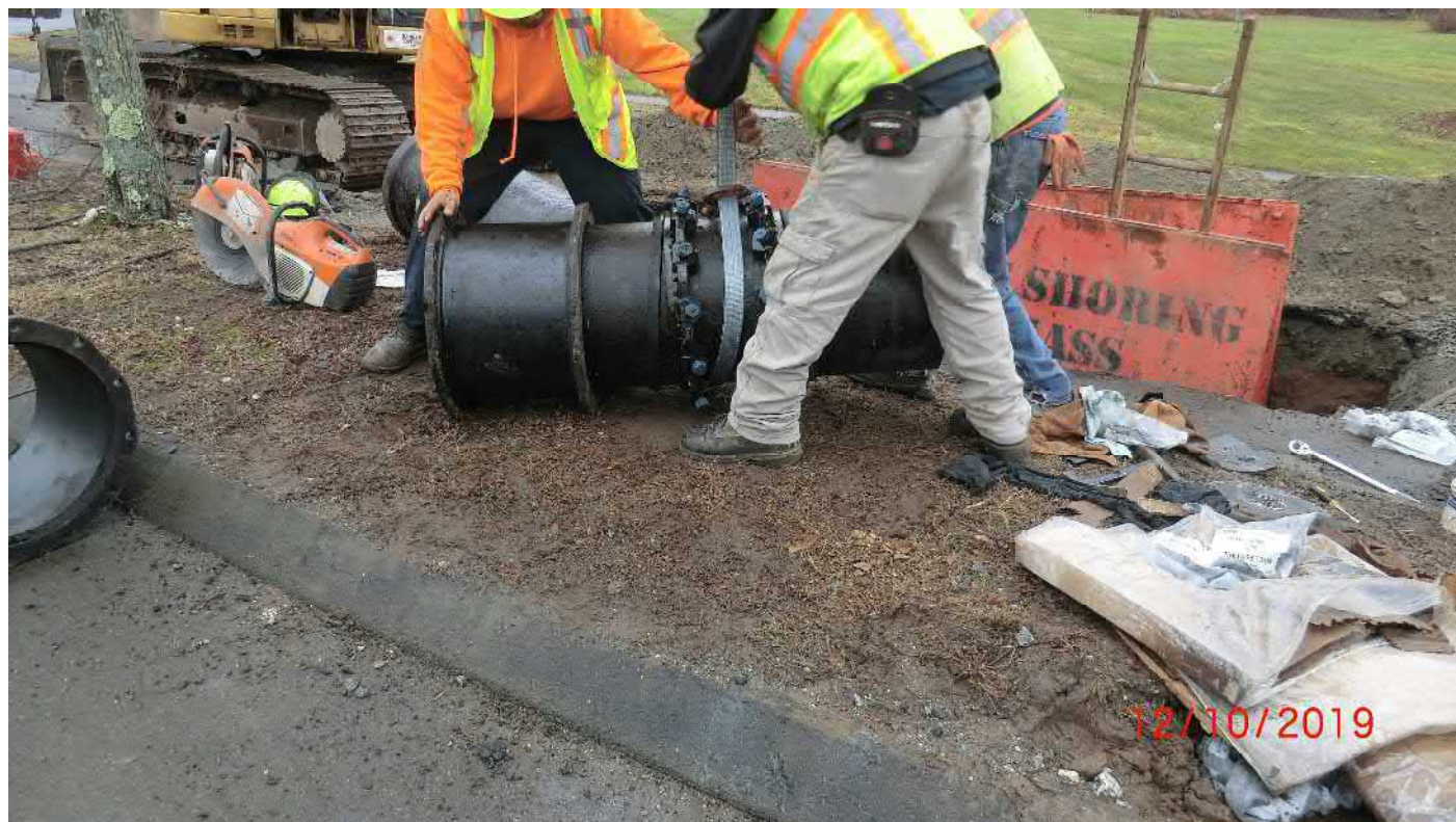
Figure 14 – Replacement section of 16” DIP being fitted with the first of two solid sleeves (second sleeve is seen in left of frame). Note Mega-lugs un inside by strap.