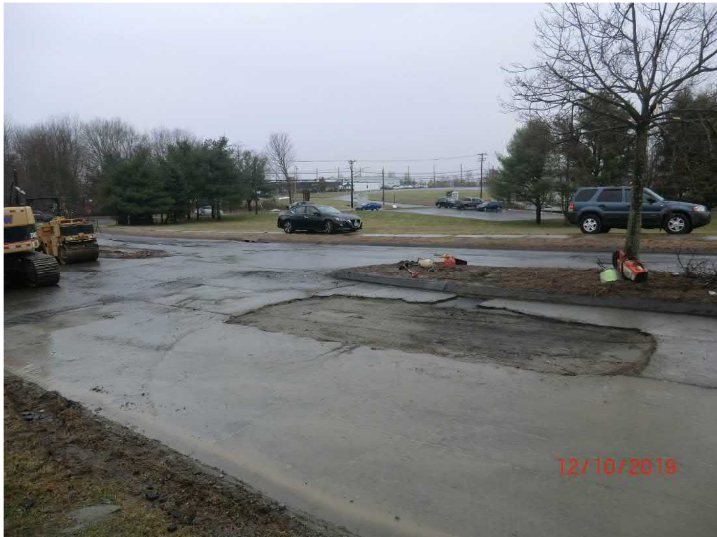
Figure 23 – Facing north east, waiting for asphalt patch.