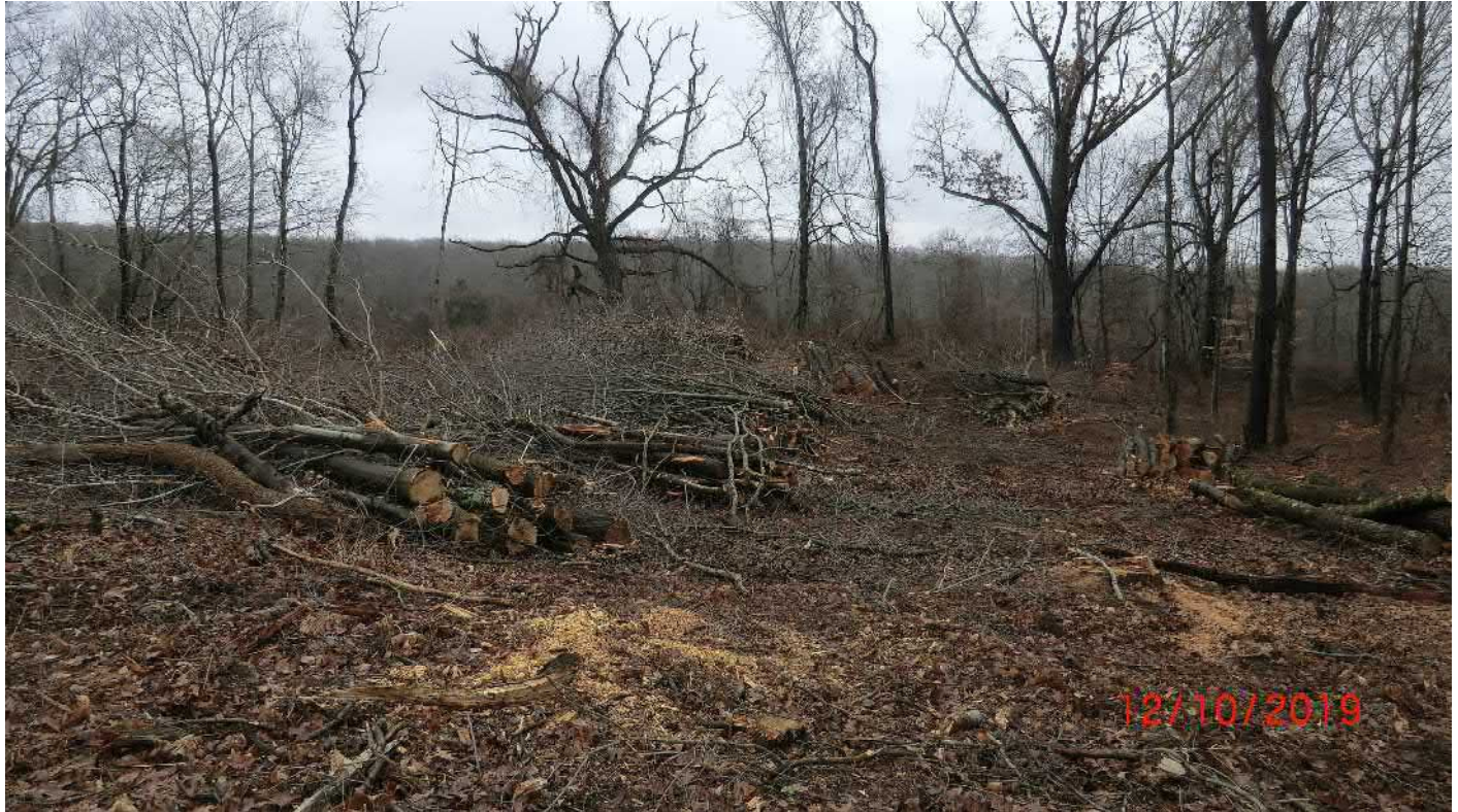
Figure 9 – Facing easterly, view of tank area.