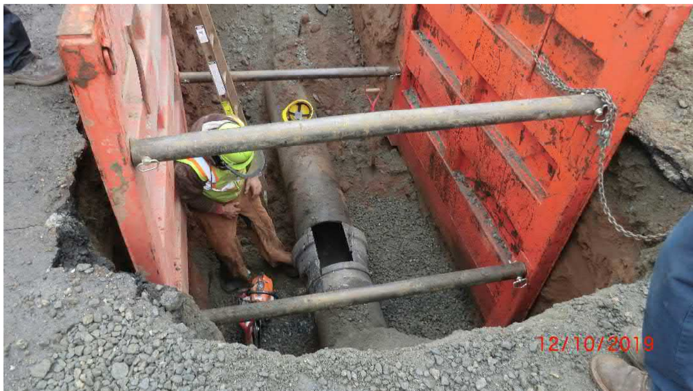
Figure 12 – Pipe drained. Preparing to cut section out.