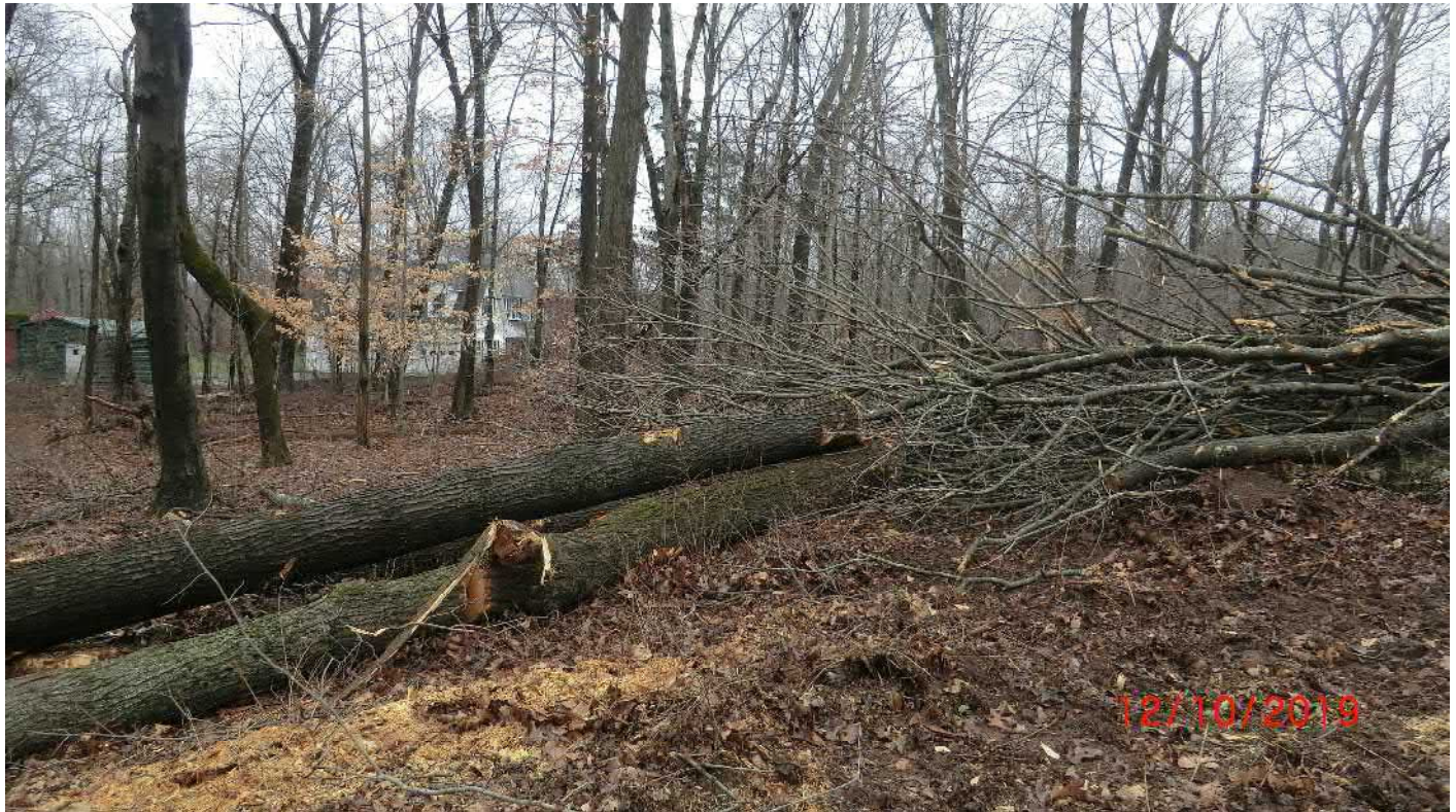
Figure 10 –southwesterly view, edge of tank area facing nearest neighbor to tank site.