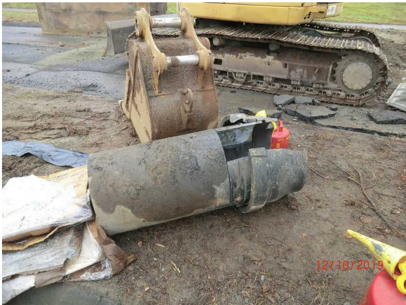
Figure 21 – Section of pipe removed from line due to leak at bell.

Date: December 10, 2019 Day of Week: Tuesday Report No: 44 Page: 23 of 25