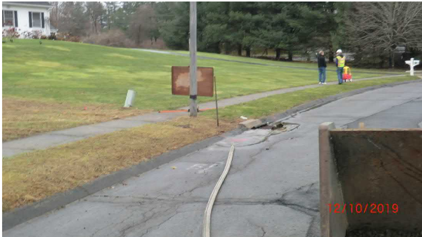
Figure 3 – Facing east southeast clean (town) water being purged from well to lined catch basin. The silt sock had been removed and cleaned earlier because it was so full that water was draining straight past basin to the double catch basin at the corner of S. Main St. and Talcott Ridge Drive.