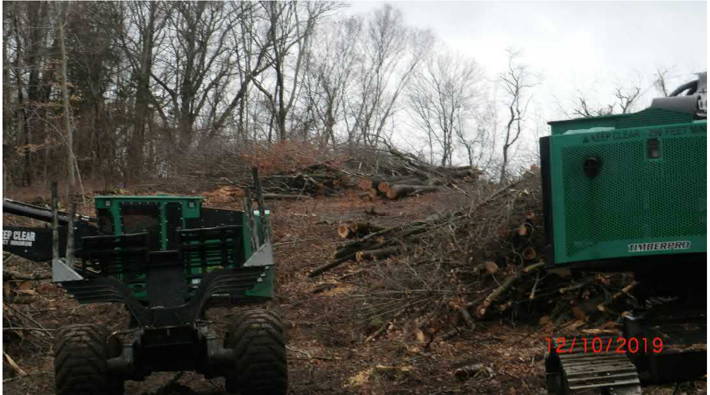
Figure 8 – Same view as Figure 7, but closer.