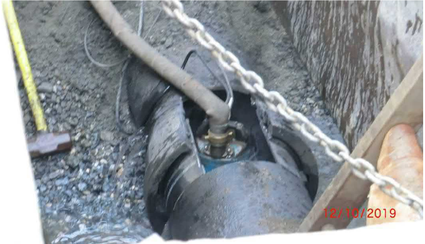
Figure 4 – Sump hole cut into bell. Sump draining to catch basin.