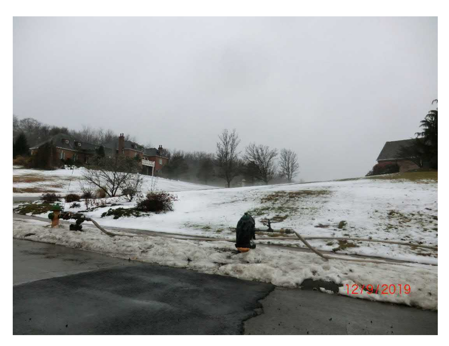
Figure 7 – Facing southwest, at intersection of Talcott Ridge and upper Watch Hill. Ludlow filling the water line going up to the top of Talcott Ridge.