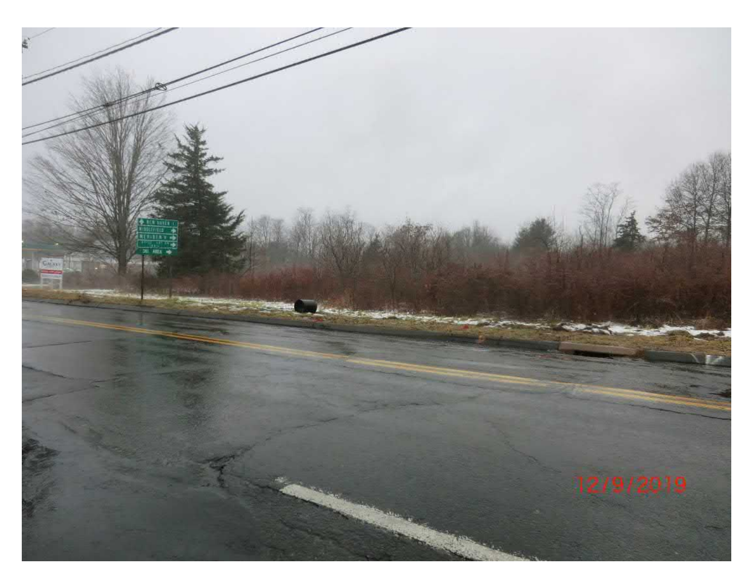
Figure 8 –Random piece of 16" DIP (approx. 2-foot section) located on west side of the road adjacent to gas station at Rte.157. Across street from this location there is a road sign lying down on the front lawn of the residence.