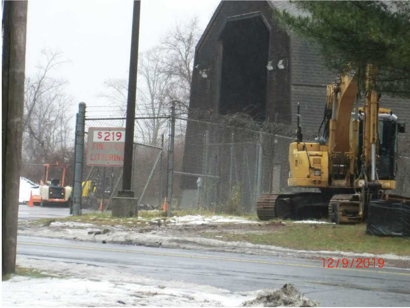
Figure 19 – Mid-size excavator located north of CT DOT yard.