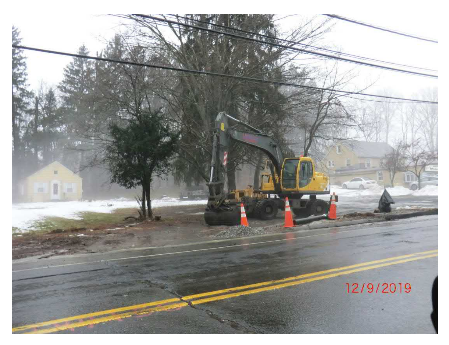
Figure 9 – Wheeled excavator located adjacent to Lino's Market on west side of road next to new hydrant, cones, excess gravel and 8" DIP.