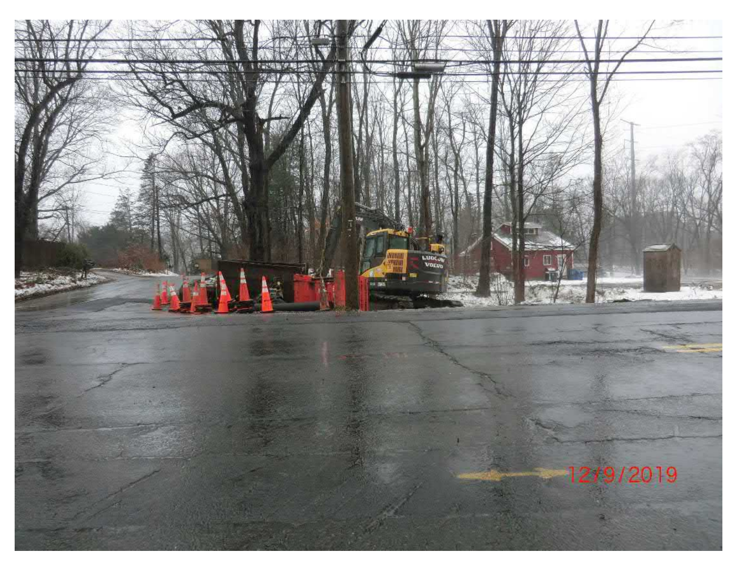
Figure 13 – Facing west at intersection of Main Street and Little Street. Mid-size excavator, trench boxes, cones, and materials. This was the last hydrant location installed.