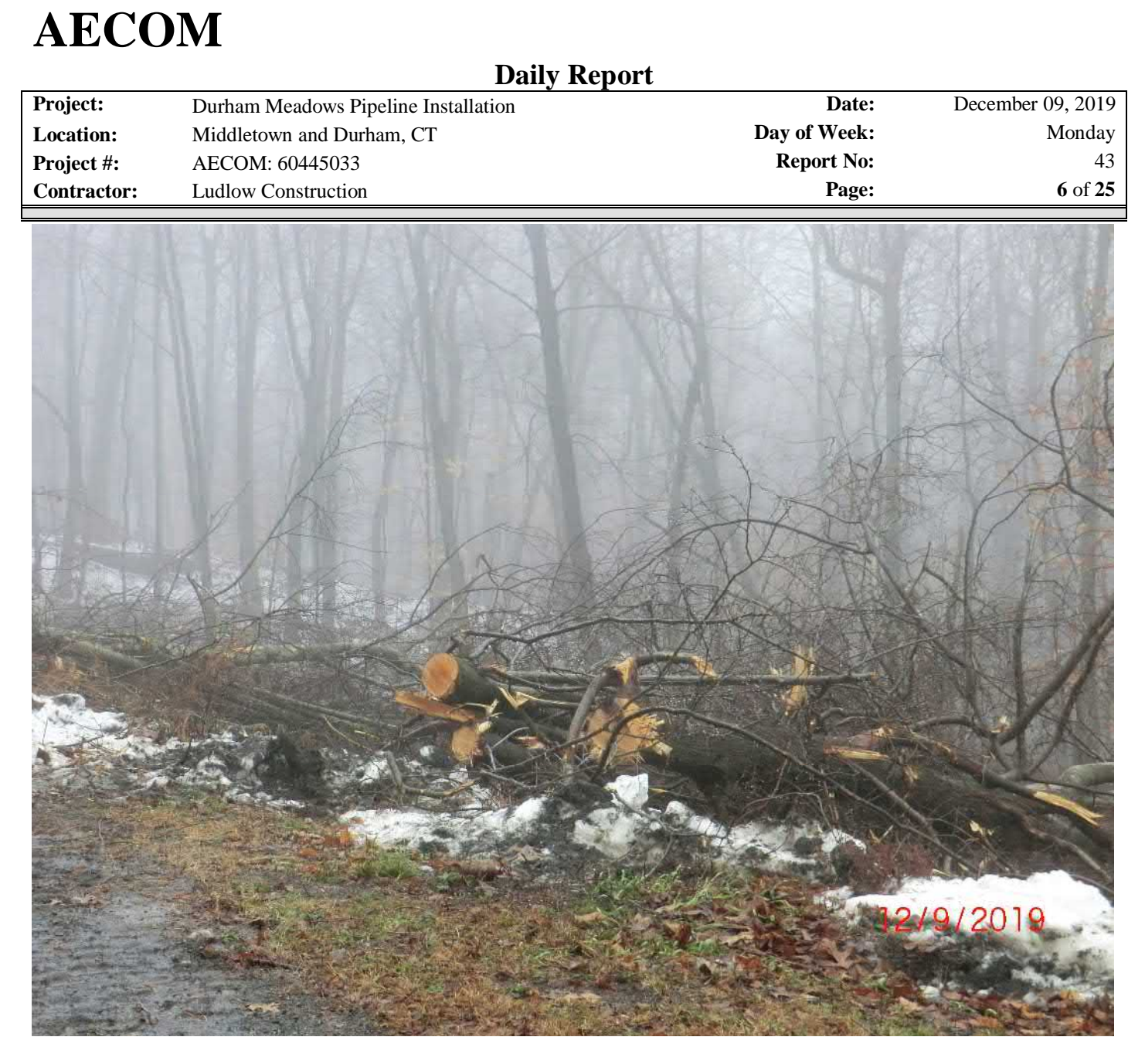
Figure 4 – Same as Figure 3, further along driveway.