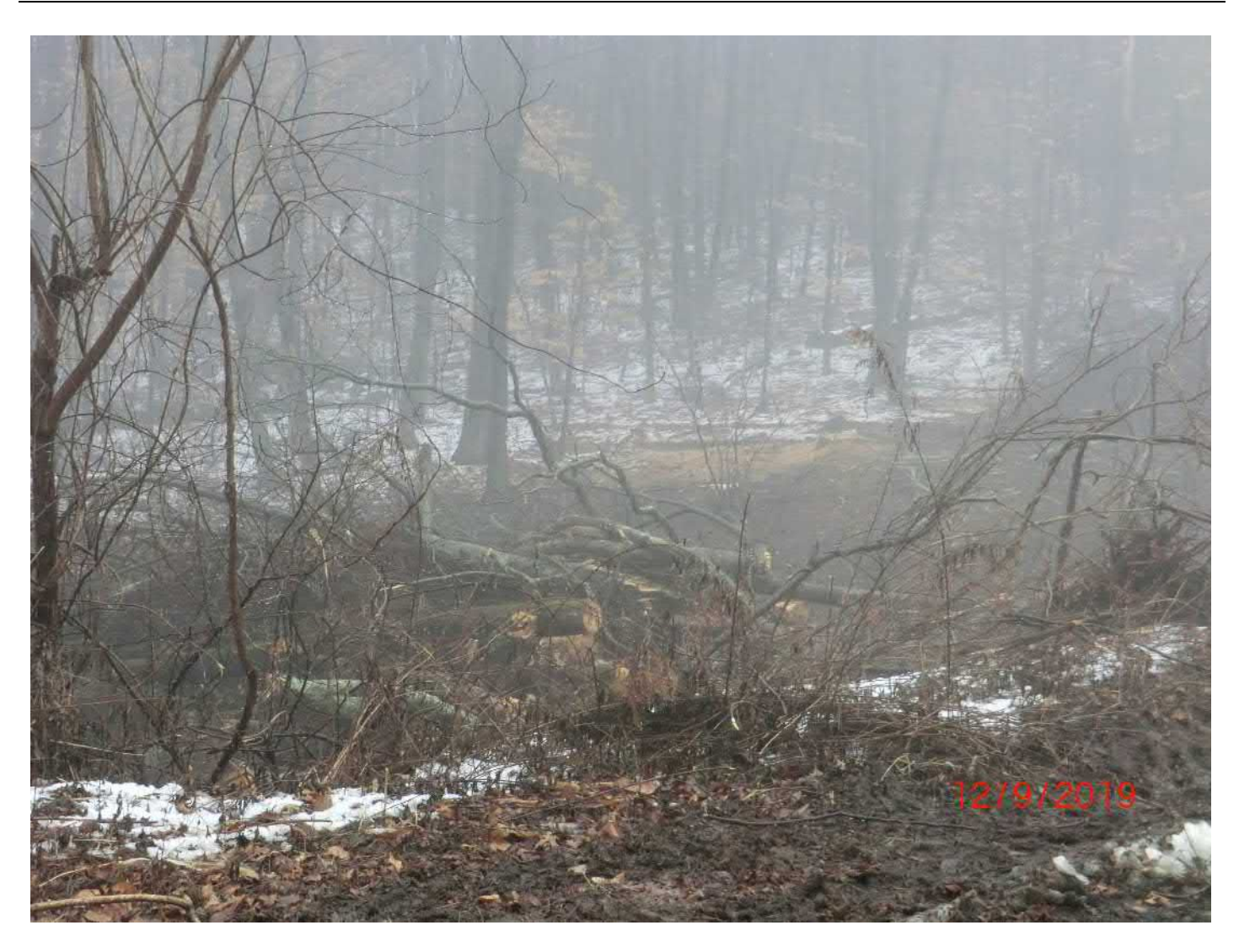
Figure 3 – Cut wood off east side of private drive.