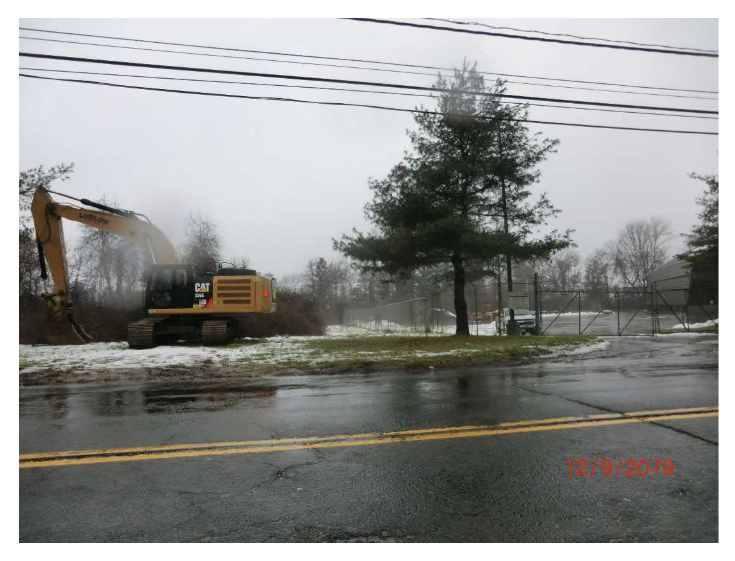
Figure 18 – Large excavator parked south of CT DOT yard.