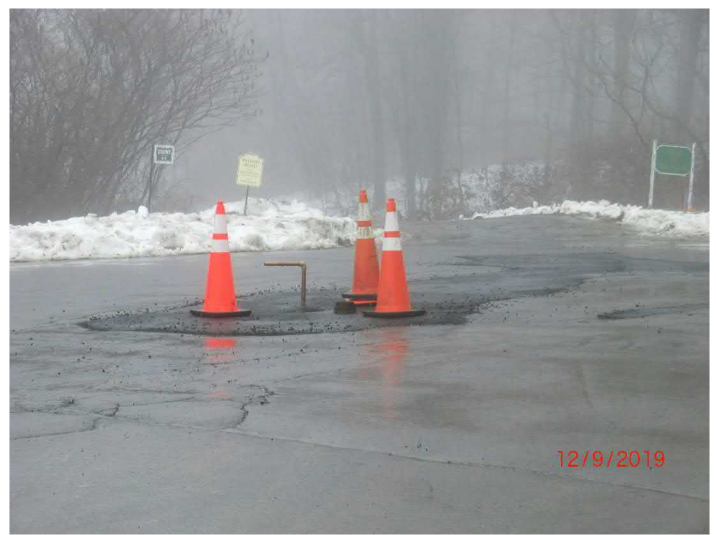
Figure 1 –Looking southeast towards private drive off Talcott Ridge cul-de-sac. Manual 1-inch air vent in open position for filling line.