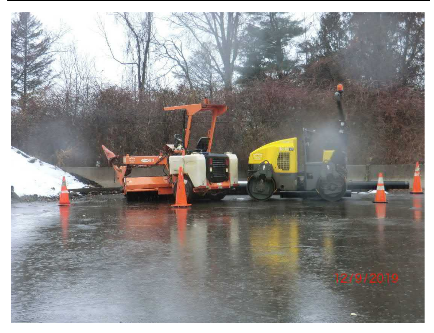
Figure 17 – Equipment located in the CT DOT work yard.