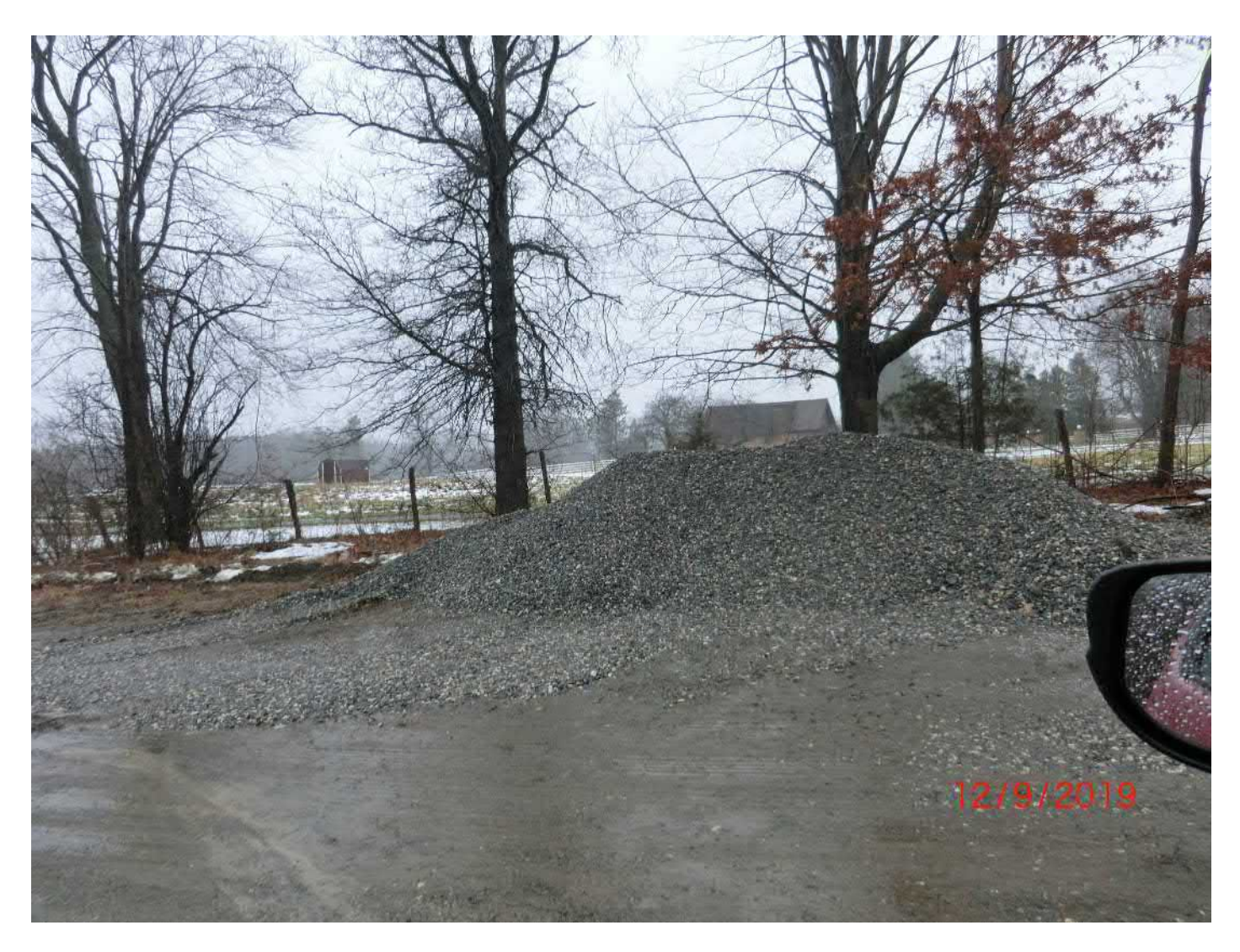
Figure 21 – Gravel pile located across from misc. pipe at 2175 Main St.