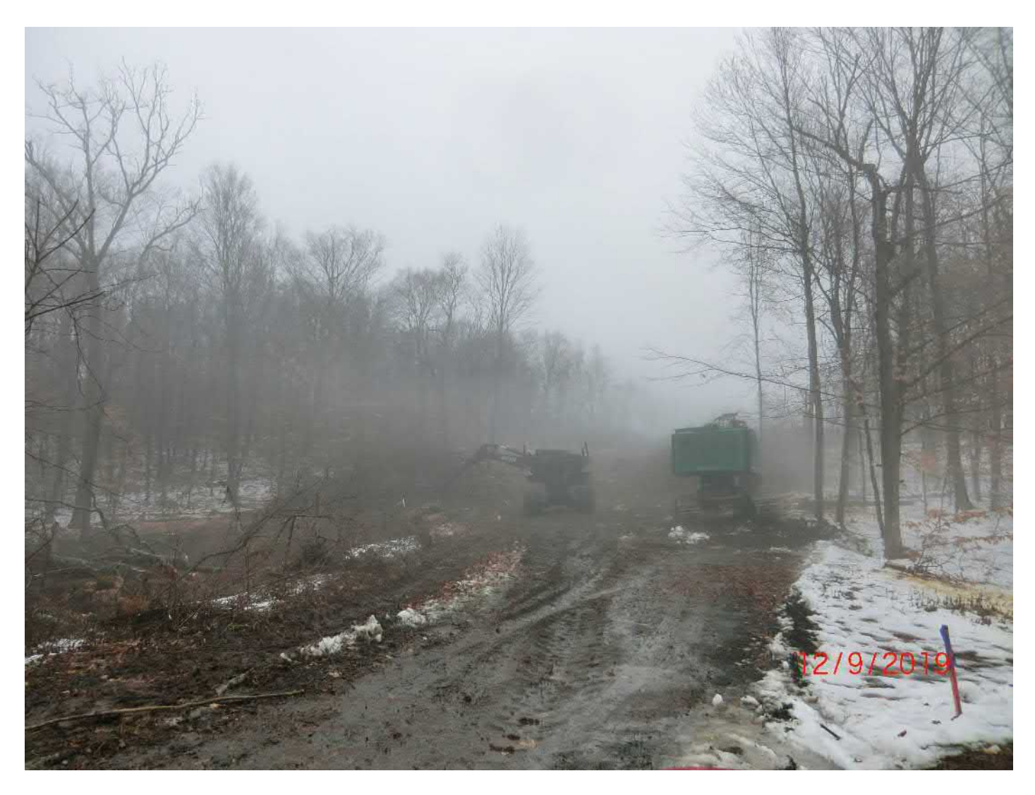
Figure 2 – End of private road, looking southeast. Site clearing rigs.