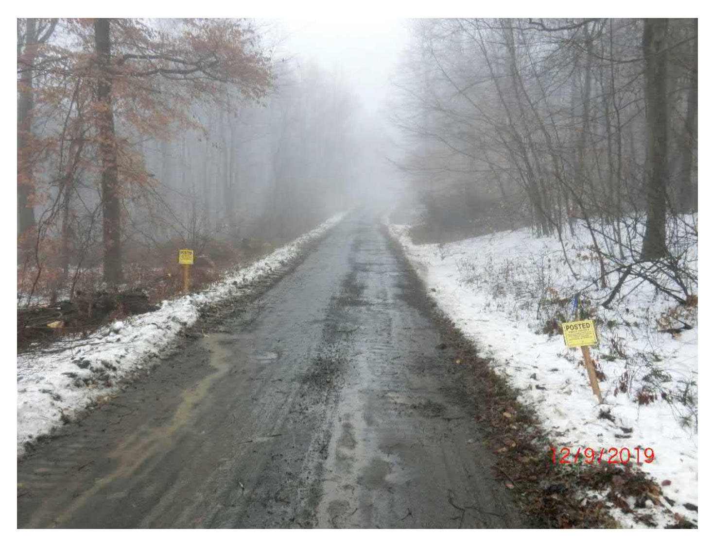
Figure 5 – View southeast from Talcott Ridge cul-de-sac down private drive.