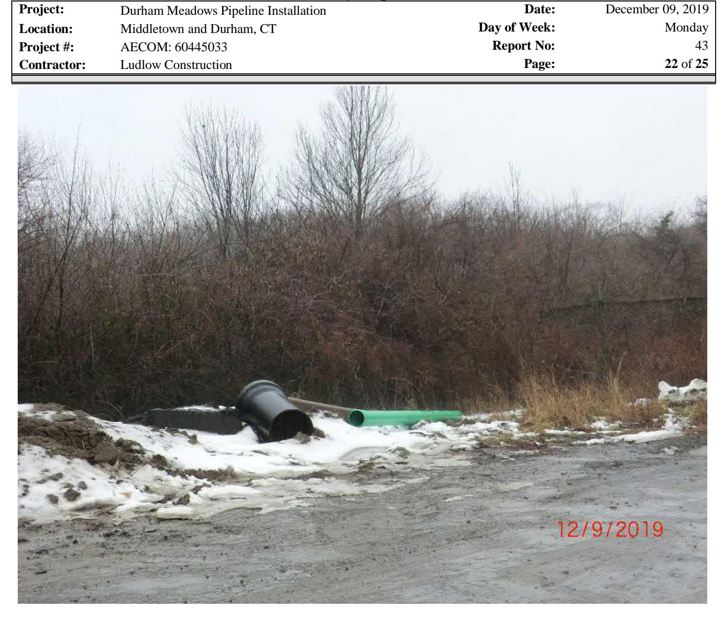
Figure 20 – Misc. pipe section left at turn off at 2175 Main Street (west side of road).