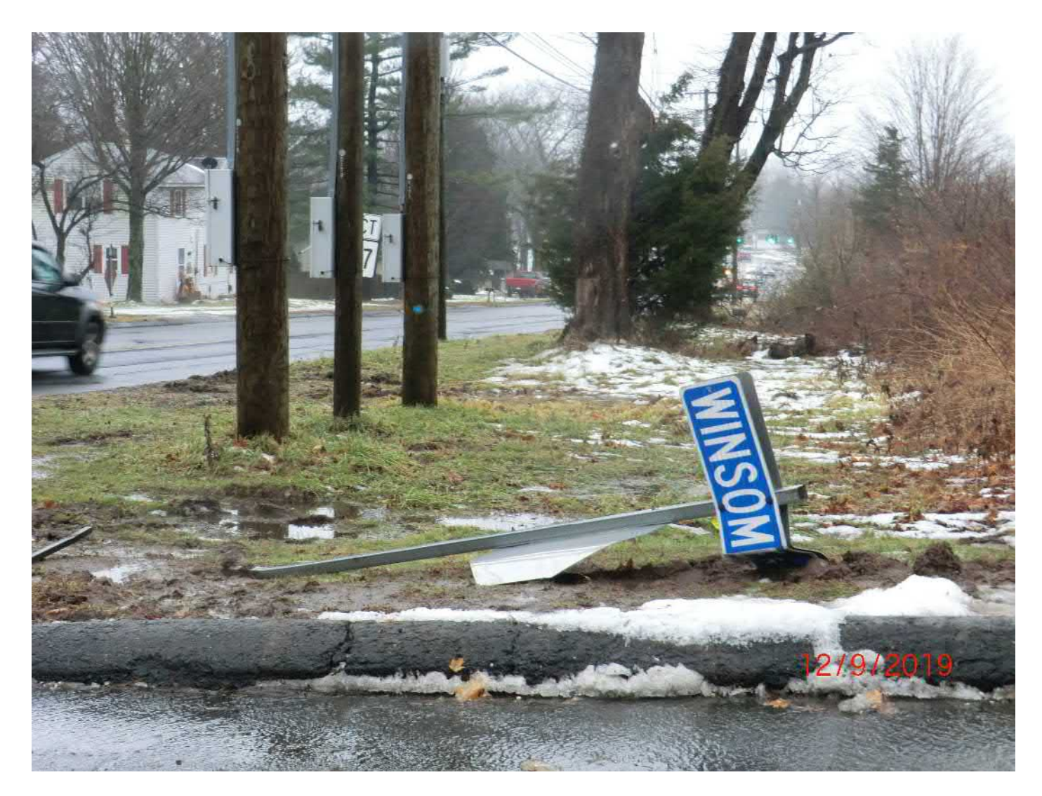
Figure 23 – Winsome Street sign still down.