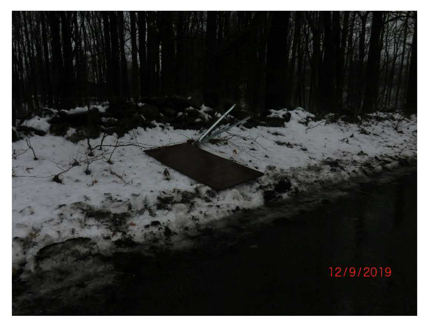
Figure 10 –Sign on side of Parsons Road. From when road was closed for hydrant install (located approximately 200 feet off of Main St.)