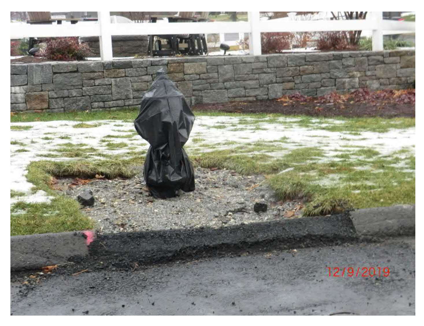
Figure 22 – Hydrant at Winsome St. Main St. to the right.