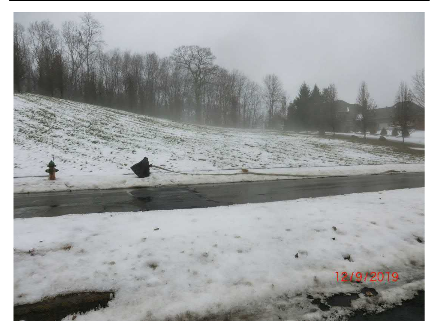
Figure 6 – New hydrant at top of Talcott Ridge. Upper Watch Hill to upper right. Hose attached to new hydrant.