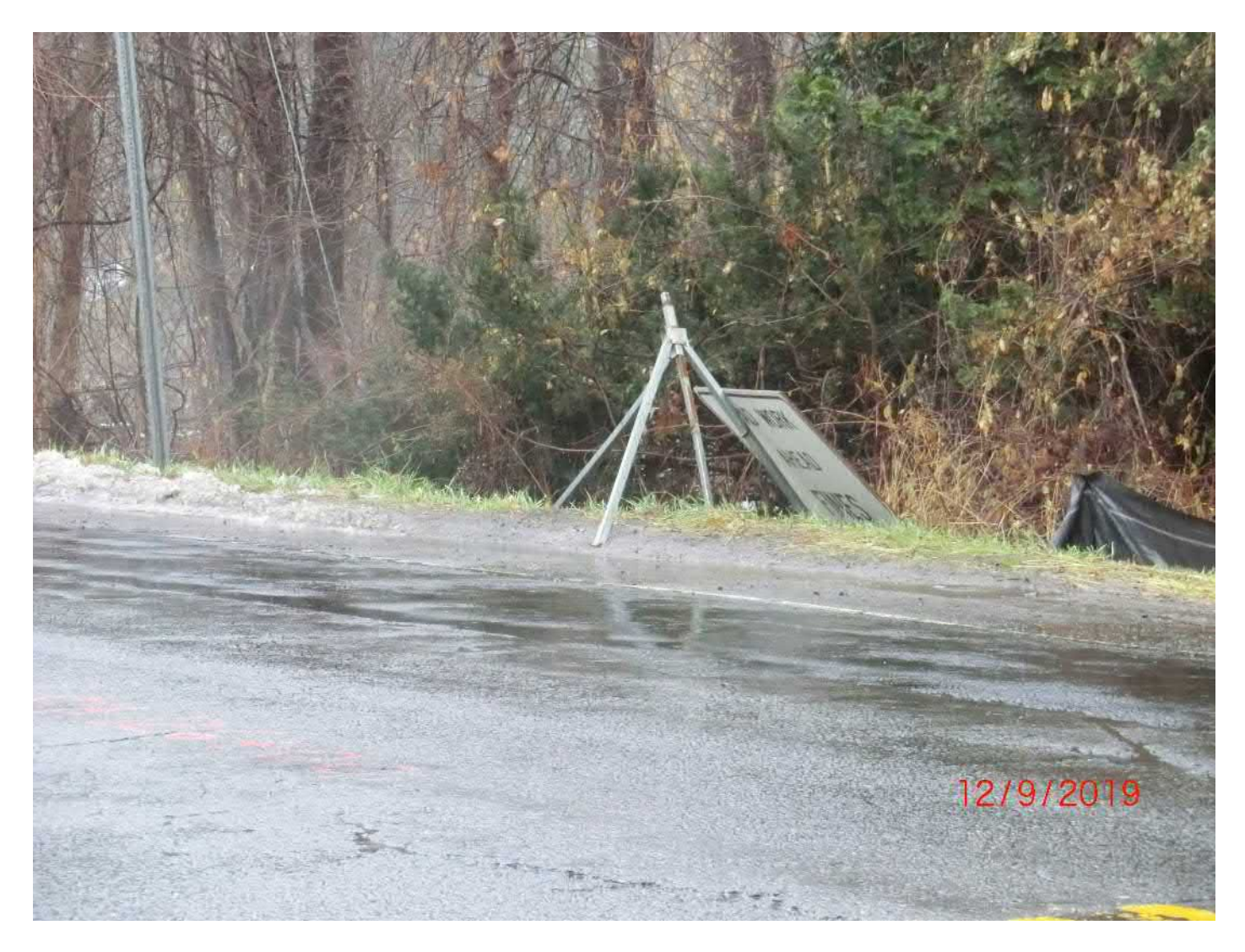
Figure 16 – Road signs along Main Street on west site. One of two, second located further south. Near intersection with Acorn St.