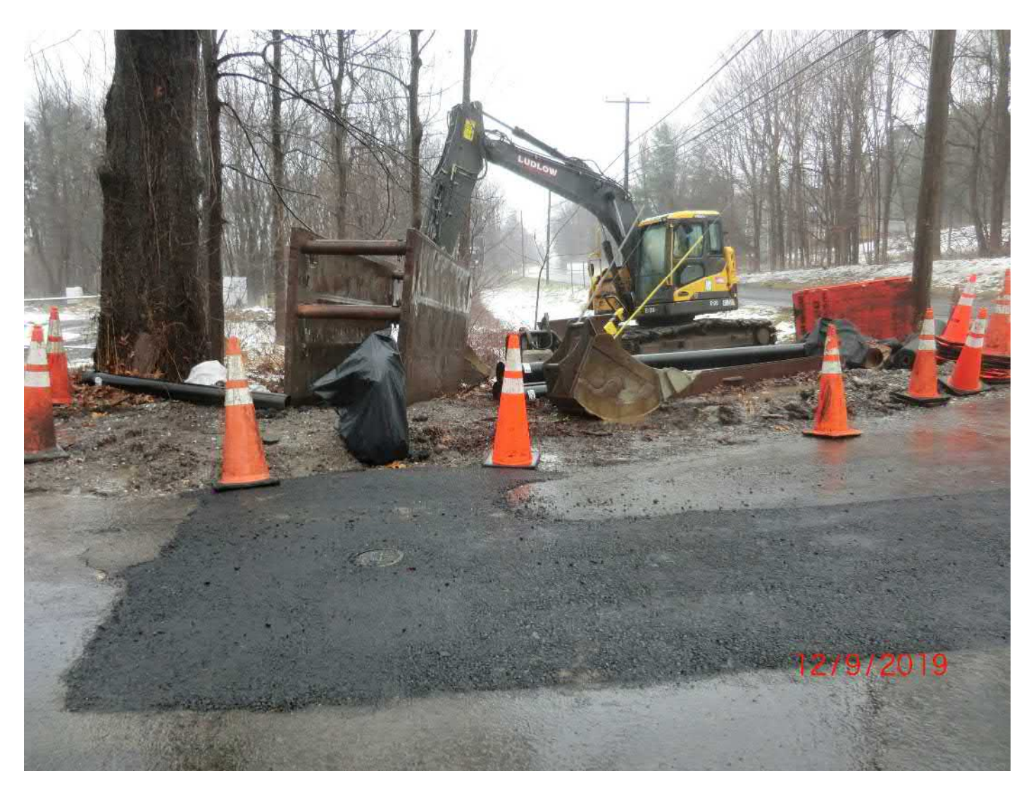
Figure 15 – Facing north, Little Street hydrant.