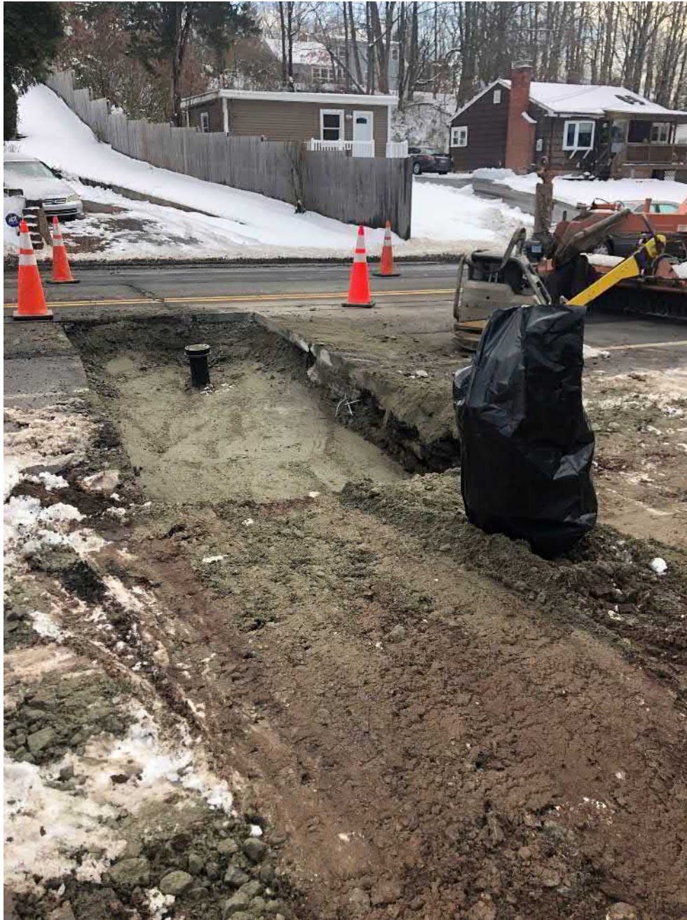
Figure 5 – Valve box installed to cover newly installed valve stem. Station 147+00; view to the east.

Date: December 5, 2019 Day of Week: Thursday Report No: 41 Page: 7 of 11