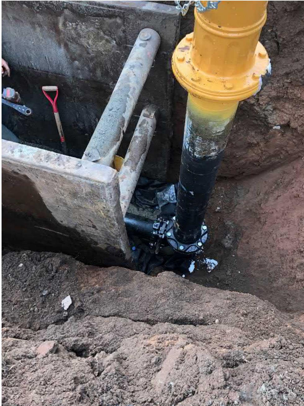
Figure 4 – Hydrant assembly installed at Station 147+00.

Date: December 5, 2019 Day of Week: Thursday Report No: 41 Page: 6 of 11