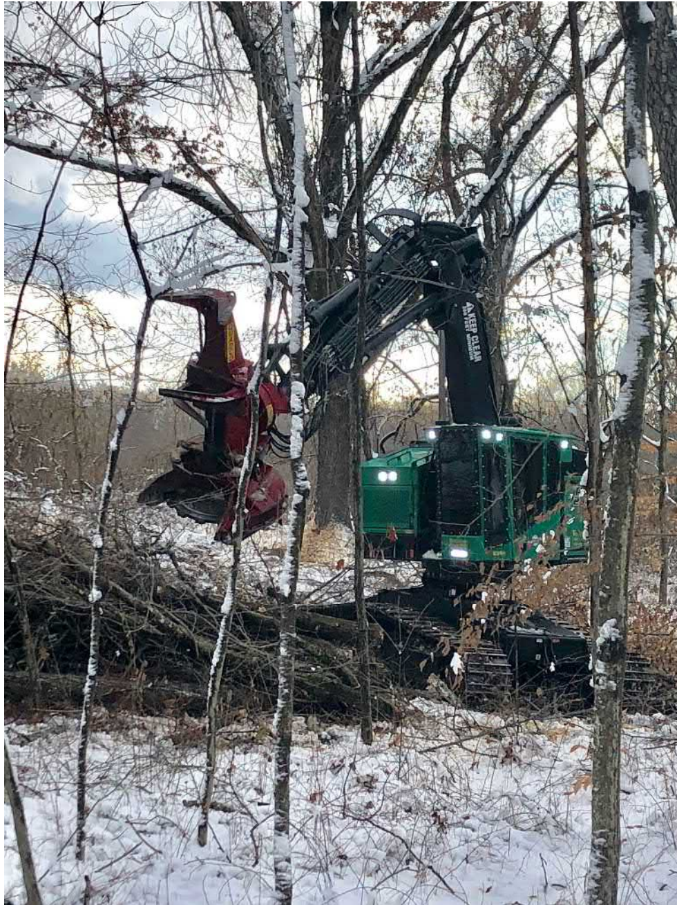
Figure 7 – Ludlow sub Northern Land Clearing beginning to clear the water tank site southeast of the cul-de-sac at the top of Talcott Ridge Drive.