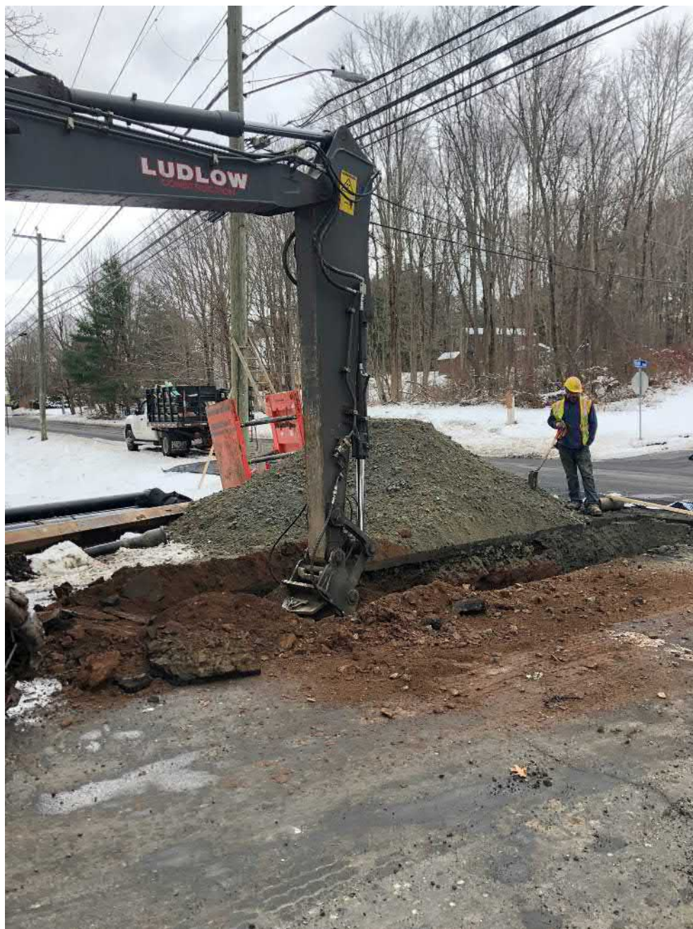
Figure 8 – Ludlow installing hydrant on Little Lane near where it intersects with Route 17. View to the northeast