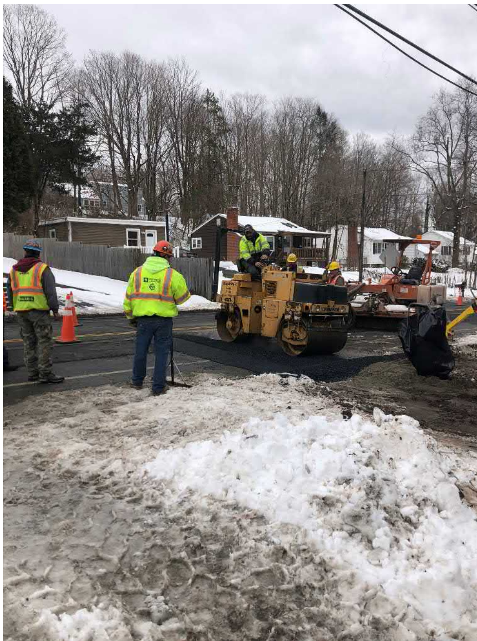
Figure 6 – Rolling second lift of asphalt at Station 147+00; view to the southeast.

Date: December 5, 2019 Day of Week: Thursday Report No: 41 Page: 8 of 11