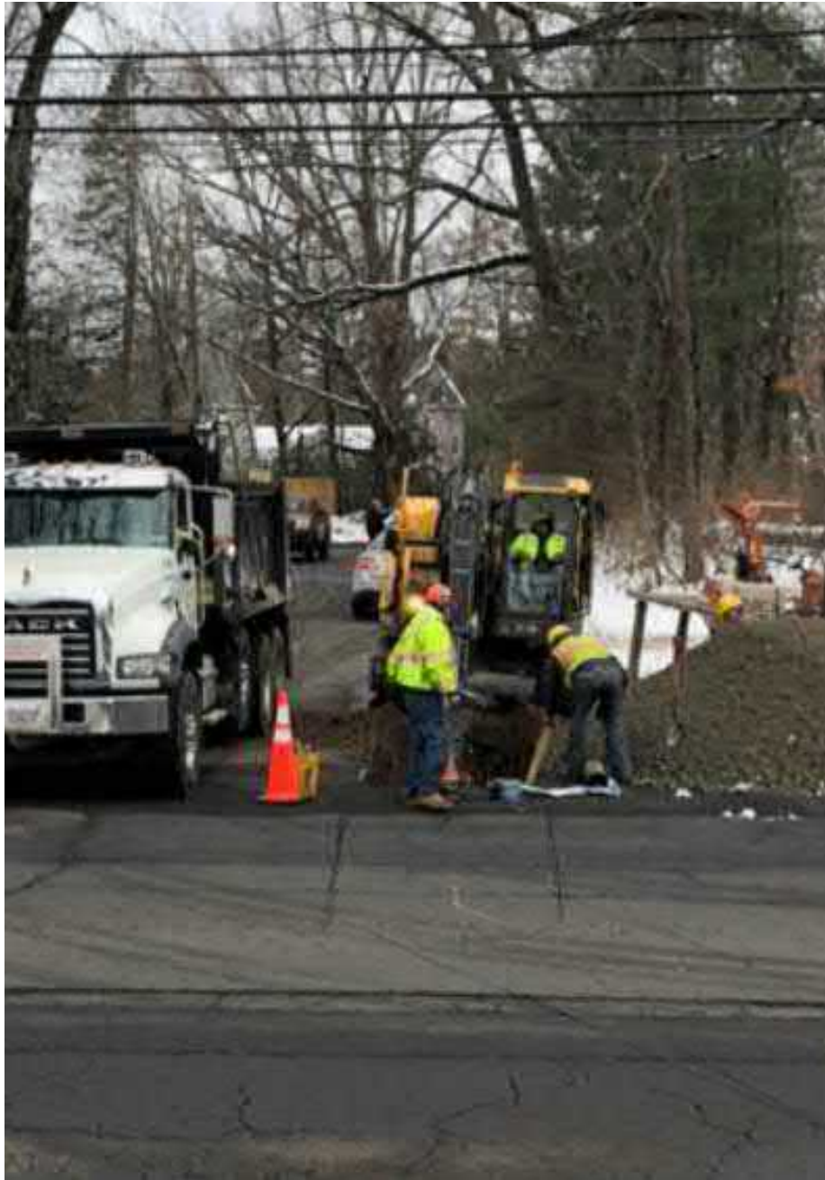
Figure 9 – Ludlow installing hydrant on Little Lane near where it intersects with Route 17. View to the west.