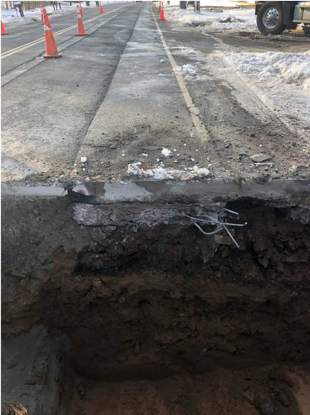
Figure 2 – Reinforced concrete located beneath asphalt on Route 17. View to the south.