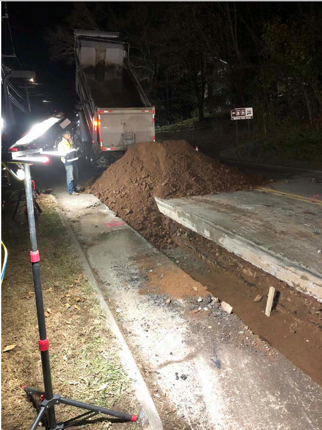
Figure 2 – Native backfill pile dumped at Sta. 143+17