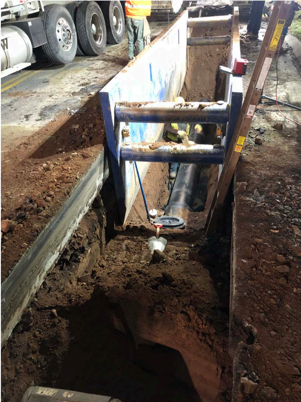
Figure 3 – Attaching 3 rd pipe section

Date: November 6, 2019 Day of Week: Wednesday Report No: 25 Page: 5 of 6