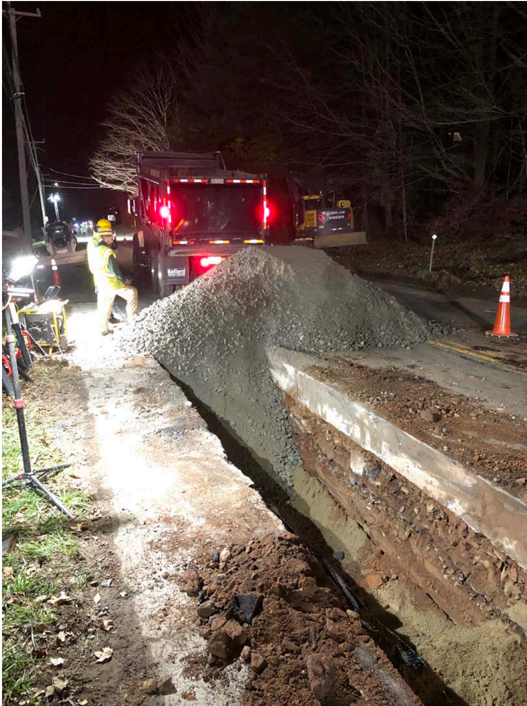
Figure 2 –Backfill pile at Sta. 139+52