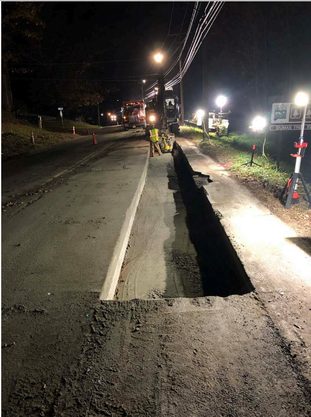
Figure 4 – Compacted top backfill layer