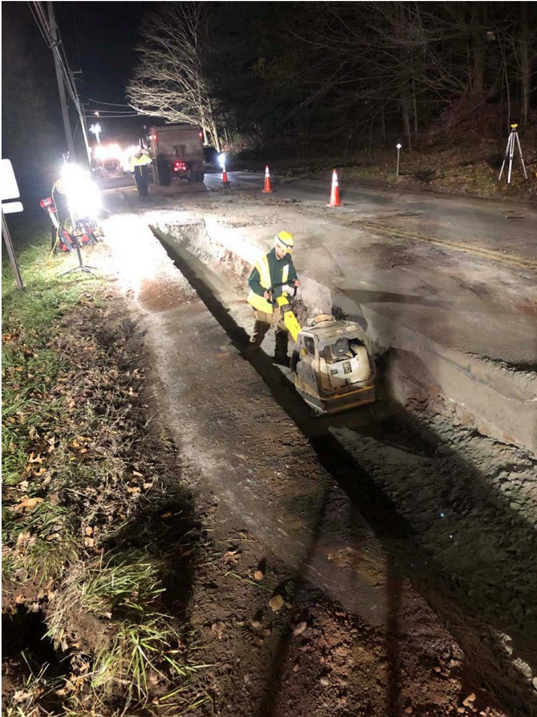
Figure 3 – Compacting 1 st fill lift over 1 st -2 nd pipe sections