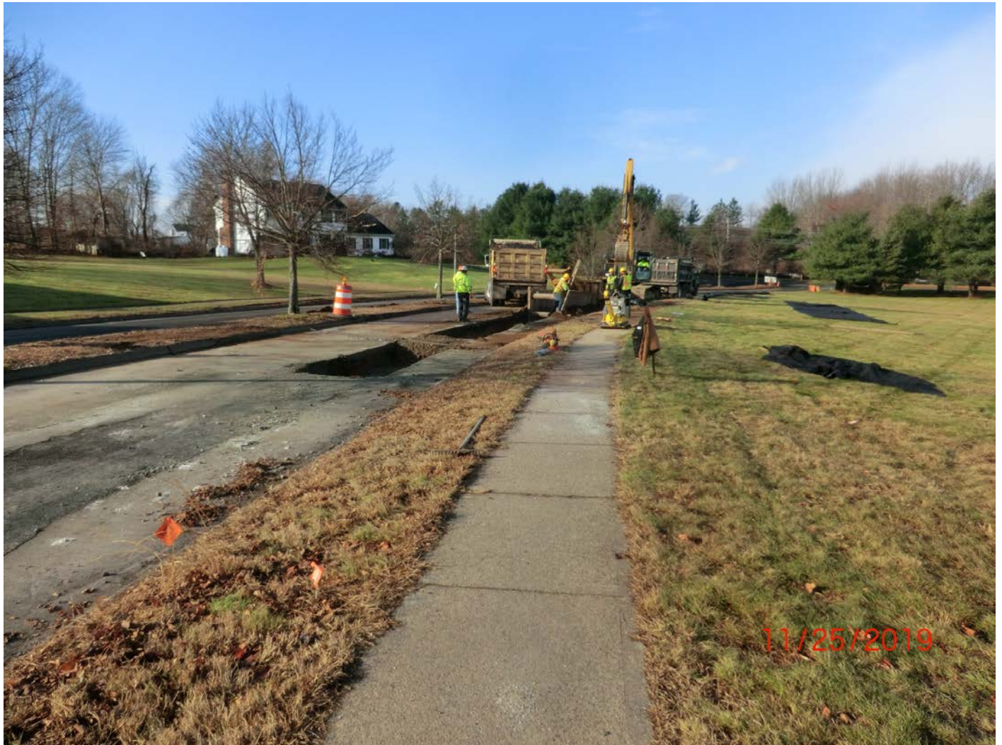
Figure 2 – Facing southwest. Morning progress.