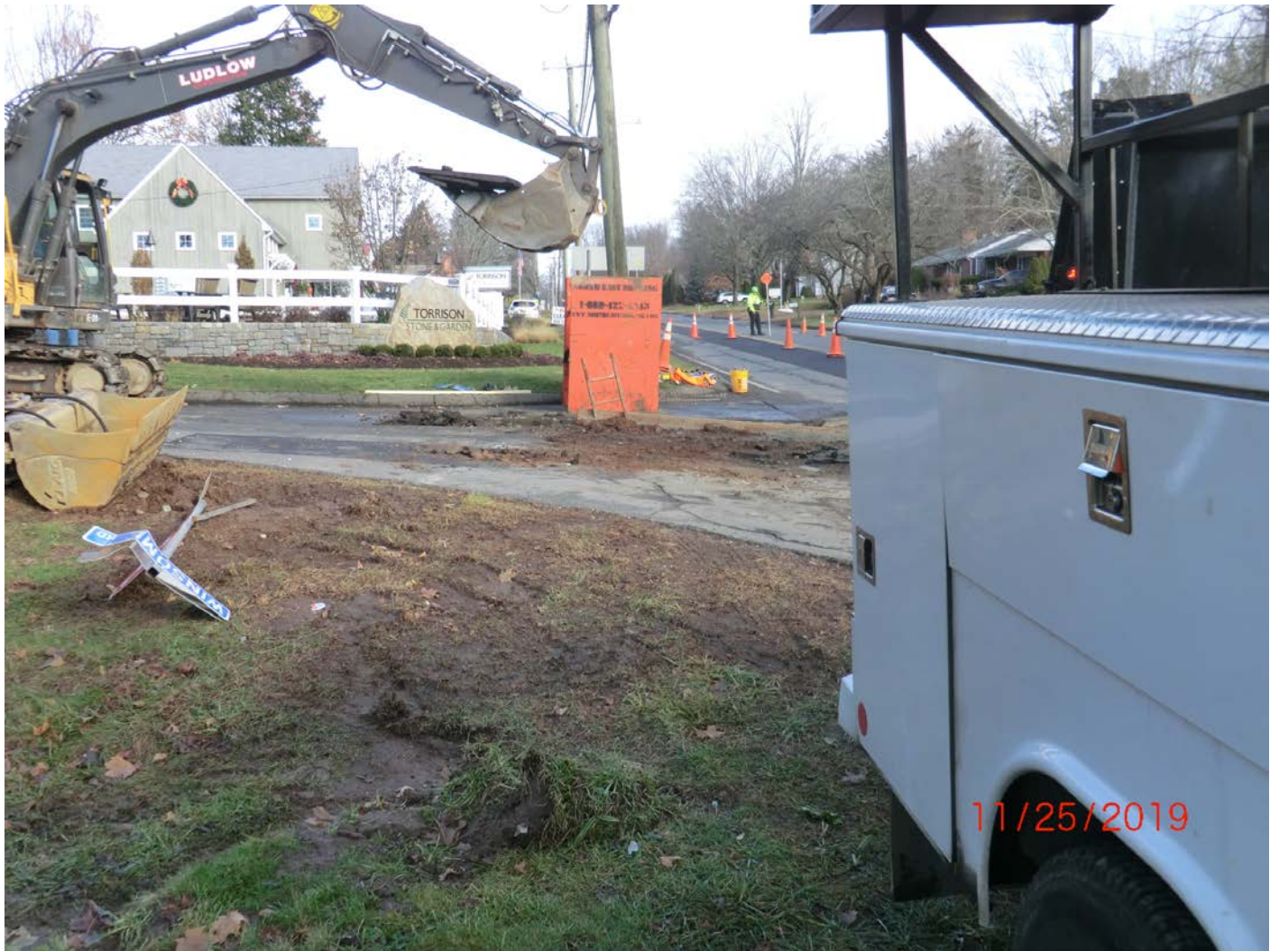
Figure 4 – Facing north on Main Street at Winsome Rd. Trenching off main line to extent 8” hydrant line. Note mangled road and stop sign to left of picture.