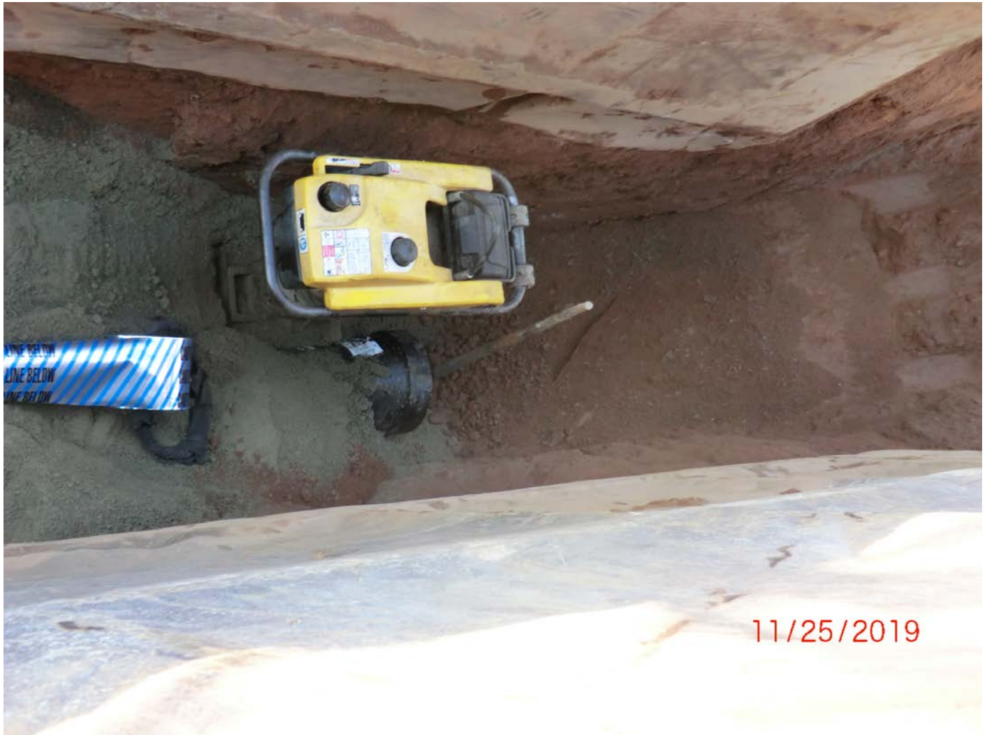
Figure 3 – 8" DIP – restrained bell at Talcott Ridge Drive.