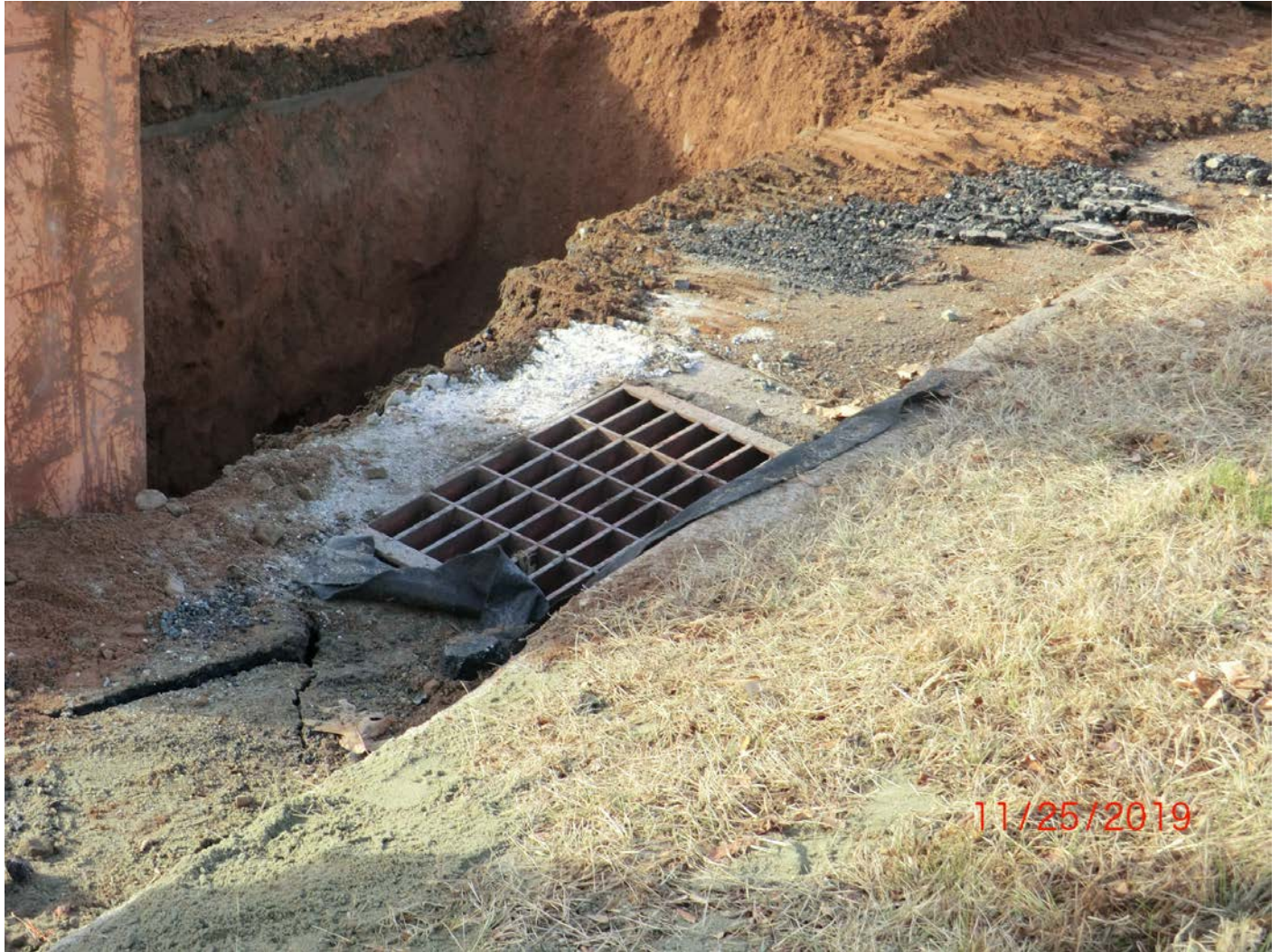
Figure 11 – Close cutting to catch basin on Talcott Ridge. Asphalt around basin broken entirely during removal of trench box. Will need repair during permanent pavement repair.