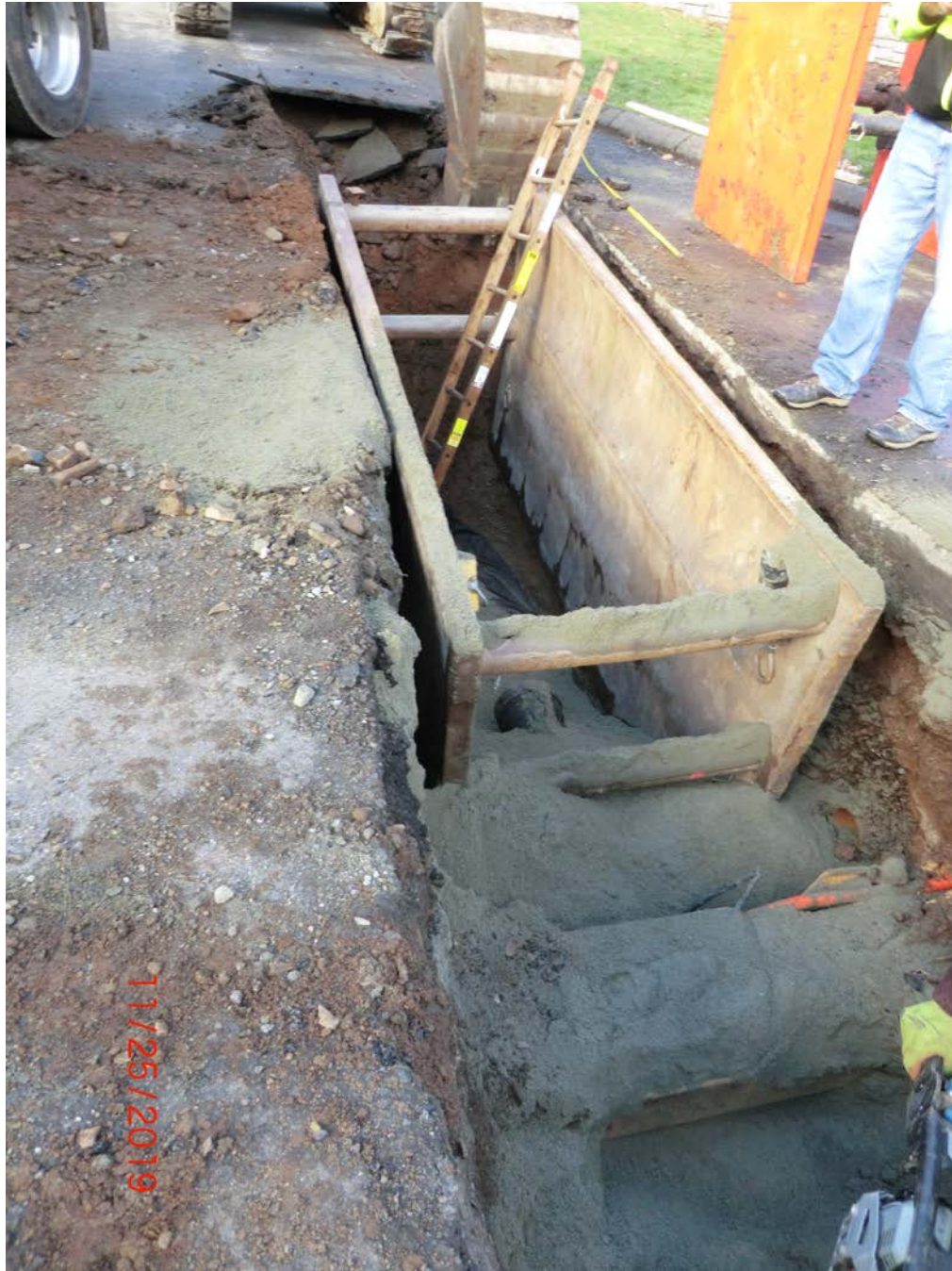
Figure 6 – View of telephone conduit clay pipe – front right corner of picture. This conduit was later broken and an air-line ruptured. Also note 6” drain pipe on right wall between trench box and conduit. This is to be repaired using Fernco couplings. Upon closer inspection, it appears that the air-line had already been broken at this point – note black tube next to orange conduit line.