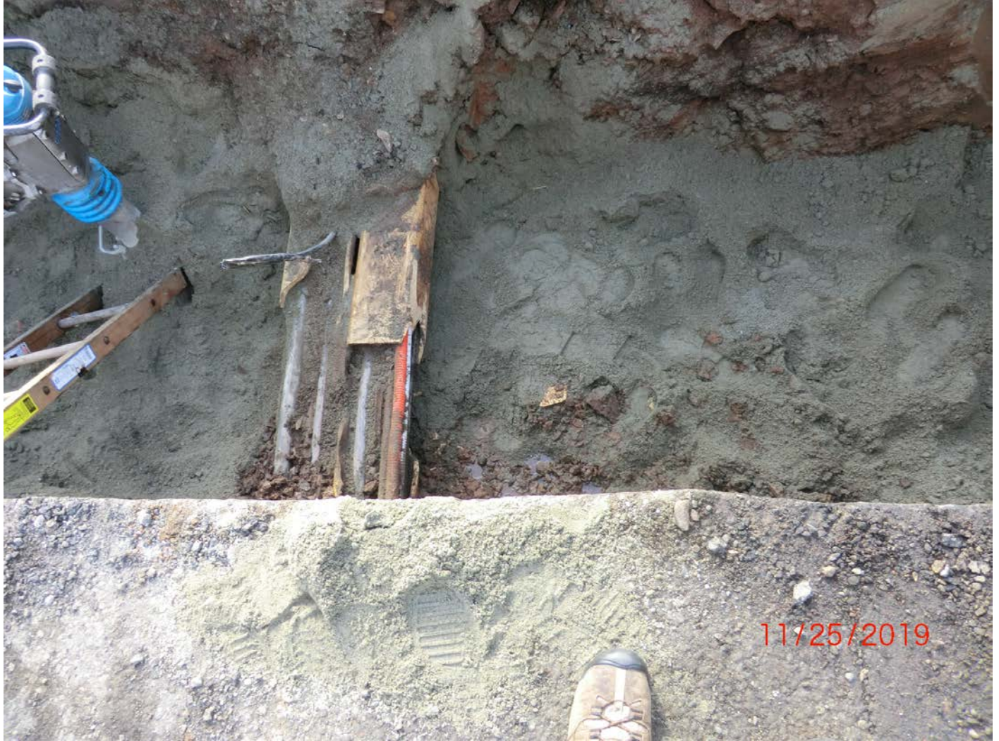
Figure 7 – Another view of the conduit taken later in the morning. Note that the clay conduit has been further broken and the broken air-line is more visible.