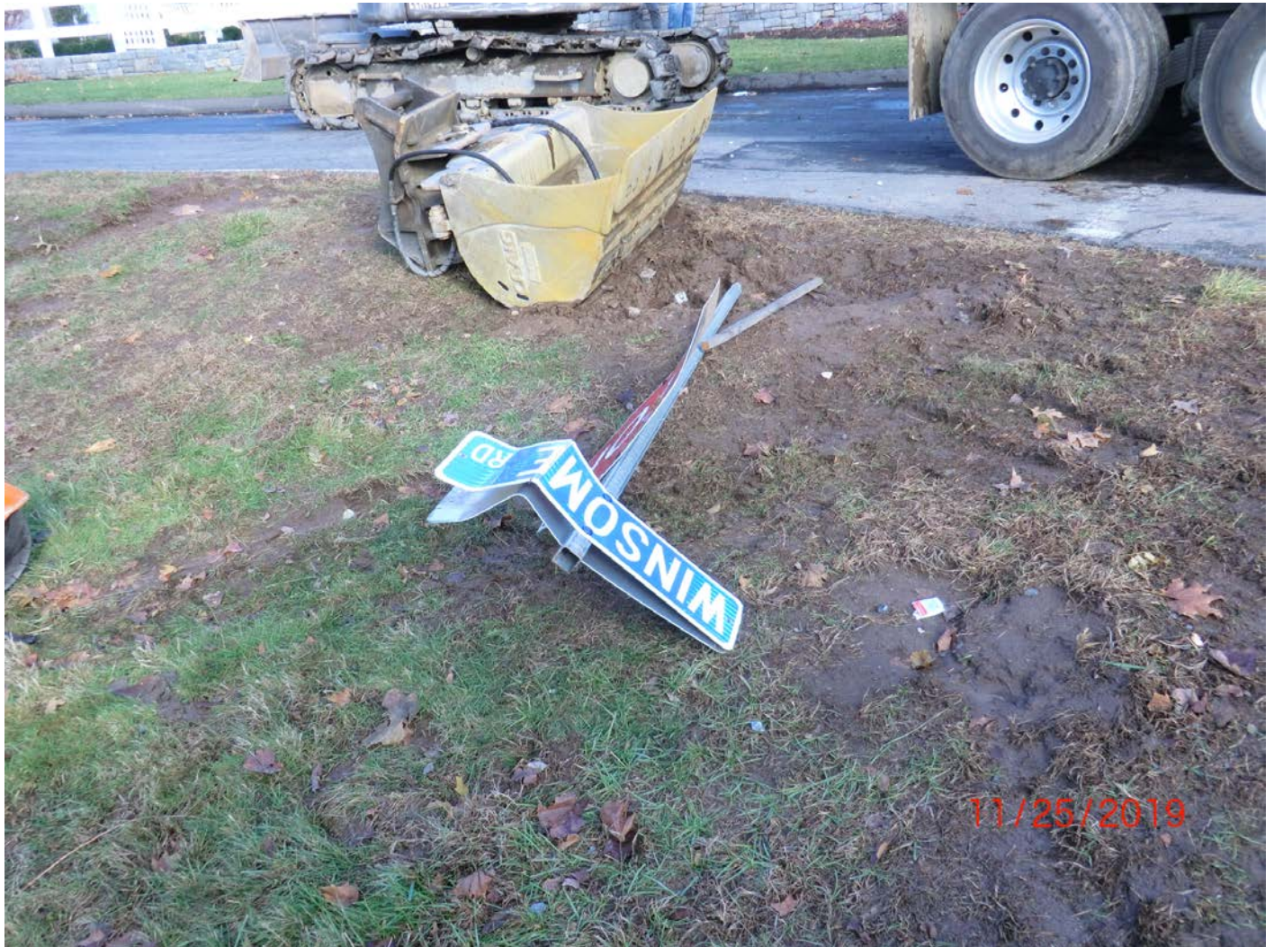
Figure 5 – Damaged Street Sign.