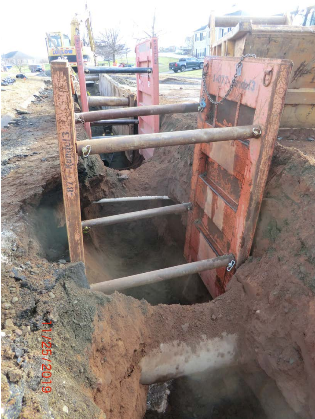
Figure 12 – Only utilities crossed on Talcott Ridge today. Electrical conduit in background, drain pipe in foreground. Facing east.