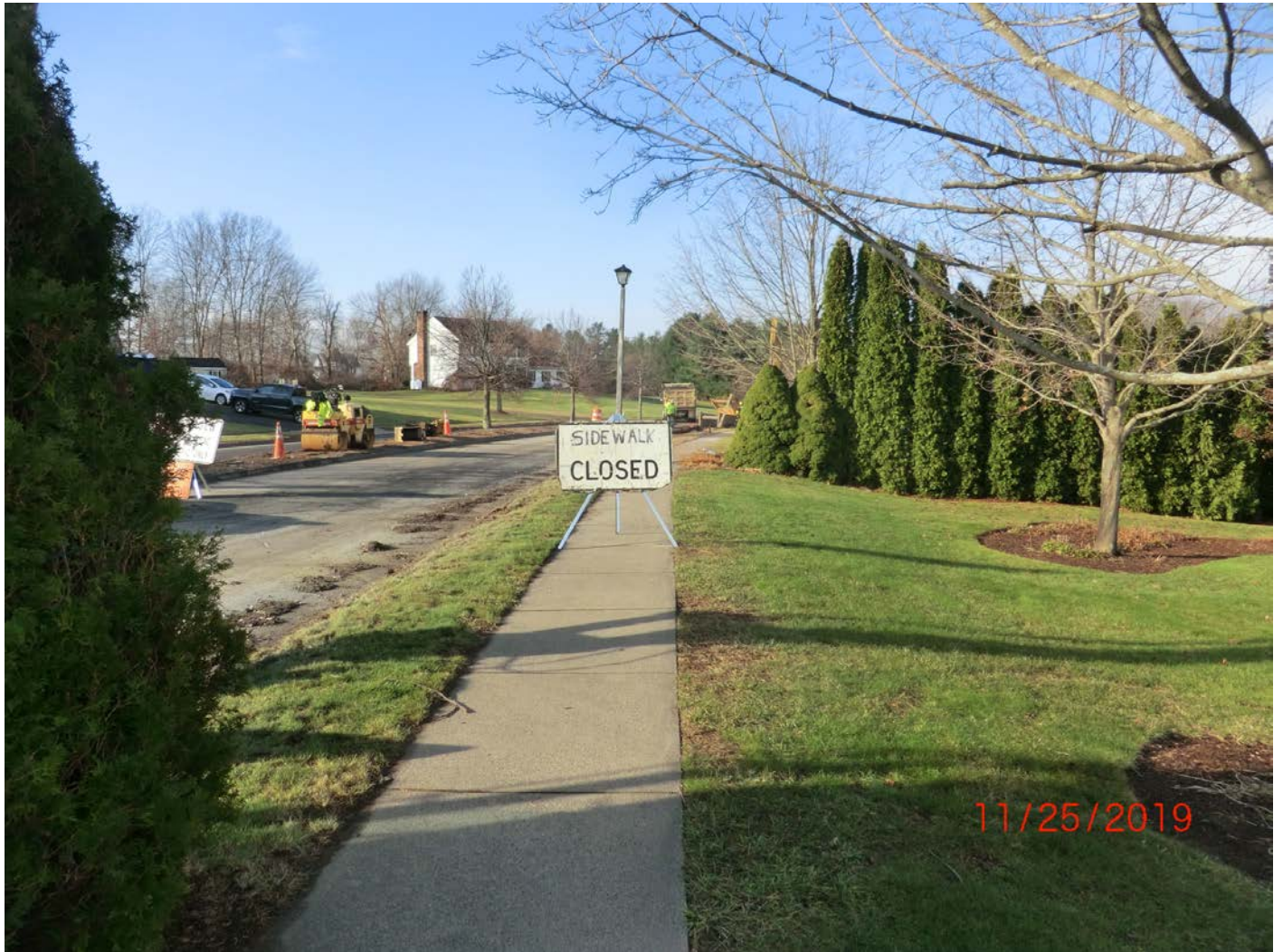
Figure 1 –Facing west from intersection of lower Watch Hill and Talcott Ridge.