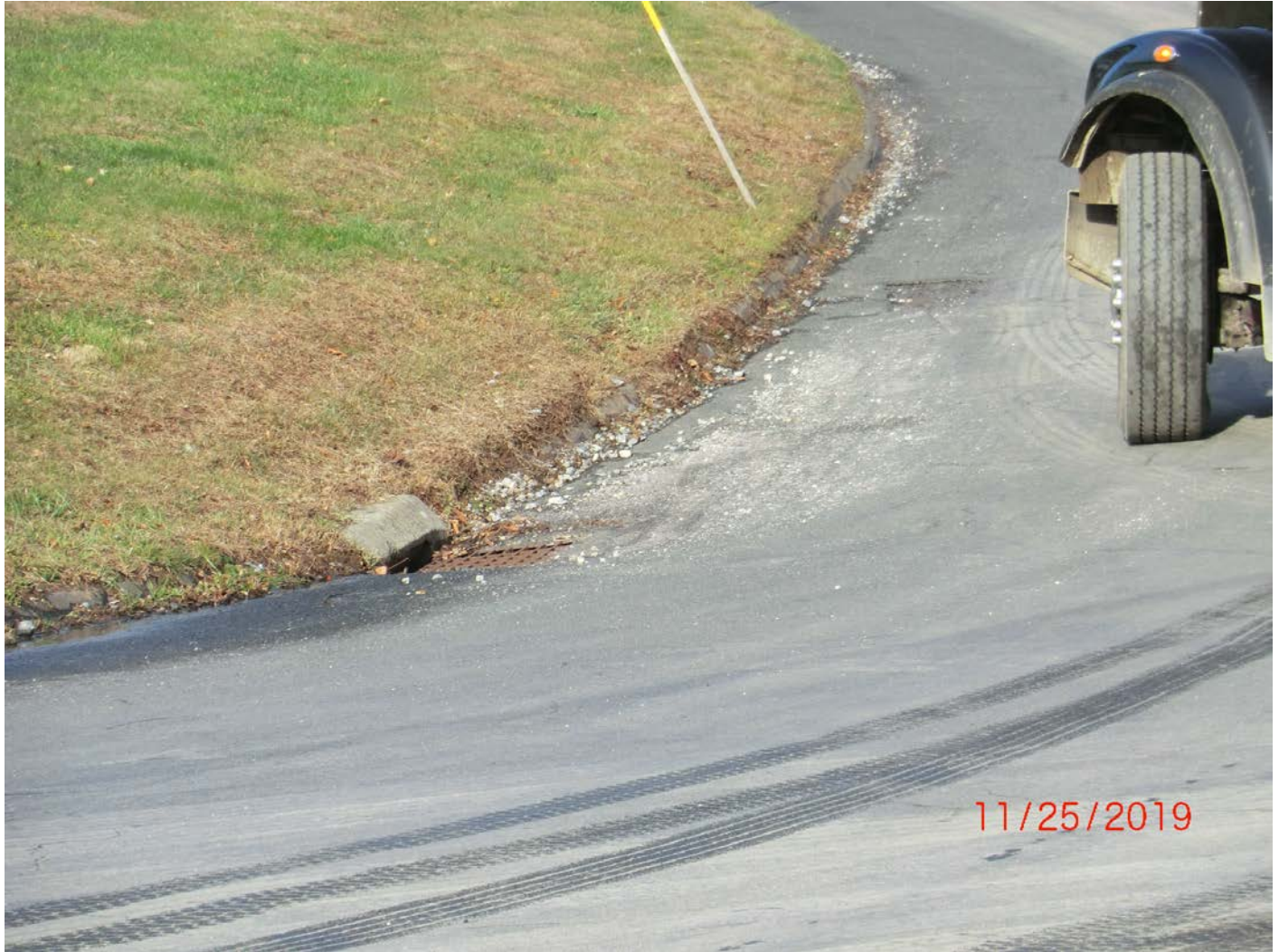
Figure 10 – Gravel collecting on road out side of haul site entrance.