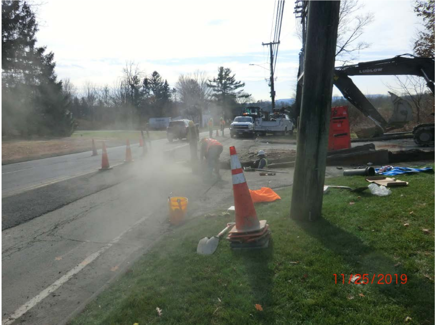
Figure 9 – Facing south on Main St. Cutting a section of road in order to excavate the conduit further to allow for Frontier to access and fix break.