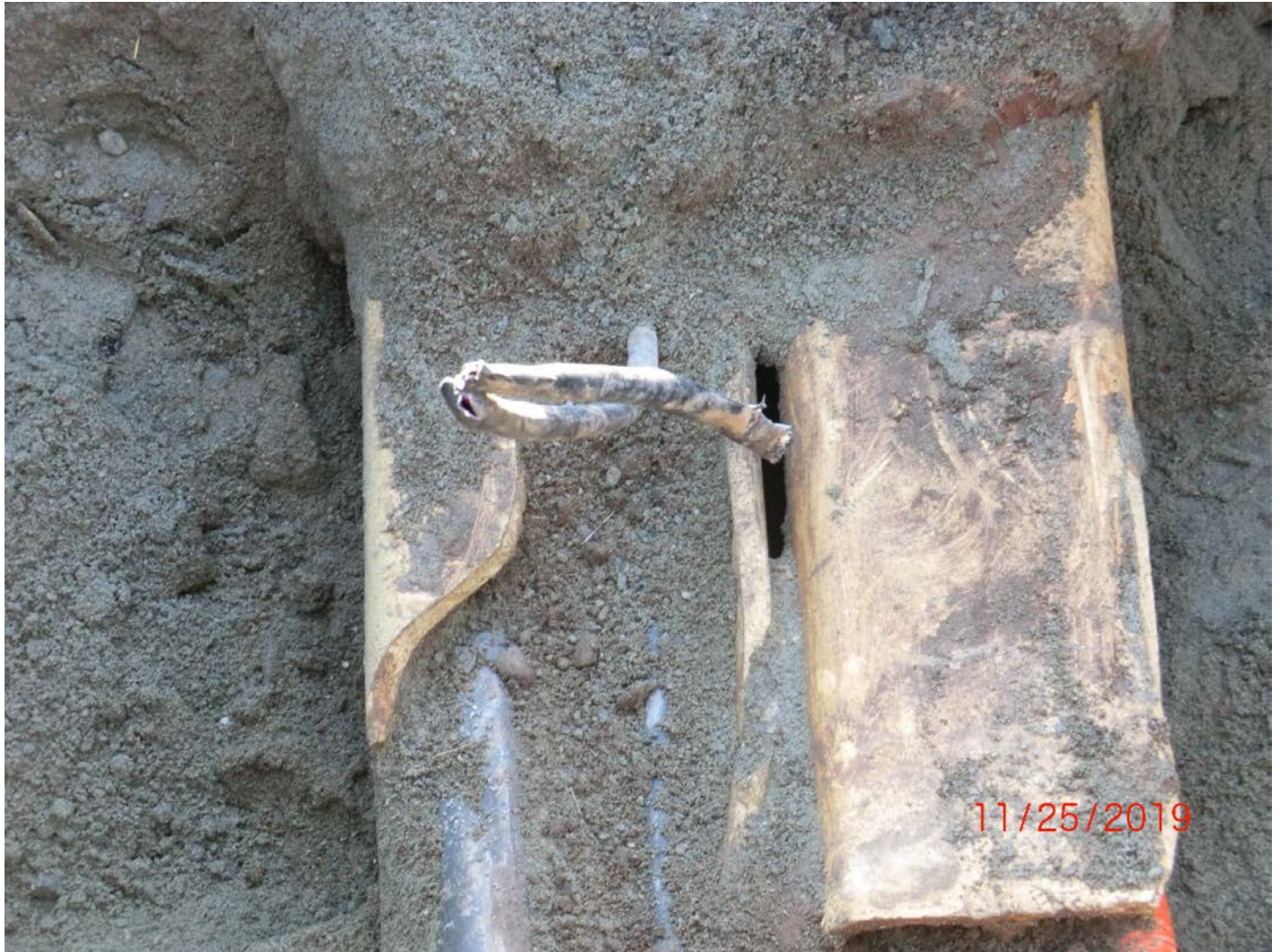
Figure 8 – Broken air-line.