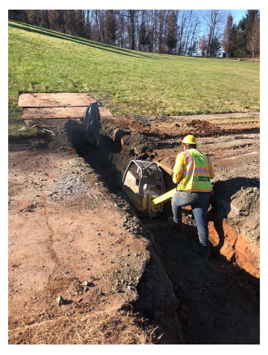
Figure 9 – Ludlow compacting 3" minus gravel backfill.