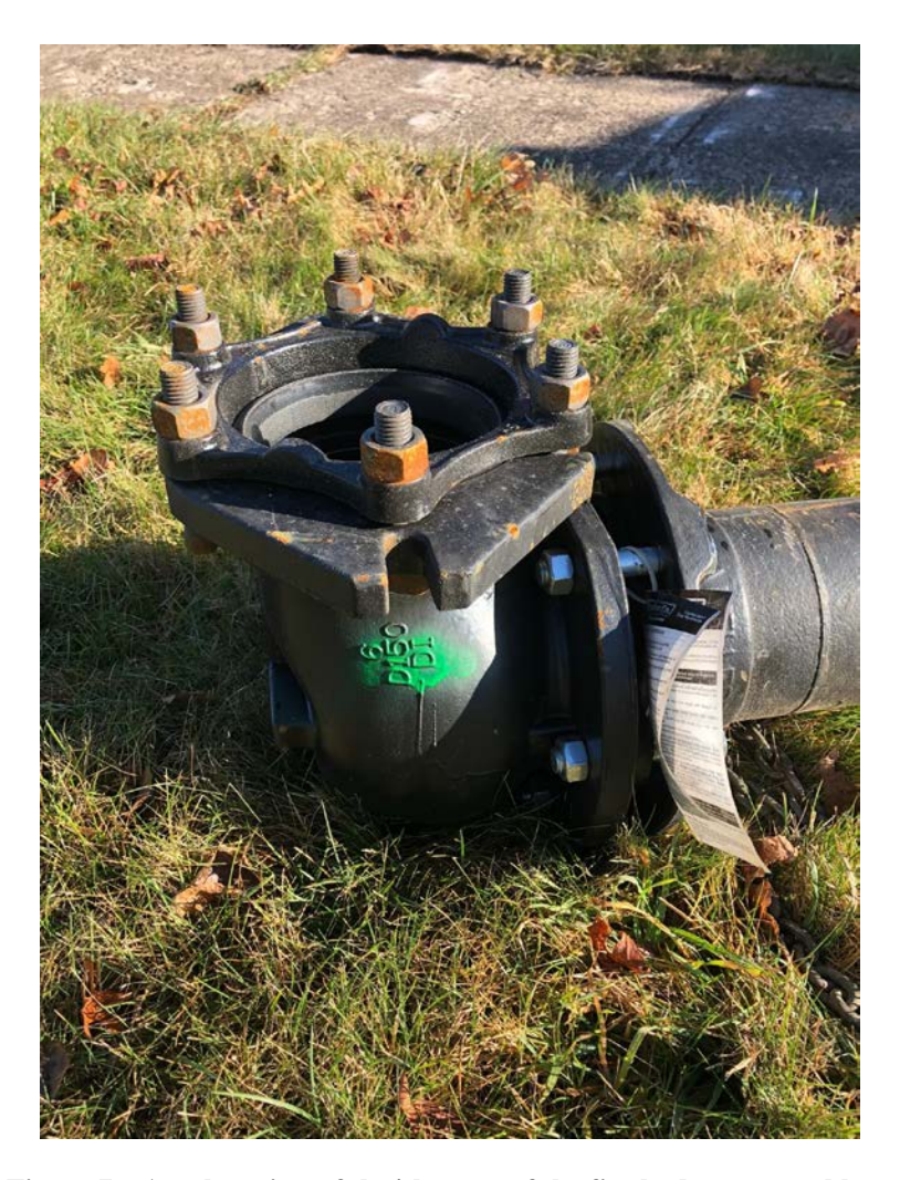
Figure 7 – Another view of the \ bottom of the fire hydrant assembly.