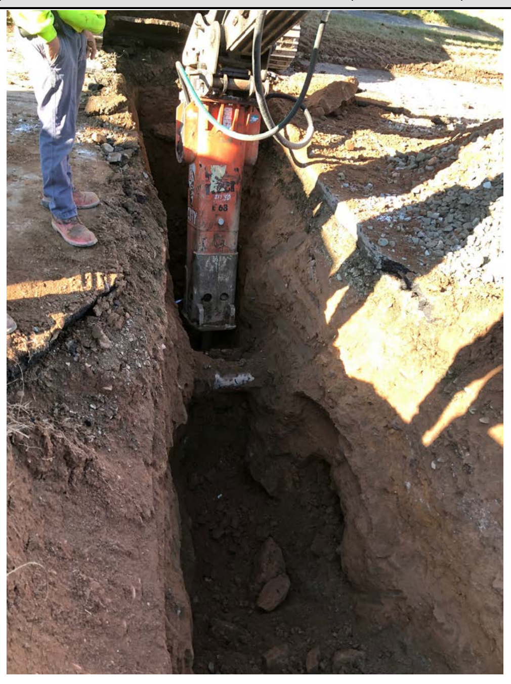
Figure 4 – Ludlow exposes an existing 8" water line that runs beneath the western (southbound) lane of Talcott Ridge Drive. View to the west.

Project:Durham Meadows Pipeline InstallationDate:November 21, 2019Location:Talcott Ridge Drive, Middletown CTDay of Week:ThursdayProject #:AECOM: 60445033Report No:35Contractor:Ludlow ConstructionPage:6 of 11