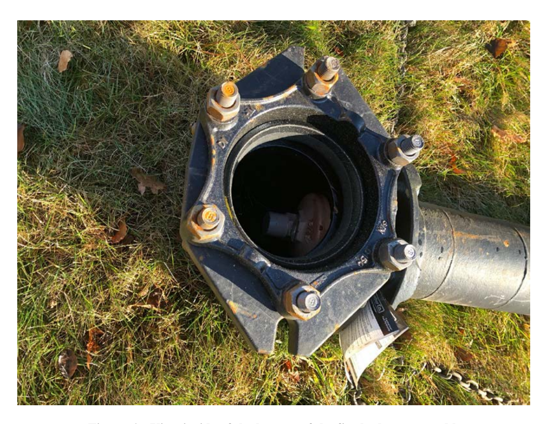
Figure 6 – View inside of the bottom of the fire hydrant assembly.