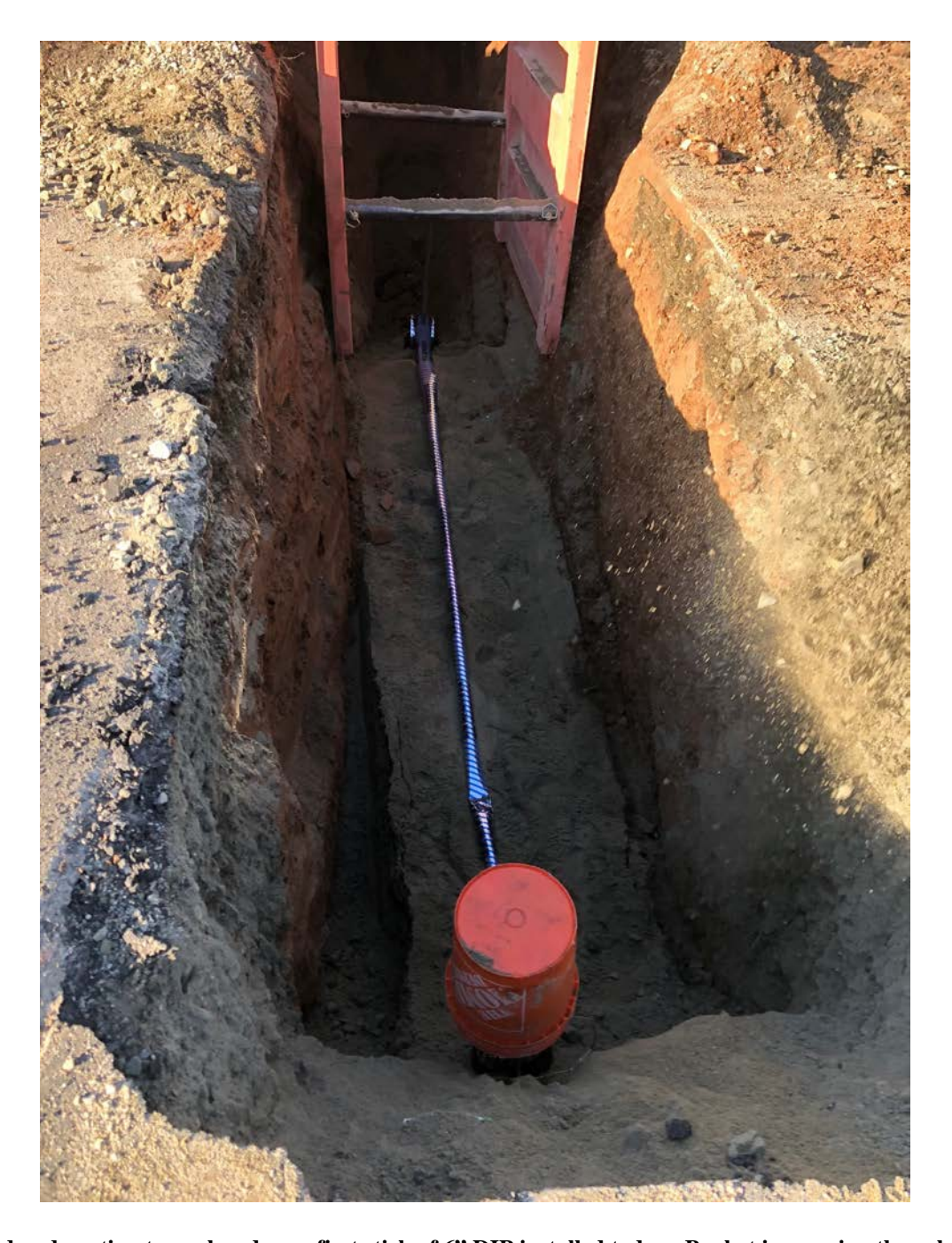
Figure 3 – Sand and caution tape placed over first stick of 6" DIP installed today. Bucket is covering the valve stem and riser that Ludlow placed on the valve located on the run of 16" DIP that Ludlow recently placed on the east side of the northbound lane of Talcott Ridge Drive. View to the west.