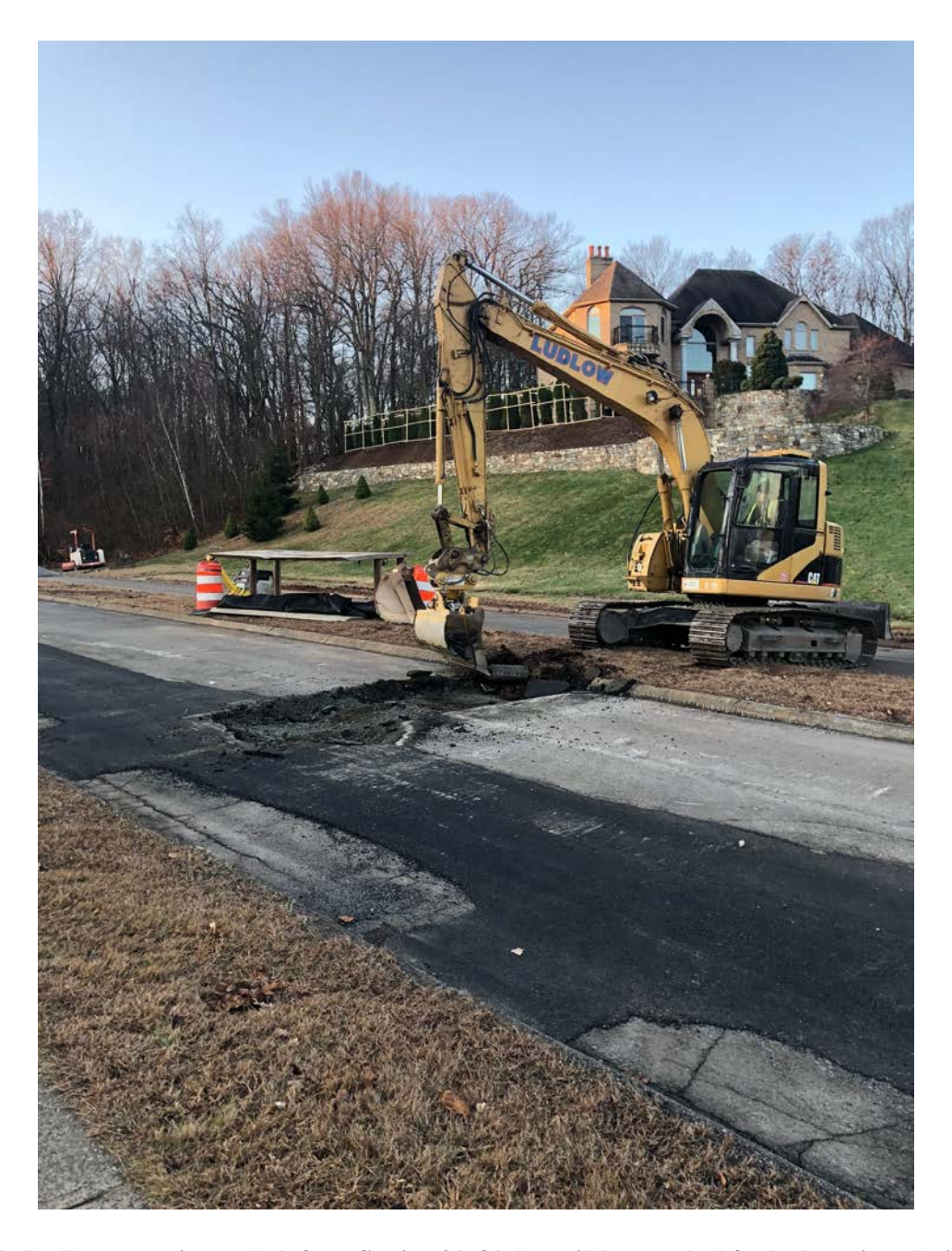
Figure 1 –Ludlow removing asphalt from Station 31+81 that will be trenched for hydrant installation.