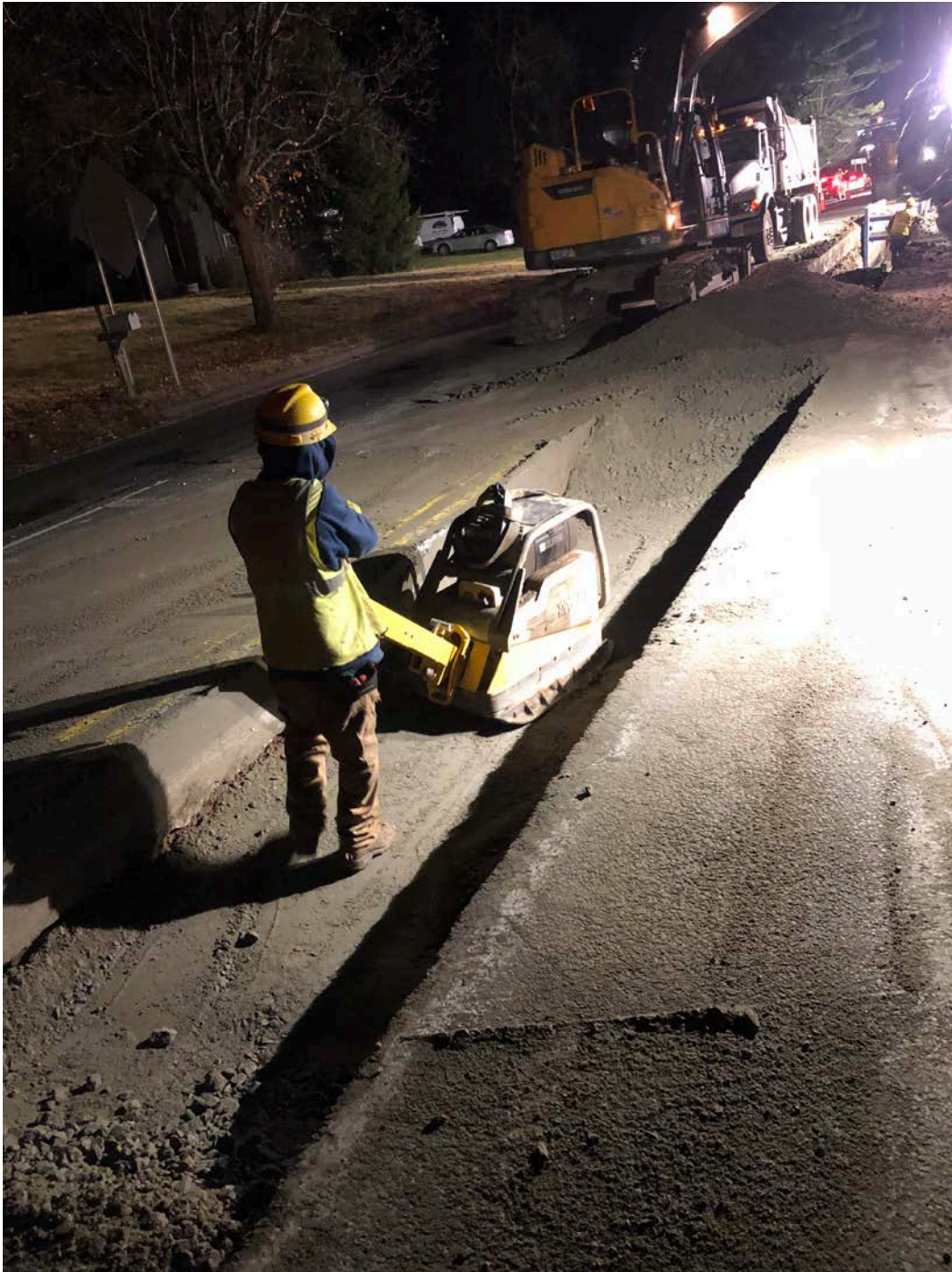
Figure 3 – Compacting backfill lift