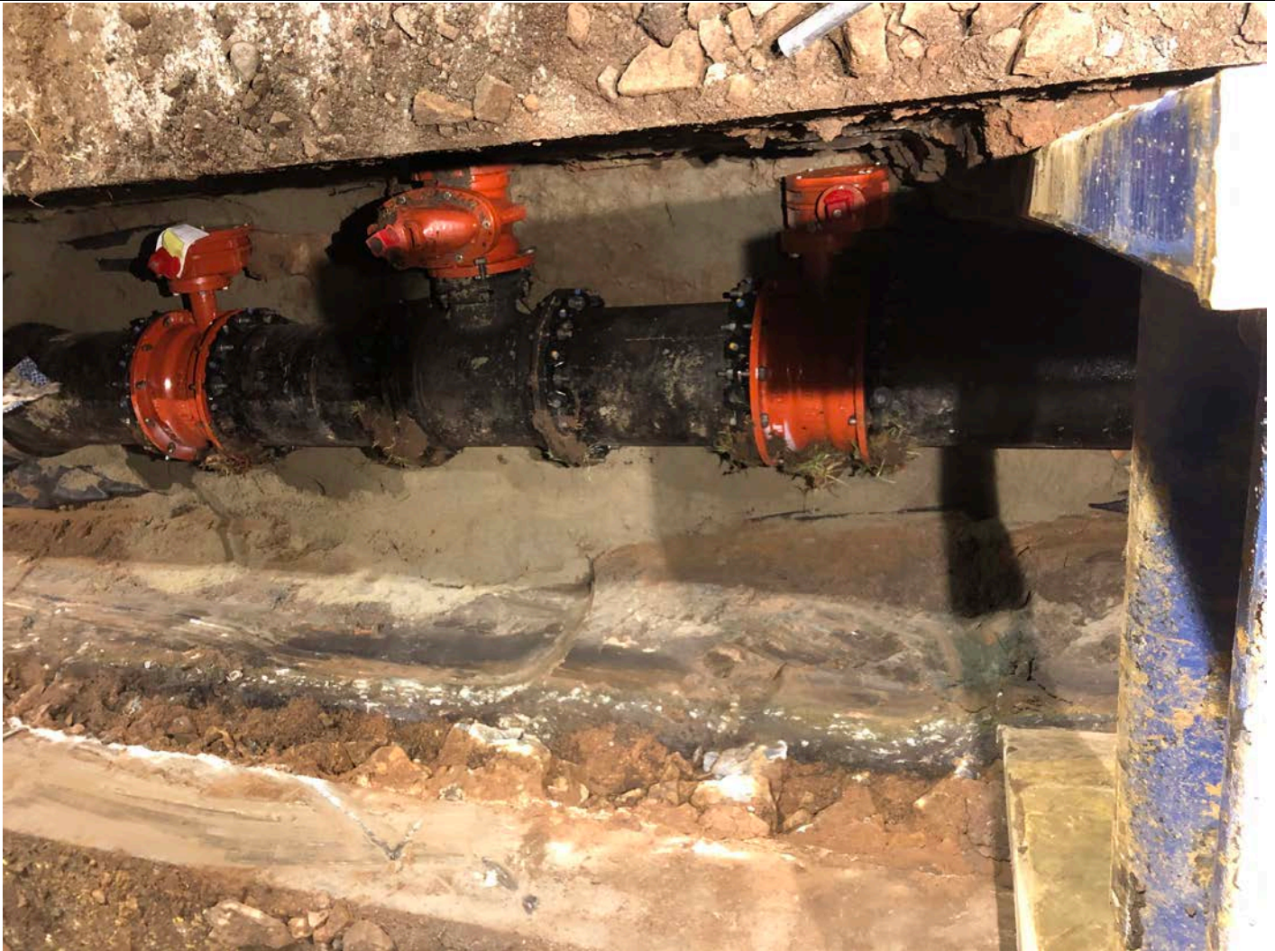
Figure 2 – Tee section in trench, attached to water main