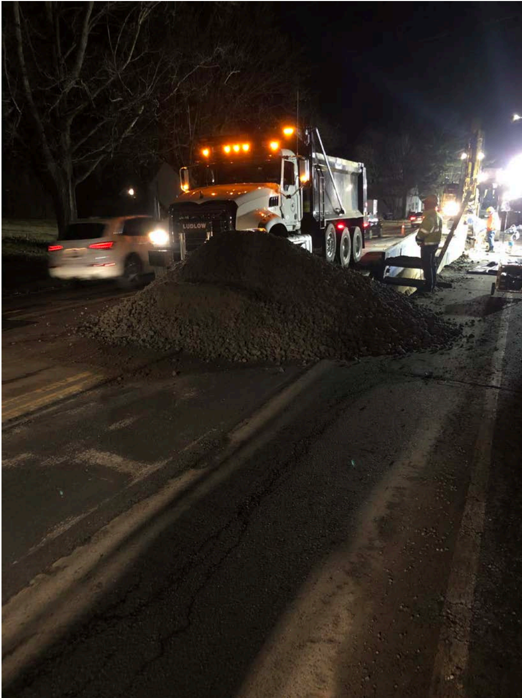
Figure 1 – Pile of graded backfill at Sta. 157+08