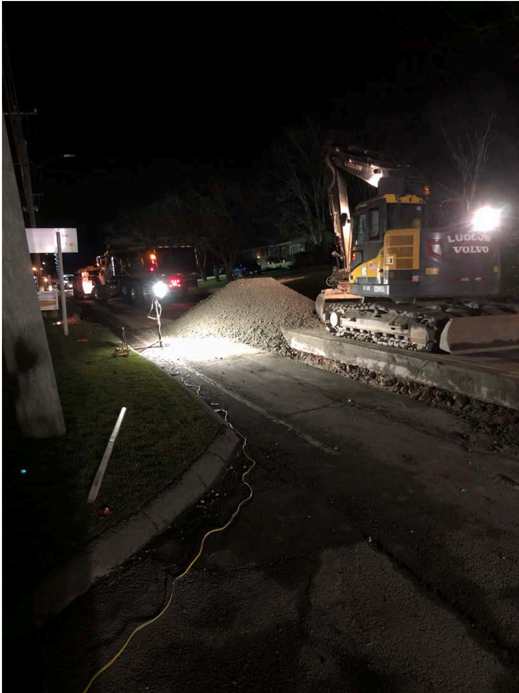
Figure 4 – Backfill pile