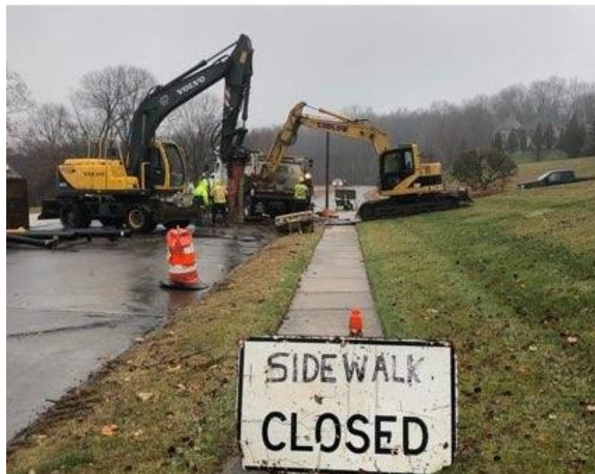
Figure 2 – Examples of signs Ludlow is using to control vehicle and pedestrian traffic.