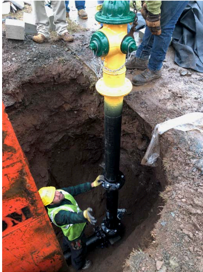
Figure 6 – Ludlow installing hydrant assembly on west side of trench.