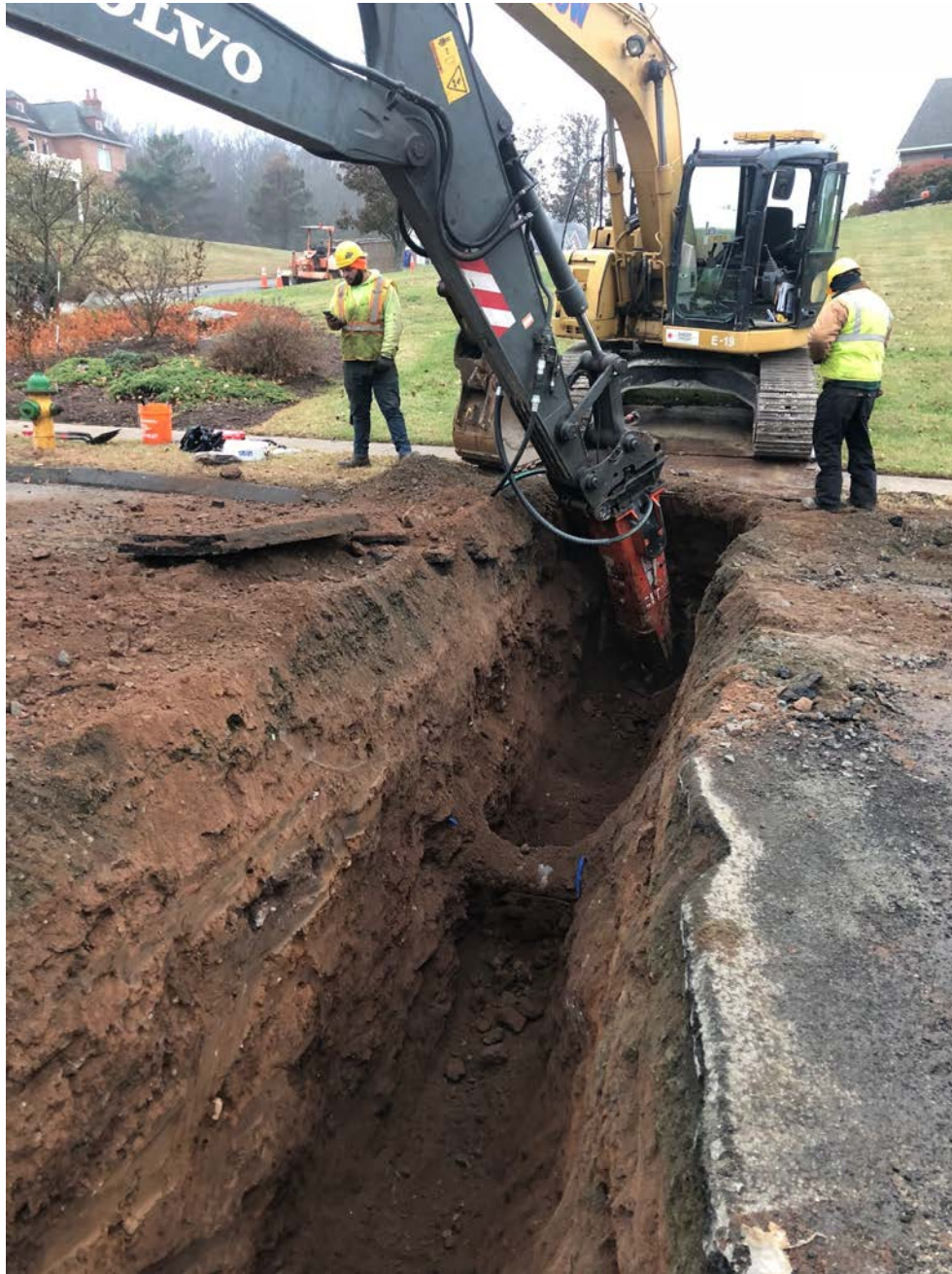
Figure 3 - Ludlow hammering rock out of trench.

Date: November 20, 2019 Day of Week: Wednesday Report No: 34 Page: 5 of 9