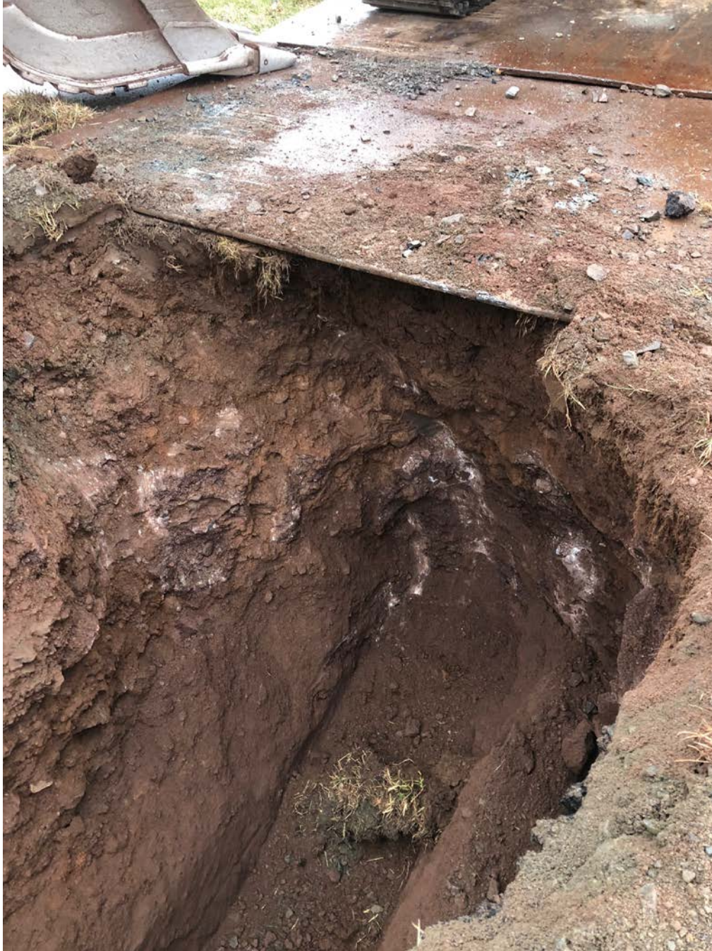
Figure 4 – Close-up of bedrock located on the western side of the trench.

Date: November 20, 2019 Day of Week: Wednesday Report No: 34 Page: 6 of 9