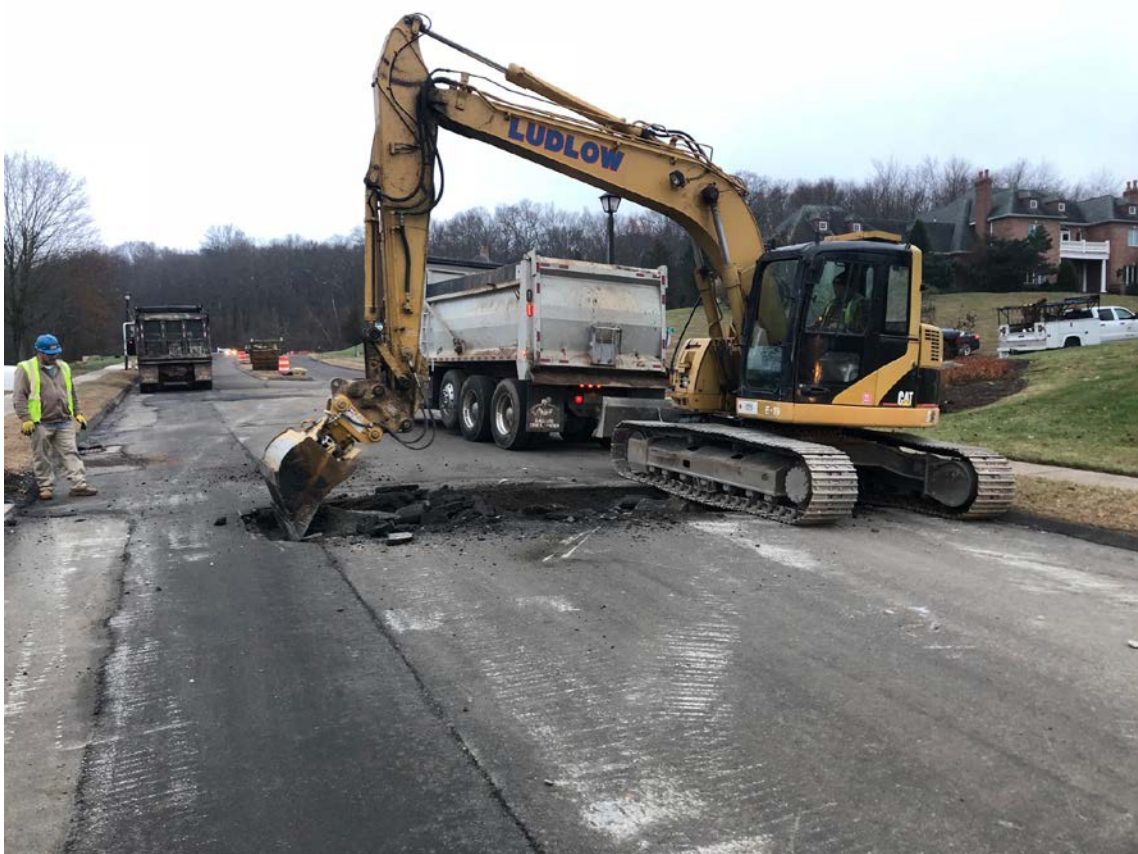
Figure 1 –Ludlow removing asphalt from area that will be trenched for hydrant installation.