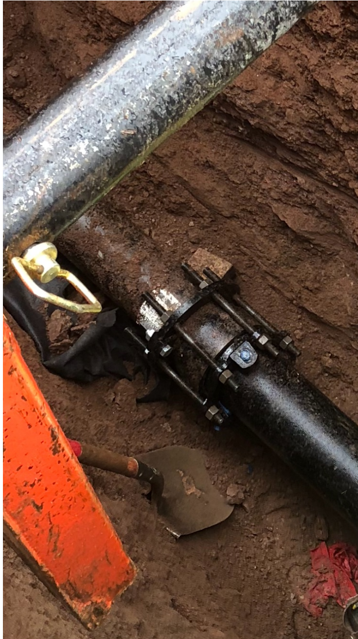
Figure 5 – Connection between the two pieces of 6" DIP.

Date: November 20, 2019 Day of Week: Wednesday Report No: 34 Page: 7 of 9