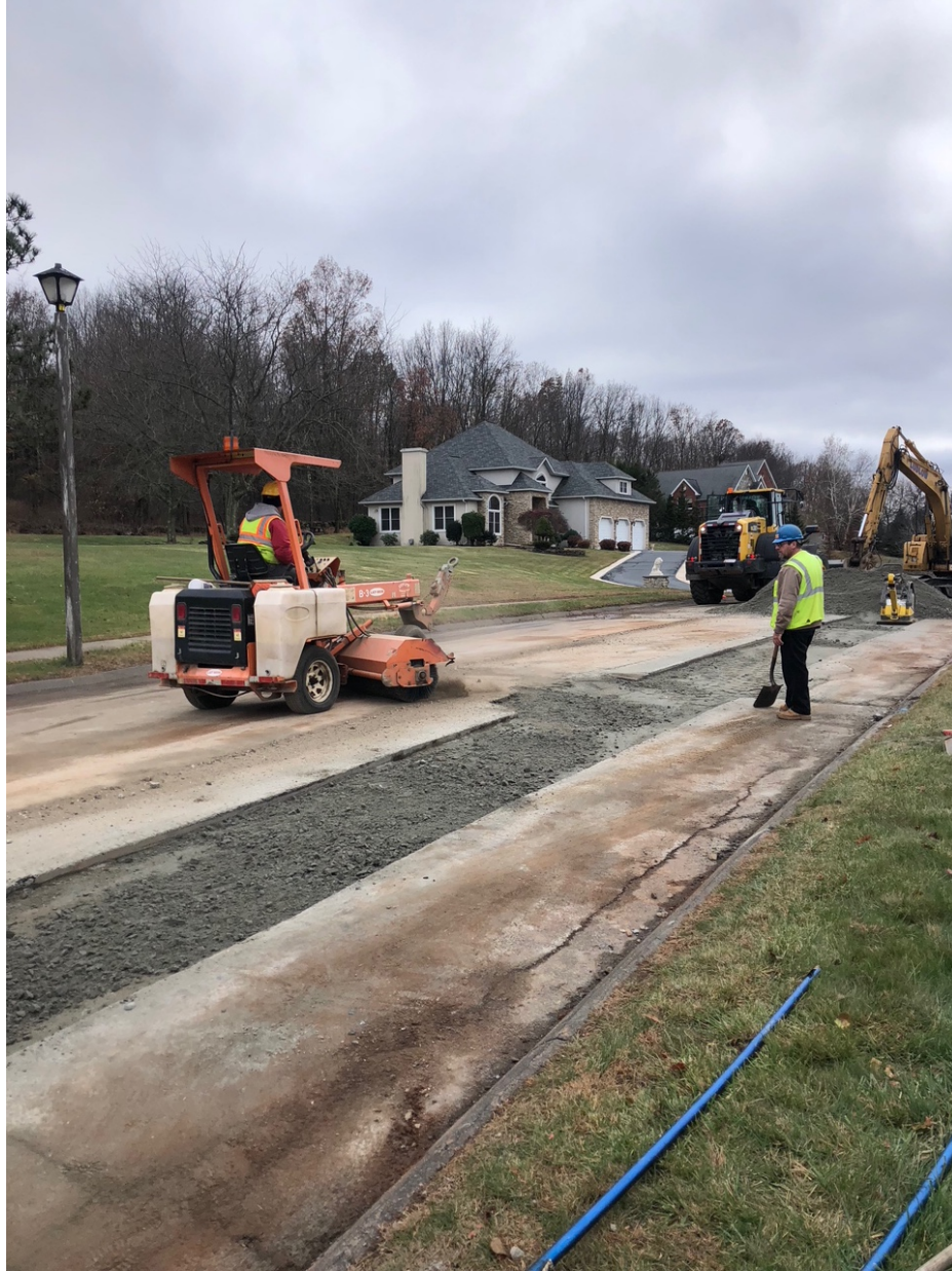
Figure 9– Ludlow cleaning sand and rock off of Watch Hill Drive.