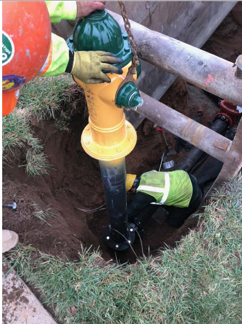
Figure 11– Ludlow installing hydrant assembly.