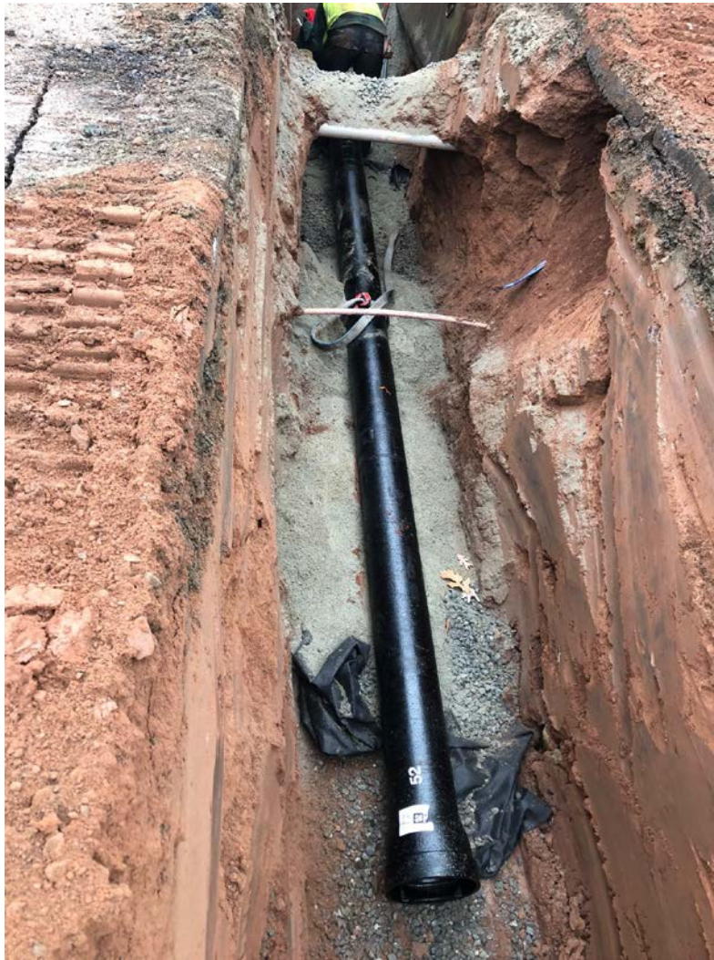
Figure 3 - Second stick of 8" DIP installed by Ludlow beneath a 1" copper water line at 51" BSG and two 4" gray PVC conduits located 39" BSG.