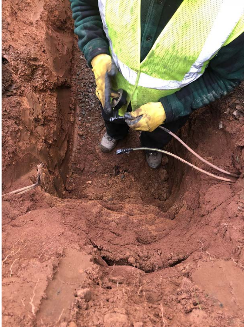
Figure 8 – Ludlow covering ends of severed wires with electrical tape.