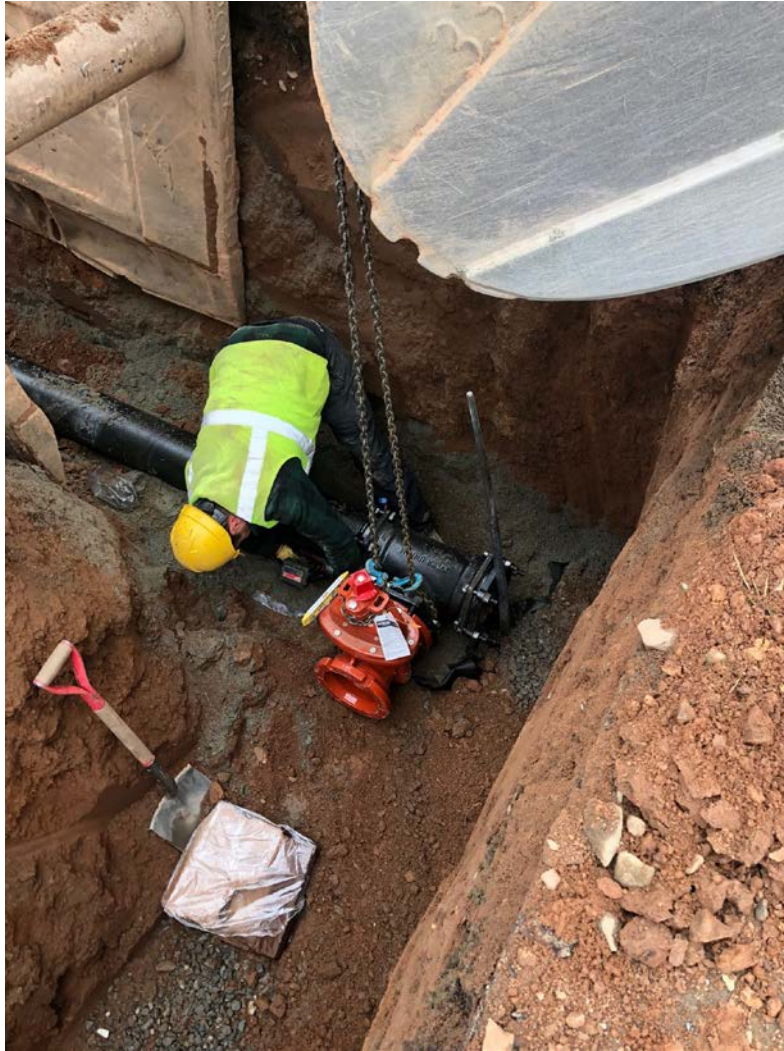
Figure 5 – Installation of 8”x6” tee fitting and valve at approximate Station 604+33.42.