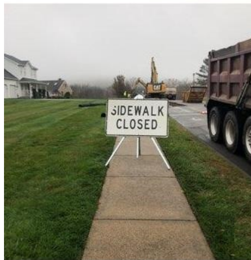
Figure 2 – Examples of signs Ludlow is using to control vehicle and pedestrian traffic.