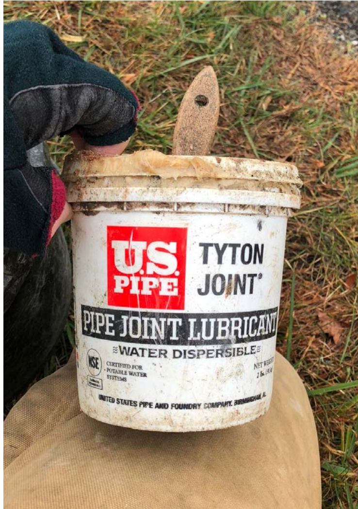
Figure 4 – Pipe lubricant used by Ludlow on the male end of the DIP.