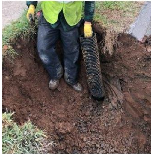
Figure 7 – 7” black plastic perforated subdrain pipe that was severed by Ludlow.