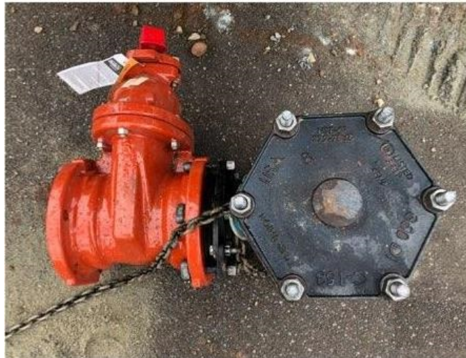
Figure 6 – Close-up of 8”x6” Tee-fitting and valve.