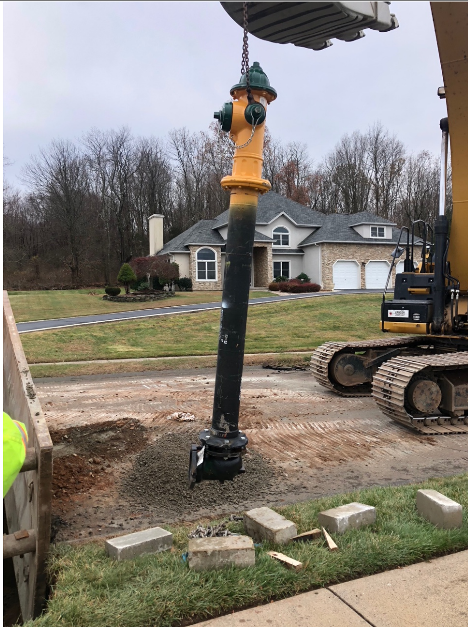
Figure 10- Hydrant assembly about to be installed by Ludlow.