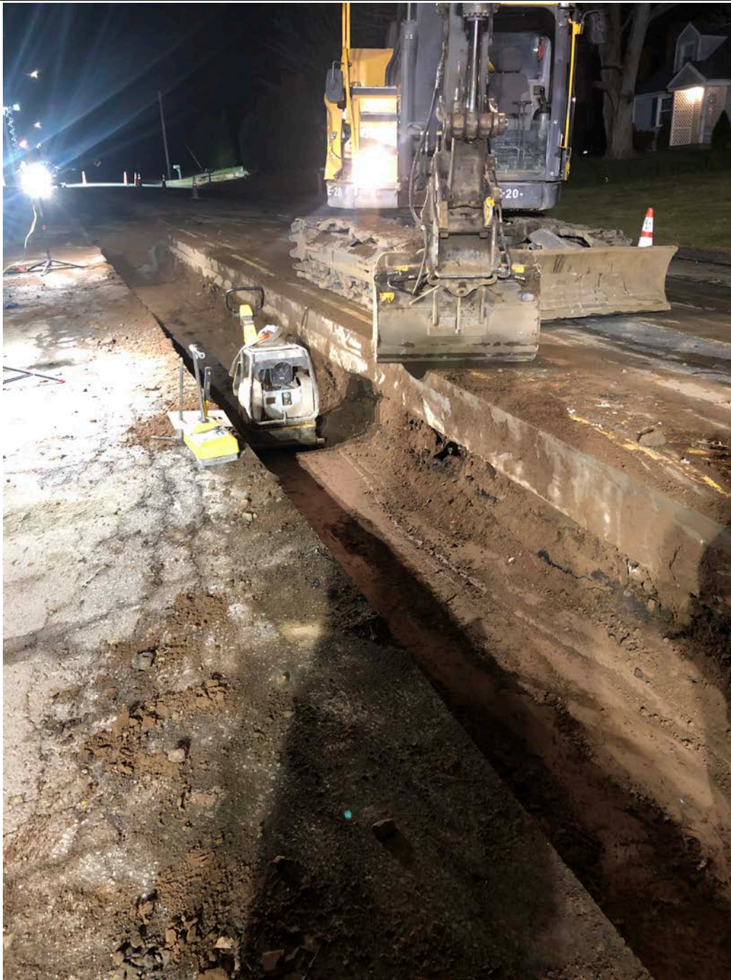
Figure 5 – Compacted 2 nd backfill lift over pipe sections 1-3