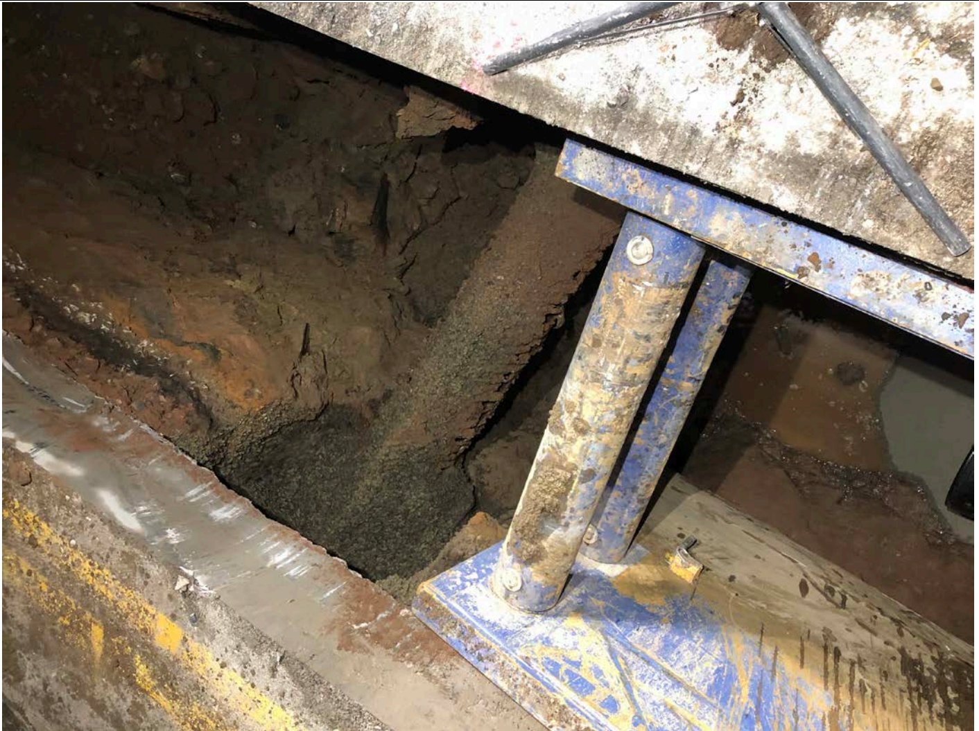
Figure 2 – Storm drain, rusted through, near Sta. 154+08