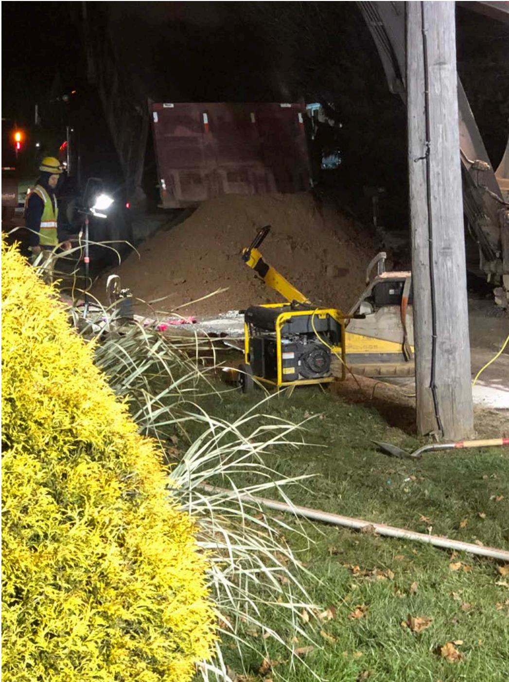
Figure 3 – Backfill pile