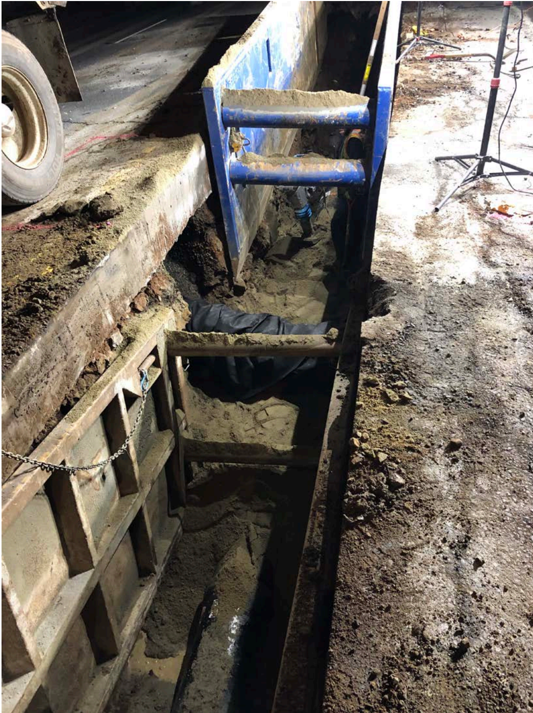
Figure 4 – Storm drain wrapped in fabric, bedding being placed over pipes