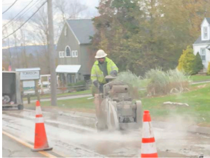
Figure 9 – Saw-cutting asphalt on the southbound lane of Route 17 in Durham.