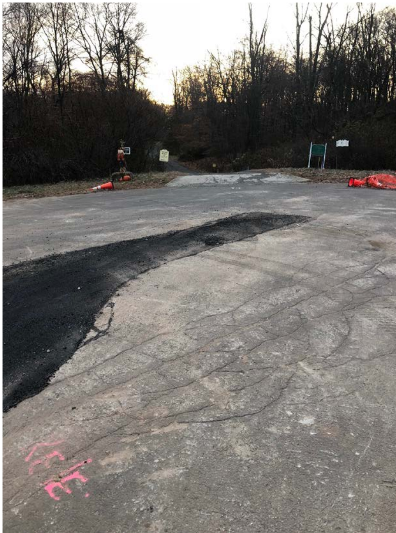
Figure 1 – Patched trench from 11-13-19 at the Talcott Ridge Drive cul-de-sac; view to the southeast.