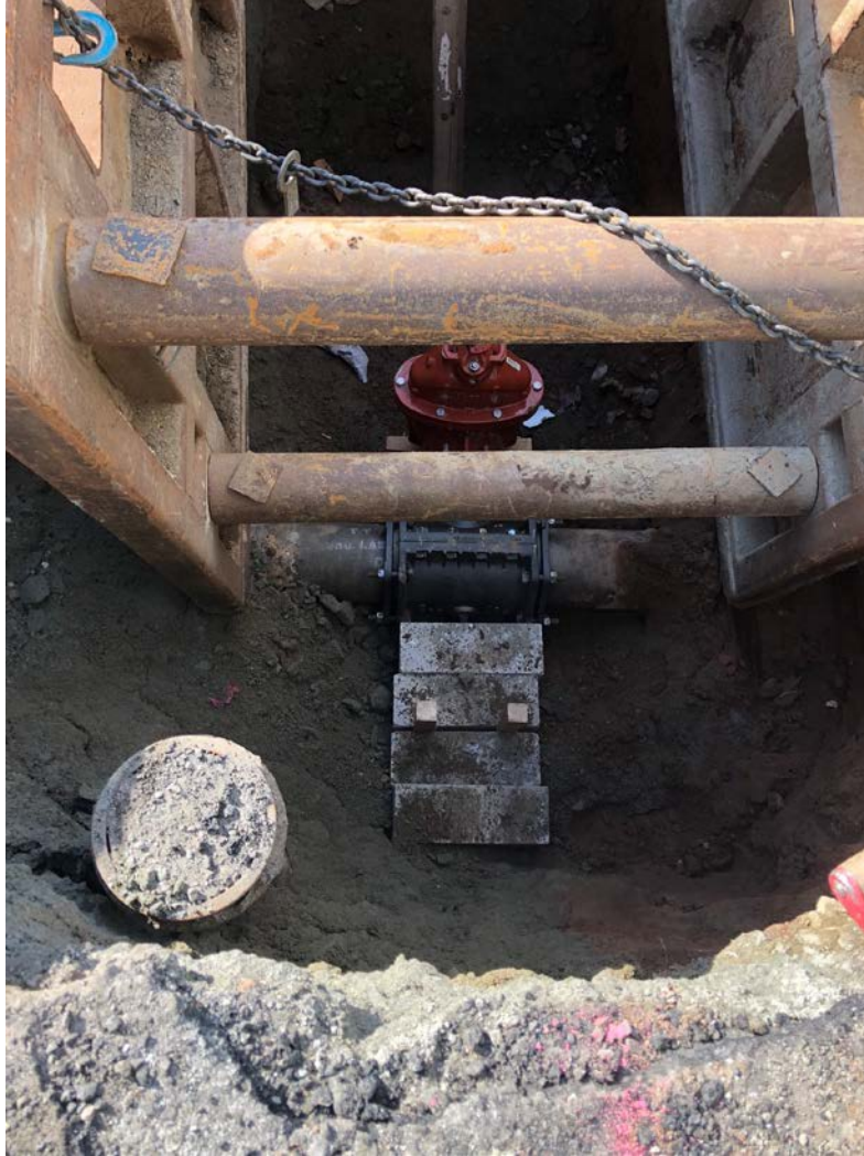
Figure 7 – Water line and tapping sleeve braced and blocked with cement blocks.