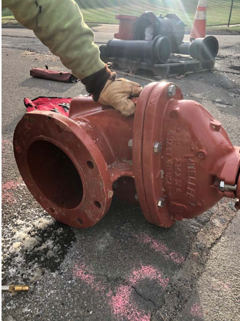
Figure 3 – Tapping gate valve that was connected to the existing water line.