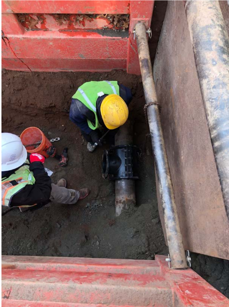
Figure 4 – Tapping sleeve placed onto the existing water line. The tapping valve will connect to this fitting.