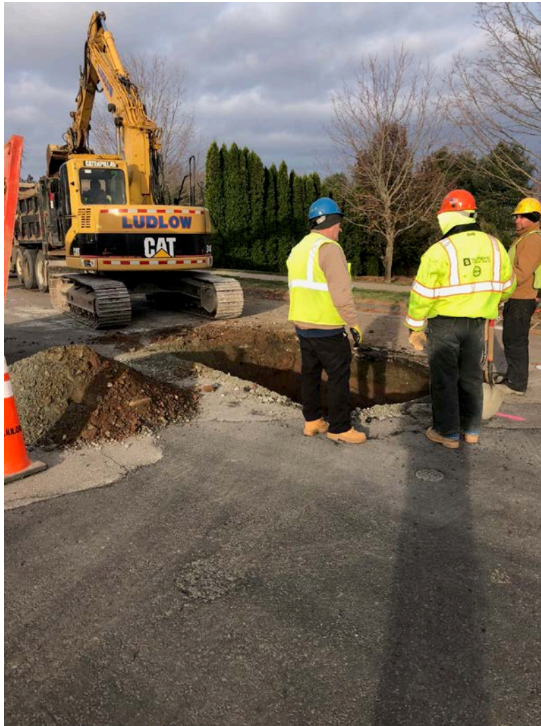
Figure 2 – Excavating existing 8”water line at the intersection of Talcott Ridge Drive and Watch Hill Drive. View to the northwest.