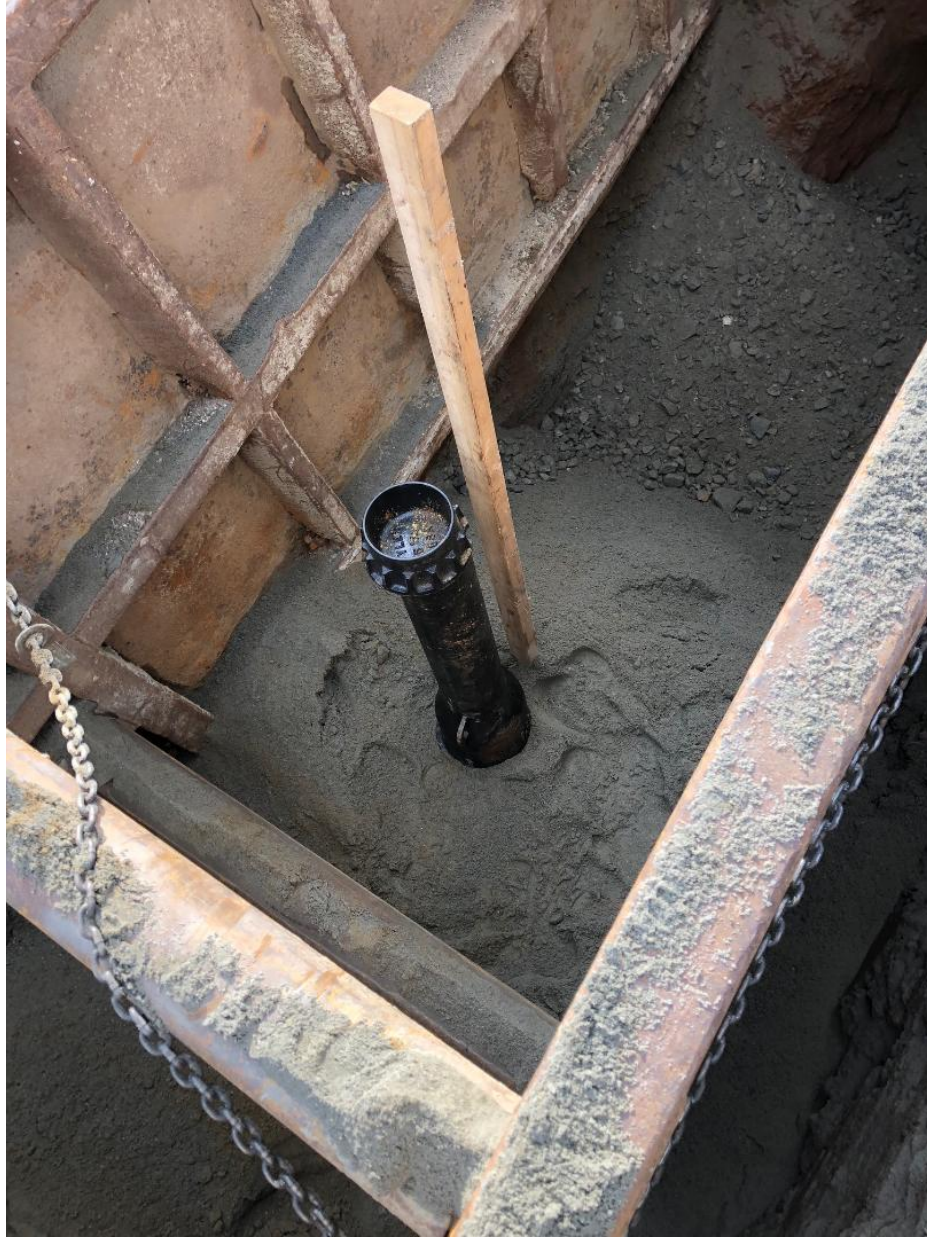
Figure 8 – Valve after installation of riser and gate box, and after sand bedding has been placed over the valve assembly.