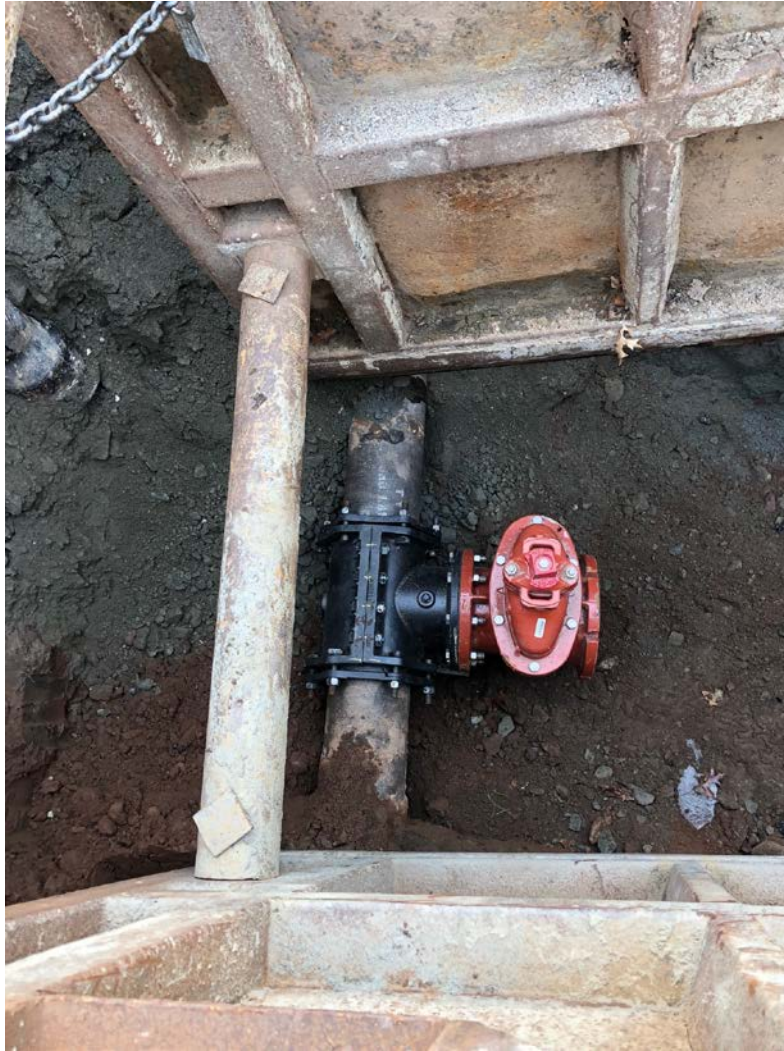
Figure 6 – Newly installed tapping sleeve and valve. Middletown Water Department entered the valve from the right and advanced the tap mechanism to the left to tap into the 8” existing water line.