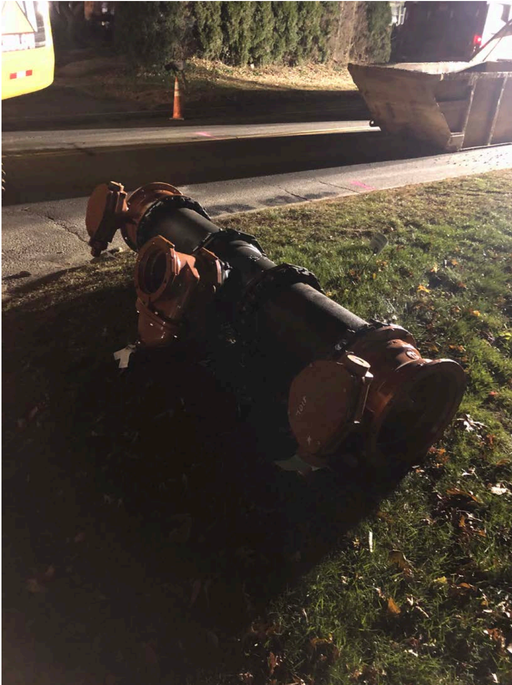
Figure 5 – Valve and tee section above ground, will be placed after lunch break