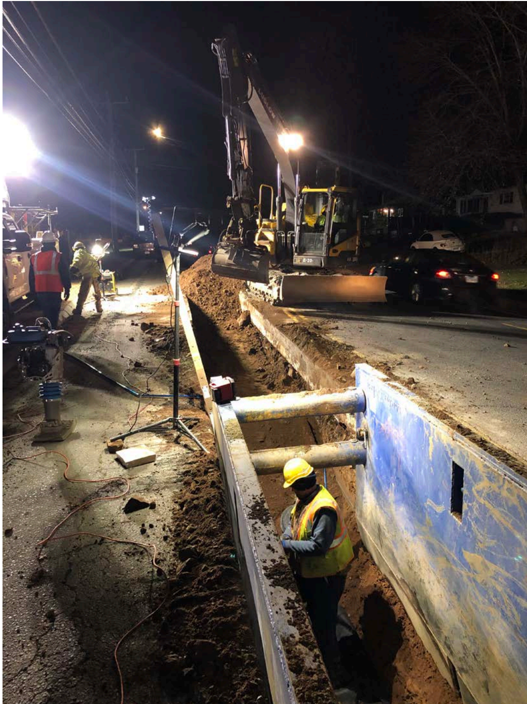
Figure 1 – Placing 2 nd backfill lift over 1 st pipe section