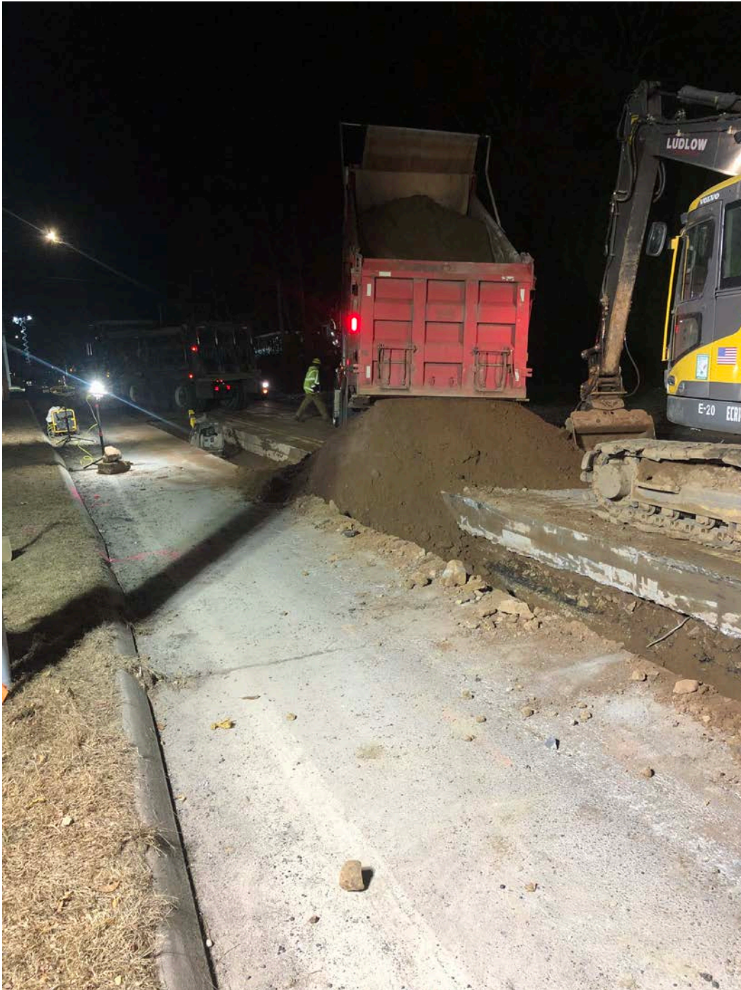
Figure 3 – Backfill pile