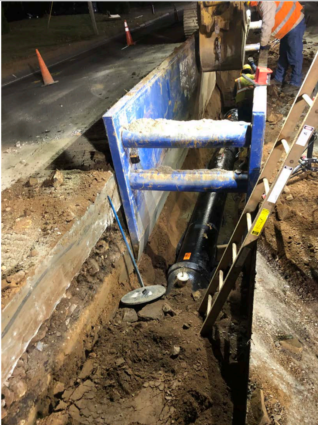
Figure 4 – Placing 5 th pipe section