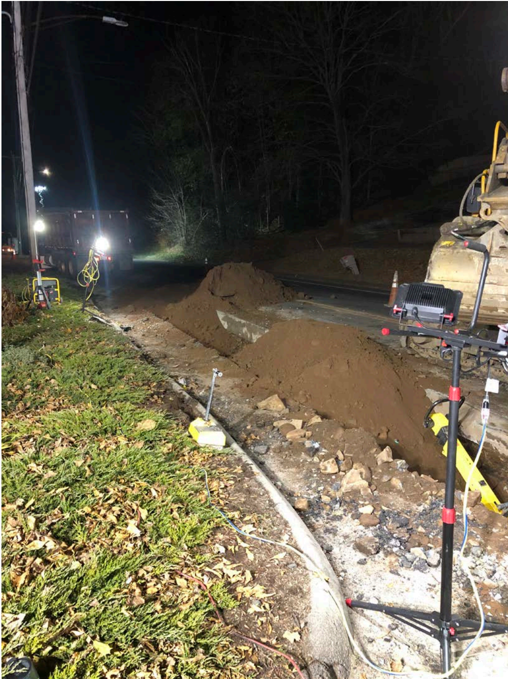
Figure 2 – Backfill piles near Sta. 145+38