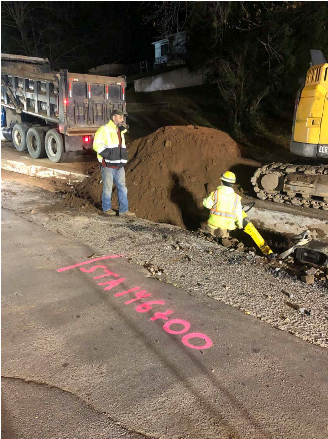
Figure 4 – Backfill pile near Sta. 146+00