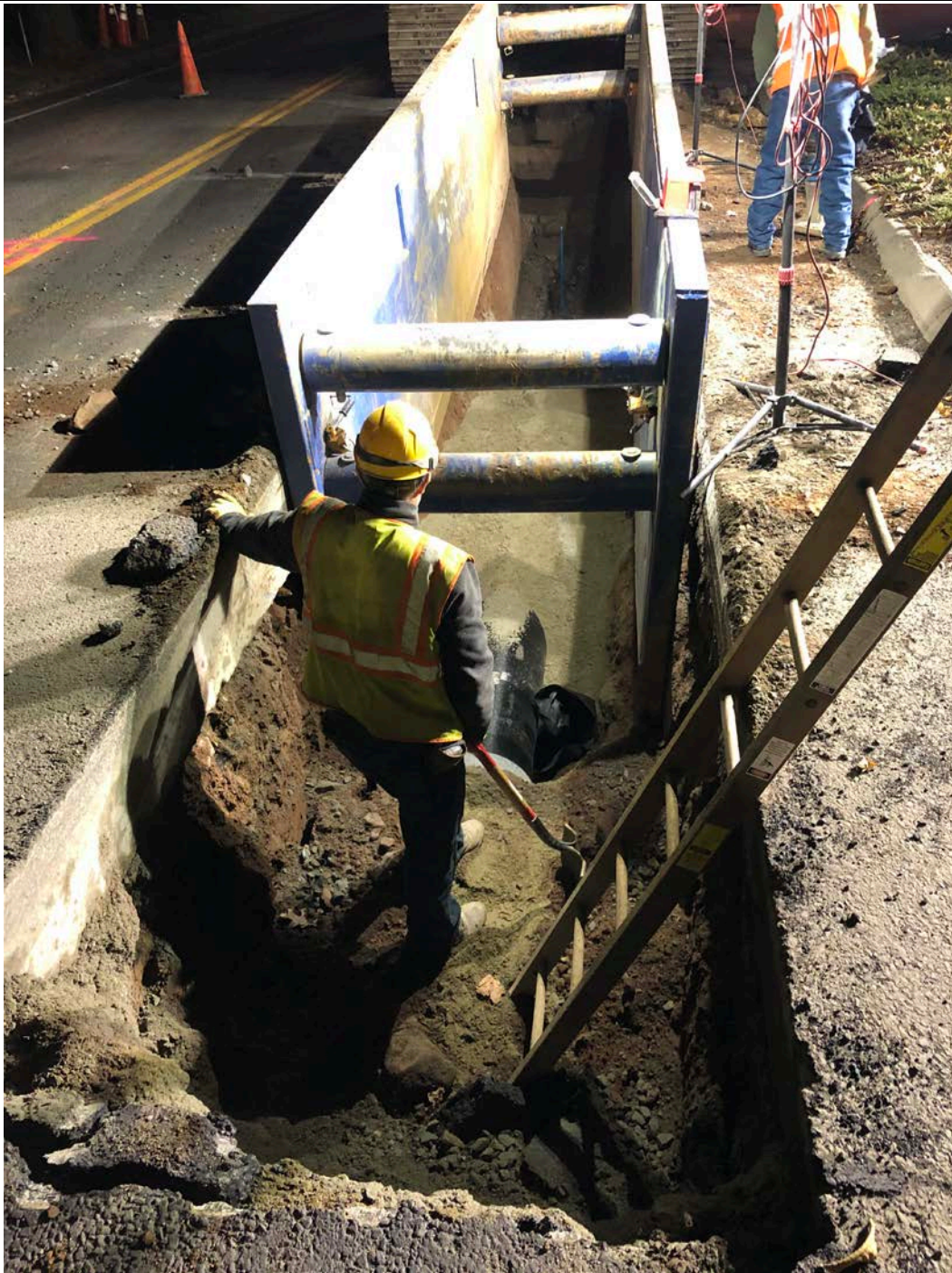
Figure 1 – First pipe section in place, placing pipe bedding