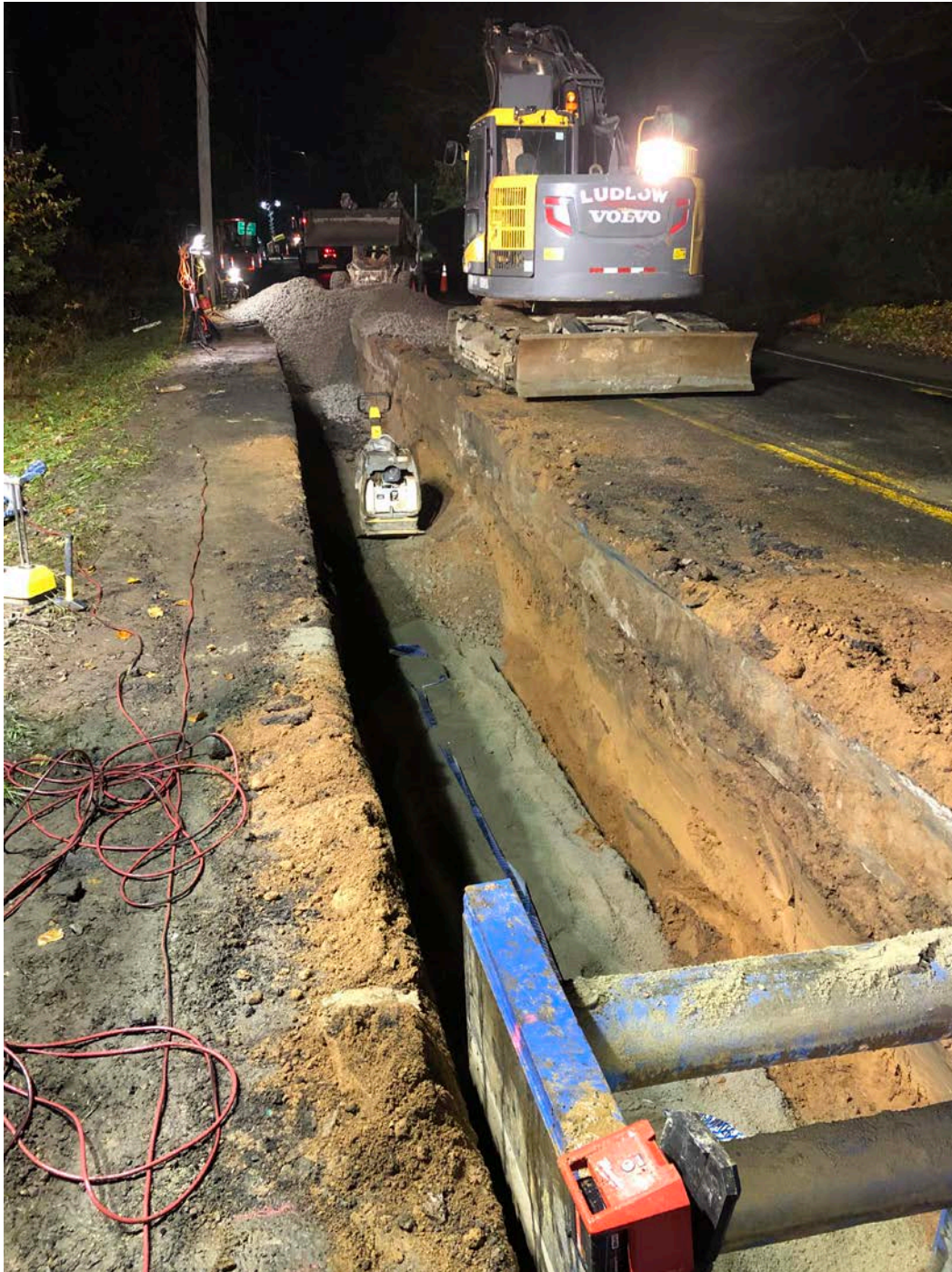
Figure 3 – Compacted 1 st lift over section 1, warning tape laid over section 2, backfill pile at Sta. 134+63