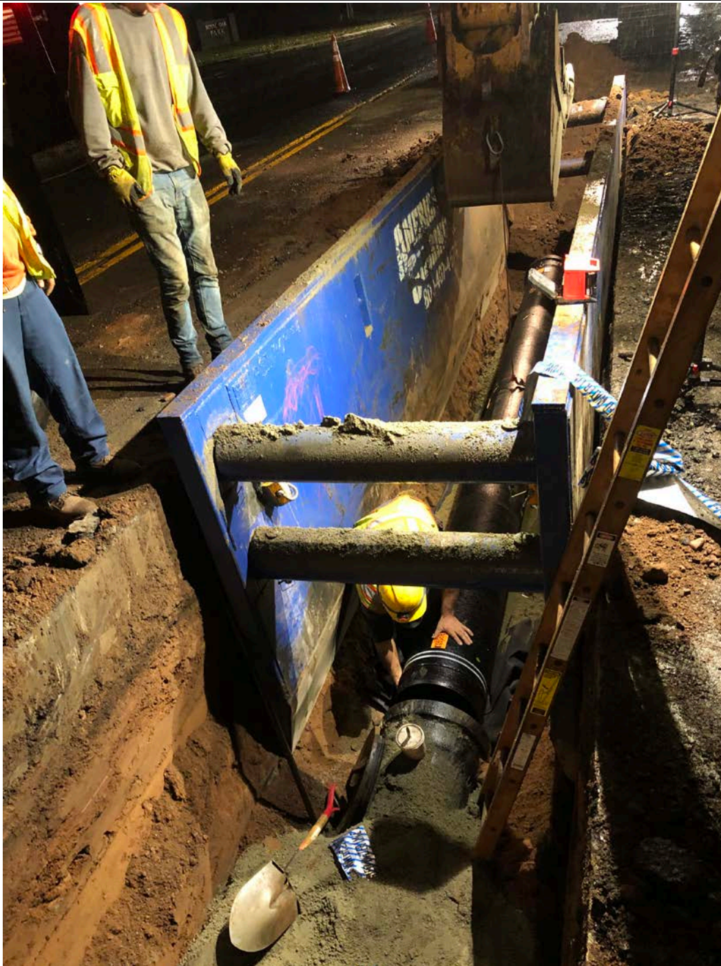
Figure 4 – Attaching 7 th section

Date: October 29, 2019 Day of Week: Tuesday Report No: 20 Page: 6 of 6