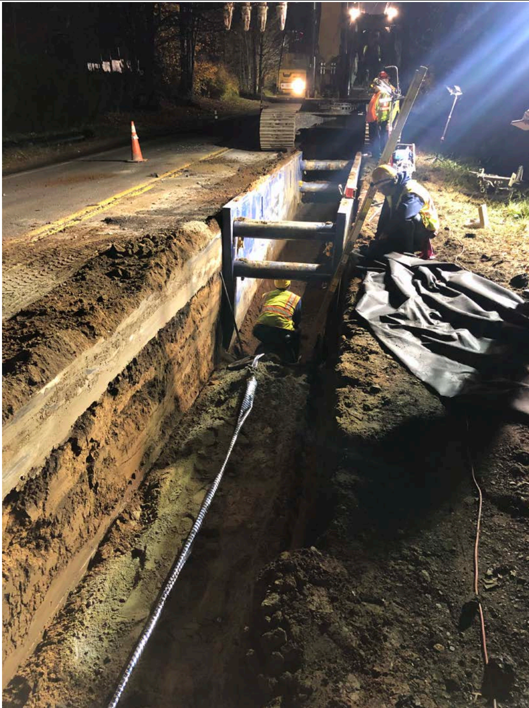
Figure 4 – Trenching for 5 th section, 4 th section laid with compacted bedding and warning tape laid overtop