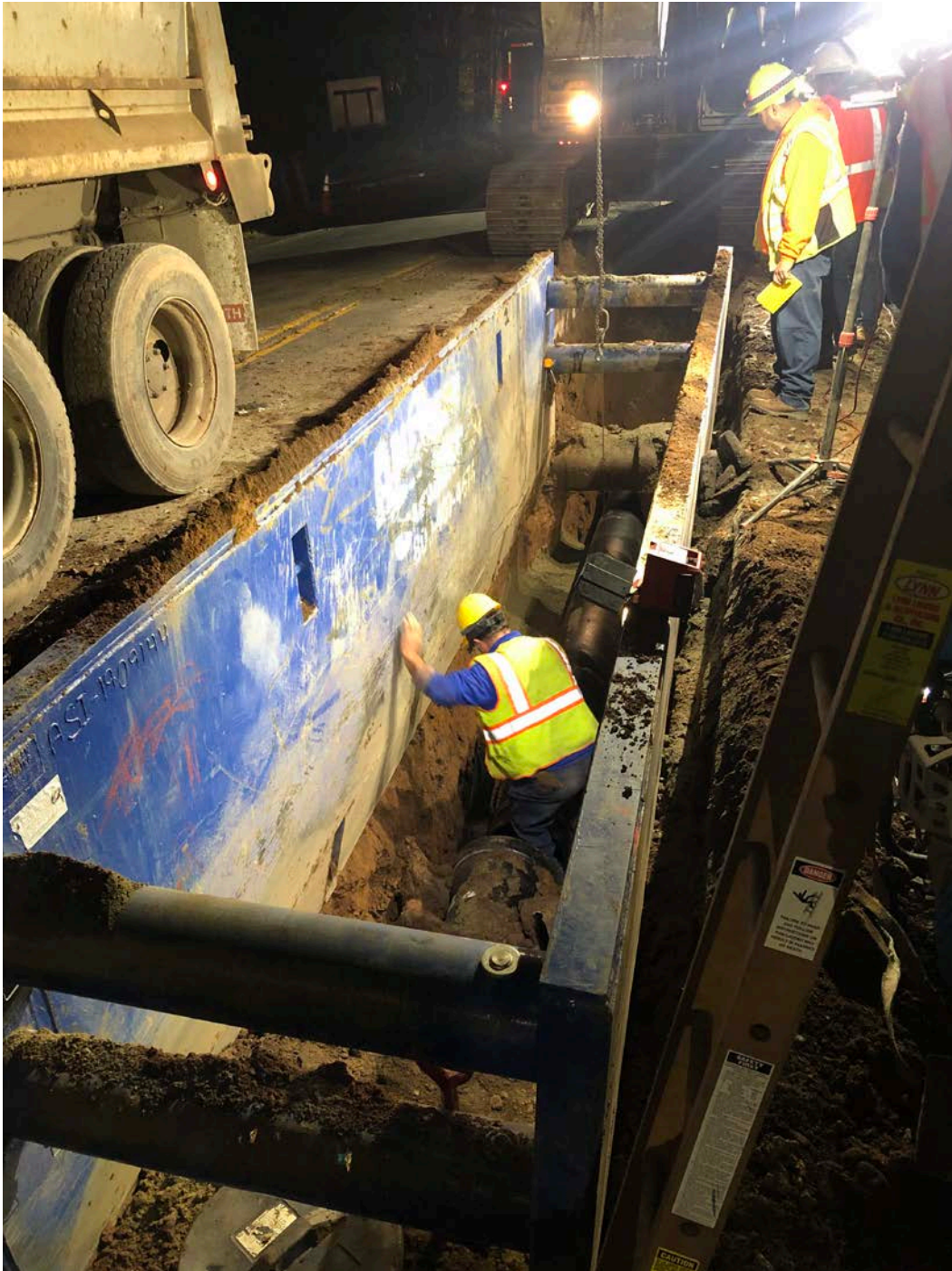
Figure 1 – 2 nd section being placed, 12” RCP storm drain at Sta. 135+59