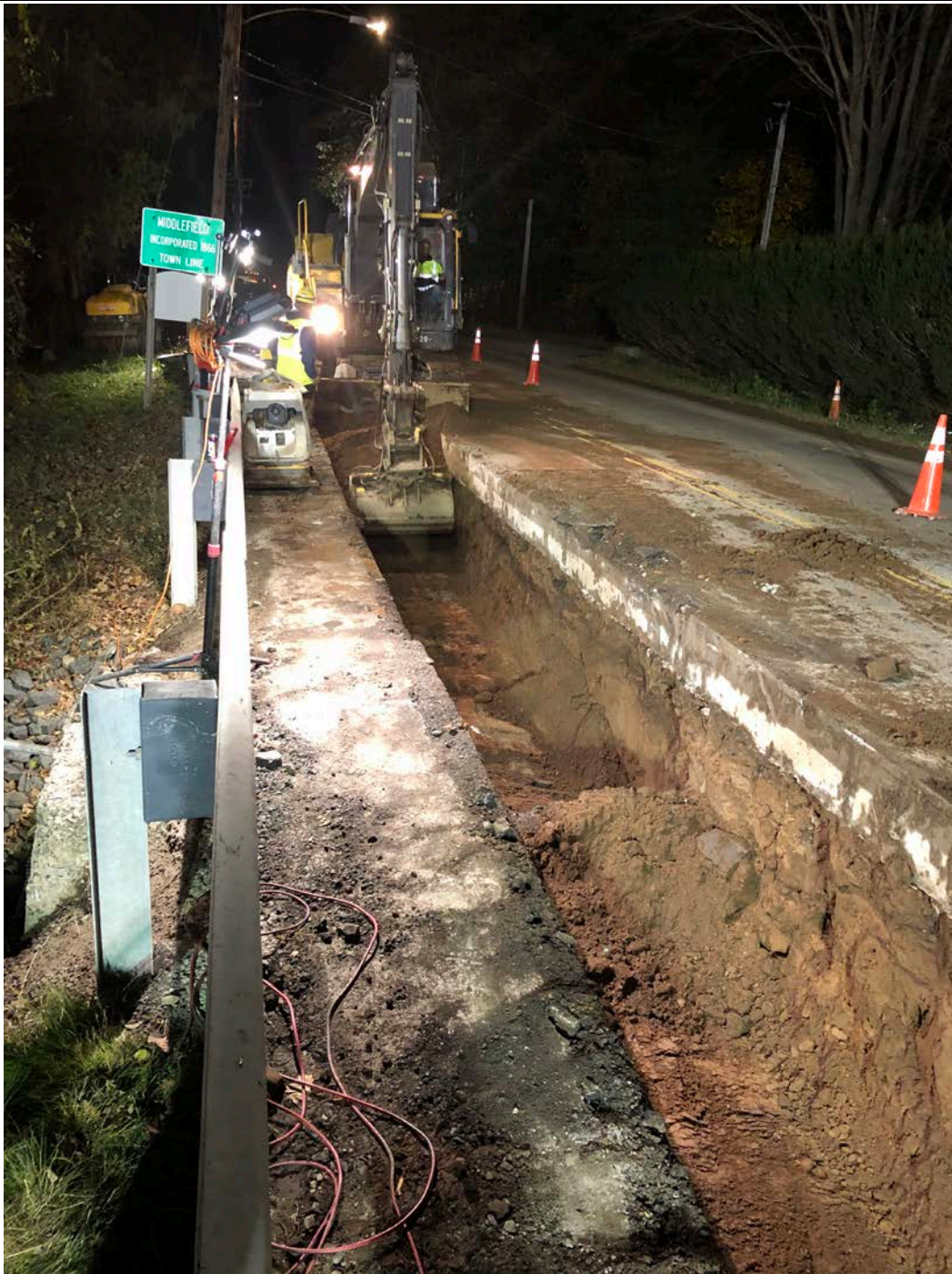
Figure 3 – Removing backfill over sections 1-2