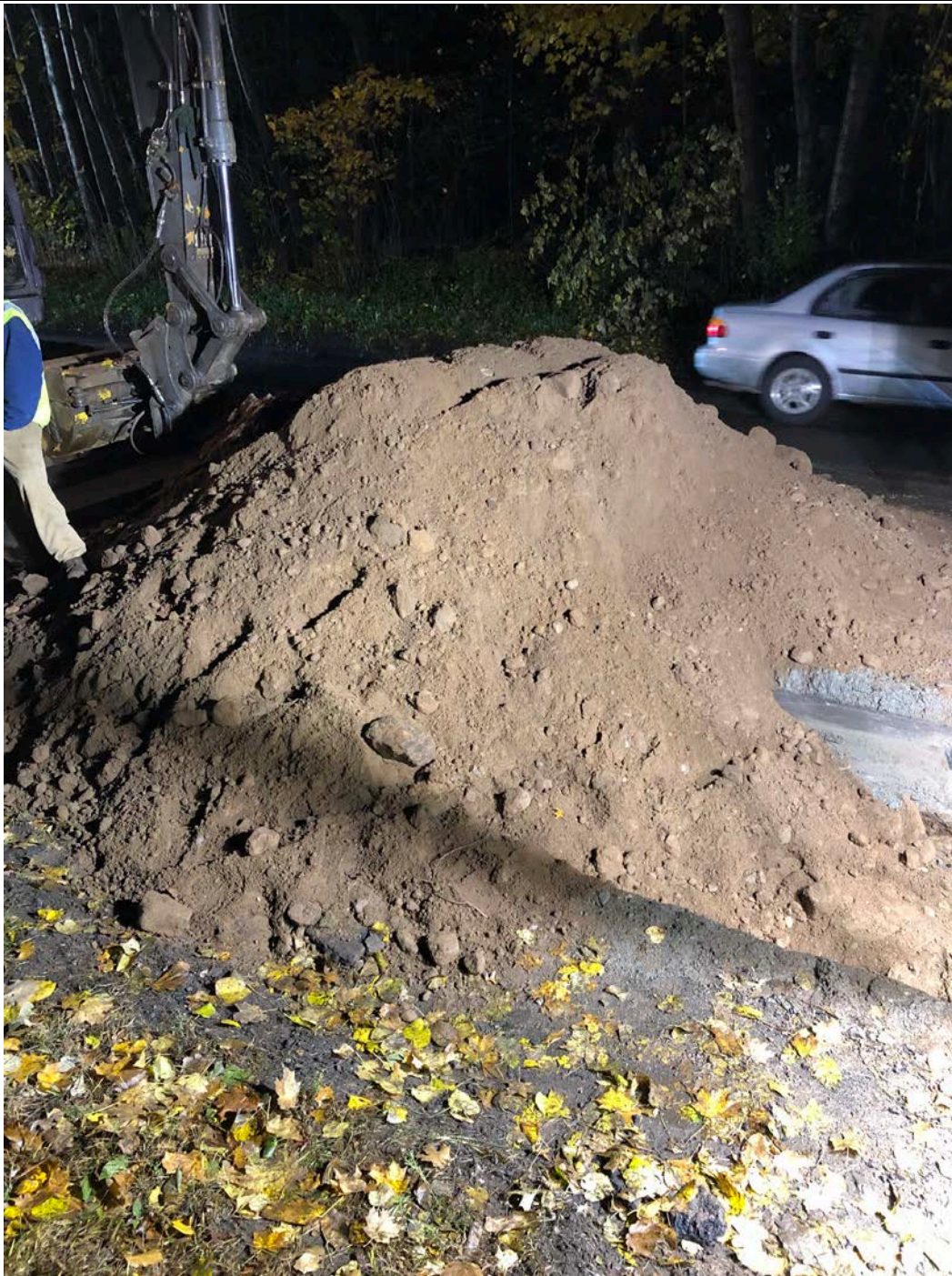
Figure 2 –Backfill pile at Sta. 131+35