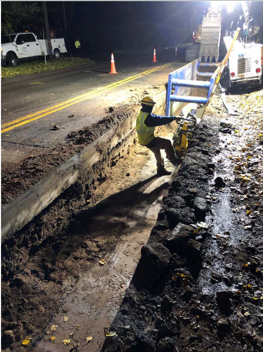
Figure 3 – Compacting 2 nd fill lift over sections 1-3

Date: October 27, 2019 Day of Week: Sunday Report No: 18 Page: 5 of 8