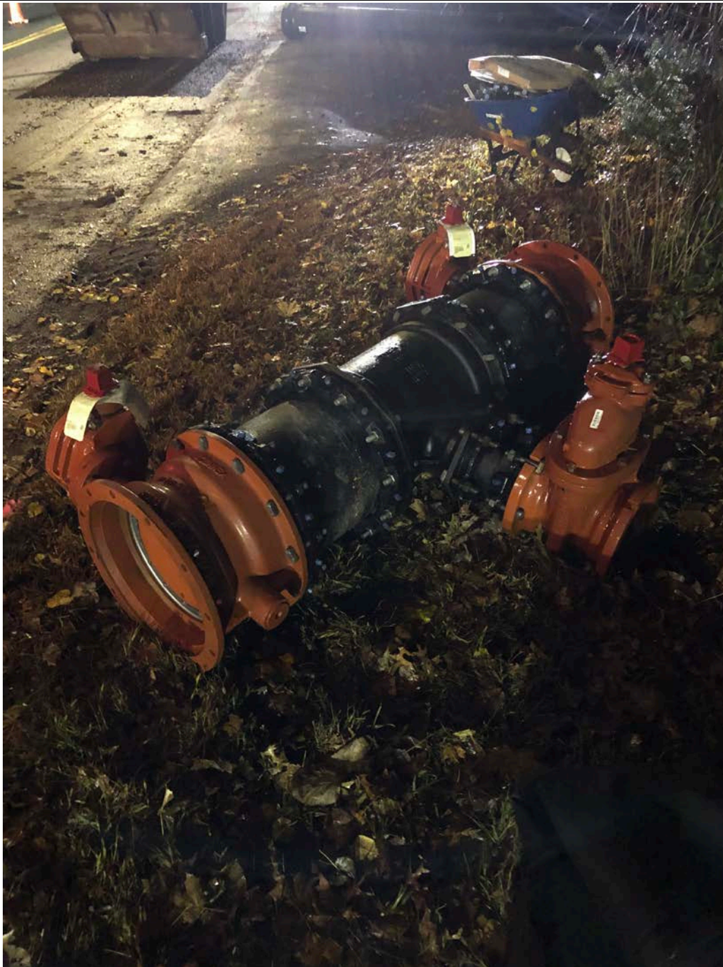
Figure 5 – Valve section to be placed at Sta. 132+30