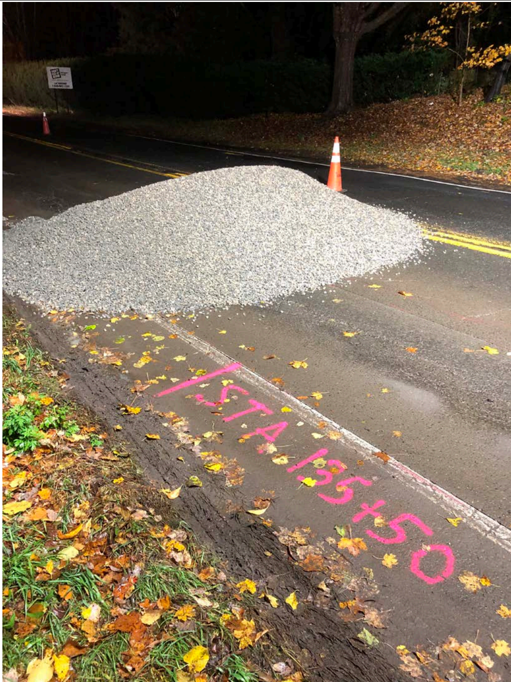
Figure 1 – Stone bedding pile at Sta. 135+50

Project: Durham Meadows Pipeline Installation Date: October 27, 2019 Location: South Main Street, Middletown CT Day of Week: Sunday Project #: AECOM: 60445033 Report No: 18 Contractor: Ludlow Construction Page: 3 of 8