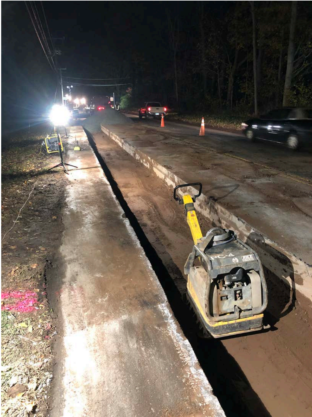
Figure 3 – Compacting top backfill lift over sections 1-7, processed aggregate pile in background