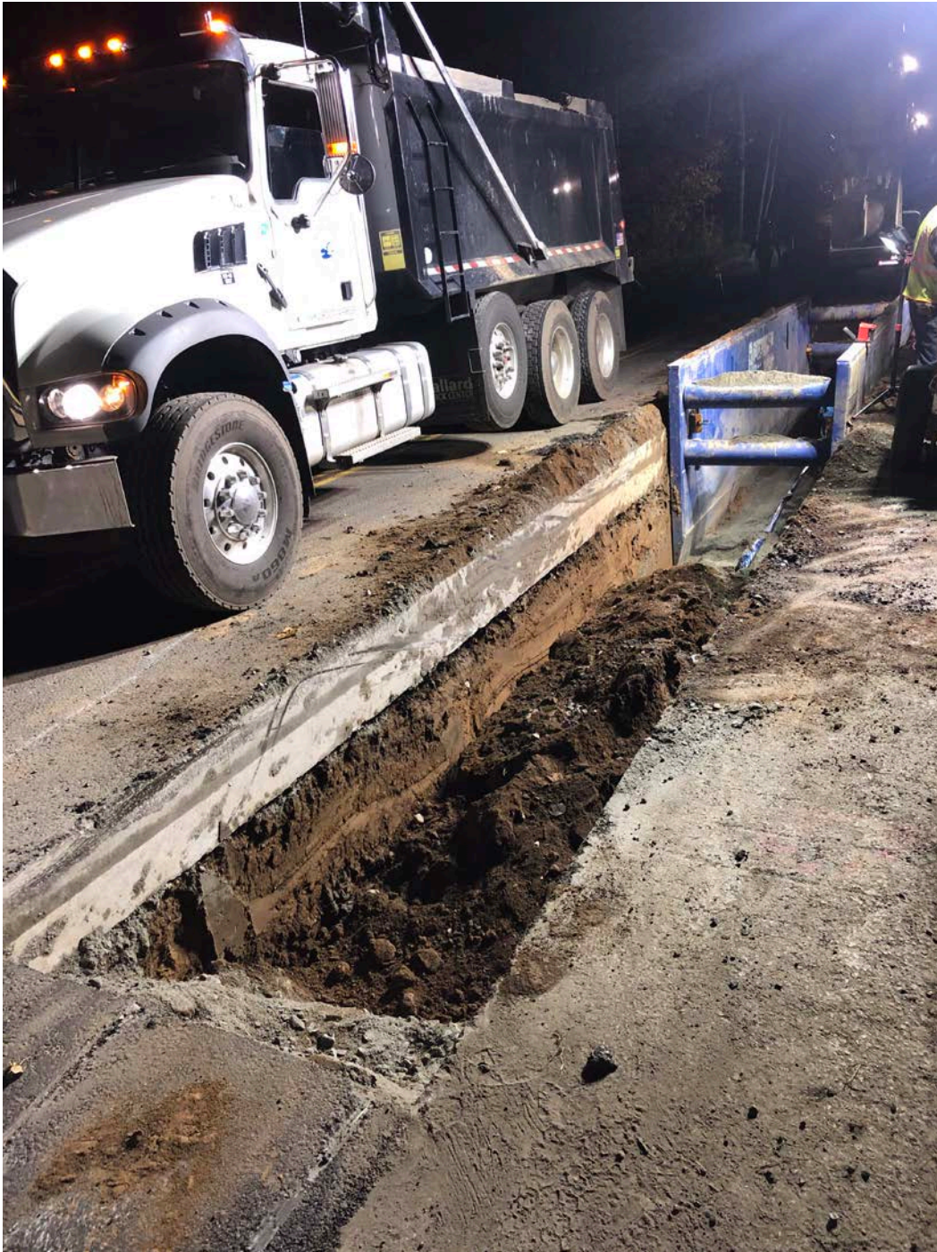
Figure 1 – 2 nd section with warning tape, 1 st section with loose 1 st backfill lift

Date: October 23, 2019 Day of Week: Wednesday Report No: 17 Page: 3 of 8