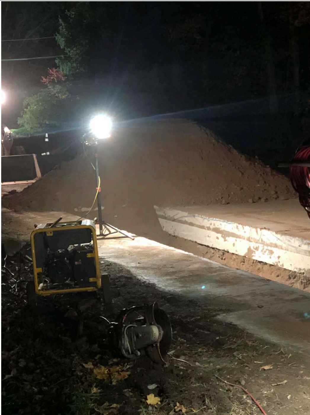
Figure 4 – Backfill pile at Sta. 129+94