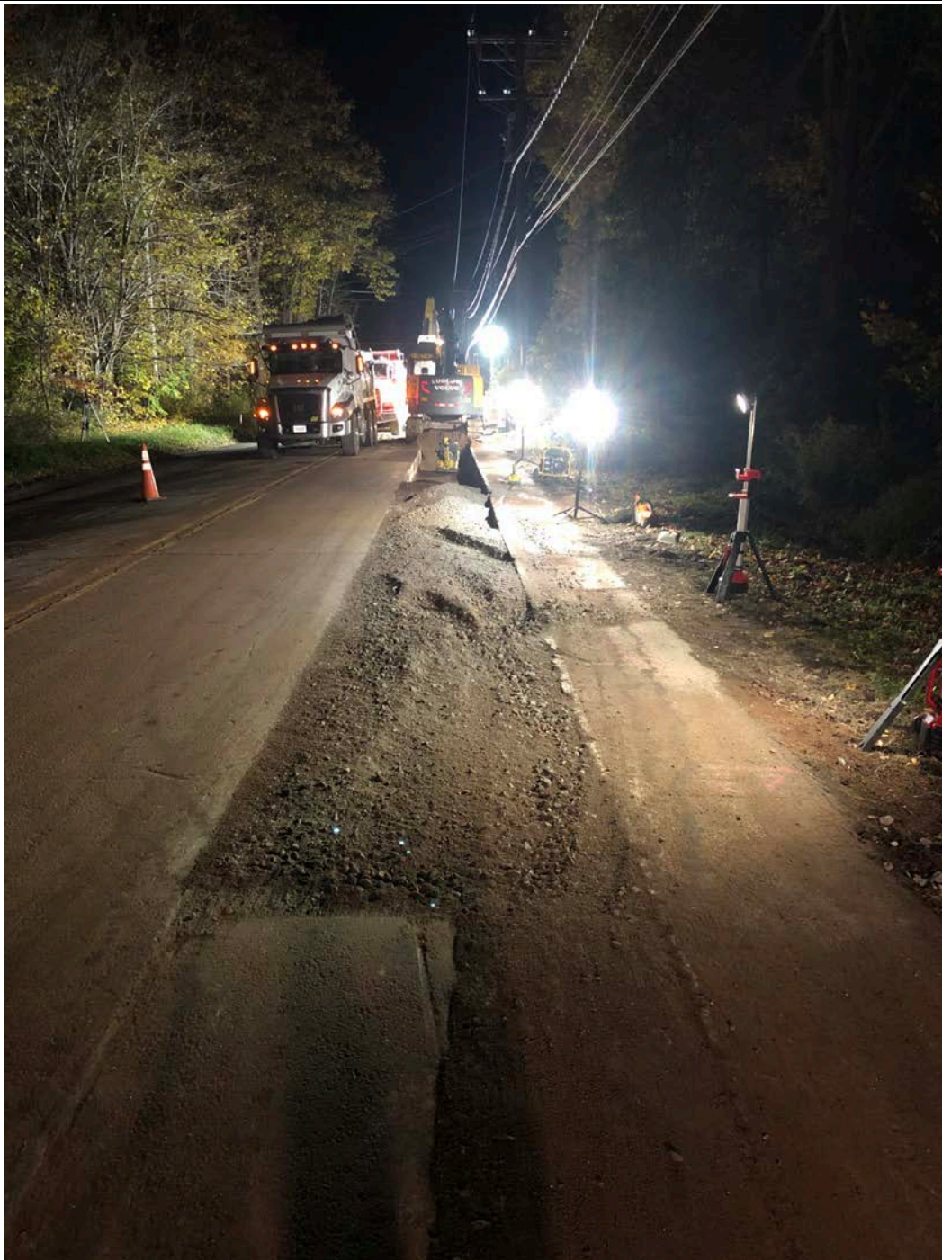
Figure 6 – Uncompact processed aggregate over sections 1-5