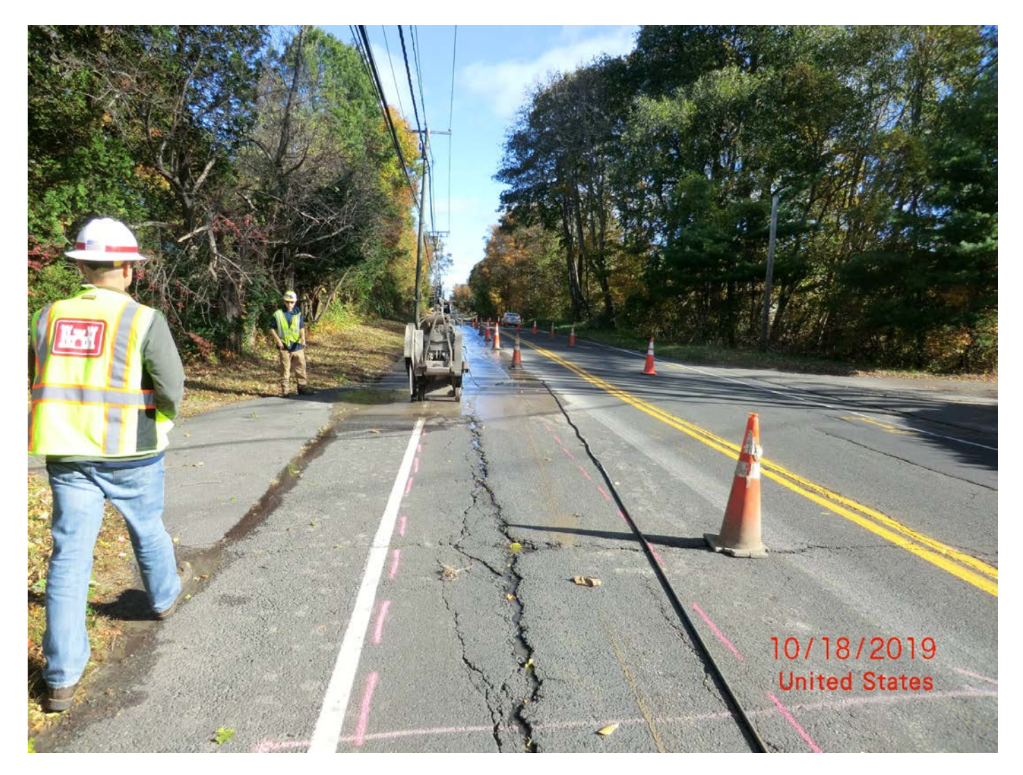
Figure 3 – Picture taken facing north. road cutting on Main Street, Durham.