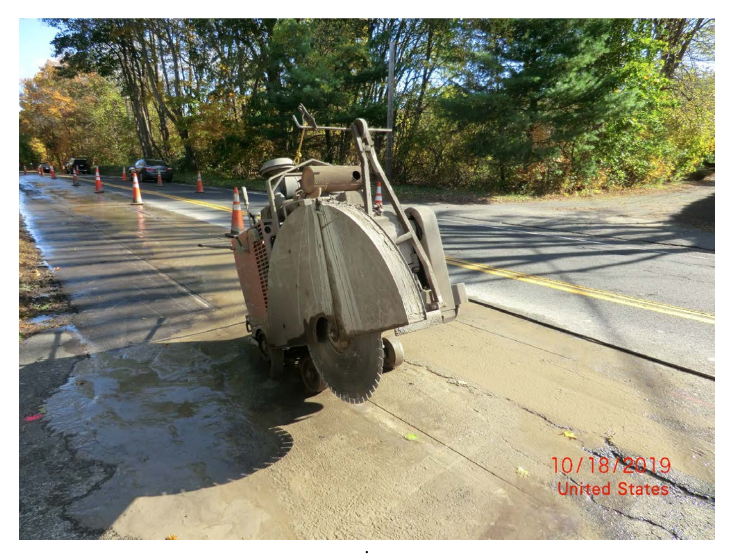
Figure 4 – Picture facing northeast. Road saw, currently waiting for support truck to be repositioned. No culverts along this stretch of road. Operator says they sweep and shovel up cuttings from the operation with a 95%+ efficiency.