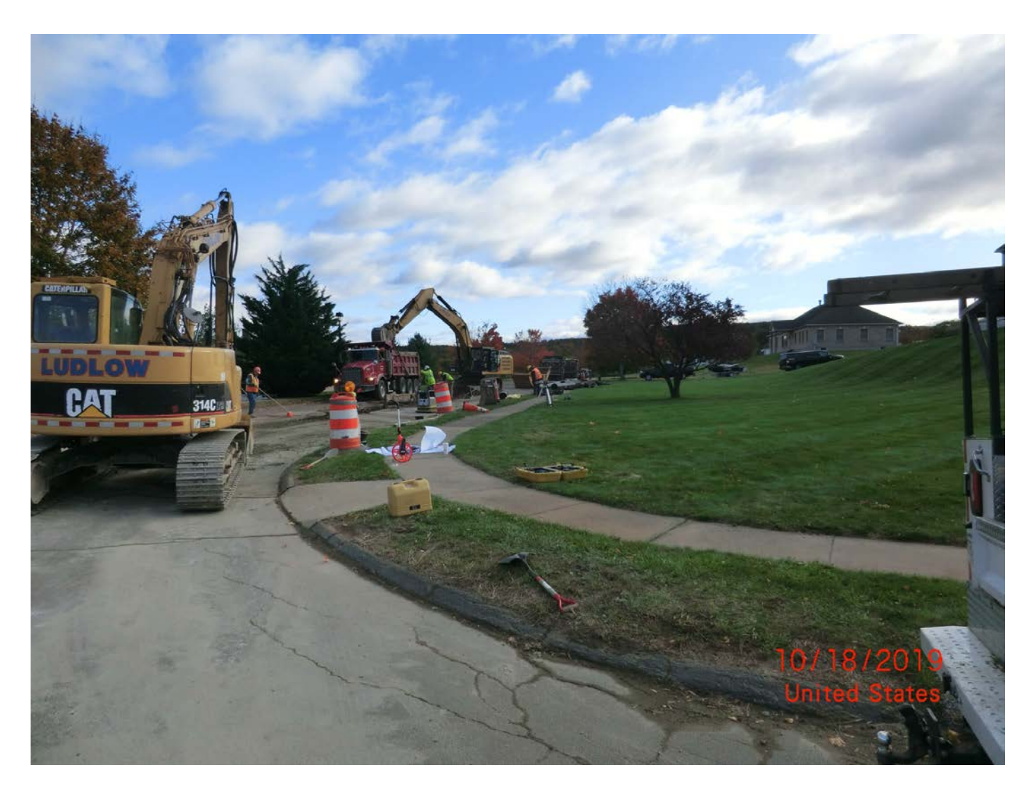
Figure 1 – Facing ENE from corner of Watch Hill and Talcott Drives. Traffic has been routed around Watch Hill Drive to allow work to proceed up Talcott Ridge Drive.