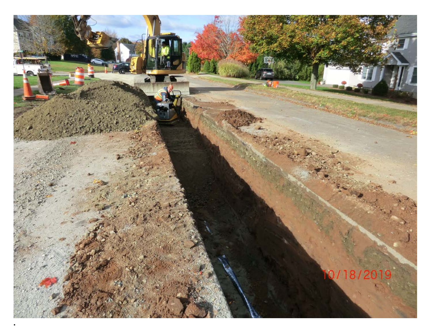
Figure 2 – Facing west, Watch Hill Drive to top left of picture. Compacting lifts along the first two runs of pipe.