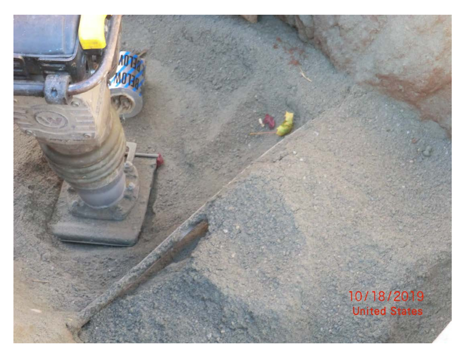
Figure 6 – Looking down into trench, water service line crossing Talcott Ridge Road.. Jumping Jack also pictured to top left of photo.