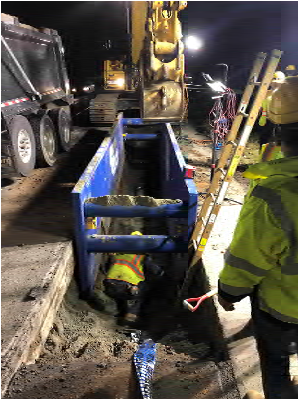
Figure 2 –1 st pipe section attached at Station 115+89, starting to place pipe bedding

Date: October 14, 2019 Day of Week: Monday Report No: 13 Page: 4 of 9