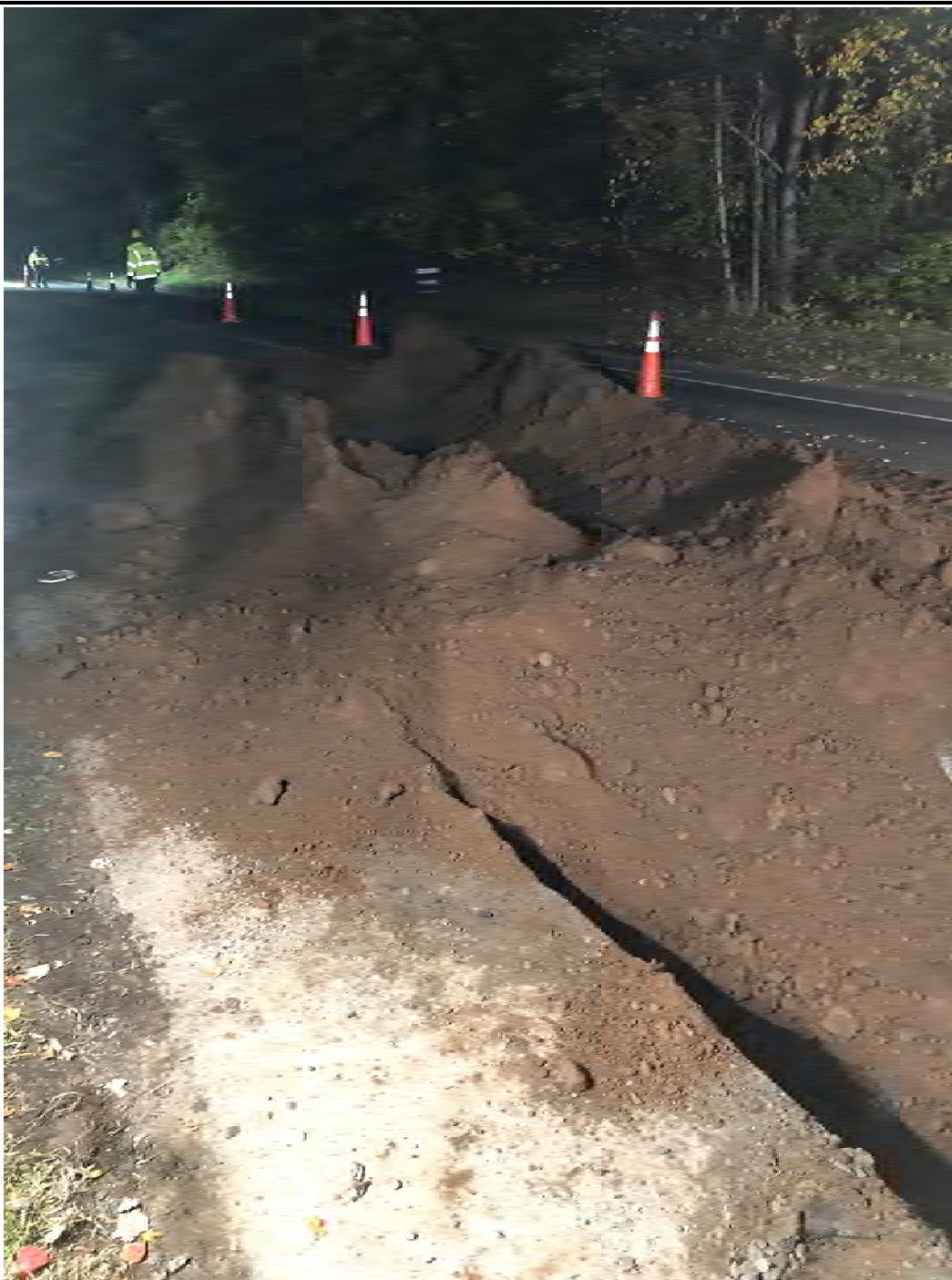
Figure 5 – Newly dumped backfill pile in trench, will be spread to be 3 rd coarse fill lift

Date: October 14, 2019 Day of Week: Monday Report No: 13 Page: 7 of 9