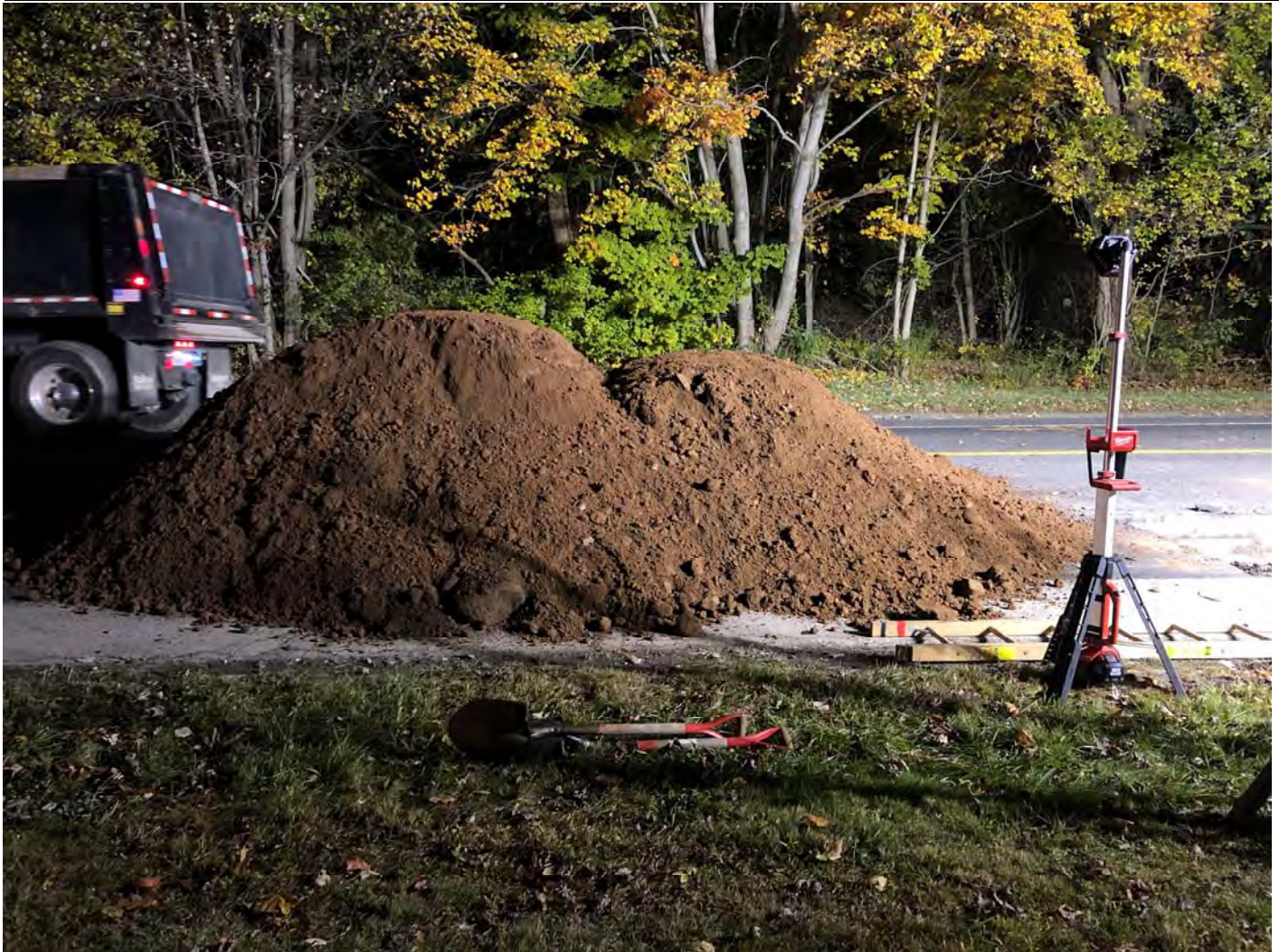
Figure 1 – Backfill pile just before the start of the trench at station Sta. 115+89