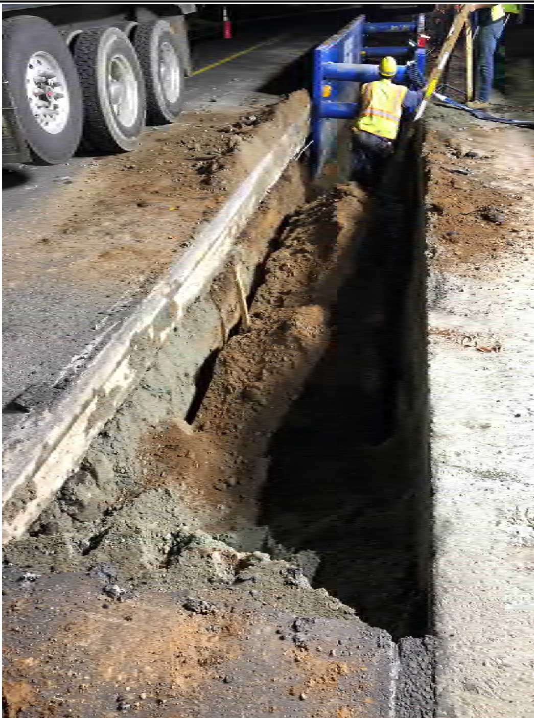
Figure 3 – Wood marking service connection at Sta. 115+95, looking towards 2 nd section

Date: October 14, 2019 Day of Week: Monday Report No: 13 Page: 5 of 9