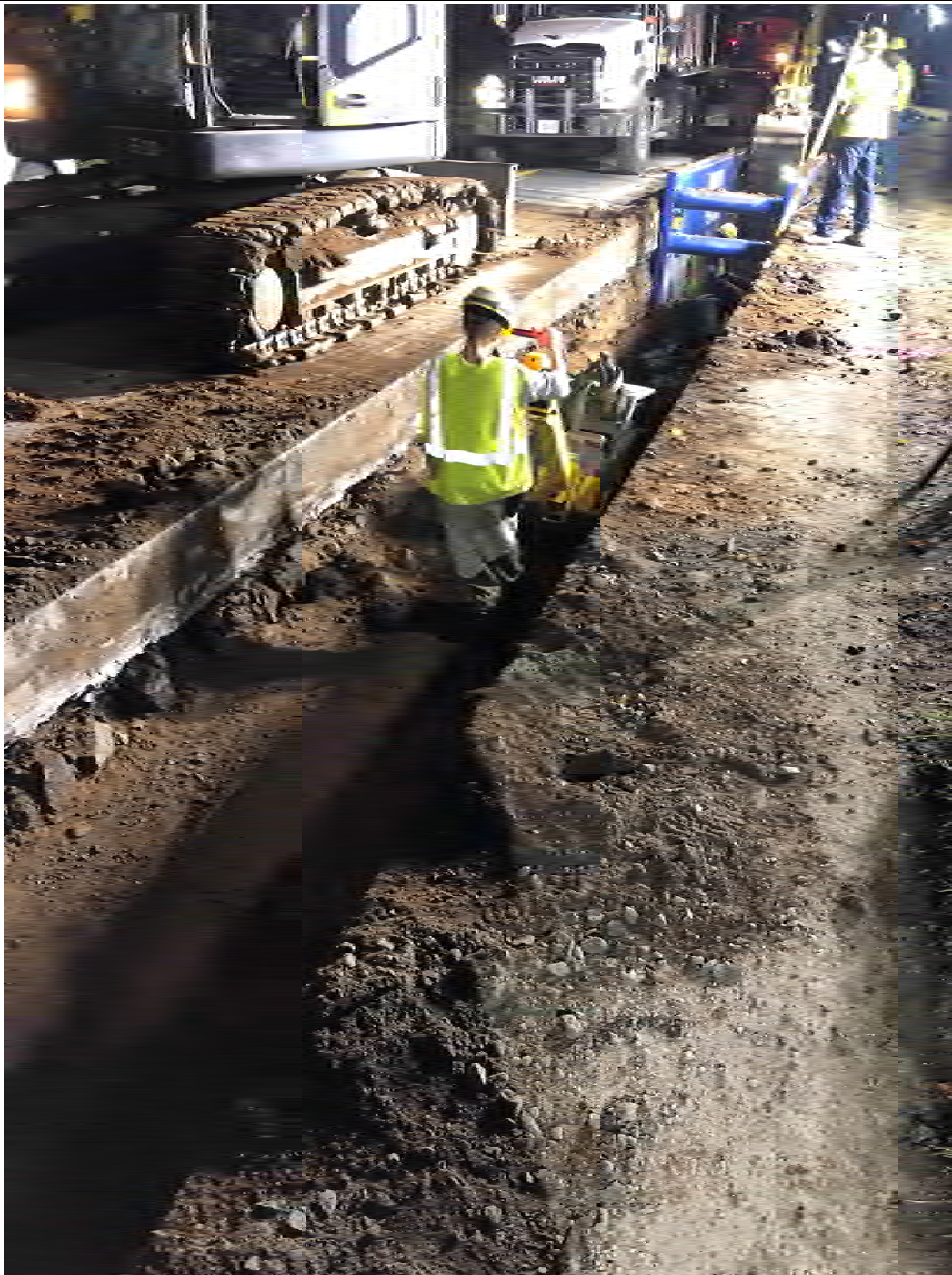
Figure 4 – Compacting with plate compactor over 2 nd , 3 rd pipe sections

Date: October 14, 2019 Day of Week: Monday Report No: 13 Page: 6 of 9