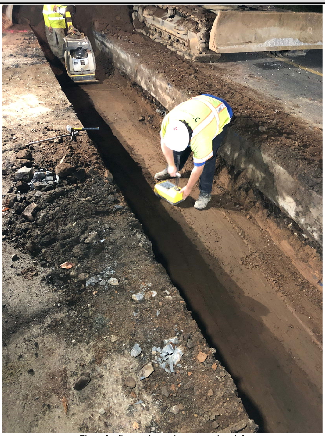
Figure 3 – Compaction testing over sections 1, 2

Project: Durham Meadows Pipeline Installation Date: October 6, 2019 Day of Week: Location: Monday South Main Street, Middletown CT Report No: Project #: AECOM: 60445033 11 5 of 6 Page: Contractor: Ludlow Construction