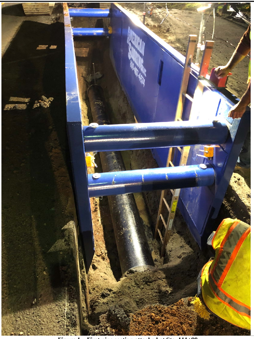
Figure 1 – First pipe section attached at Sta. 111+88

Project: Durham Meadows Pipeline Installation Date: October 6, 2019 Day of Week: Monday Location: South Main Street, Middletown CT Report No: Project #: AECOM: 60445033 11 3 of 6 Page: Contractor: Ludlow Construction