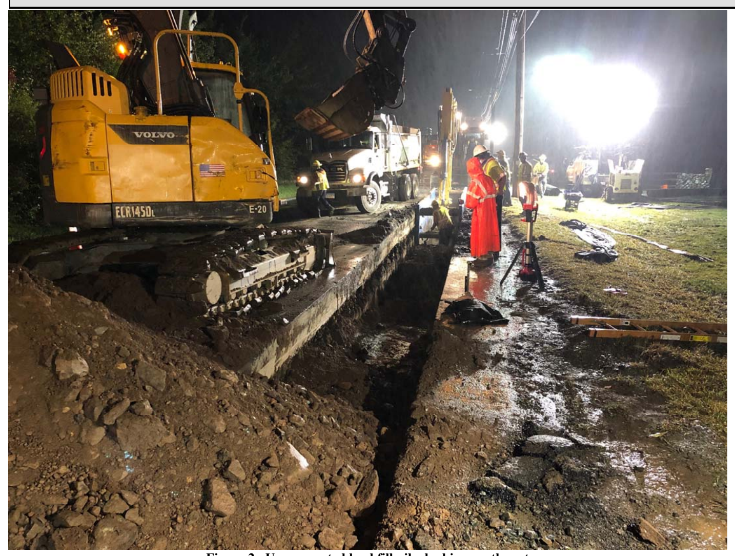
Figure 2 –Uncompacted backfill pile, looking southwest

Project: Durham Meadows Pipeline Installation Date: October 2, 2019 Day of Week: Wednesday Location: South Main Street, Middletown CT Report No: Project #: AECOM: 60445033 10 Page: 4 of 5 Contractor: Ludlow Construction