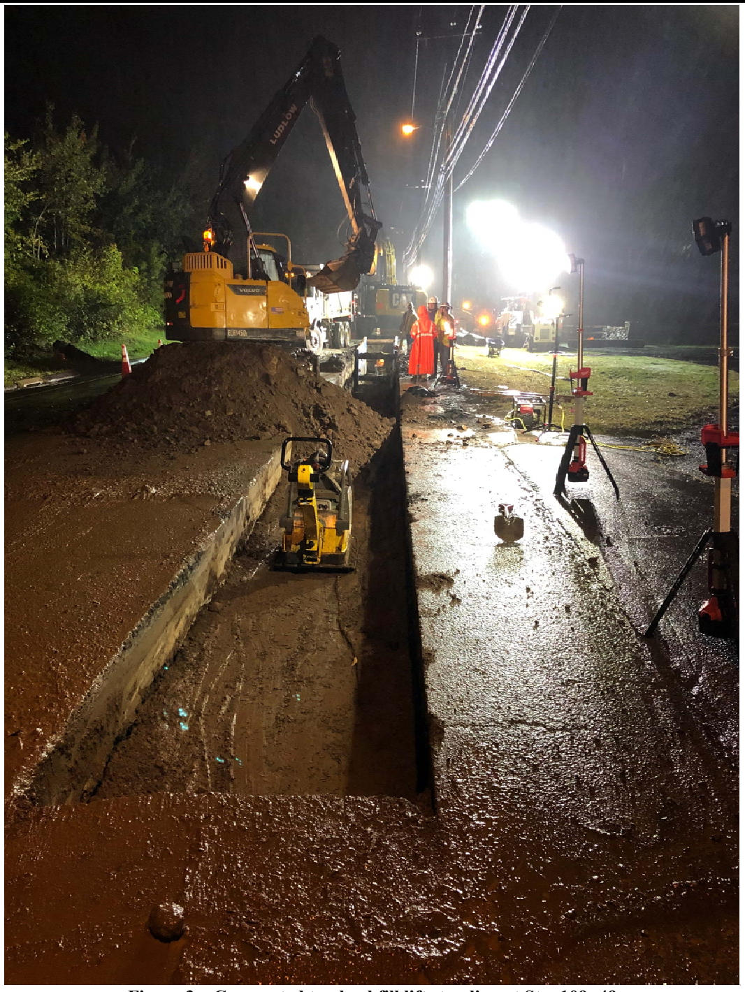
Figure 3 – Compacted top backfill lift standing at Sta. 109+49

Project: Durham Meadows Pipeline Installation Date: October 2, 2019 Day of Week: Wednesday Location: South Main Street, Middletown CT Report No: Project #: AECOM: 60445033 10 5 of 5 Page: Contractor: Ludlow Construction