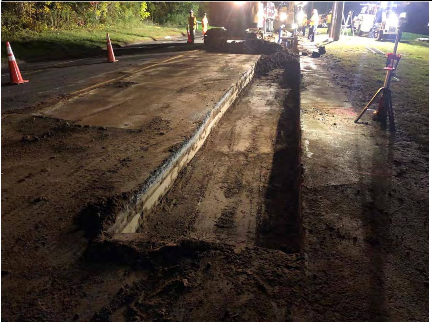
Figure 4 – Compacted top backfill later standing at Station 107+50

Date: October 1, 2019 Day of Week: Tuesday Report No: 9 Page: 6 of 8