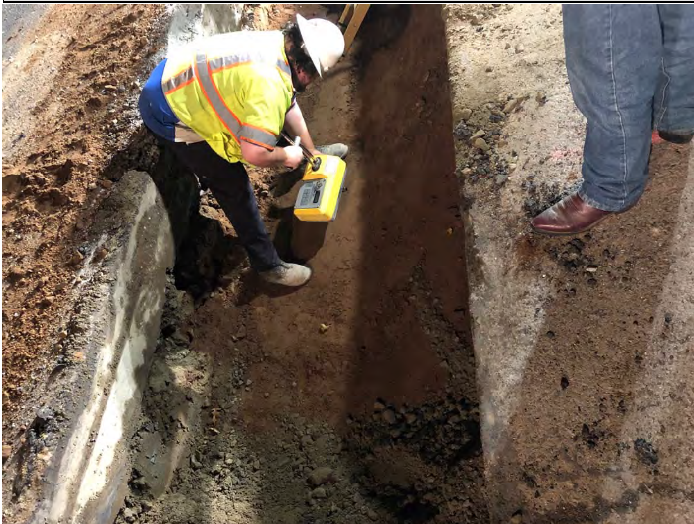
Figure 2 – Compaction testing above 1 st pipe section