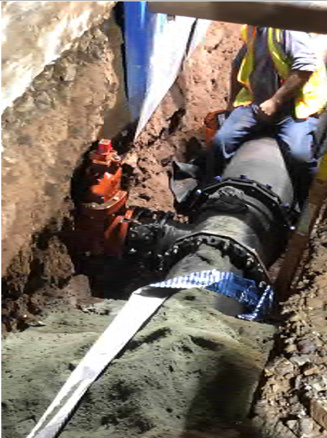
Figure 6 – Attaching 7 th pipe section at Tee section with Gate Valve