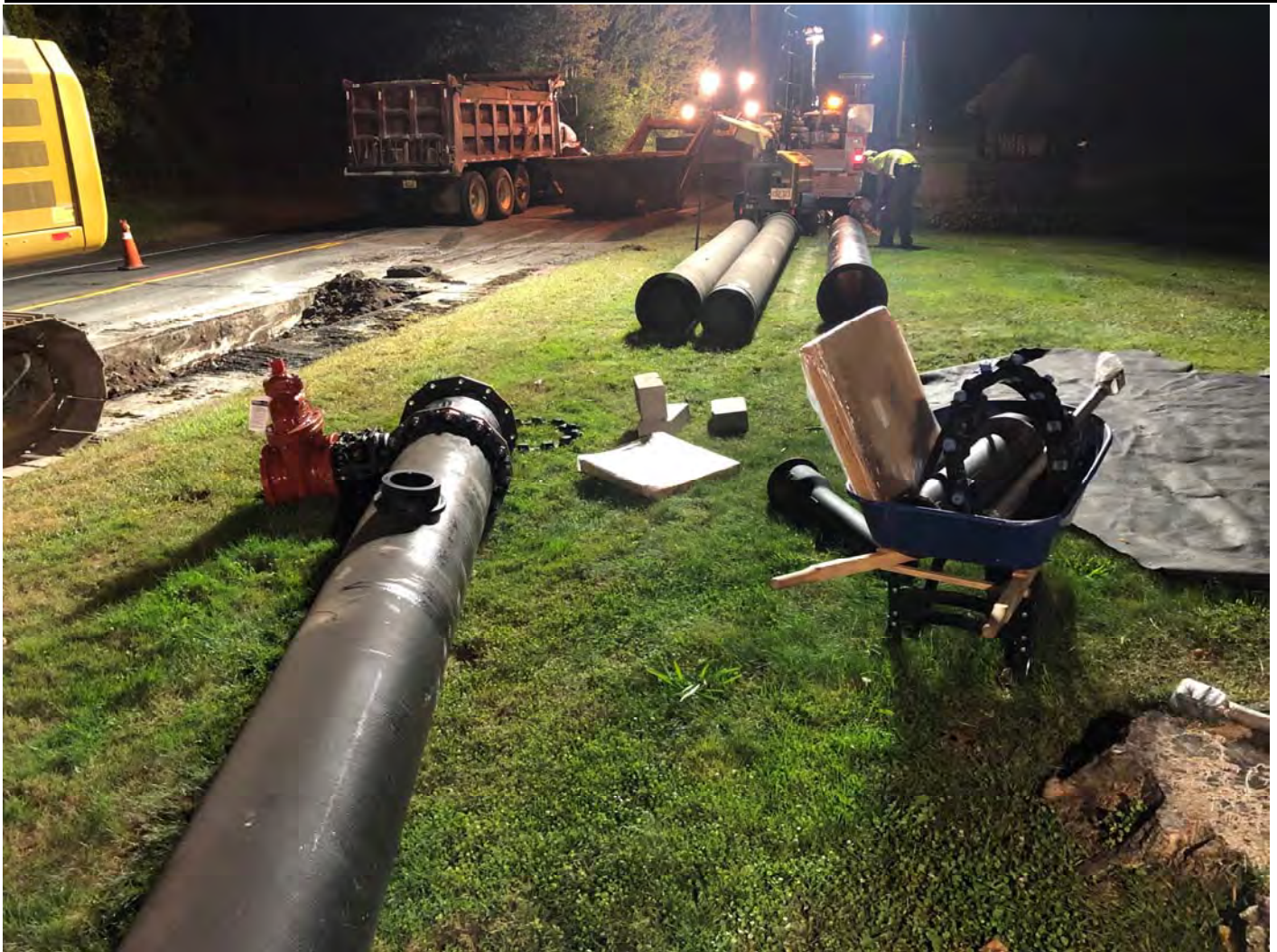
Figure 3 – Assembled Tee and Gate Valve with parts, cutting pipe section in background

Date: October 1, 2019 Day of Week: Tuesday Report No: 9 Page: 5 of 8