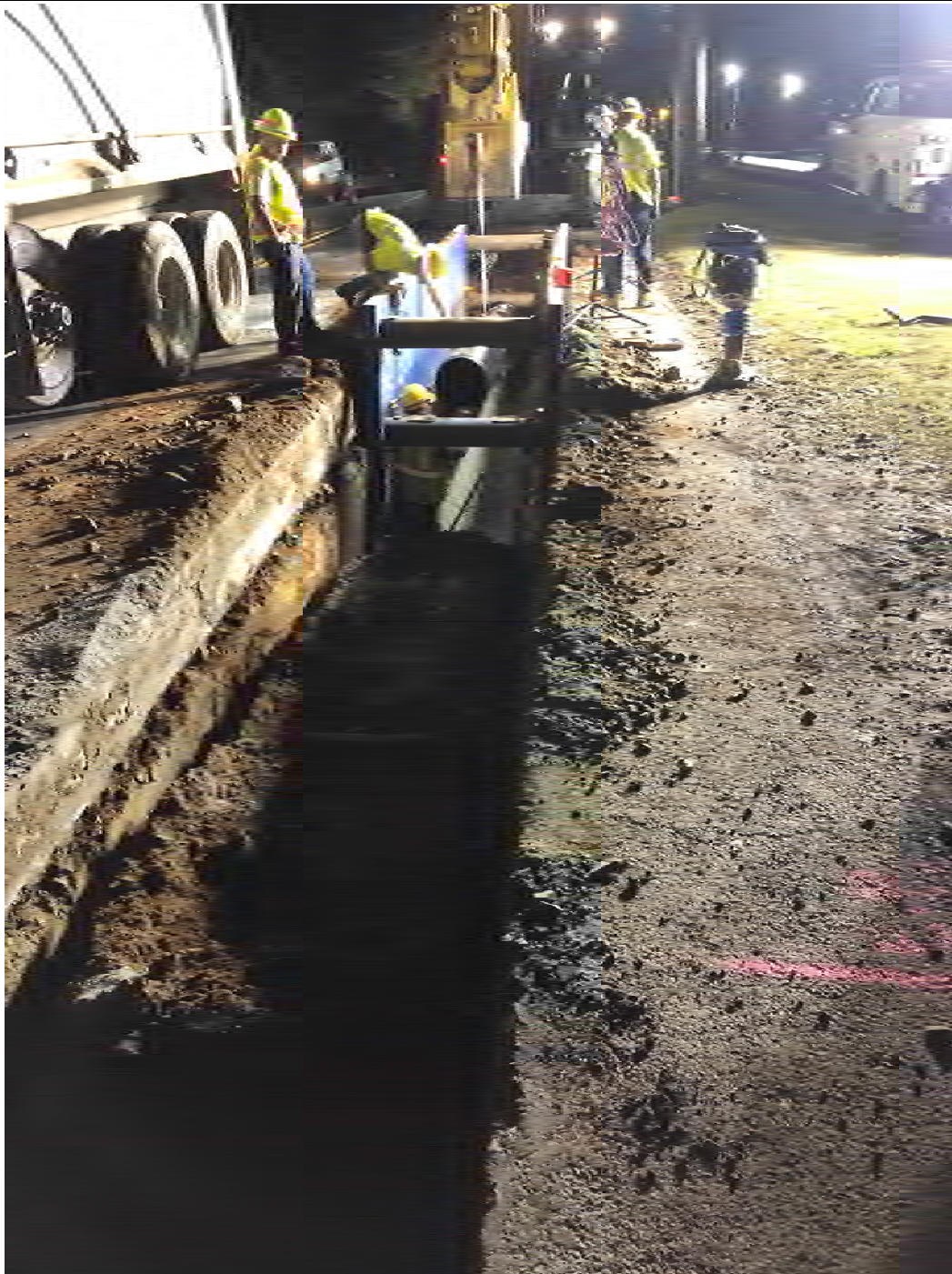
Figure 1 – Lowering second pipe section into trench

Date: October 1, 2019 Day of Week: Tuesday Report No: 9 Page: 3 of 8