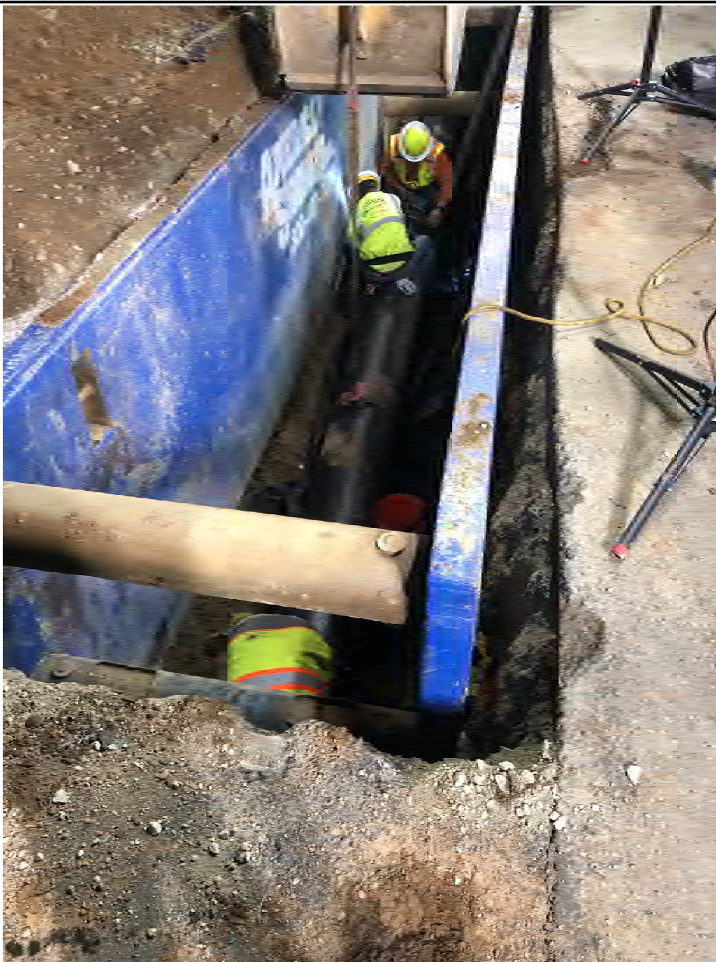
Figure 5 – Making second connection

Date: September 18, 2019 Day of Week: Wednesday Report No: 8 Page: 7 of 10