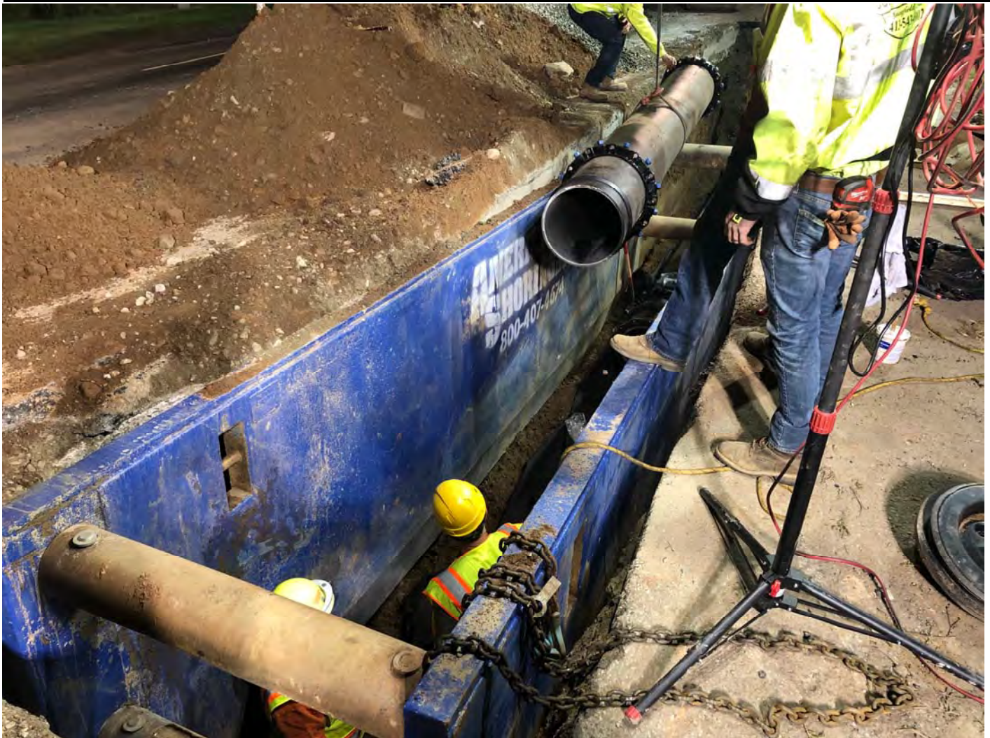
Figure 2 – Lowering second pipe into trench

Date: September 18, 2019 Day of Week: Wednesday Report No: 8 Page: 4 of 10