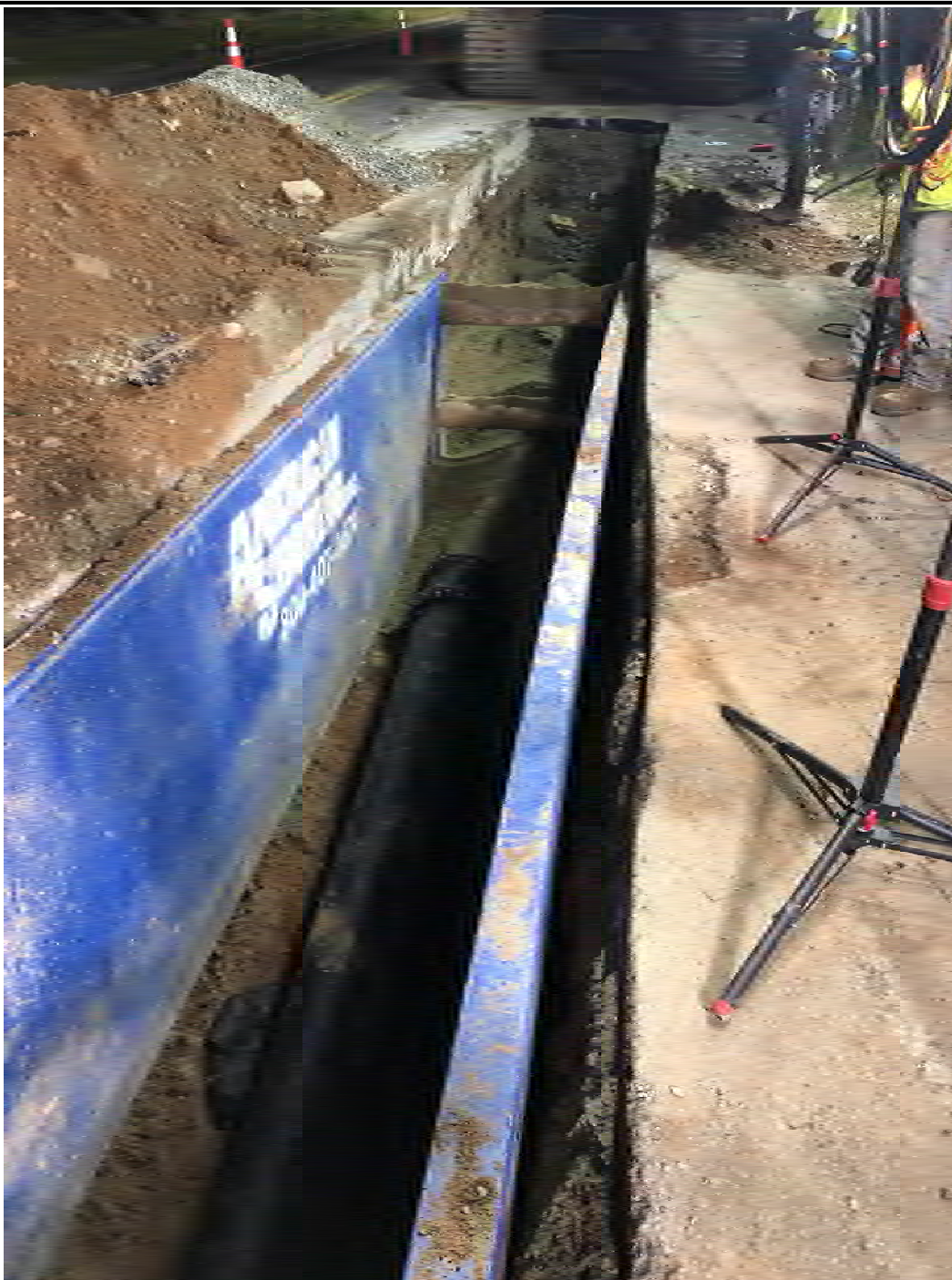
Figure 6 – Restrained MJ solid sleeve installed, preparing to place and compact bedding over pipe sections

Date: September 18, 2019 Day of Week: Wednesday Report No: 8 Page: 8 of 10