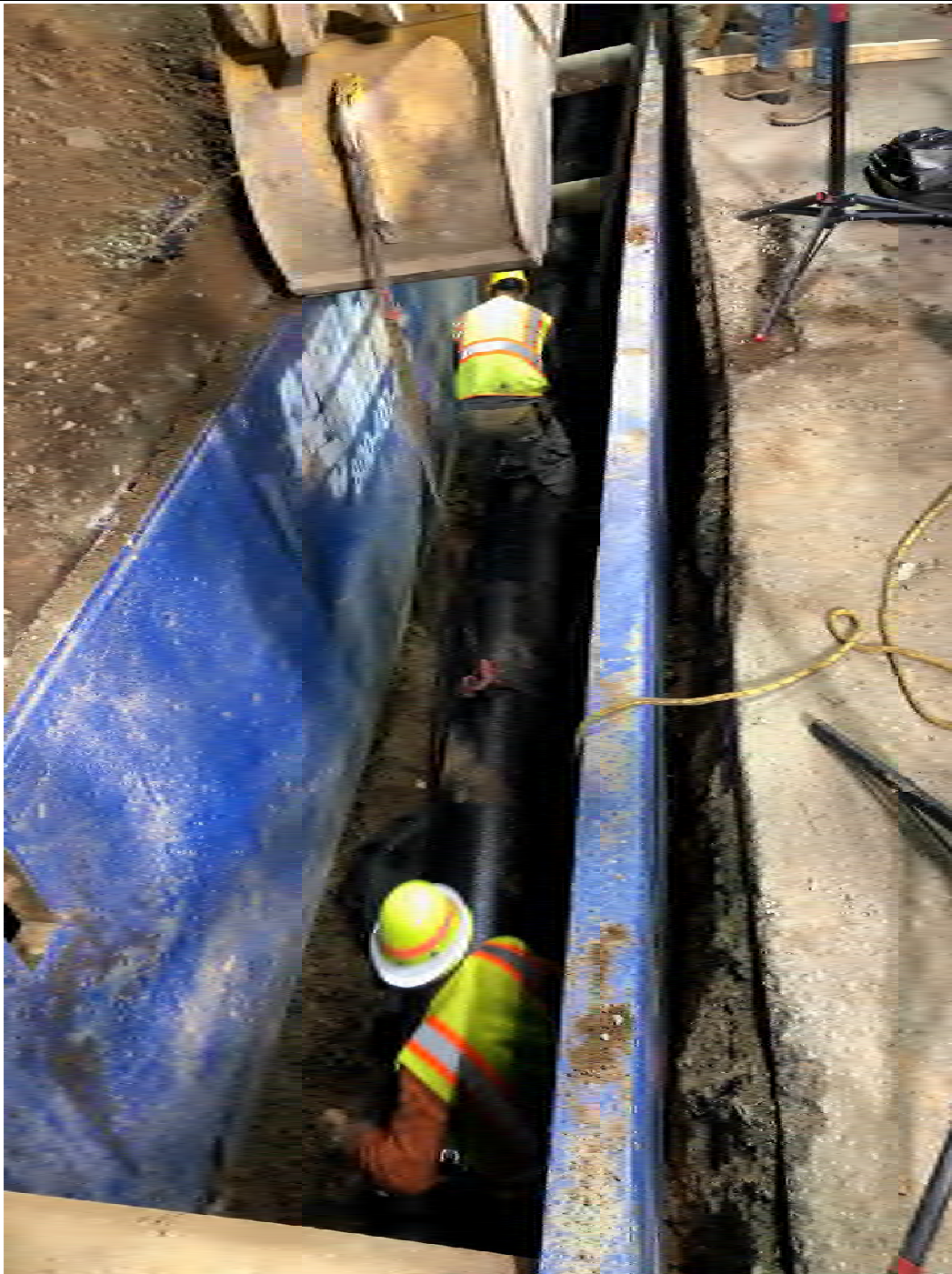
Figure 3 – Attaching pipe sections

Date: September 18, 2019 Day of Week: Wednesday Report No: 8 Page: 5 of 10