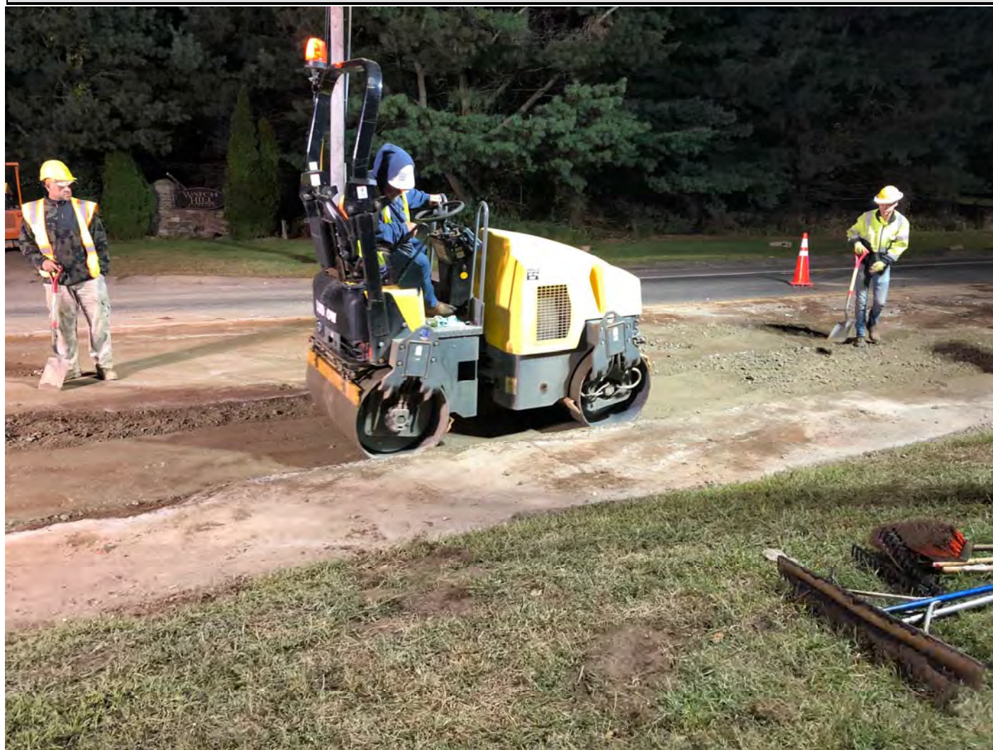
Figure 8 – Compacting processed stone layer

Date: September 18, 2019 Day of Week: Wednesday Report No: 8 Page: 10 of 10