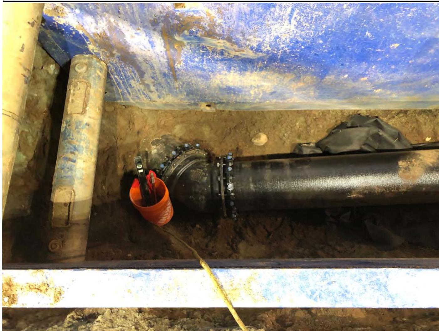
Figure 4 – 45-degree 16" bend with restrained glands, geotextile with stone bedding underneath

Date: September 18, 2019 Day of Week: Wednesday Report No: 8 Page: 6 of 10