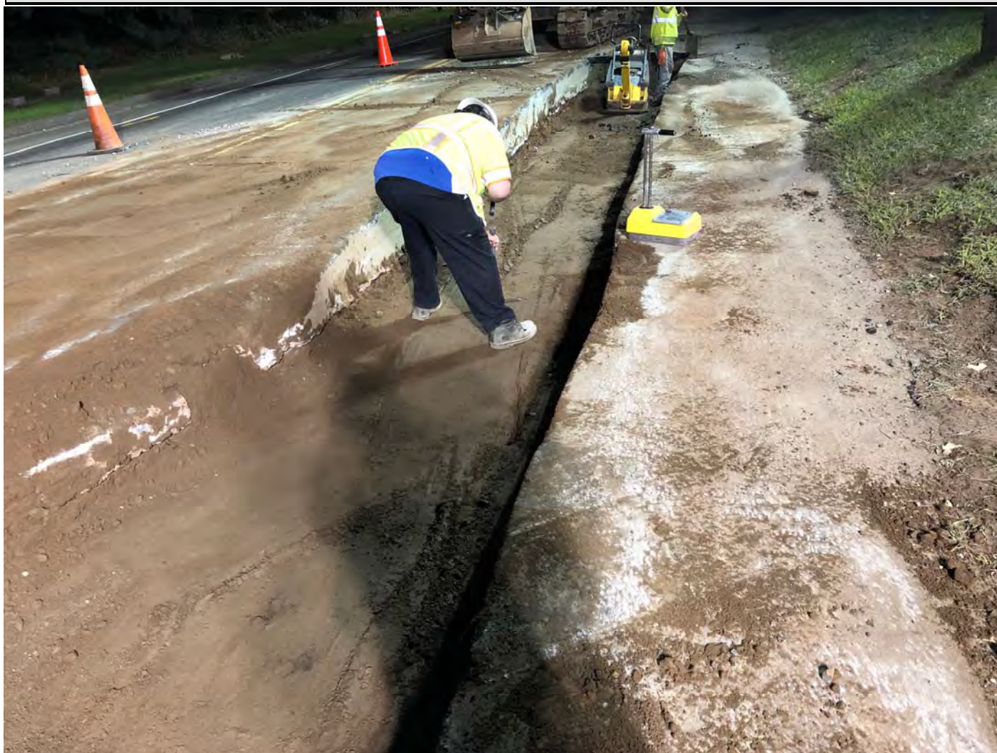
Figure 7 – Compaction testing top backfill layer

Date: September 18, 2019 Day of Week: Wednesday Report No: 8 Page: 9 of 10