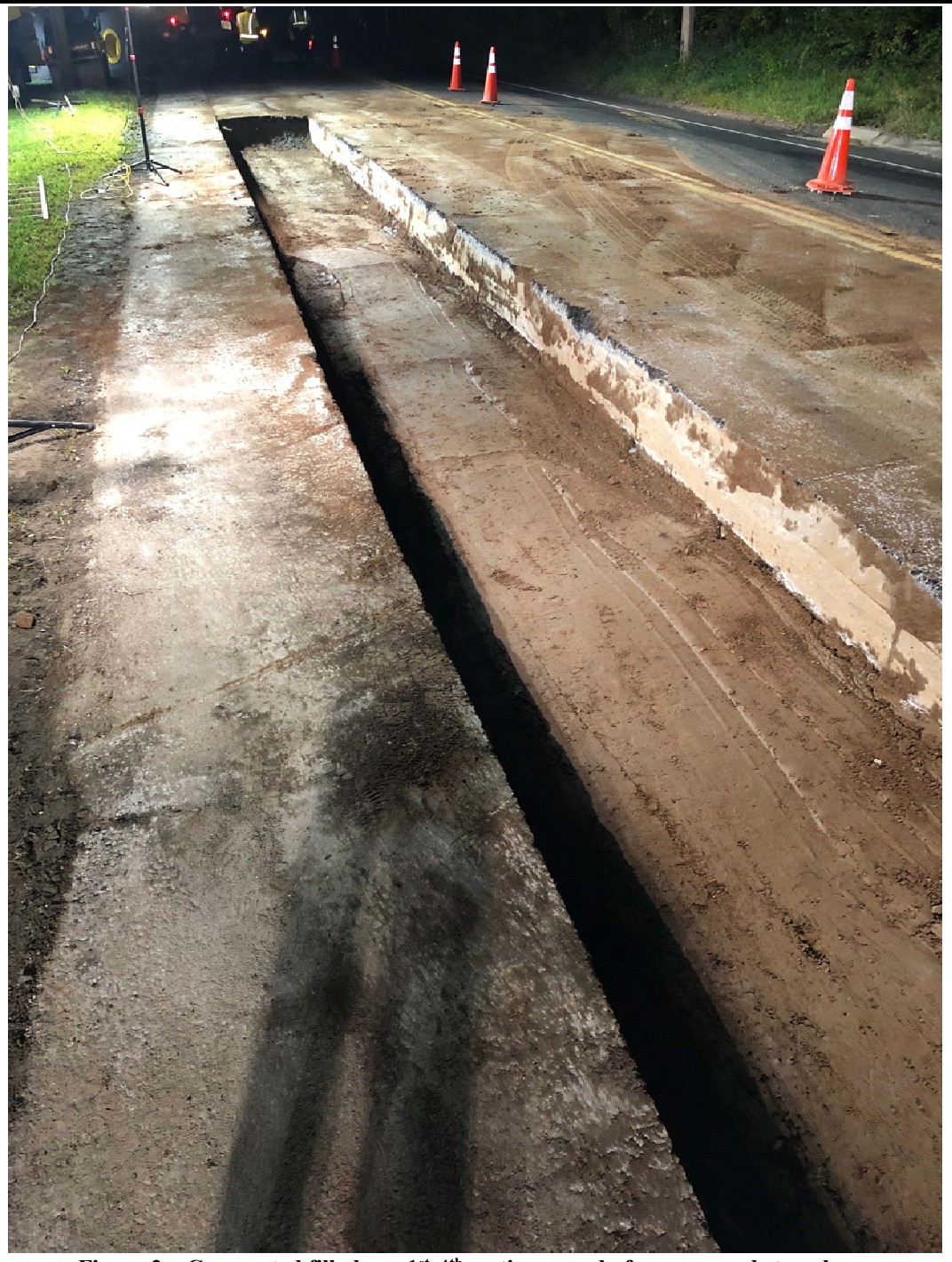
Figure 2 – Compacted fill above 1st-4th sections, ready for processed stone layer

Project:Durham Meadows Pipeline InstallationDate:September 15, 2019Location:South Main Street, Middletown CTDay of Week:SundayProject #:AECOM: 60445033Report No:5Contractor:Ludlow ConstructionPage:4 of 8