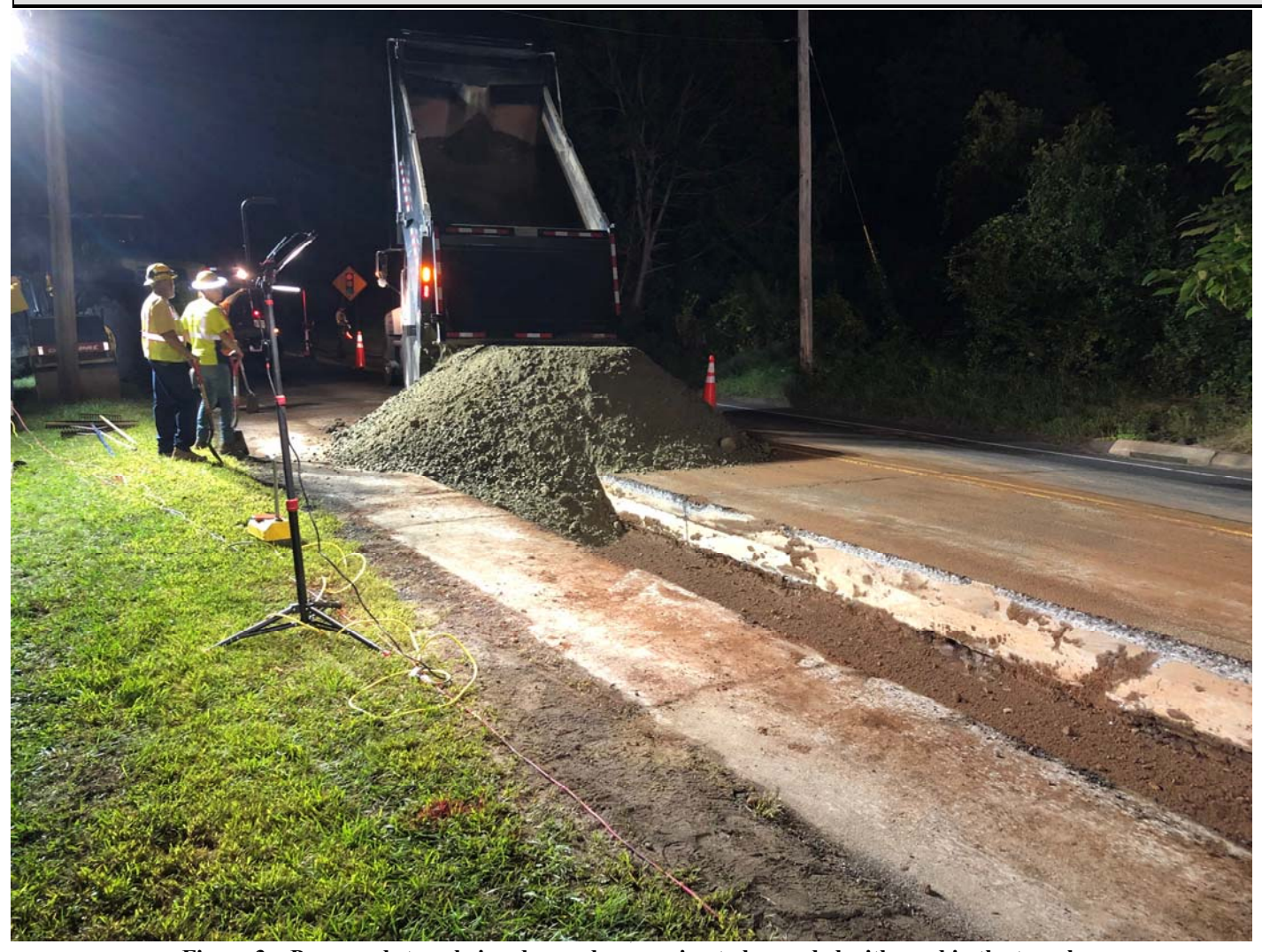
Figure 3 – Processed stone being dumped, preparing to be graded with road in the trench

Project:Durham Meadows Pipeline InstallationDate:September 15, 2019Location:South Main Street, Middletown CTDay of Week:SundayProject #:AECOM: 60445033Report No:5Contractor:Ludlow ConstructionPage:5 of 8