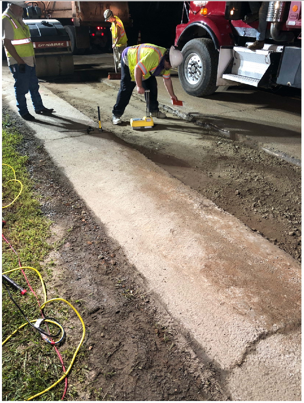
Figure 6 – Compaction testing processed stone layer

Project:Durham Meadows Pipeline InstallationDate:September 15, 2019Location:South Main Street, Middletown CTDay of Week:SundayProject #:AECOM: 60445033Report No:5Contractor:Ludlow ConstructionPage:8 of 8