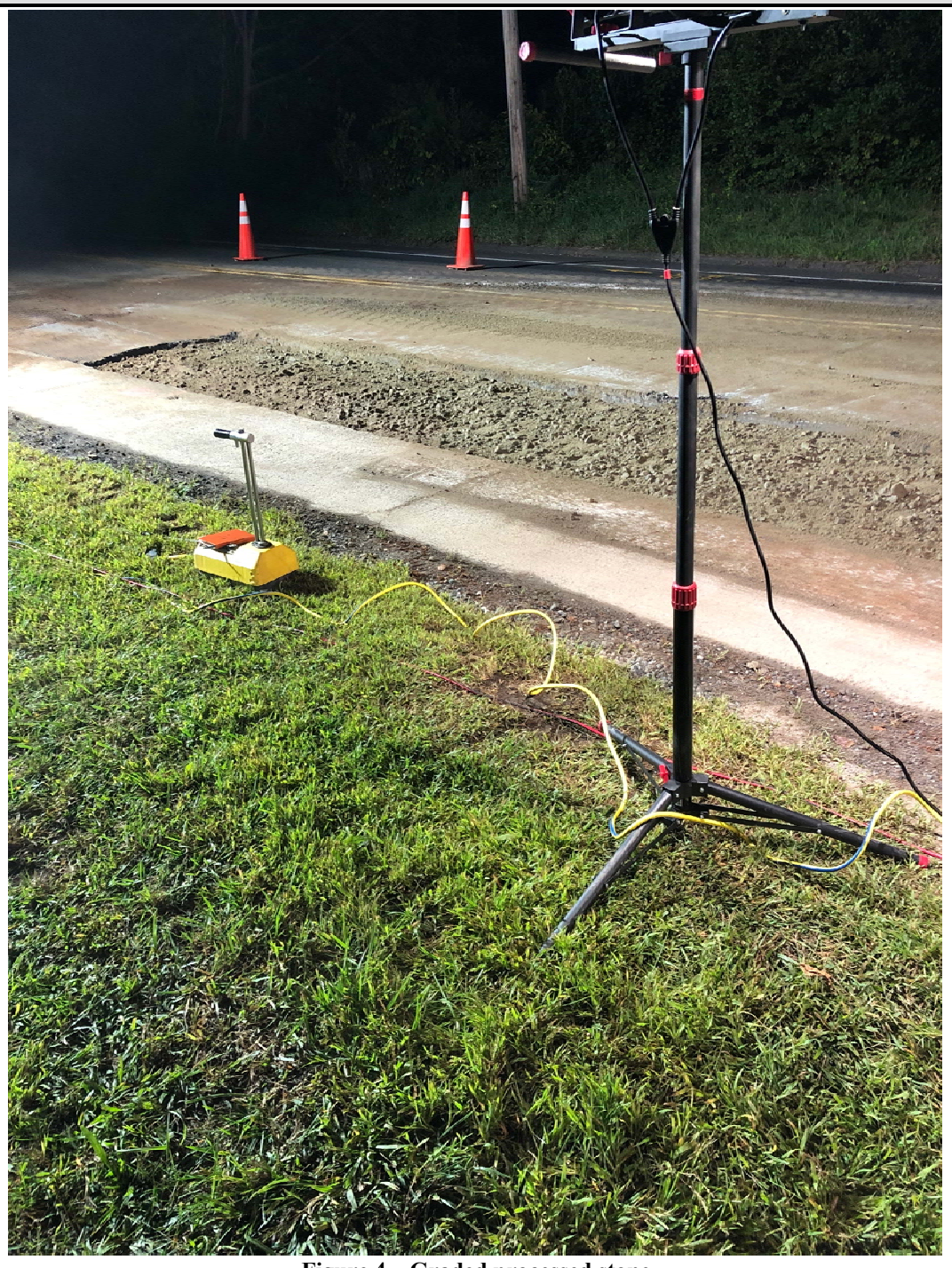
Figure 4 – Graded processed stone

Project:Durham Meadows Pipeline InstallationDate:September 15, 2019Location:South Main Street, Middletown CTDay of Week:SundayProject #:AECOM: 60445033Report No:5Contractor:Ludlow ConstructionPage:6 of 8