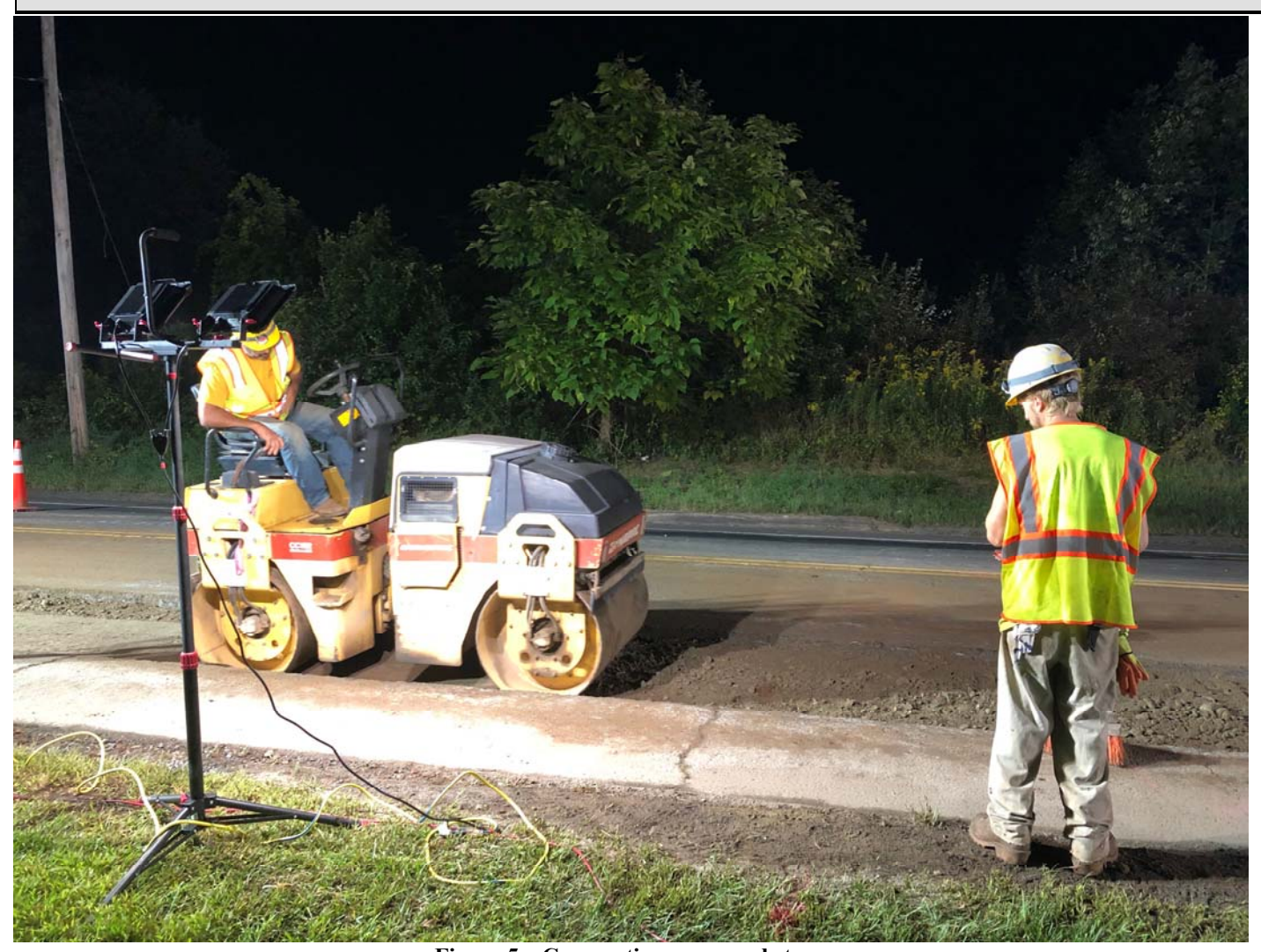
Figure 5 – Compacting processed stone