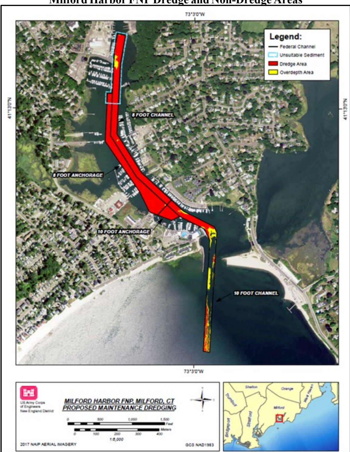
<u>Attachment 2</u> <u>Milford Harbor FNP Dredge and Non-Dredge Areas</u>