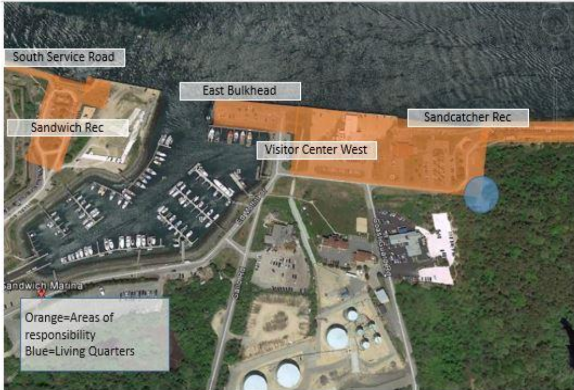
Figure 7: Area of trash removal services along the South Service Road from station# 35 - #23