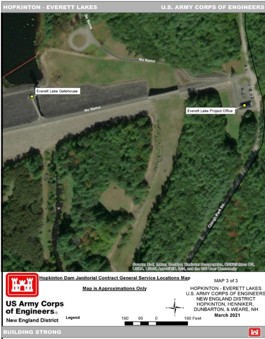
Informational Map 3: Location of Everett Lake Project Office and