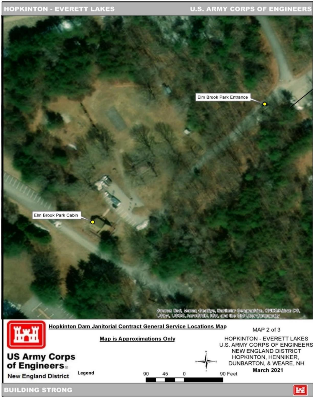
Informational Map 2: Location of Elm Brook Park Cabin.