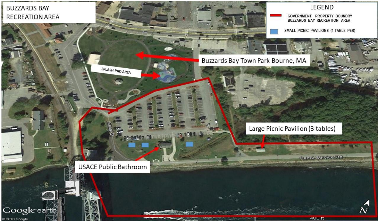
Figure 2. Cape Cod Canal Park Attendant Buzzards Bay Recreation Area of responsibility