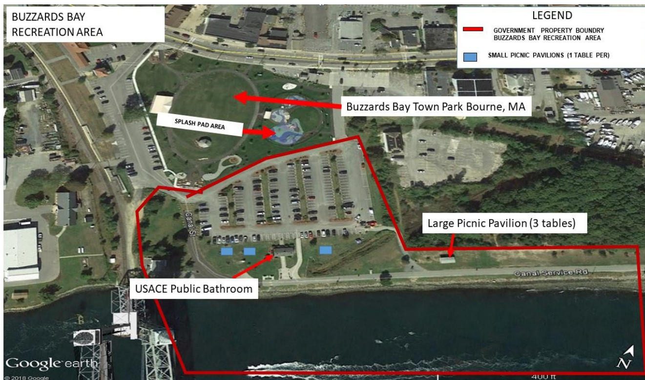
Figure 2. Cape Cod Canal Park Attendant Buzzards Bay Recreation Area of responsibility