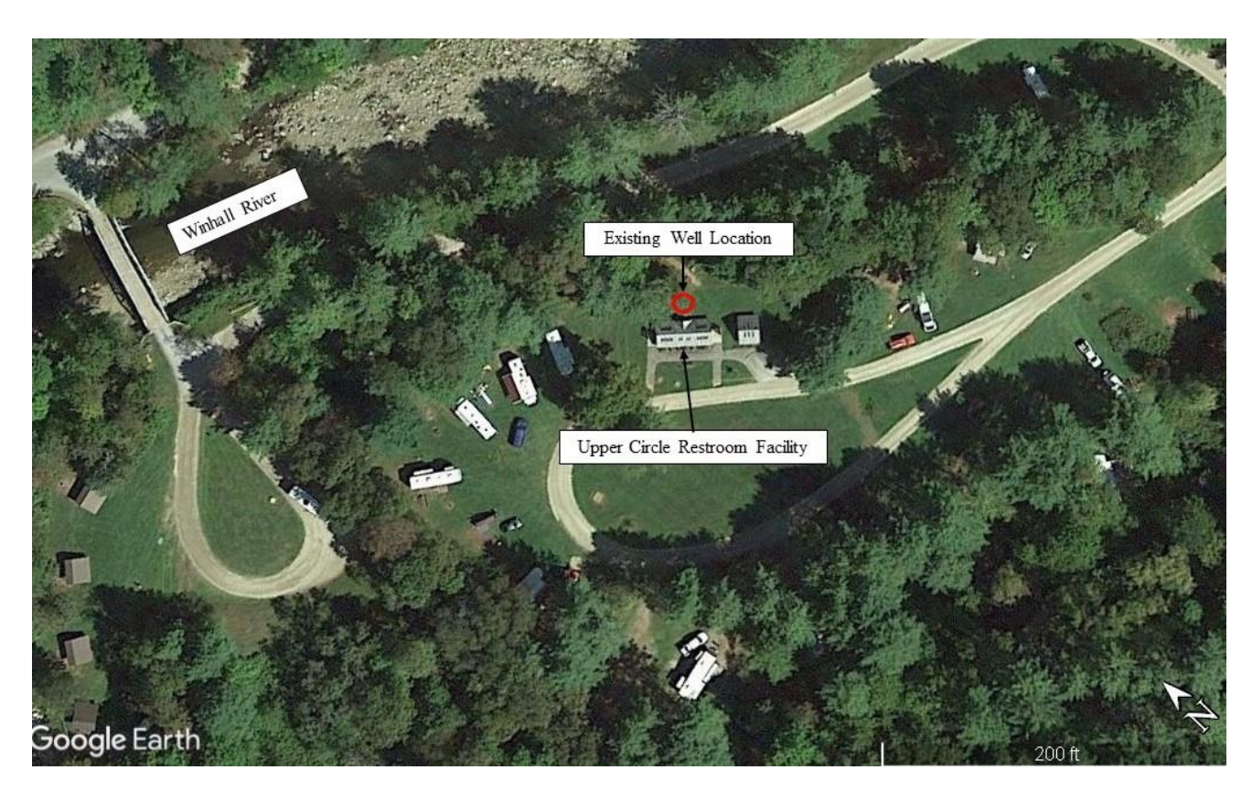
<u>Map 1</u> Upper Circle Restroom Facility and Existing Well Locations