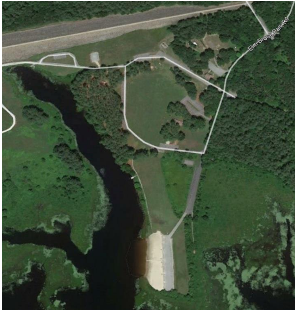
Exhibit A: Location map with approximate locations of the upper and lower restroom facilities at Elm Brook Park.