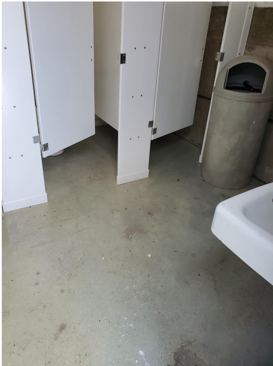
Exhibit G: Existing conditions of women's upper restroom floor.