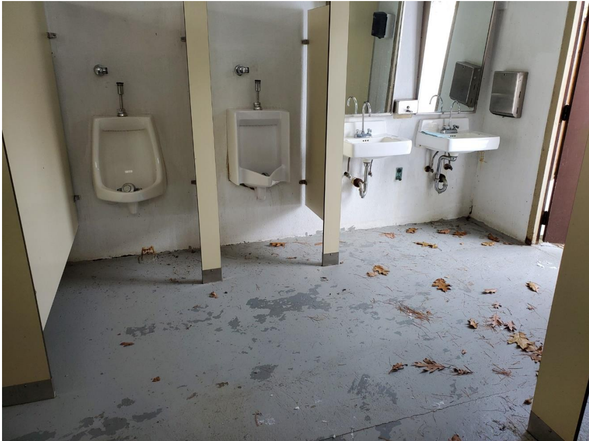
Exhibit C: Existing floor conditions of men's lower restroom.