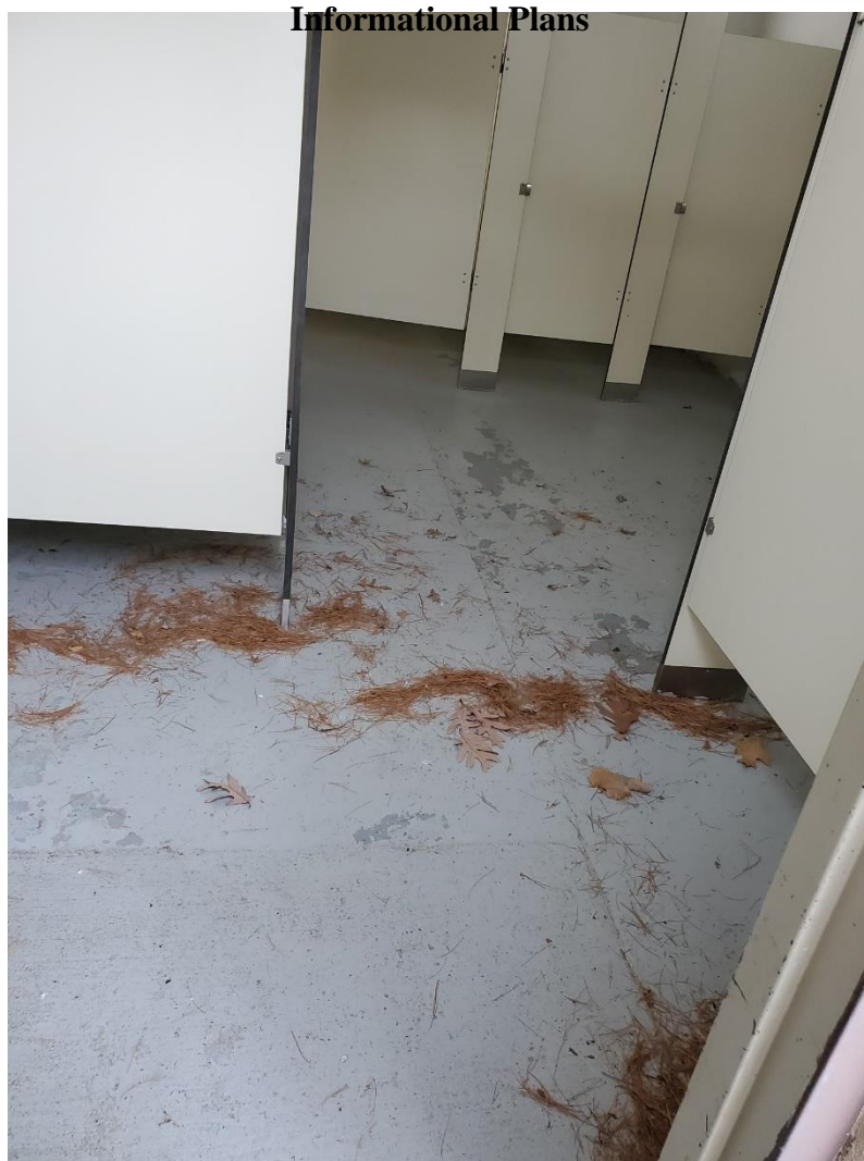
Exhibit D: Existing floor conditions of women's lower restroom.