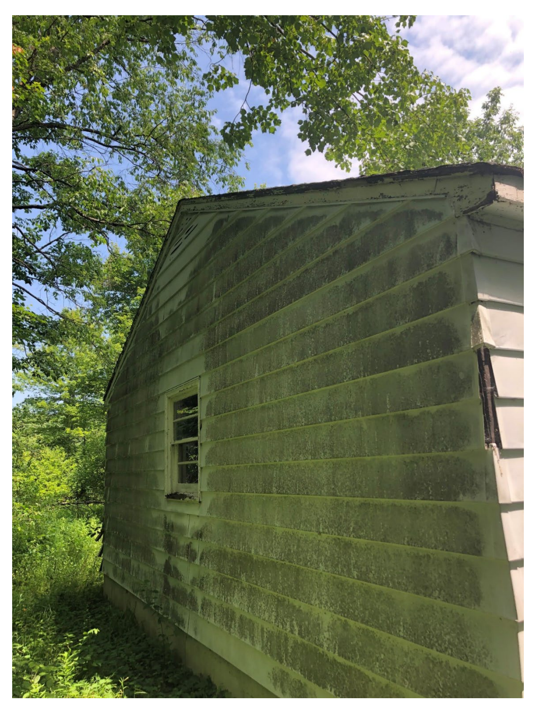
Informational Photo 7: West Side Painted Roof Trim and Window Frame

Performance Work Statement Informational Photos