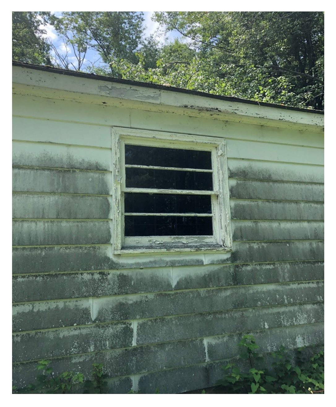
Informational Photo 4: North Side Painted Roof Trim and Window Frame