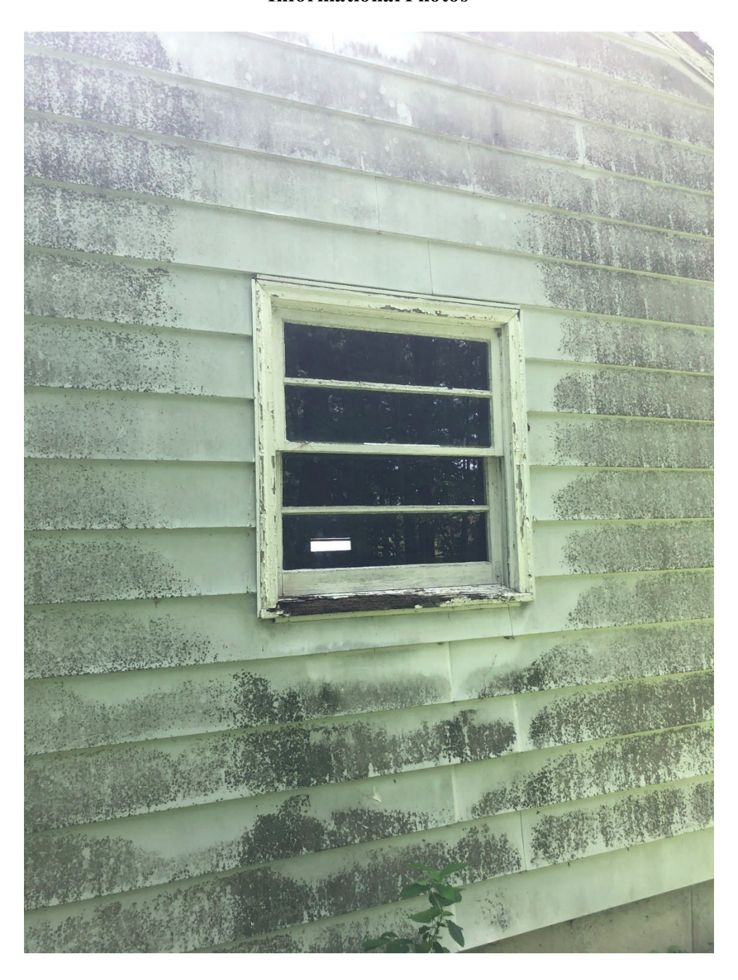
Informational Photo 8: West Side Painted Window Frame