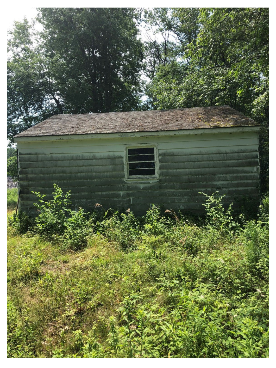
Informational Photo 5: North Side Overview