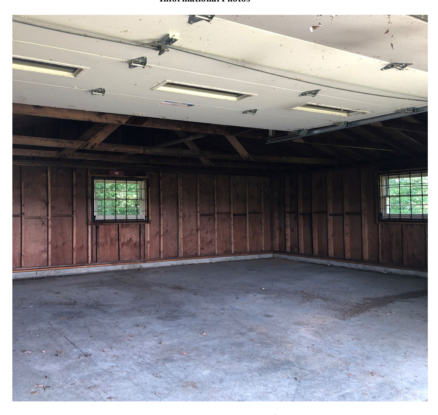
Informational Photo 9: Garage Interior