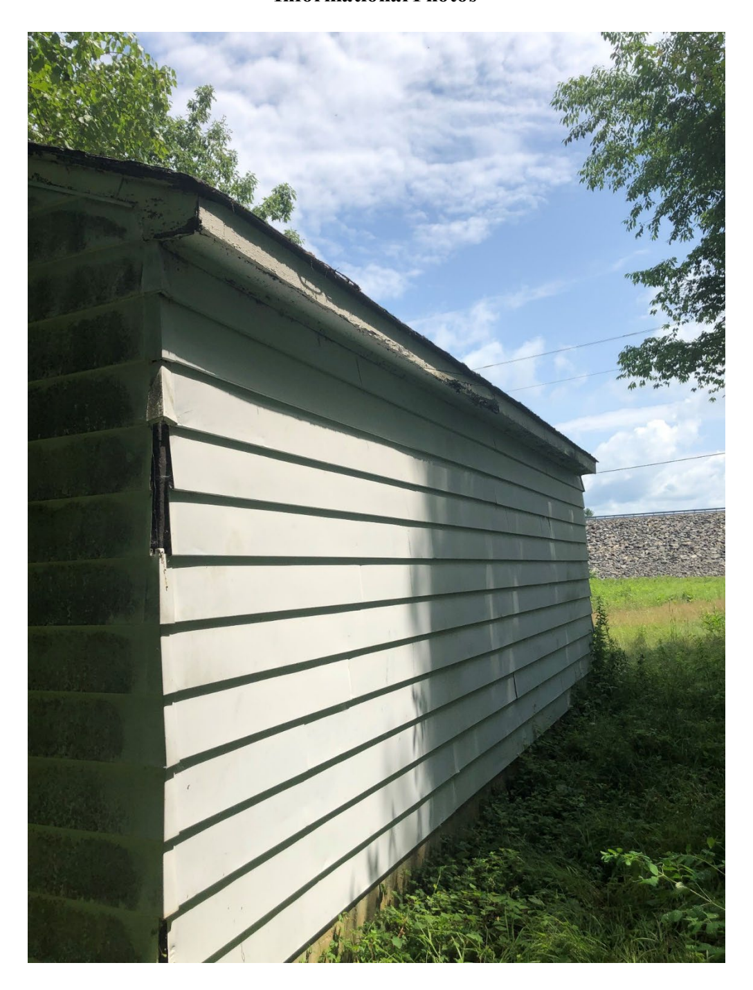
Informational Photo 6: South Side Painted Roof Trim