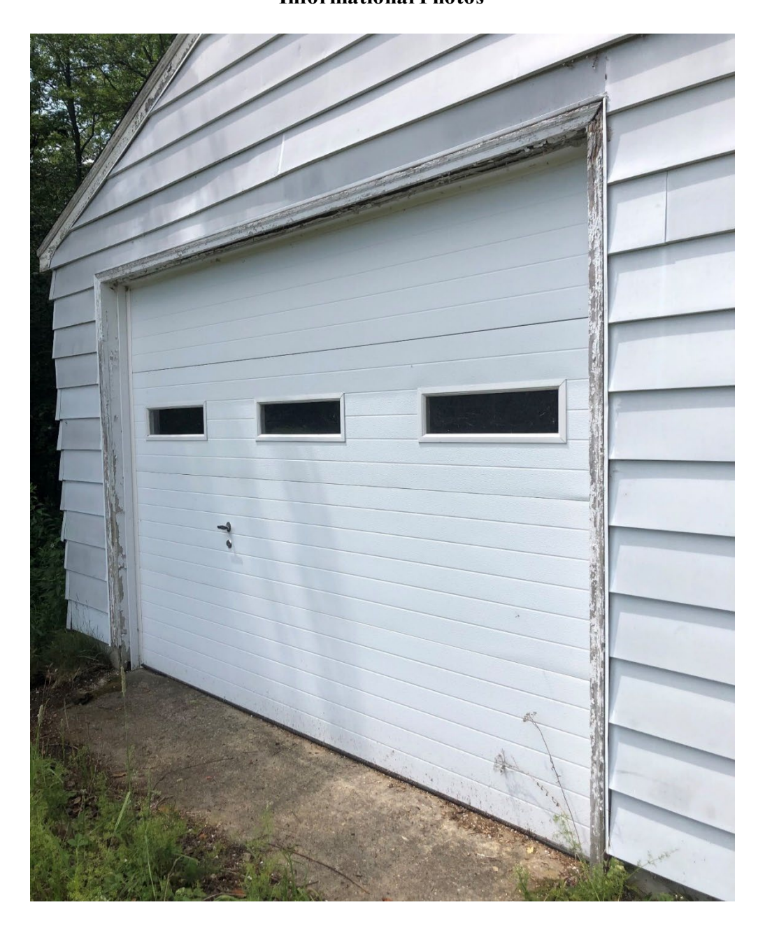
Informational Photo 3: East Side Painted Garage Door Frame