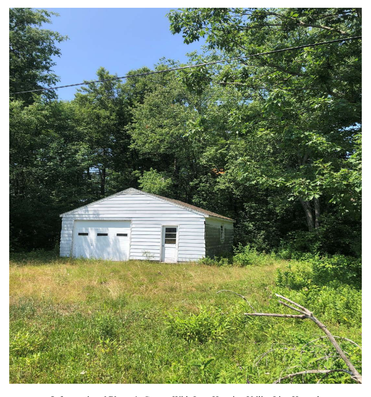
Informational Photo 1: Garage With Low Hanging Utility Line Hazard