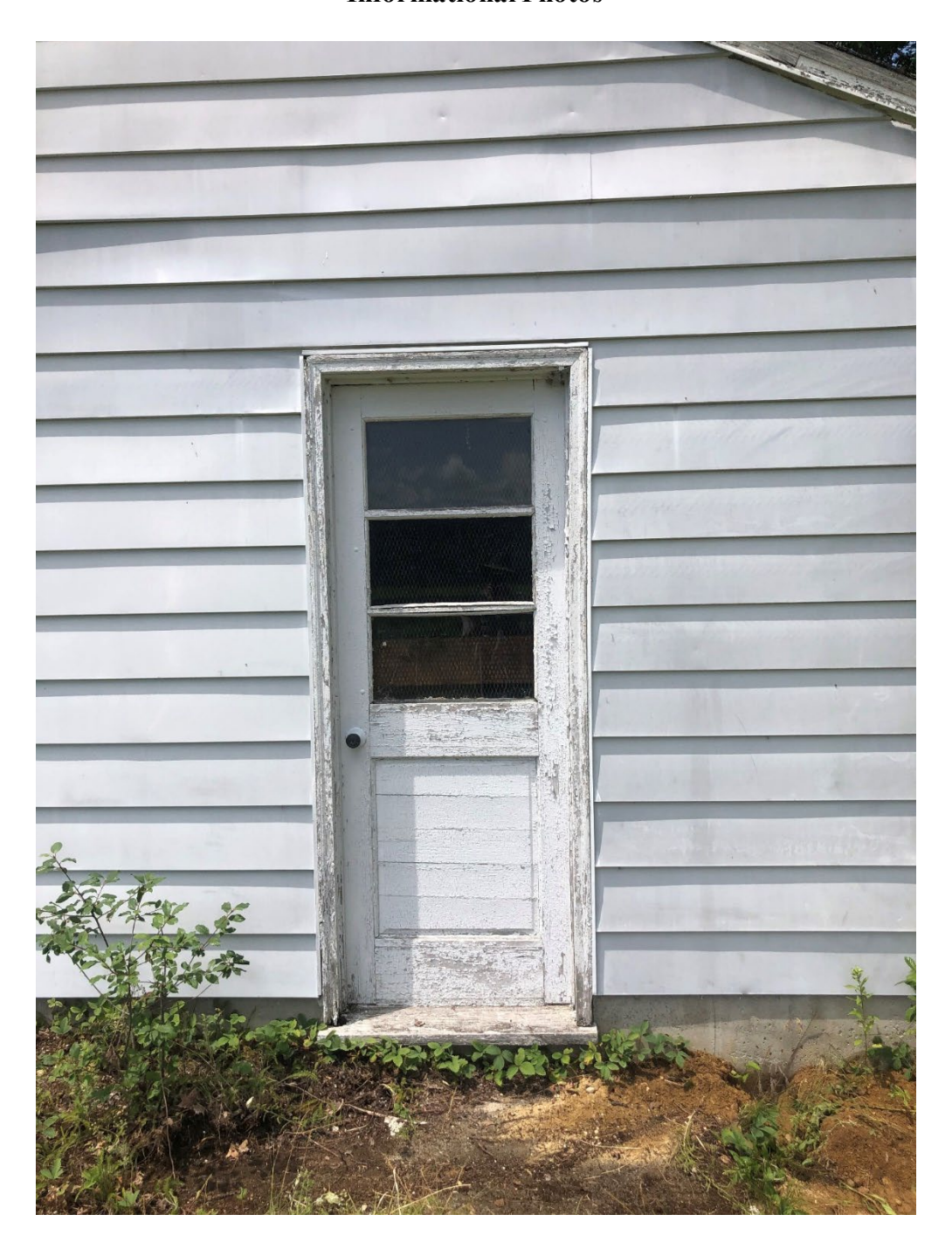
Informational Photo 2: East Side Painted Door and Door Frame