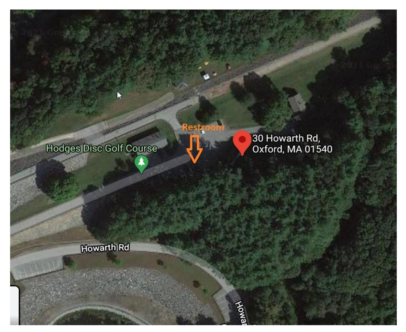
Informational Map 3: Hodges Village Dam Site Restroom