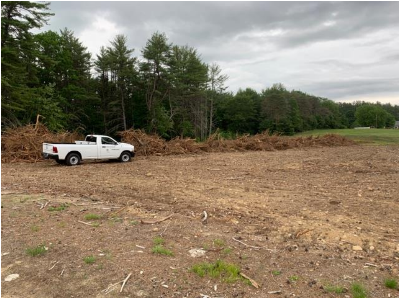
Informational Photo 1: Playground debris pile to be removed