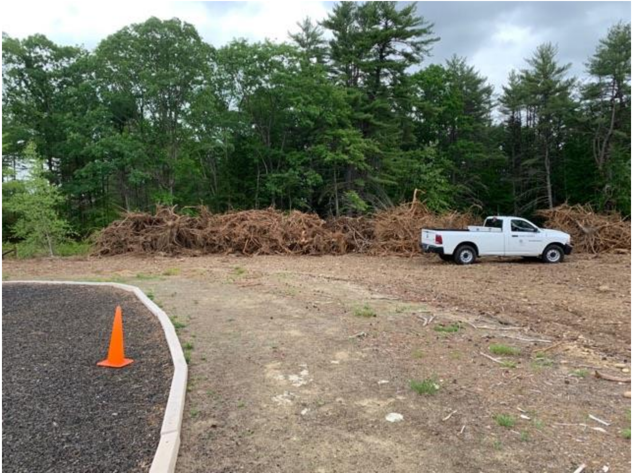
Informational Photo 2: Playground debris pile to be removed