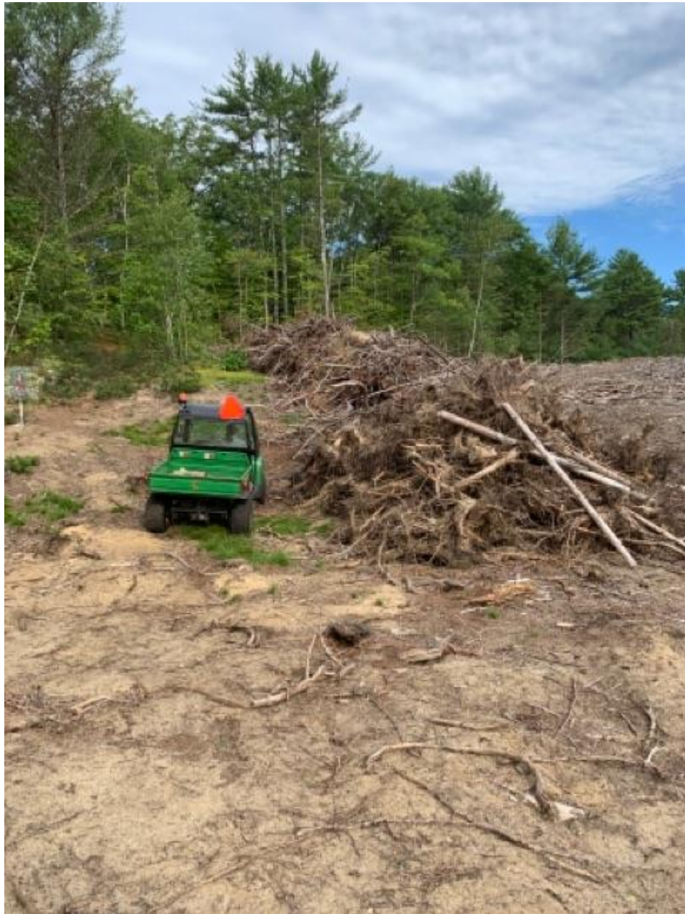
Informational Photo 3: Coleman Drive debris pile to be removed.