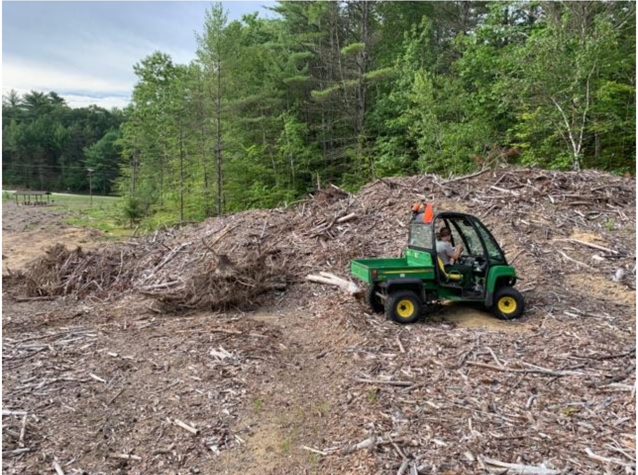
Informational Photo 4: Coleman Drive debris pile to be removed.