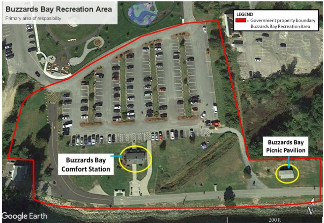
Figure 2. Cape Cod Canal Park Attendant Buzzards Bay Recreation Area of responsibility