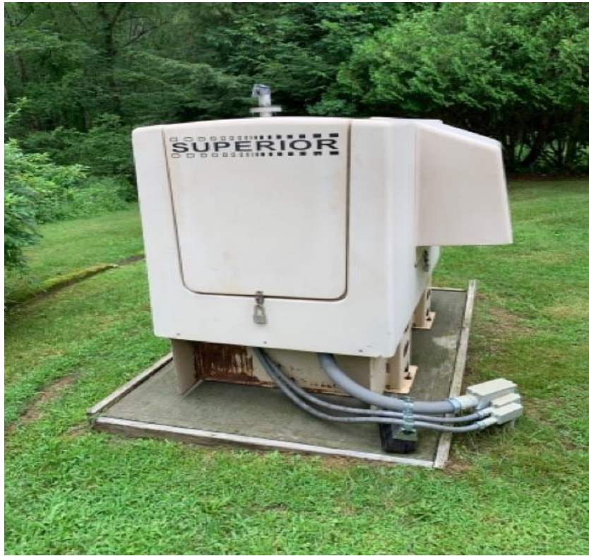
Information Photo #5