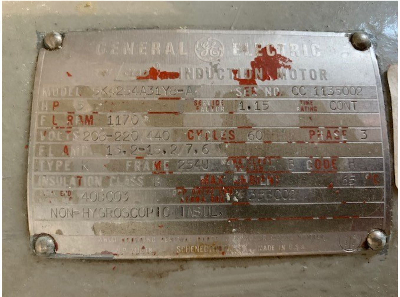
Informational Photo Number 2: General Electric Tri-Clad® Induction Motor #1 Data Plate