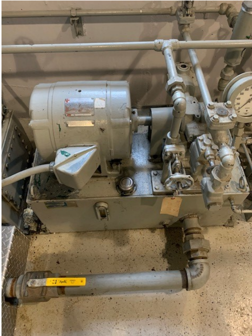
Informational Photo Number 1: General Electric Tri-Clad® Induction Motors