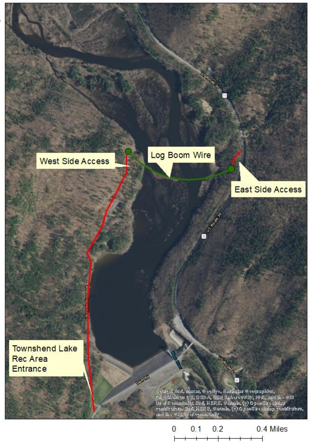
Informational Photo 7: Location of wire log boom and access points