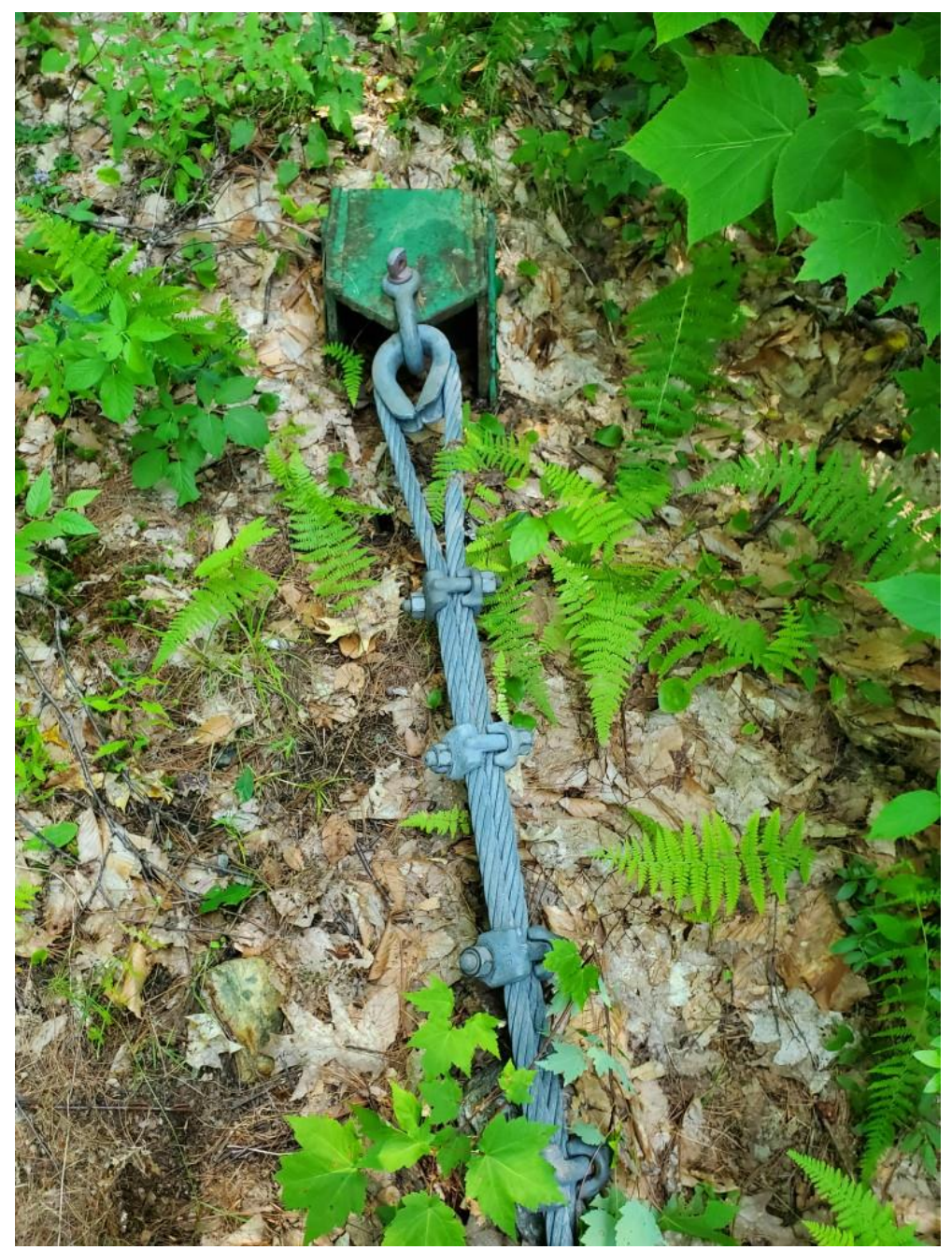
Informational Photos 1: East shore log boom anchor