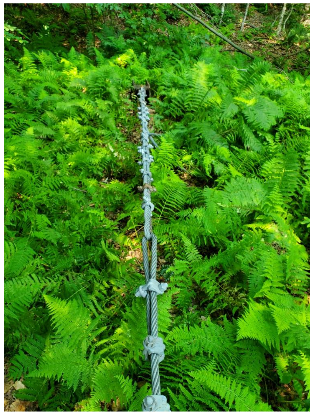
Informational Photos 4: West Shore log boom wire connection