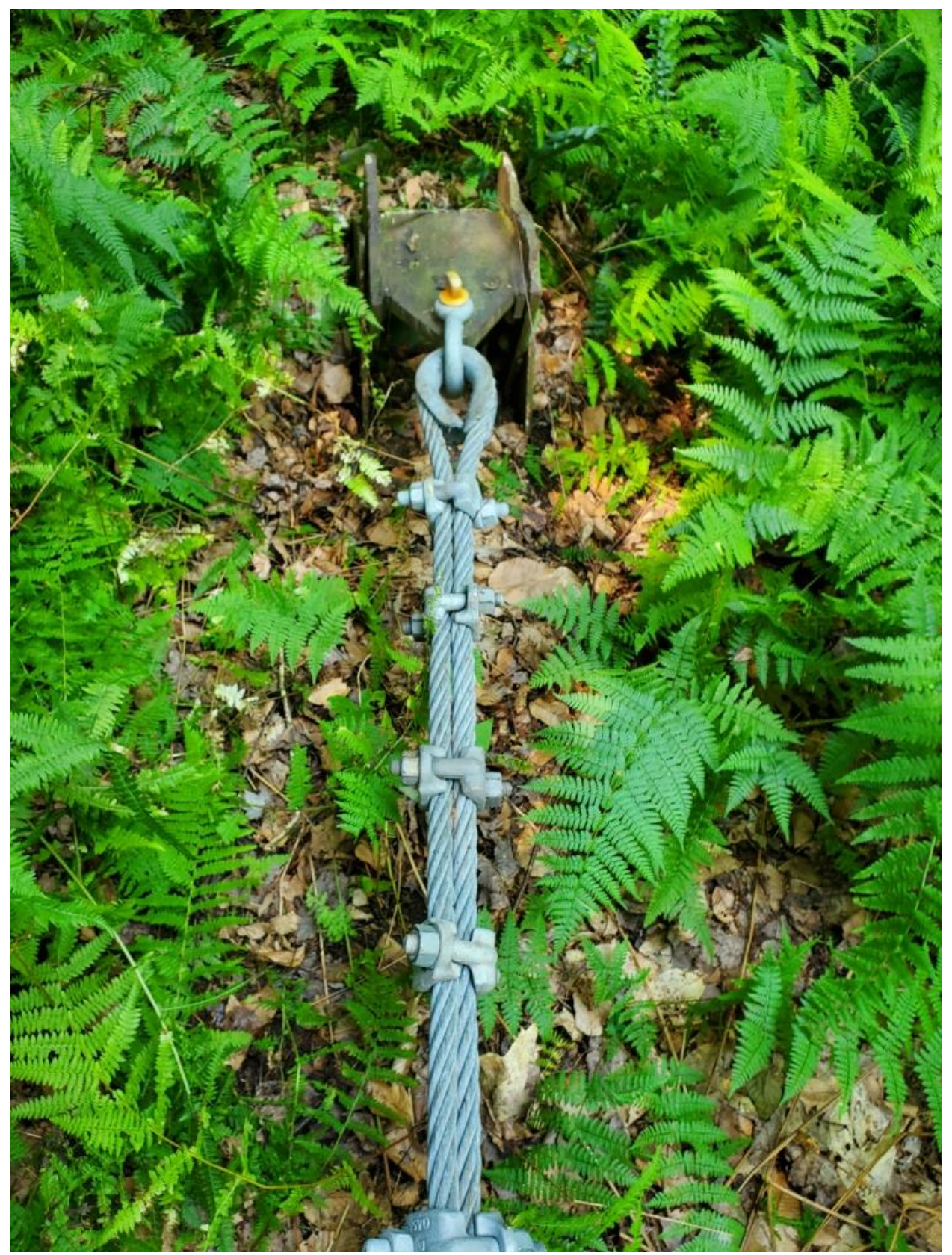
Informational Photos 3: West Shore log boom anchor