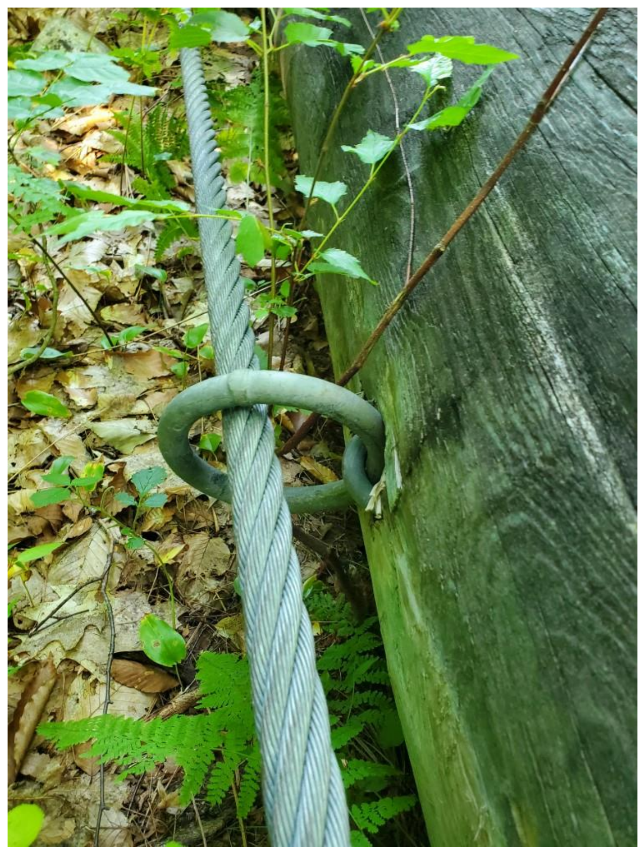
Informational Photos 5: Log boom ring connected at log