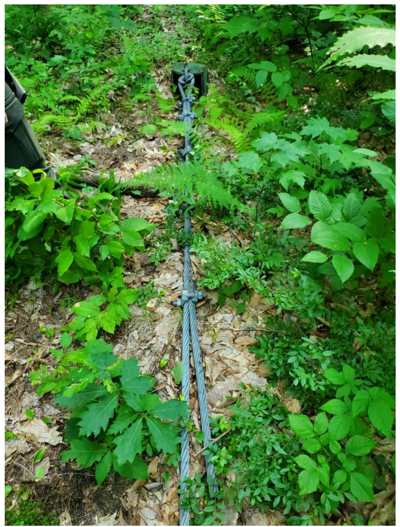
Informational Photos 2: East Shore log boom anchor wide view