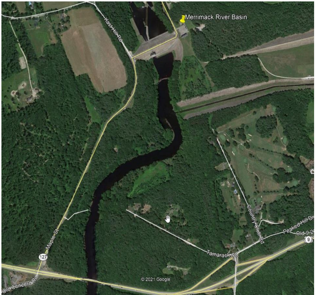
Exhibit A: Location Map