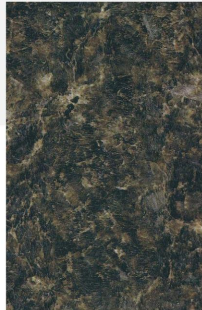
Exhibit C: Cabinet and Countertop Specifications.